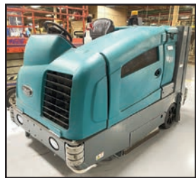
TENNANT FLOOR SCRUBBER