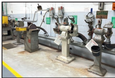
VIEW OF PEDESTAL GRINDERS