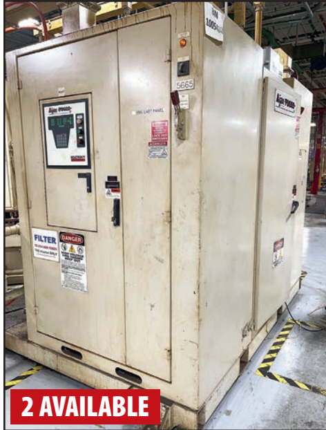
AJAX TOCCO INDUCTION PT INDUCTION HEATING SYSTEMS