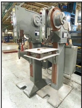
VIEW OF NATIONAL RIVET & MFG. RIVETERS