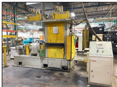
DAHLSTROM 1226 SPECIAL ROLL STAND