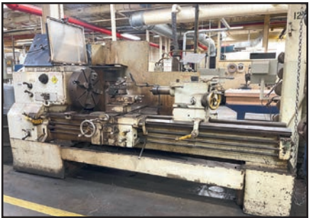
LEBLOND REGAL 26" X 72" LATHE

NATIONAL RIVET & MFG. CO. 1200 RIVET MACHINE , s/n 408