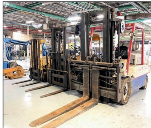
VIEW OF FORKLIFTS