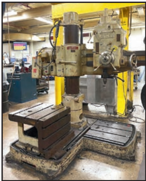
CINCINNATI GILBERT 4' X 10" RADIAL ARM DRILL