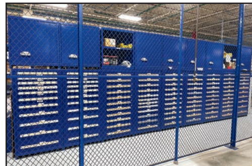
STANLEY VIDMAR MODULAR TOOL CABINETS