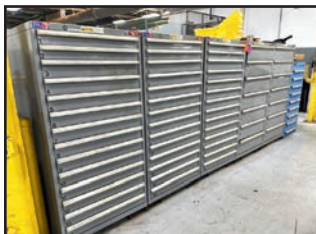
STOR-LOC MODULAR TOOL CABINETS