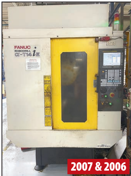
(1 OF 2) FANUC \alpha -T14IE ROBODRILL CNC DRILL/TAP CENTERS