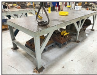
STEEL WORK TABLES