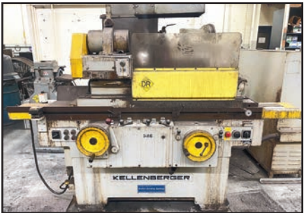
KELLENBERGER 600U UNIVERSAL CYLINDRICAL GRINDER