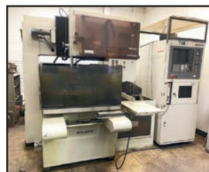
MITSUBISHI DWC-110 EDM