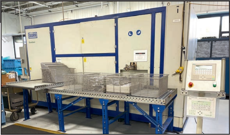
DURR UNIVERSAL 81W GRINDER