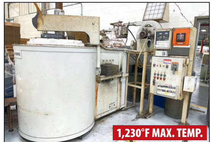
LINDBERG 2828G12 TEMPERING FURNACE