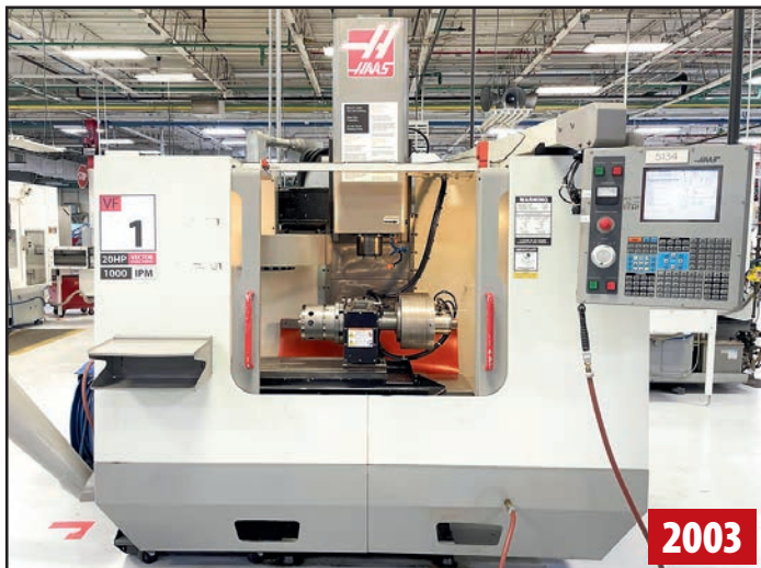
HAAS VF-1D VERTICAL MACHINING CENTER