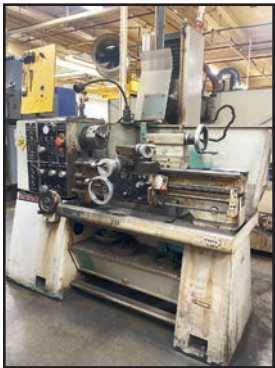
HARRISON VSP 13" X 20" LATHE