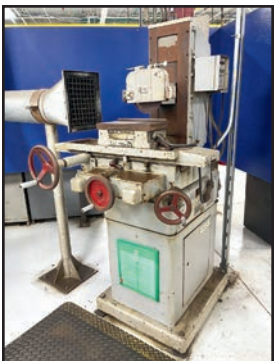
COVEL 7B SURFACE GRINDER