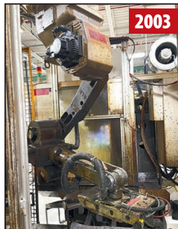
(1 OF 2) YASKAWA MOTOMAN YR-UP20 ROBOTS