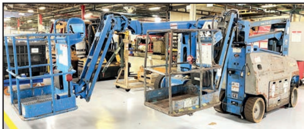
GENIE Z-20/8 BOOM LIFT

Monday, November 15, Strictly by Appointment Only