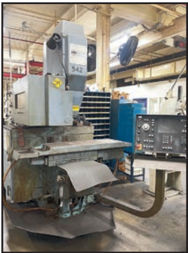
(1 OF 2) HURCO CNC VERTICAL MILLS