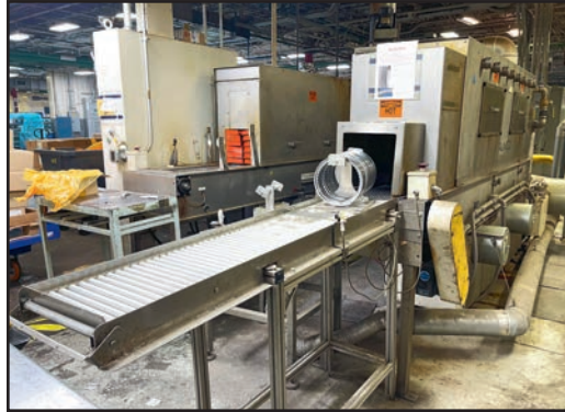
ALMCO POR12-60E-U WASH SYSTEM