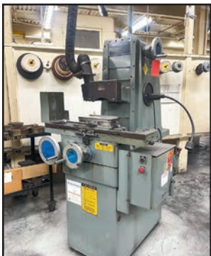
BROWN & SHARPE 6" X 12" SURFACE GRINDER