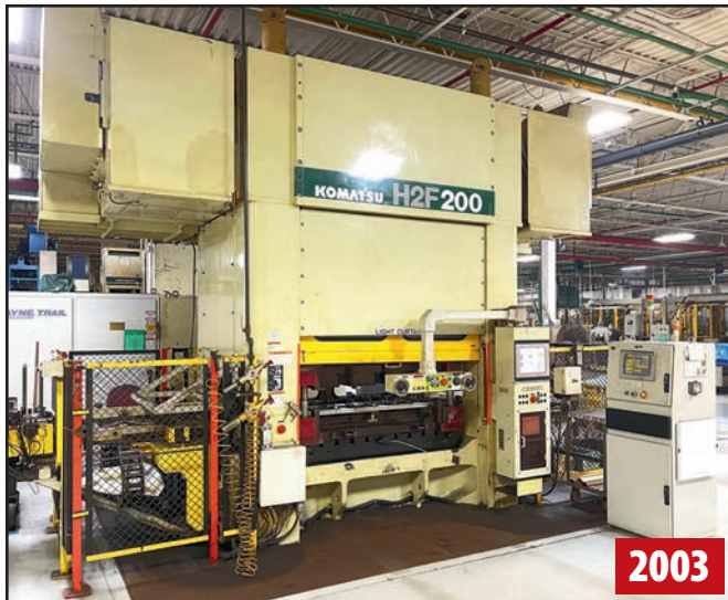
KOMATSU H2F200 STRAIGHT SIDE PRESS