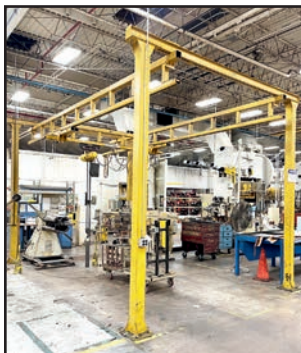
FREE STANDING BRIDGE CRANE