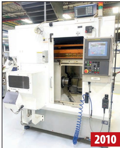
(1 OF 3) FUJI ANS-31P TURNING CENTERS