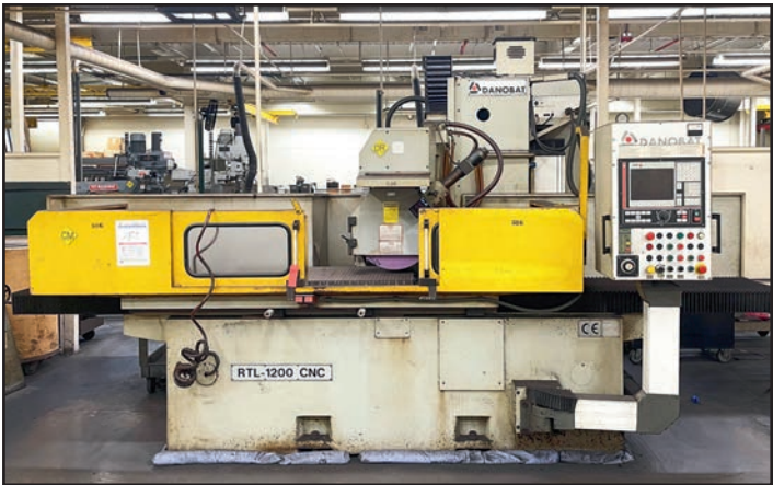
DANOBAT RTL-1200 CNC SURFACE GRINDER