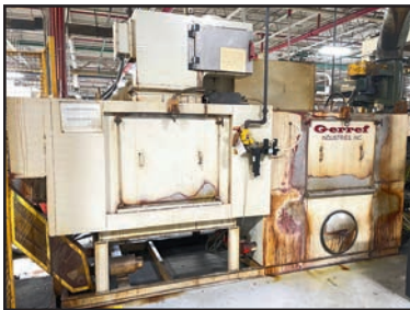
GERREF FINAL WASHER