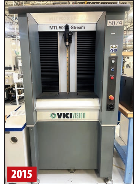
VICI VISION MTL 500 OPTICAL MEASURING MACHINE

BROWN & SHARPE VALIDATOR CMM, s/n 580-701-1029