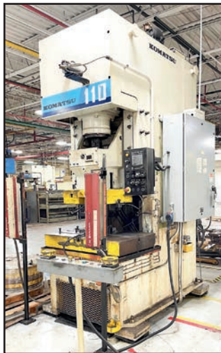
(1 OF 4) KOMATSU OBS-110-3 GAP FRAME PRESSES

Pre-Auction Offers Invited on Major Assets