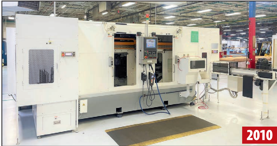
(1 OF 2) FUJI ANW-30T2 TWIN SPINDLE TURNING CENTERS