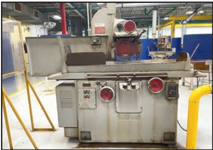
THOMPSON 8" X 24" SURFACE GRINDER