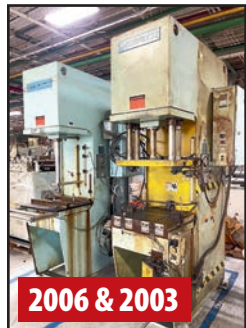
MULTIPRESS FMS-20 HYDRAULIC C-FRAME PRESSES