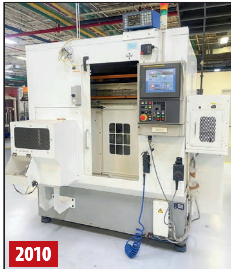
(1 OF 3) FUJI ANS-31P TURNING CENTERS