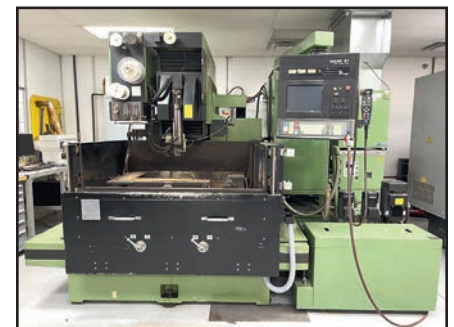
SODICK MARK 21 FS-750 EDM