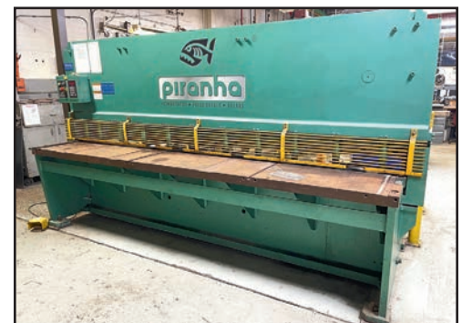
PIRANHA 1/4" X 10' SHEAR