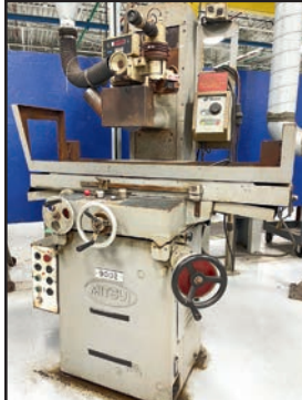
MITSUI MSG-250H-1AH SURFACE GRINDER