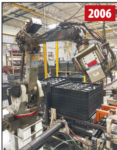
YASKAWA MOTOMAN YR-SK16-J02 ROBOT

Pre-Auction Offers Invited on Major Assets