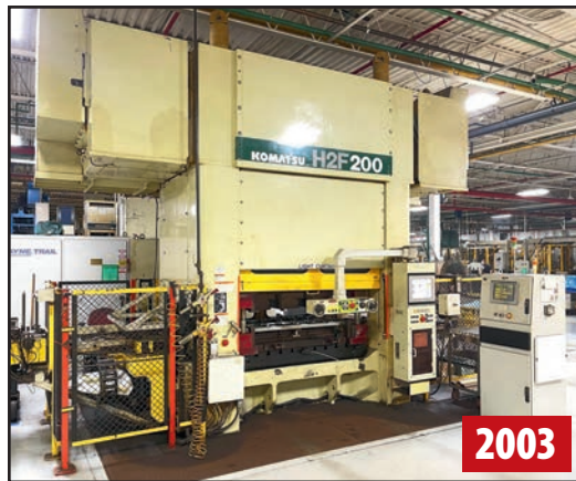
KOMATSU H2F200 STRAIGHT SIDE PRESS