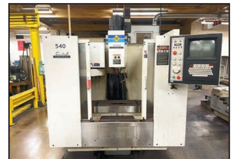
FADAL VMC15 VERTICAL MACHINING CENTER