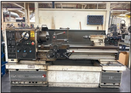
CLAUSING COLCHESTER 15" X 48" LATHE