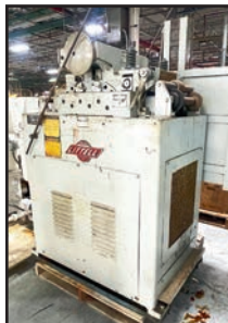
LITTELL NO. 412-5 CONTINUOUS STRAIGHTENER