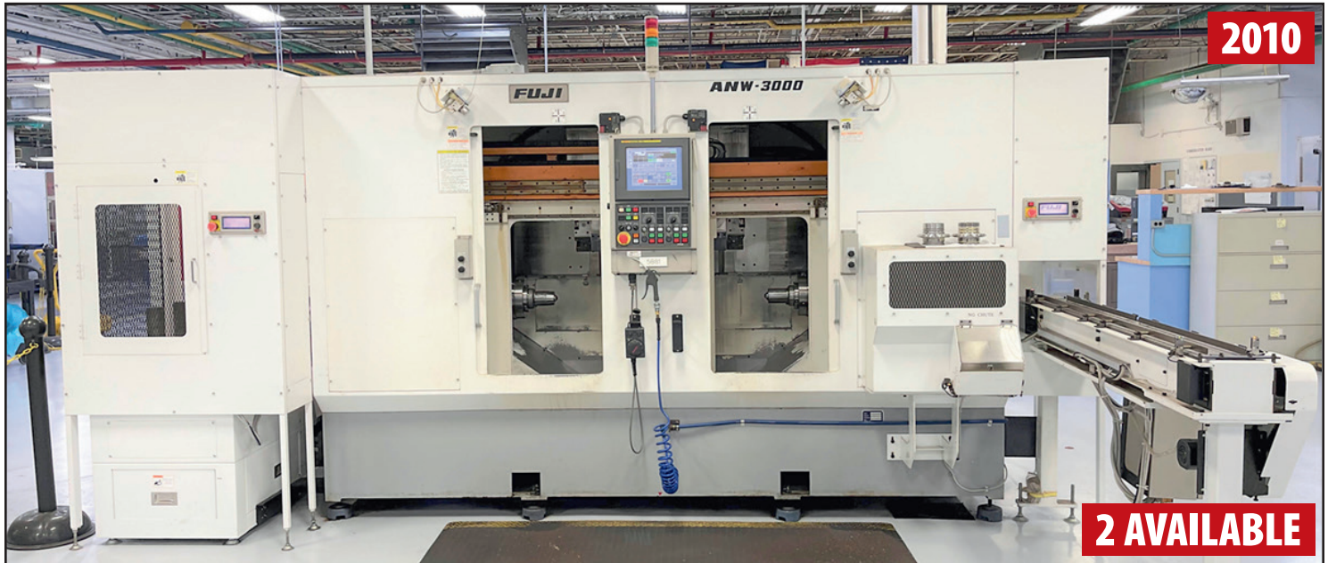
FUJI ANW-30T2 TWIN SPINDLE TURNING CENTER

FEATURING 400 LOTS: FUJI Turning Centers, FANUC Robodrill, HAAS VF-1 Vertical Machining Center, SODICK EDM, KOMATSU & LAUFFER Stamping Presses, Coil Equipment, AJAX Washing & Finishing Equipment, TRUMPF Laser Welding Cell, Compressors, Tool Room Equipment, Inspection Equipment, Rolling Stock, Plant Support, & More