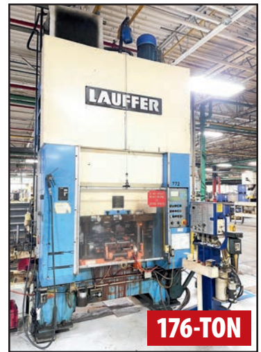
LAUFFER RPS160 STRAIGHT SIDE PRESS