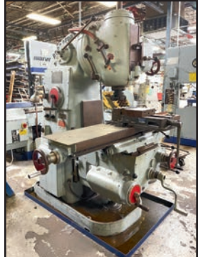
ROSENFORS RFV-M HORIZONTAL MILL