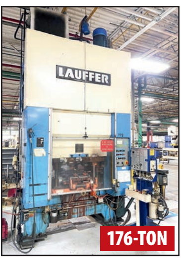
LAUFFER RPS160 STRAIGHT SIDE PRESS