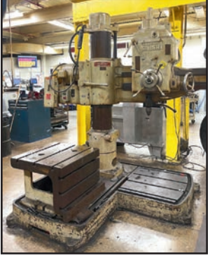
CINCINNATI GILBERT 4' X 10" RADIAL ARM DRILL