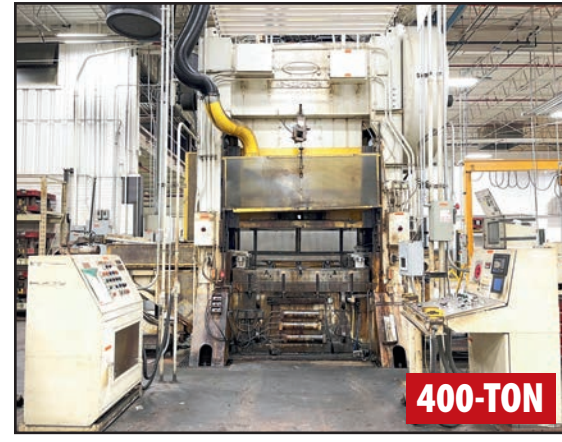
DANLY H2-400-72X42 STRAIGHT SIDE PRESS