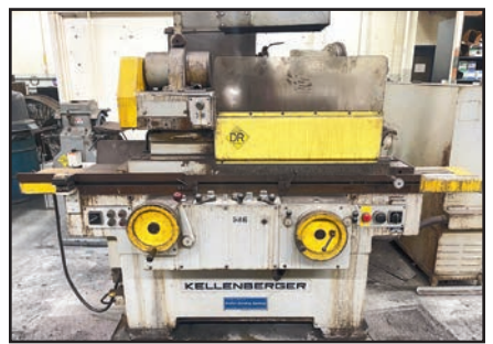
KELLENBERGER 600U UNIVERSAL CYLINDRICAL GRINDER