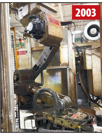
(1 OF 2) YASKAWA MOTOMAN YR-UP20 ROBOTS