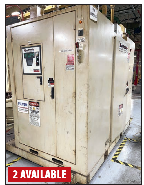
AJAX TOCCO INDUCTRON PT INDUCTION HEATING SYSTEMS