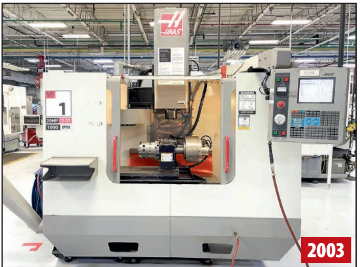
HAAS VF-1D VERTICAL MACHINING CENTER