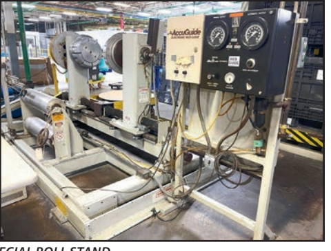
DAHLSTROM 1226 SPECIAL ROLL STAND