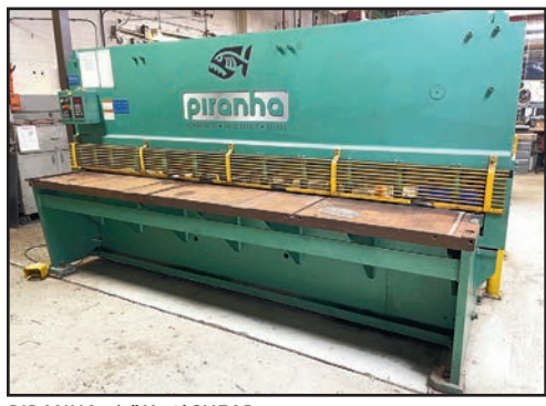
PIRANHA 1/4" X 10' SHEAR

PIRANHA 1/4" X 10' SHEAR, s/n M 1/4-101136