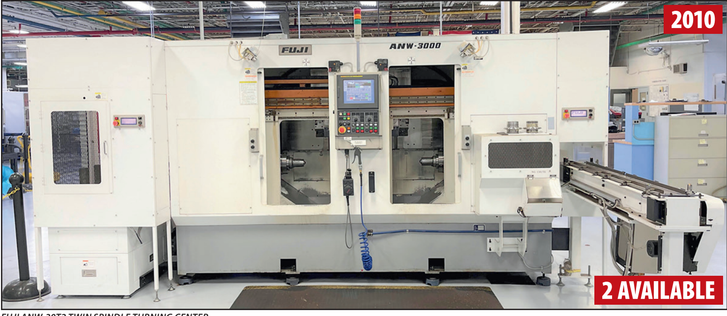
FUJI ANW-30T2 TWIN SPINDLE TURNING CENTER

FEATURING 400 LOTS: FUJI Turning Centers, FANUC Robodrill, HAAS VF-1 Vertical Machining Center, SODICK EDM, KOMATSU & LAUFFER Stamping Presses, Coil Equipment, AJAX Washing & Finishing Equipment, TRUMPF Laser Welding Cell, Compressors, Tool Room Equipment, Inspection Equipment, Rolling Stock, Plant Support, & More