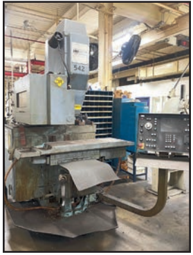
(1 OF 2) HURCO CNC VERTICAL MILLS