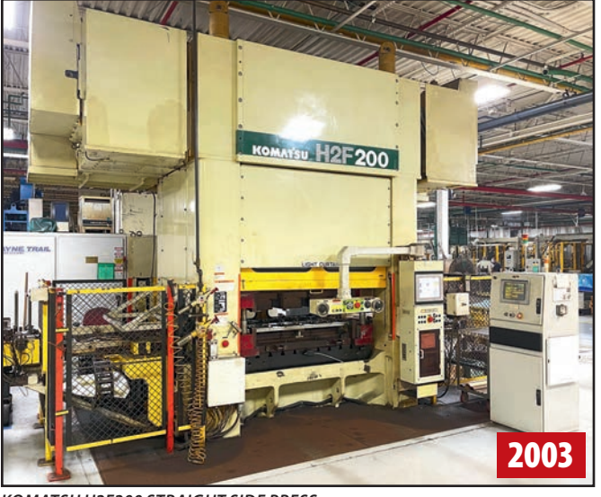
KOMATSU H2F200 STRAIGHT SIDE PRESS

COMPLETE CATALOG & INFORMATION: https://perfection.global/borgwarner