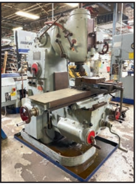
ROSENFORS RFV-M HORIZONTAL MILL