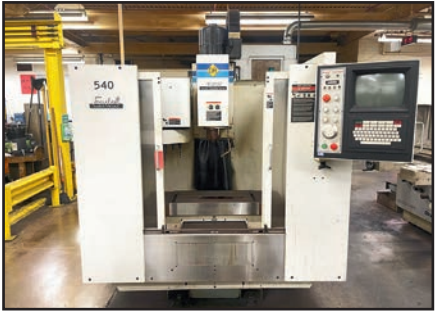
FADAL VMC15 VERTICAL MACHINING CENTER