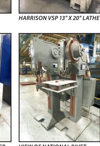
VIEW OF NATIONAL RIVET & MFG. RIVETERS