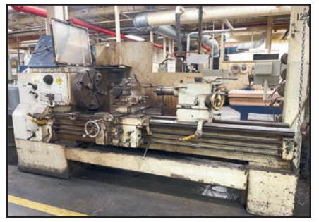
LEBLOND REGAL 26" X 72" LATHE