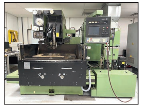
SODICK MARK 21 FS-750 EDM

View our current auction schedule at www.perfectionindustrial.com