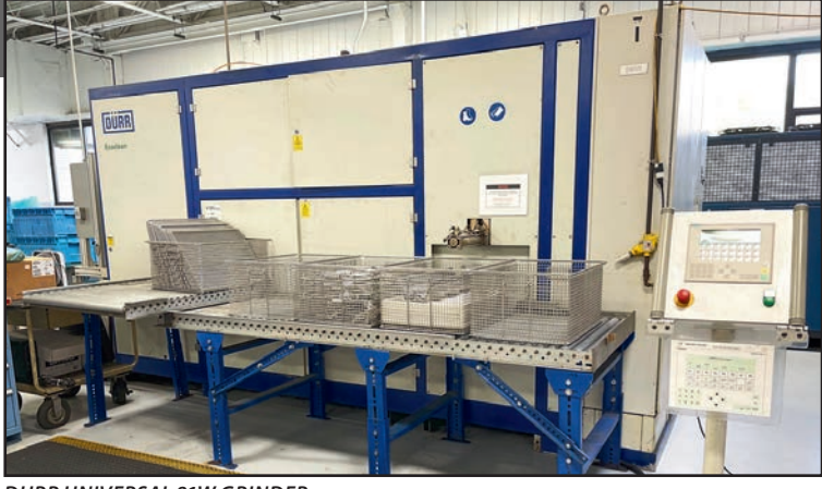
DURR UNIVERSAL 81W GRINDER