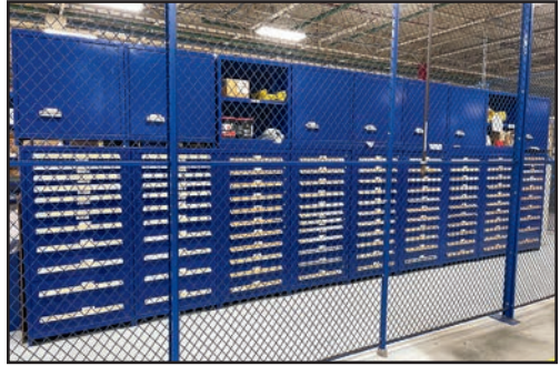
STANLEY VIDMAR MODULAR TOOL CABINETS