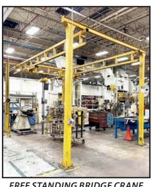
FREE STANDING BRIDGE CRANE