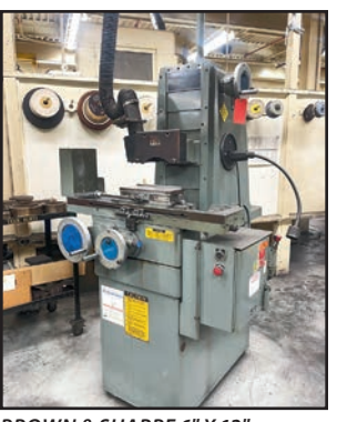
BROWN & SHARPE 6" X 12" SURFACE GRINDER