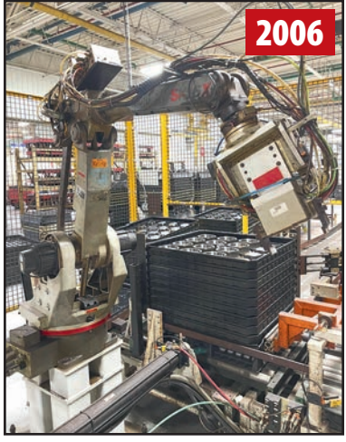
YASKAWA MOTOMAN YR-SK16-J02 ROBOT

2015 VICI VISION MTL 500 OPTICAL MEASURING MACHINE, s/n PFX58915 WERTH OPTICAL MEASURING MACHINE BROWN & SHARPE VALIDATOR CMM, s/n 580-701-1029