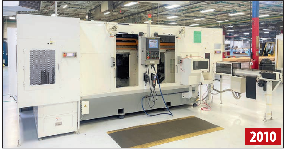
(1 OF 2) FUJI ANW-30T2 TWIN SPINDLE TURNING CENTERS