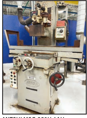
MITSUI MSG-250H-1AH SURFACE GRINDER

NATIONAL RIVET & MFG. CO. 1200 RIVET MACHINE, s/n 408