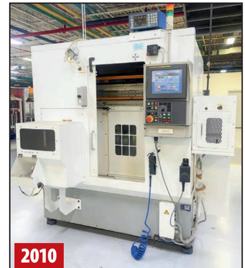
(1 OF 3) FUJI ANS-31P TURNING CENTERS Bidding Available Through BidSpotter

COMPLETE CATALOG & INFORMATION: https://perfection.global/borgwarner