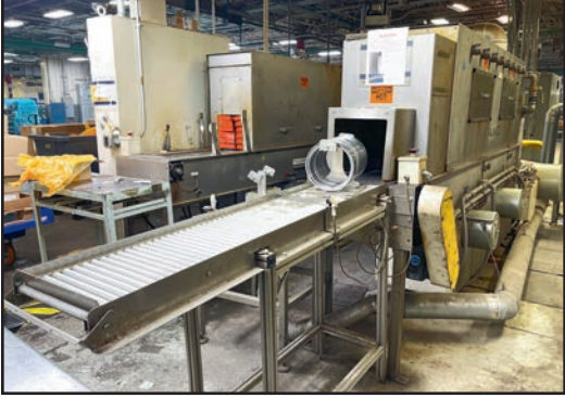
ALMCO POR12-60E-U WASH SYSTEM

Pre-Auction Offers Invited on Major Assets