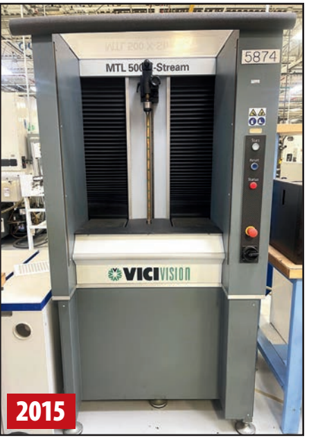
VICI VISION MTL 500 OPTICAL MEASURING MACHINE

LINDBERG 2828G12 TEMPERING FURNACE, s/n 9832, Gas, 1230° F Max. Temp