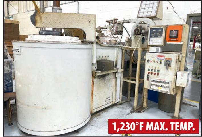
LINDBERG 2828G12 TEMPERING FURNACE

Complete Catalog & Information Available at https://perfection.global/borgwarner