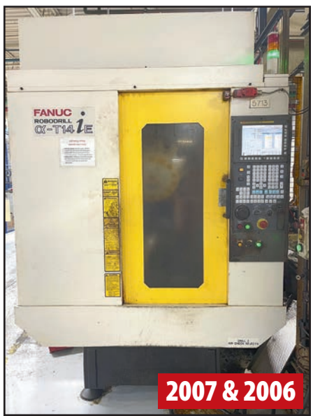
(1 OF 2) FANUC a-T14IE ROBODRILL CNC DRILL/TAP CENTERS