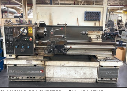
CLAUSING COLCHESTER 15" X 48" LATHE