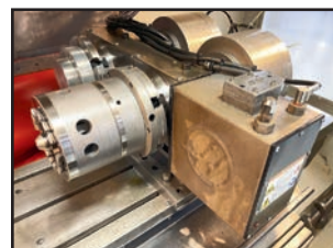
HAAS 4TH AXIS ROTARY TABLE