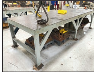
STEEL WORK TABLES