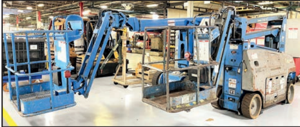
GENIE Z-20/8 BOOM LIFT

Monday, November 15, Strictly by Appointment Only