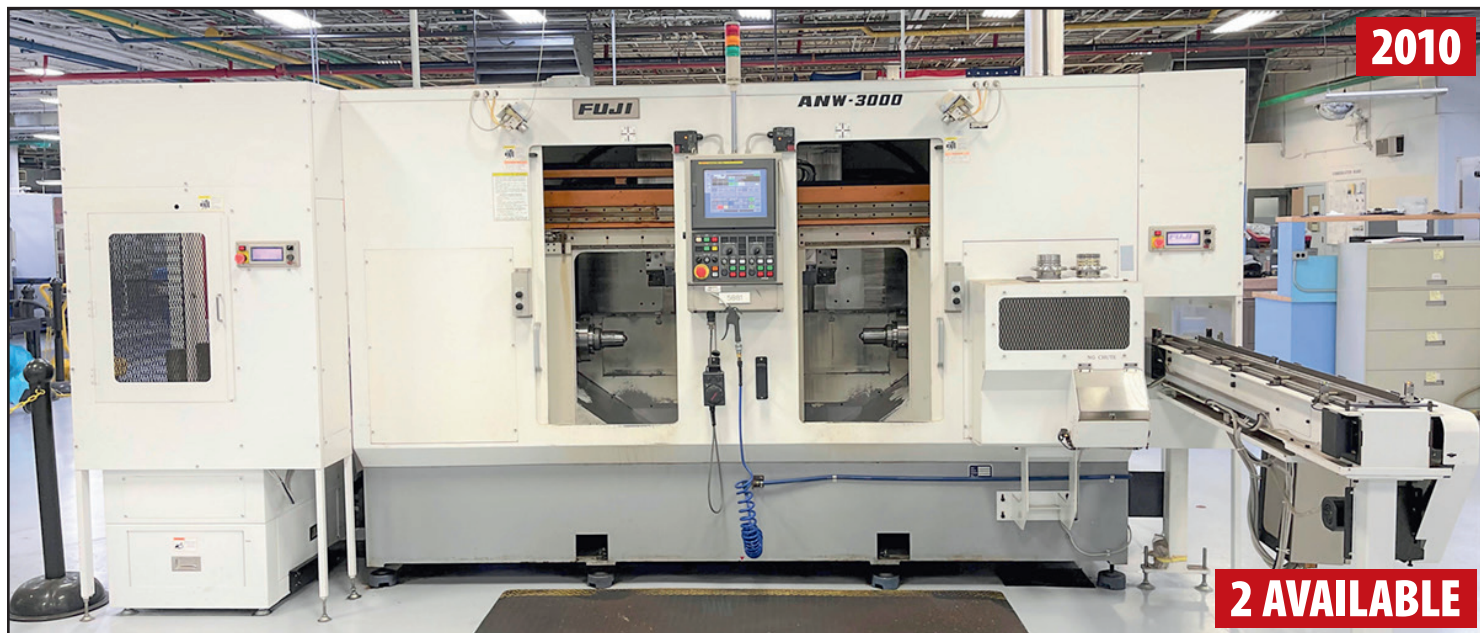
FUJI ANW-30T2 TWIN SPINDLE TURNING CENTER

FEATURING 400 LOTS: FUJI Turning Centers, FANUC Robodrill, HAAS VF-1 Vertical Machining Center, SODICK EDM, KOMATSU & LAUFFER Stamping Presses, Coil Equipment, AJAX Washing & Finishing Equipment, TRUMPF Laser Welding Cell, Compressors, Tool Room Equipment, Inspection Equipment, Rolling Stock, Plant Support, & More