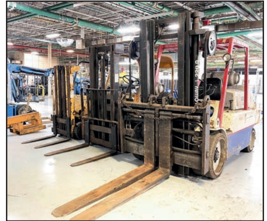
VIEW OF FORKLIFTS