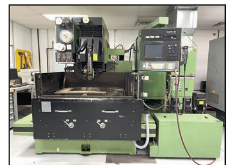
SODICK MARK 21 FS-750 EDM