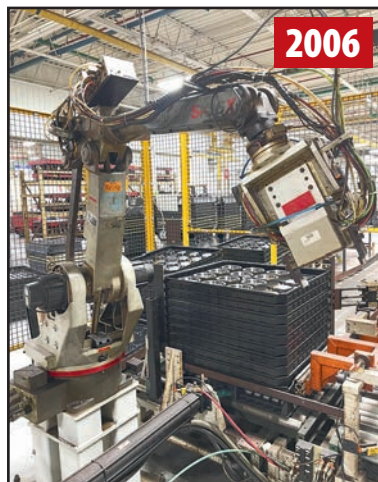
YASKAWA MOTOMAN YR-SK16-J02 ROBOT

Pre-Auction Offers Invited on Major Assets