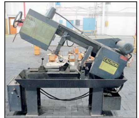
DOALL C-4 12" X 9" HORIZONTAL BANDSAW