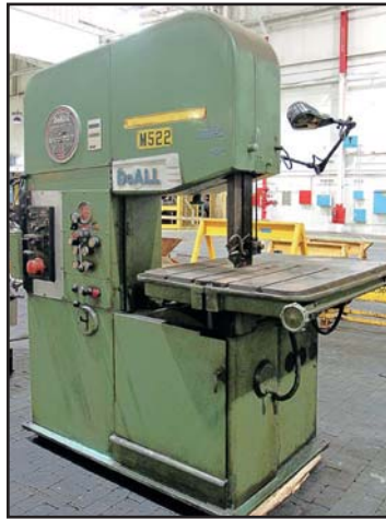
DOALL CONTOUR-MATIC 26 VERTICAL BANDSAW