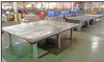
VIEW OF STEEL WELDING TABLES

Sale Closing From: Tuesday, July 12, 2016 at 11:00 AM CDT Location: 325 State Route 31, Montgomery, Illinois 60538 Inspection: Monday, July 11, from 9:00 AM to 4:00 PM CDT