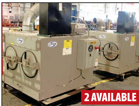
UNITED AIR SPECIALISTS SFC-2-1-DD DUST COLLECTION SYSTEMS