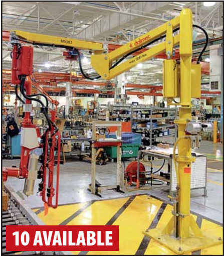
(10) DALMEC, GCI AND (6) SIGMA INDUSTRIAL MANIPULATORS