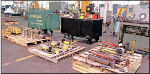
< HYDRAULIC JACKS AND PUMPS