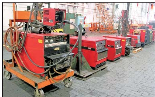
< VIEW OF WELDERS