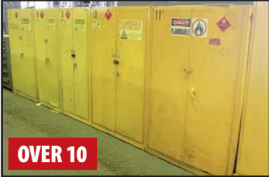
> FLAMMABLE LIQUIDS CABINETS