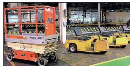
SCISSOR LIFT AND CUSHMAN CARTS