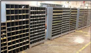
LARGE ASSORTMENT OF HARDWARE CUBBIES, FOREMAN'S DESKS, AND LOCKER