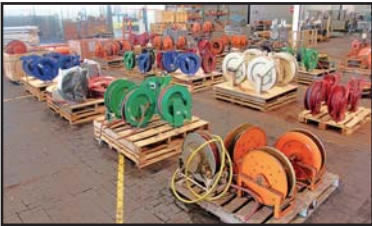
VIEW OF REELS