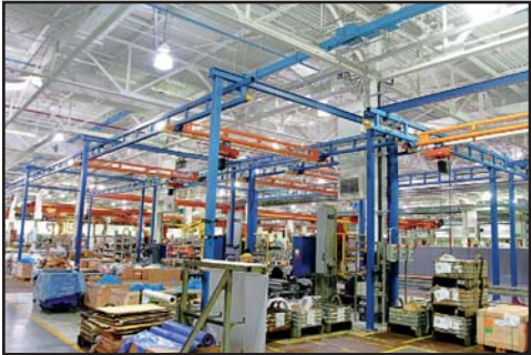
GORBEL FREE-STANDING CRANE SYSTEMS

Online Bidding at www.perfectionindustrial.com