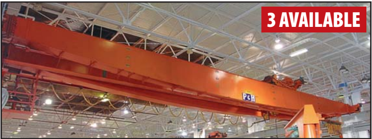
15-TON P & H DUAL-HOIST BRIDGE CRANE