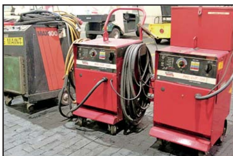
VIEW OF PLASMAS POWER SOURCES