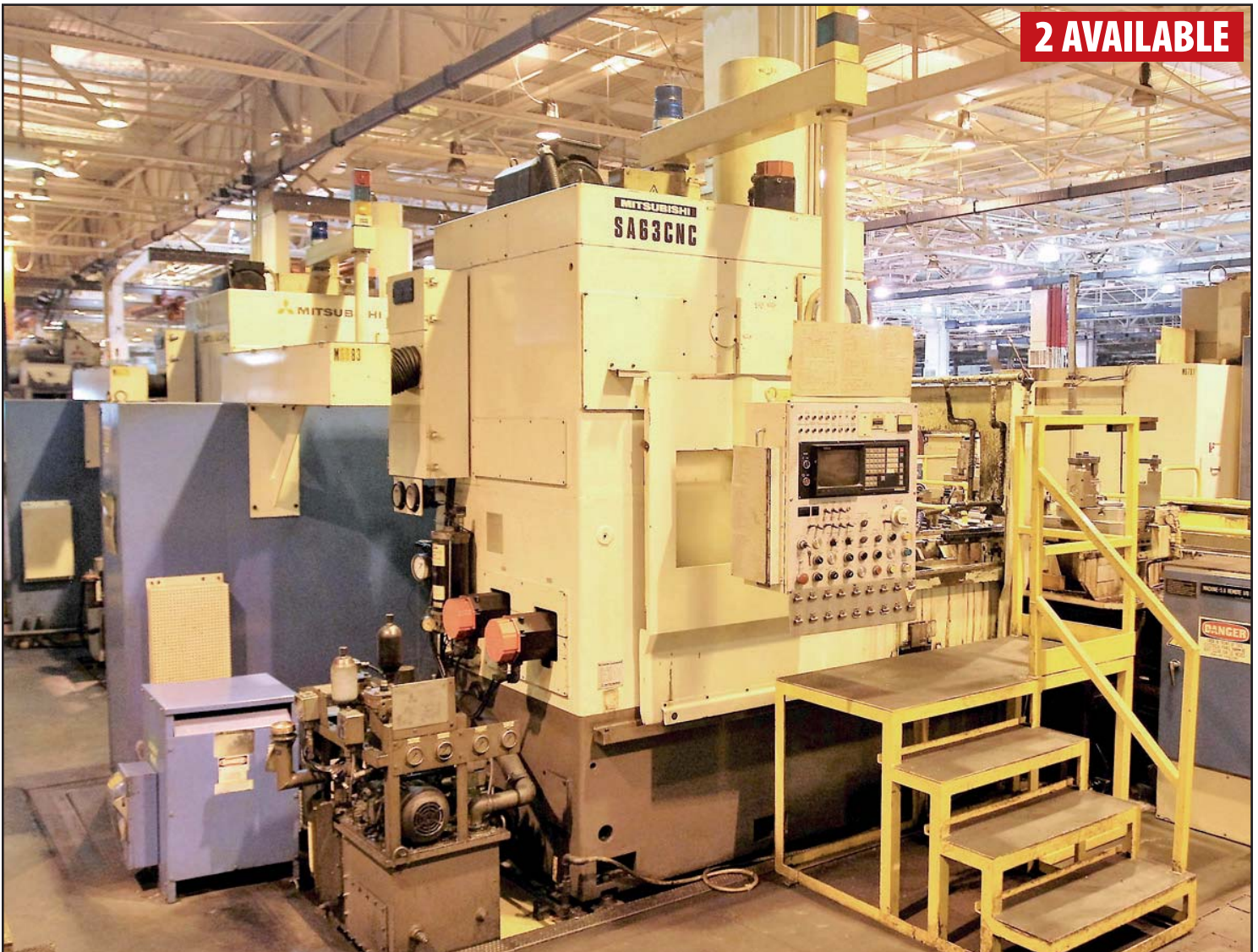
mitsubishi SA63 CNC GEAR SHAPERS

Sale Closing From: Tuesday, July 12, 2016 at 11:00 AM CDT