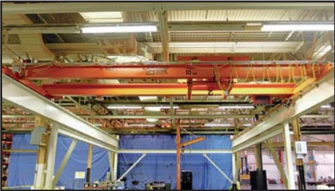
(OVER 50) MULTI-BRIDGE OVERHEAD CRANES