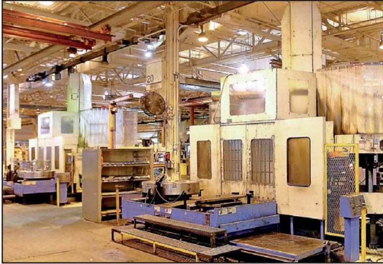
(2) MAZAK MEGATURN A12N MILLICENTER VERTICAL TURNING LATHES

Featuring: CNC Gear Shapers & Machine Tools, Fabrication, Tool Room, Welding, Rolling Stock, Bridge & Jib Cranes & Much More