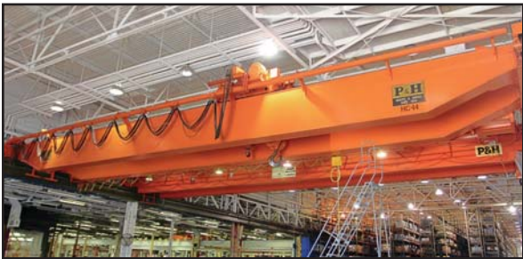
10-TON P & H BRIDGE CRANE