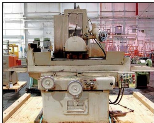
GALLMEYER & LIVINGSTONE 550 SURFACE GRINDER

ALSO AVAILABLE: CLUB CART GOLF CARTS, CUSHMAN UTILITY CARTS AND MORE