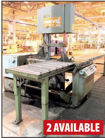
MARVEL SERIES 81 VERTICAL BANDSAWS