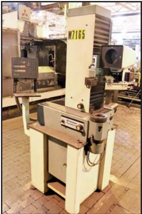
TSD MICROBORE EGS2550-001 TOOL PRESETTER

88-TON TOYOKOKI APB-8030W 6-AXIS CNC PRESS BRAKE , s/n 1179, 98.4" Bending Length, 11.4" Open Height, 5.9" Stroke Height, 9.8" Frame Gap, 6-Axis TNC-ACII CNC Control, 4-Axis Backgauge (Location: Torreon, MX)