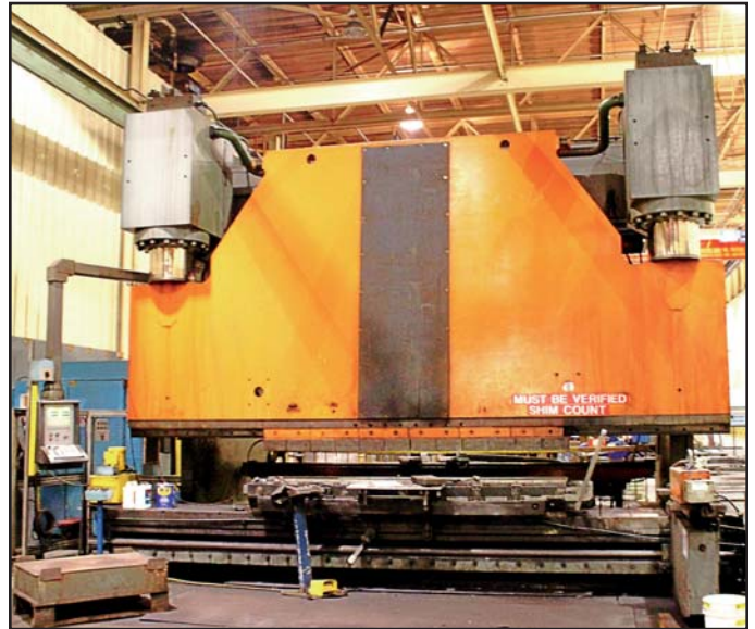
LVD BH20 1,100-TON CNC HYDRAULIC BRAKE