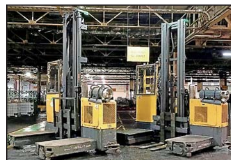
VIEW OF COMBILIFTS