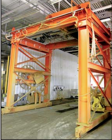
< 20-TON ILLINOIS GANTRY-TYPE BRIDGE CRANE