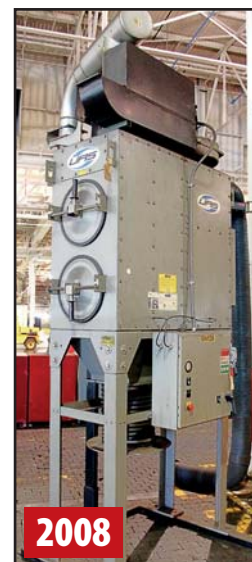
UNITED AIR SPECIALISTS SFC2-2 DUST COLLECTION SYSTEM