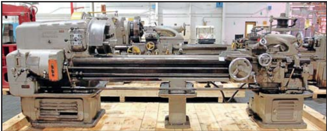
AMERICAN PACEMAKER 16" X 78" ENGINE LATHE