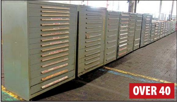
BALL BEARING TOOL CABINETS

ALSO AVAILABLE: (OVER 40) VIDMAR/LISTA BALL BEARING TOOL CABINETS, LARGE ASSORTMENT OF HAND TOOLS, PNEUMATIC TOOLS, ROLLING STOCK CARTS, WORK TABLES AND BENCHES, FILE CABINETS, A/V EQUIPMENT, AIR, HOSE AND GAS REELS, SHOP FANS, LOCKERS, AND MUCH MORE