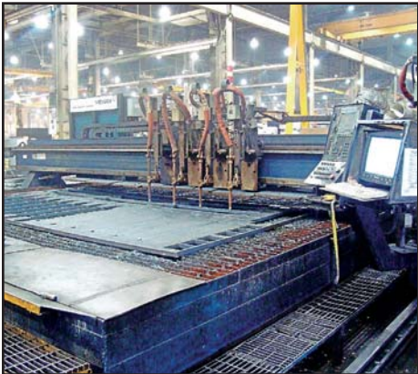
MESSER TMC-4522 CNC FLAME CUTTING SYSTEM

MOTCH 219D CNC LATHE , s/n VT-2939791, 18" Chuck, 25" Max. Swing, 2,800 RPM, A2-11 Spindle, 50 HP, Fanuc 5T CNC Control