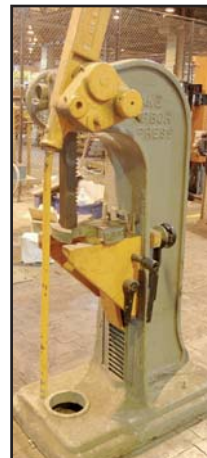
DAKE #4 ARBOR PRESS