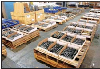
VIEW OF TOOLING