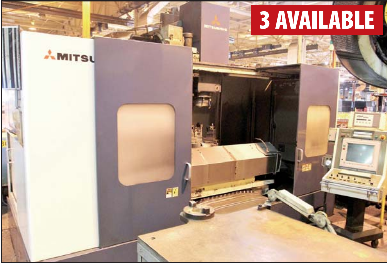
MITSUBISHI M-V60C CNC VERTICAL MACHINING CENTERS