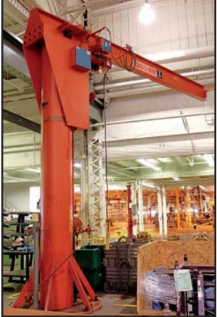
> (OVER 100) JIB CRANES

View our current auction schedule at www.perfectionindustrial.com