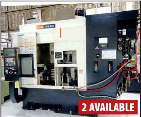
MAZAK IVS-200 CNC VERTICAL LATHE