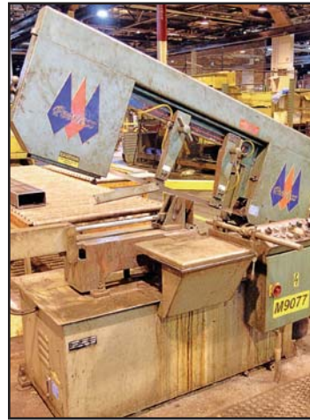
PEERLESS CHAMP-13SAII HORIZONTAL BANDSAW