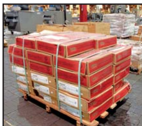
> VIEW OF WELDING WIRE