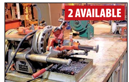
RIDGID 300 PIPE THREADERS

To discuss your requirements for an auction, please call Perfection Industrial 847-545-6374