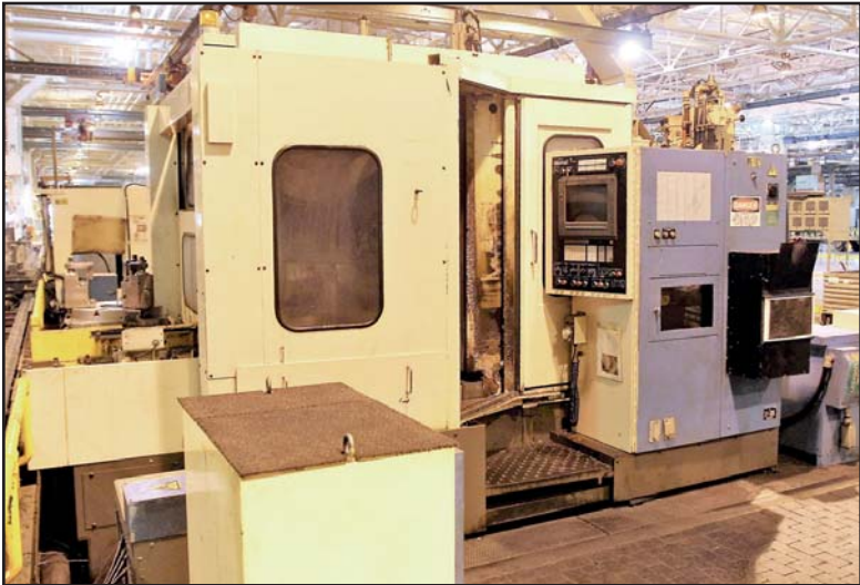
MITSUBISHI H-50C CNC HORIZONTAL MACHINING CENTER