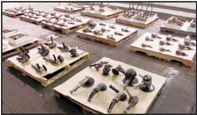
VIEW OF AIR TOOLS

Online Bidding at www.perfectionindustrial.com