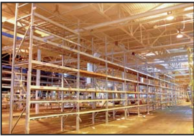
ASSORTED SIZES OF PALLET RACKING