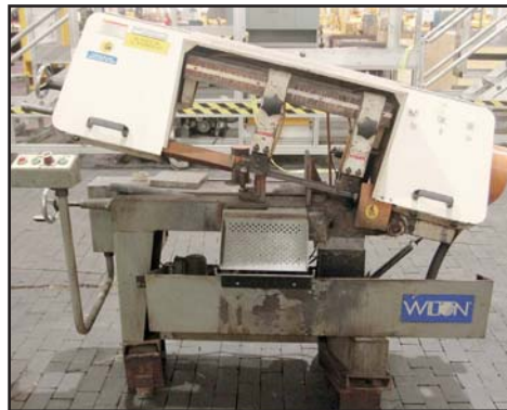
WILTON 7020 10" X 16" HORIZONTAL BANDSAW