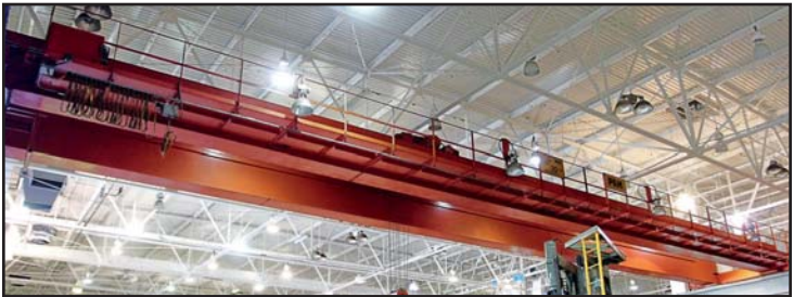
20-TON P & H BRIDGE CRANE