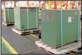
VIEW OF TRANSFORMERS

MANIPULATORS & LIFTING MAGNETS (OVER 10) DALMEC, GCI AND (6) SIGMA INDUSTRIAL MANIPULATORS