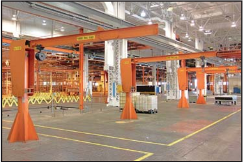
(OVER 100) JIB CRANES