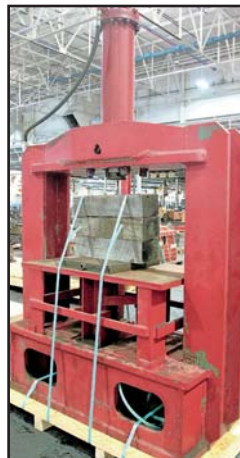
H-FRAME SHOP PRESS