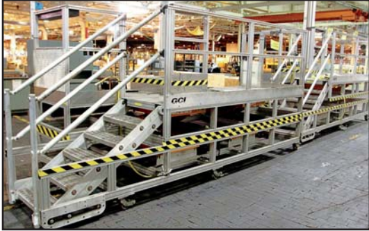
GCI WORK PLATFORMS