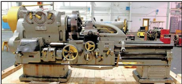
AMERICAN 27" X 42" ENGINE LATHE