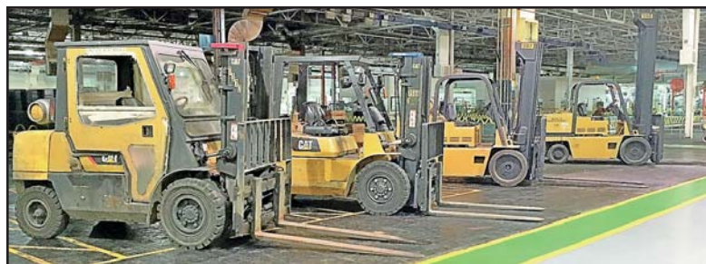
CATERPILLAR LP FORKLIFTS