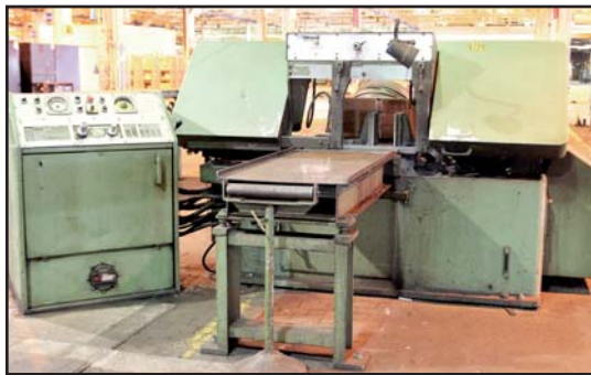
MARVEL 15A4/M1/S 15" X 24" HORIZONTAL BANDSAW