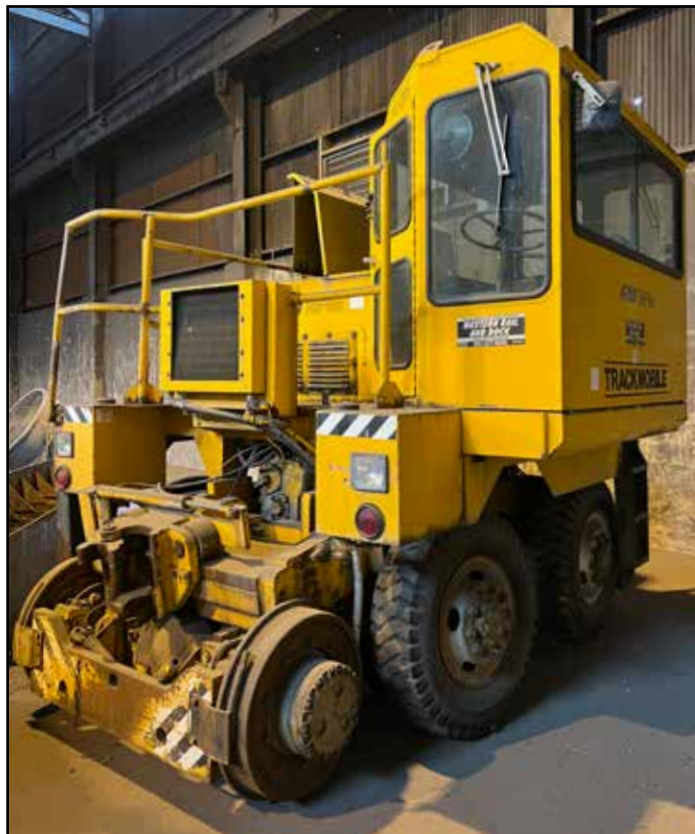
TRACKMOBILE 4200 TURBO RAIL CAR MOVER

COTTERMAN MAXI-LIFT MAN LIFT , s/n YOO322