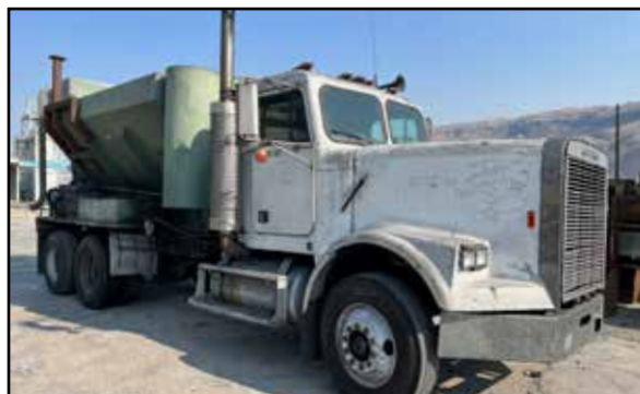
FREIGHTLINER AGGREGATE MIXER TRUCK

ALSO: FREIGHTLINER Aggregate Mixer Truck, (10) TAYLOR DUNN Utility Vehicles, TENNANT Floor Sweepers, (2) FAIRBANKS 12-8710-S Floor Scales, 30 Ton Capacity, (2) Mobile Diesel Hydraulic Systems, KNAACK Job Boxes, LINCOLN & MILLER Welder/Generators, MILLER, L-TEC , and LINCOLN Welders, Power Tools, Air Tools, Hand Tools, Pipe Threaders, STRONGHOLD Cabinets, Flammable Liquids Cabinets, Self-Dumping Hoppers, Huge Quantity of KALA Alumina Bake Brick, and Much More