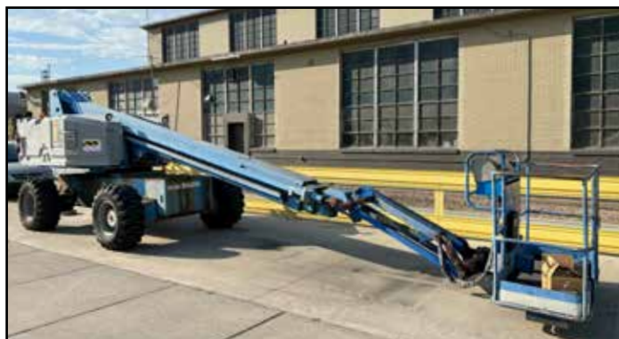
GENIE S-65 TELESCOPING BOOM LIFT