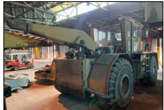
ROYAL A-20-E CRUCIBLE HAULER