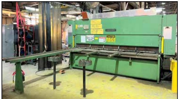
CINCINNATI CENTURY 4H10 SHEAR