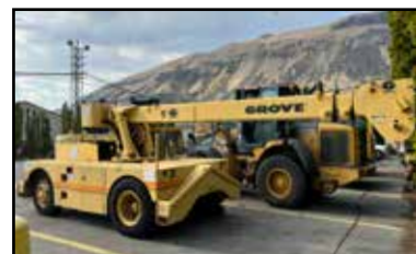
GROVE IND-36 CARRY-DECK CRANE