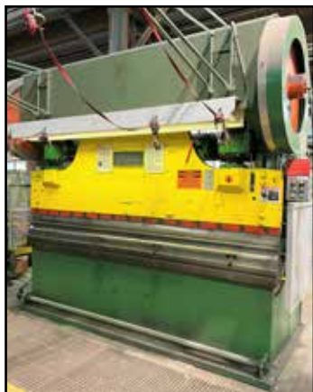
STEELWELD H3-1/2-8 PRESS BRAKE