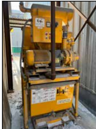
HI-VAC 310 PORTABLE INDUSTRIAL VACUUM SYSTEM