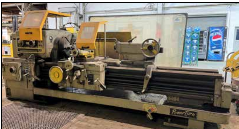
LODGE & SHIPLEY POWERTURN 2516 LATHE