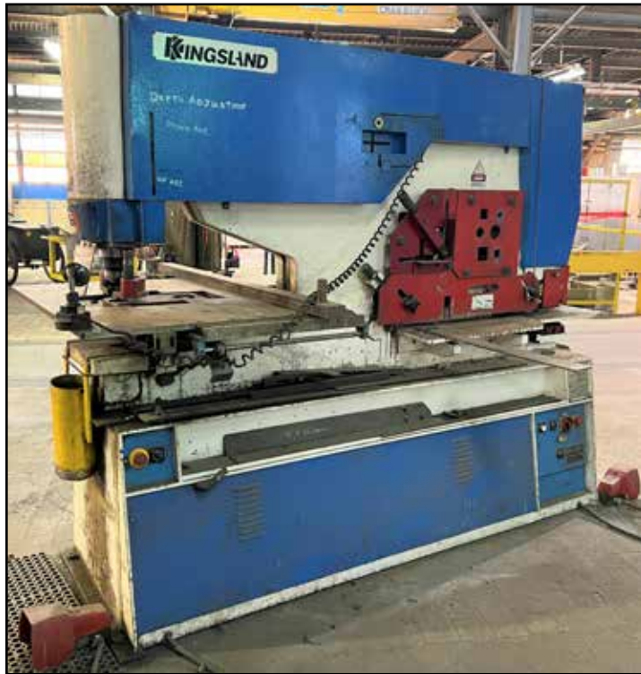
KINGSLAND 125XSD HYDRAULIC IRONWORKER