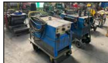
VIEW OF WELDERS