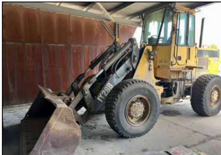
CATERPILLAR IT28B WHEEL LOADER