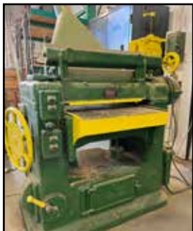
OLIVER 299-D PLANER