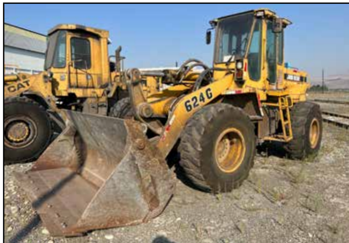
JOHN DEERE 624G WHEEL LOADER