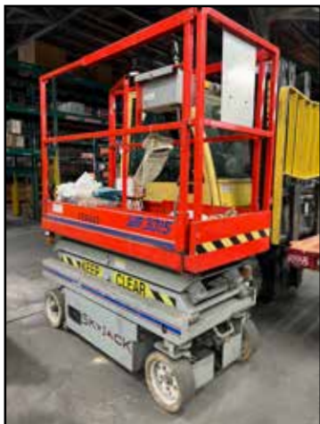
SKYJACK SJM 3015 SCISSOR LIFT