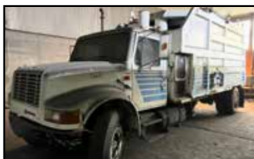
INTERNATIONAL 4900 4X2 FAST-VAC INDUSTRIAL VACUUM TRUCK