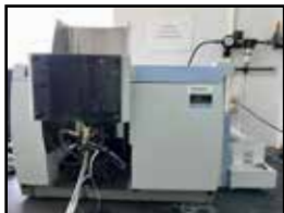
PERKIN ELMER ANALYST 400 ATOMIC SPECTROMETER