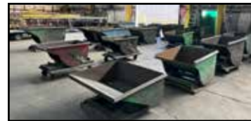
SELF DUMPING HOPPERS