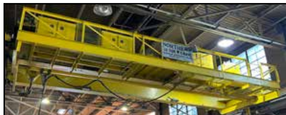
NORTHERN 10-TON DOUBLE GIRDER BRIDGE CRANE