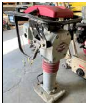
STONE XH670 STOMPER COMPACTOR