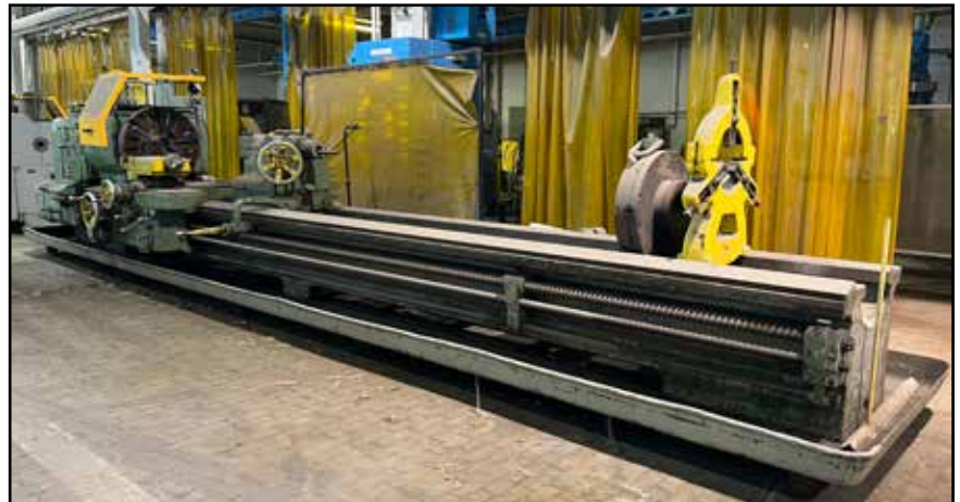
LEBLOND 32" X 180" LATHE