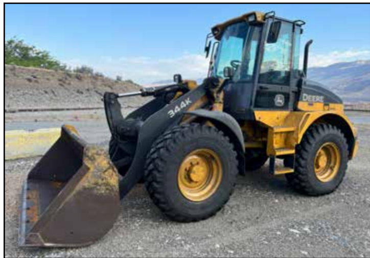
JOHN DEERE 344K WHEEL LOADER