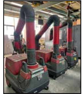
LINCOLN FUME EXTRACTORS