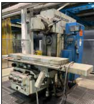
WMW HECKERT FW450X180 APUG MILLING MACHINE