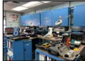
METER & TESTING ROOM