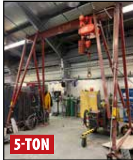
5-TON WALLACE 5T19-15AC ROLLING GANTRY

Meter and Testing Room w/ Ohmmeters, Tachometers, Sound Meters, Quality Analyzers, Multimeters, Thermal Imagers, Calibrators, (23) Welders & Plasma Cutters from LINCOLN, MILLER, ESAB, L-TEC AND THERMAL DYNAMICS , Welding Tables, LINCOLN Fume Extractors, (100) STRONGHOLD Shop Cabinets, LISTA Cabinets, LISTA Work Benches, KURT Machine Vises, Bench Vises, Tooling, Chucks, Mag Drills, Anvils, Rod Ovens, Ladders, Work Benches, Power, Pneumatic & Hand Tools, Rigging & Lifting Equipment, ENERPAC Hydraulic Jacks and Rams, Pipe Benders and More