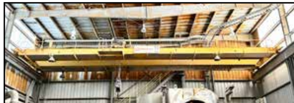
KONECRANES 15-TON DOUBLE GIRDER BRIDGE CRANE