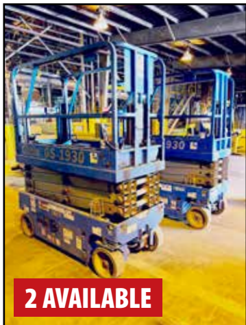
GENIE GS-1930 SCISSOR LIFTS