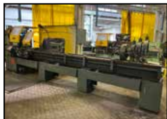
LEBLOND 16" X 132" LATHE