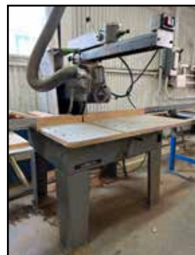
DELTA 33-072 RADIAL ARM SAW