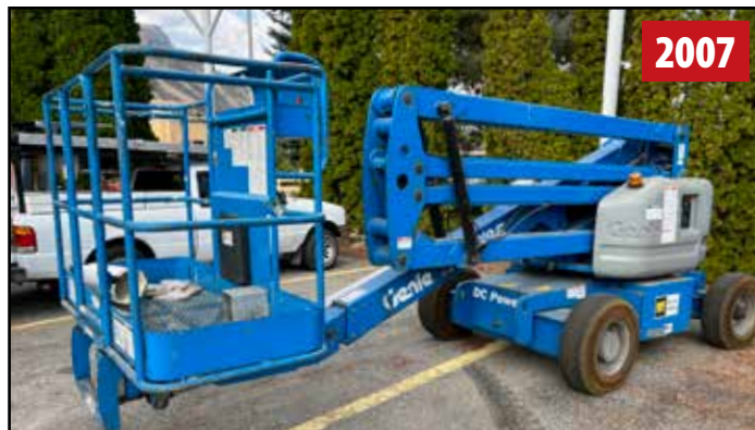
GENIE Z-45/25 ARTICULATED BOOM LIFT