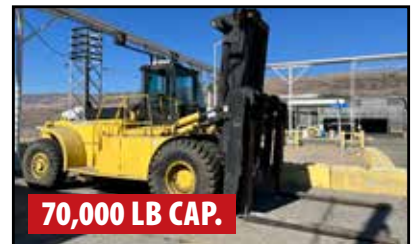
HYSTER H700F FORKLIFT

3-Day Auction of 2,800 Acre Facility Featuring: Fabrication, Machining, Tool Room, Material Handling, Plant Support, Aluminum Smelting Equipment and More