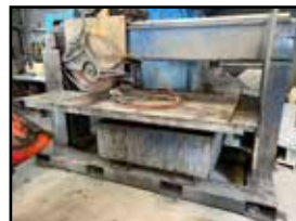
WILSON 28" BLOCK SAW