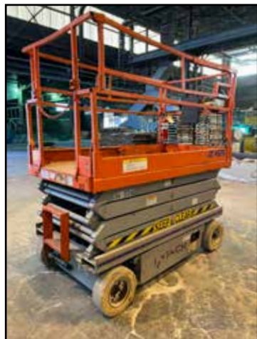
SKYJACK SJII 4626 SCISSOR LIFT