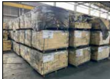
KALA ALUMINA BAKE BRICK