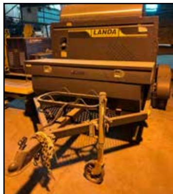
LANDA SLT6-32824E PRESSURE WASHER