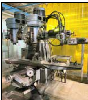
GORTON 2-30 TRACER MASTER TWIN HEAD TRACER MILL