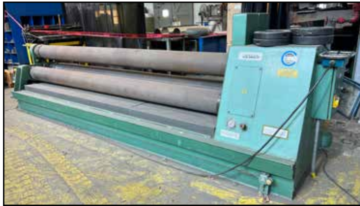
ROUND0 PS-205 PLATE BENDING ROLL