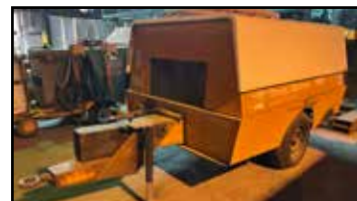
CHICAGO PNEUMATIC 185 AIR COMPRESSOR