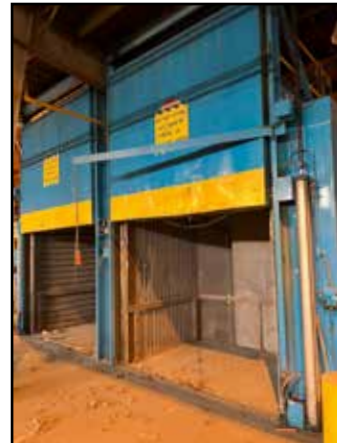
IHEI ALUMINUM DRYING OVEN SYSTEM