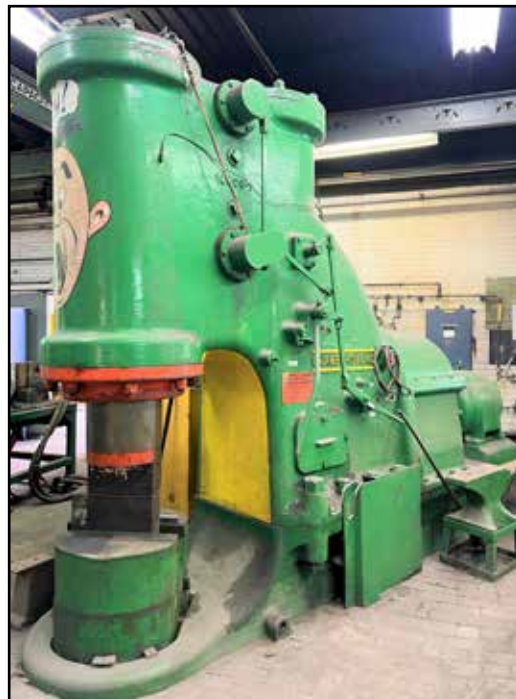
CHAMBERSBURG 15 CH FORGING HAMMER