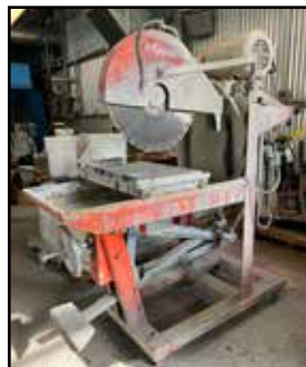
CLIPPER BLOCKBUSTER PRO. 14" MASONRY SAW

OLIVER No. 217 Vertical Bandsaw, s/n 77398, OLIVER 88-D Table Saw, s/n 76837, OLIVER 299-D Planer, s/n 76457, OLIVER 34-DSD Combination Disc and Oscillating Sander, s/n 71560, DELTA 33-072 Radial Arm Saw, s/n 841140387