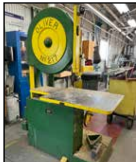
OLIVER NO. 217 VERTICAL BANDSAW