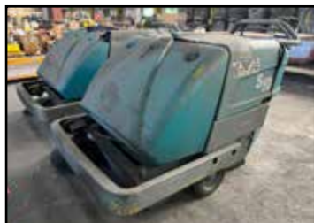
(2) TENNANT FLOOR SWEEPERS