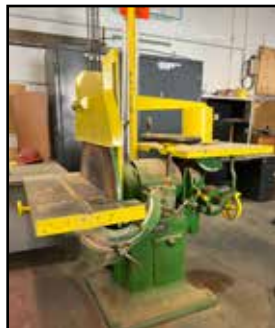
OLIVER 34-DSD COMBINATION DISC & OSCILLATING SANDER