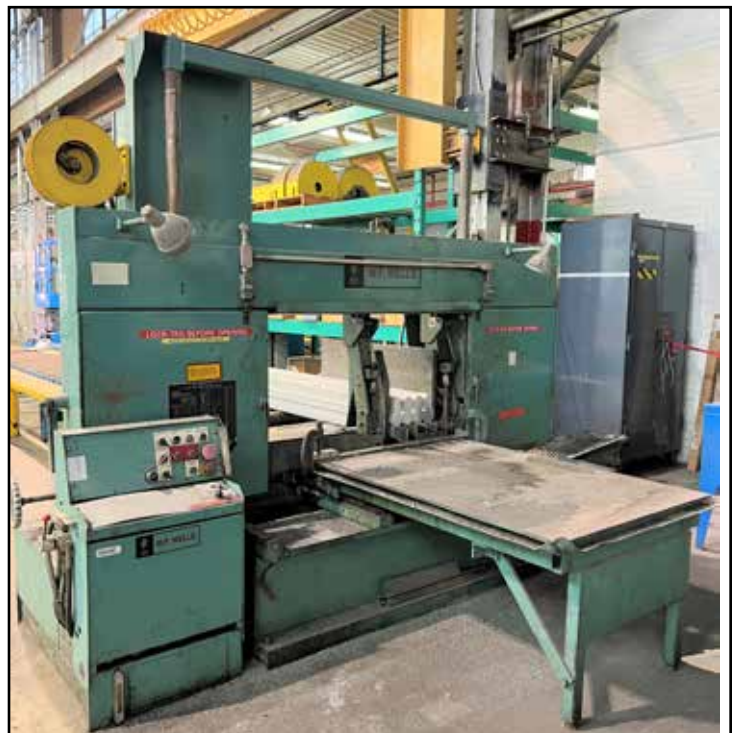
W.F. WELLS B-25-1 HORIZONTAL BANDSAW