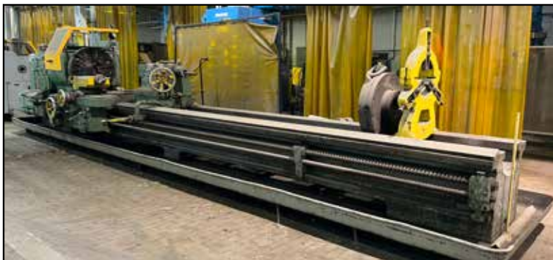
LEBLOND 32" X 180" LATHE

GORTON 2-30 TRACER MASTER TWIN HEAD TRACER MILL , 80-5600 RPM, 12" x 77" w/ Extension, 3 HP Heads, w/ Tracer Master Hydraulic Servo Head, s/n 2725EFM