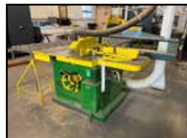
OLIVER 88-D TABLE SAW