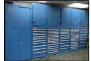
LISTA CABINETS & WORKBENCHES