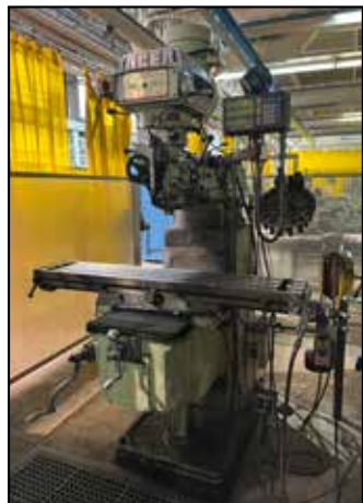
ACER ULTIMA 3VK MILLING MACHINE