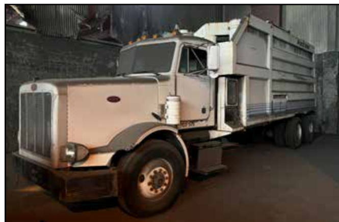
PETERBILT FAST-VAC INDUSTRIAL VACUUM TRUCK

INTERNATIONAL 4900 4X2 FAST-VAC INDUSTRIAL VACUUM TRUCK , VIN 1HT5DNZN8PH478846, Wet & Dry Mode, 5,000 CFM/ 1100 RPM Vacuum Pump Max Speed, Speed