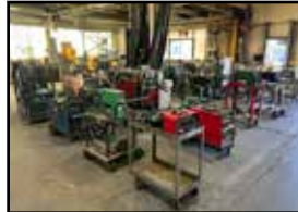
VIEW OF WELDERS