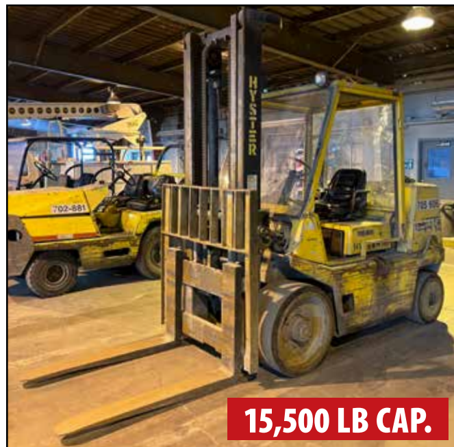
HYSTER S155XL LP FORKLIFT

CLARK GCS25MC LP FORKLIFT , s/n G138MC-0003-8750K0F, 5,000 Lb Capacity, 3-Stage Mast, Side Shift