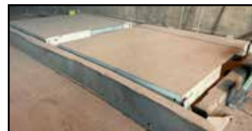
FAIRBANKS 12-8710-S FLOOR SCALES