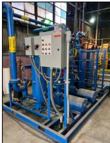
THERMOTECH COOLING SYSTEM

CAMERON TURBO-AIR 3000 CENTRIFUGAL AIR COMPRESSOR , s/n 18823, Like New, 700 HP Siemens Motor, 125 PSI, w/ Thermotech Cooling System