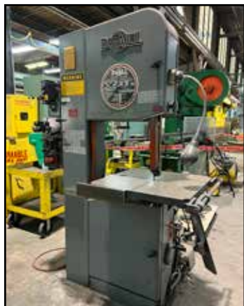
DOALL 2013-V VERTICAL BANDSAW