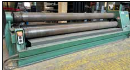
ROUND0 PS-205 PLATE BENDING ROLL