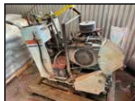
TARGET EC20 CONCRETE SAW