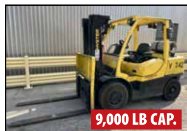
HYSTER H90FT LP FORKLIFT