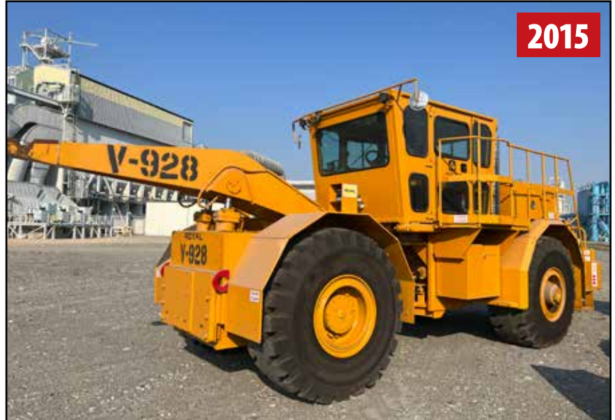
ROYAL A-20 HAUL MASTER CRUCIBLE HAULER

PRE-AUCTION OFFERS INVITED ON MAJOR ASSETS