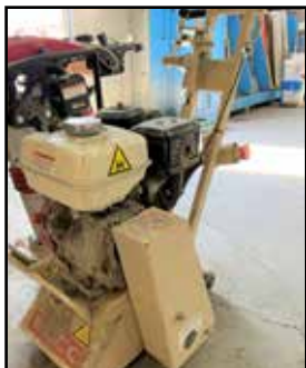
EDCO CPM-8-9H CRETE PLANE