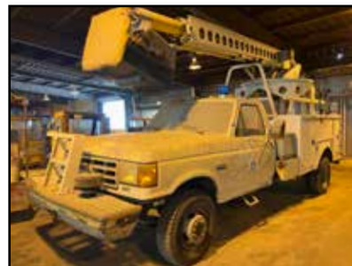
FORD SUPER DUTY CUSTOM BUCKET TRUCK

FORD SUPER DUTY CUSTOM BUCKET TRUCK, VIN 2FDLD47G2MCA71734, 7,854 Miles, Telsta Bucket