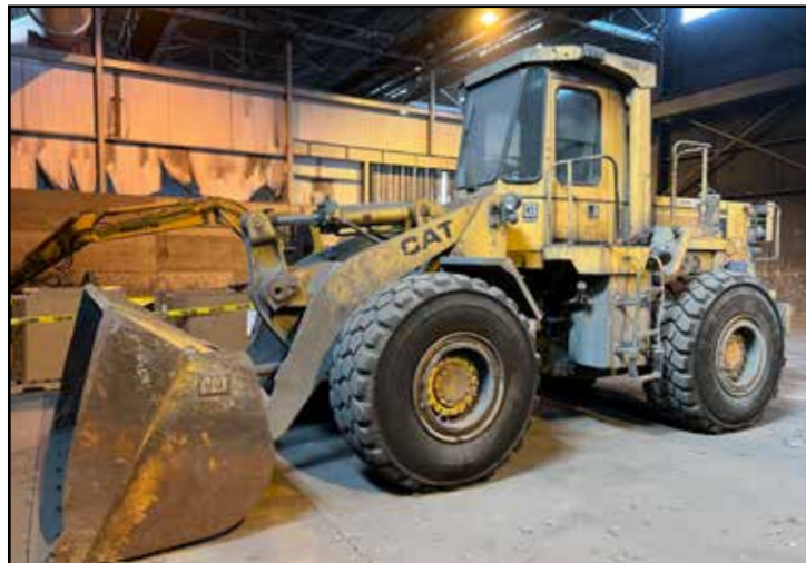
CATERPILLAR 905E WHEEL LOADER

CATERPILLAR IT28B WHEEL LOADER , s/n 1HF02121