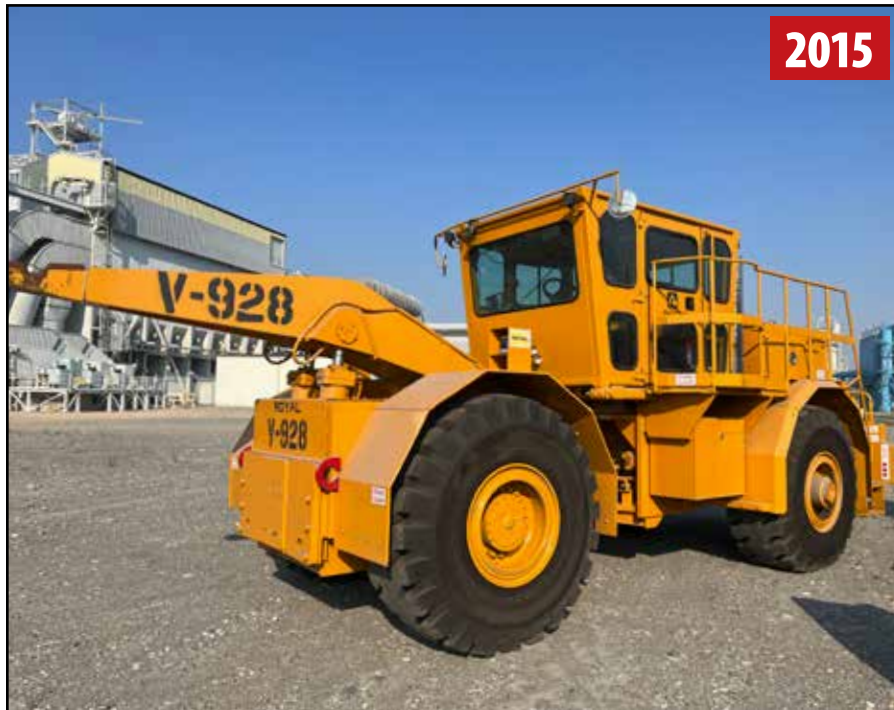
ROYAL A-20 HAUL MASTER CRUCIBLE HAULER

ROYAL A-20-E CRUCIBLE HAULER , s/n 20A110, 30,000 Lb Capacity