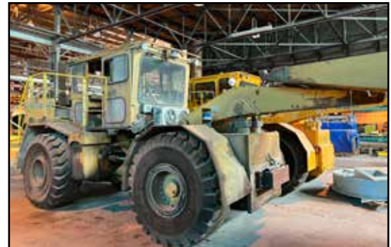
ROYAL A-20-F CRUCIBLE HAULER