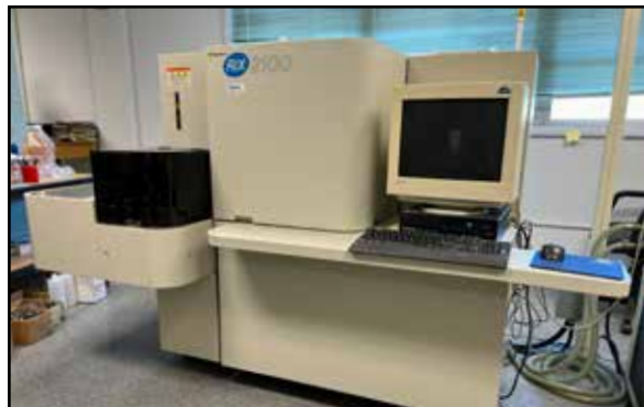
RIGAKU RIX2100X-RAY FLUORESCENCE SPECTROMETER