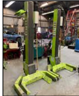
ARI-HETRA HDML-9-2 HYBRID MOBILE CAR LIFT SYSTEM