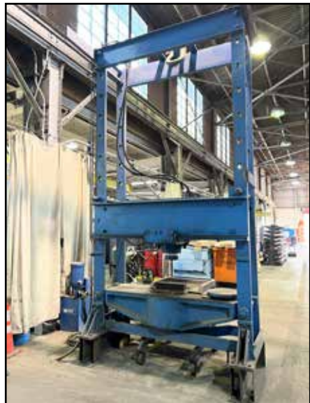
RODGERS HYDRAULICS SWY200X-1001 STRAIGHTENING PRESS

FAMCO 21R Arbor Press , (2) AVEY MA-6 Drill Presses , s/n MA15552 & MA14713, Size 3, Type B, 150-1200 RPM, 22" x 20" Table, 12" Throat, OSTER 582-A Portable Pipe & Bolt Threader , s/n ABC-345, Drill Presses, Grinders, Sanders, Chop Saws, Pipe Benders, Pipe Threaders and Much More