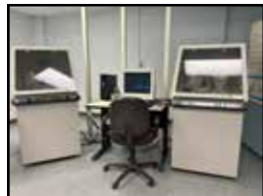
DIANO 2100E X-RAY DIFFRACTOMETER SYSTEMS

(2) ANGSTROM 4451A-1 SAMPLE PRESSES , s/n 4600-139 & 4600-127