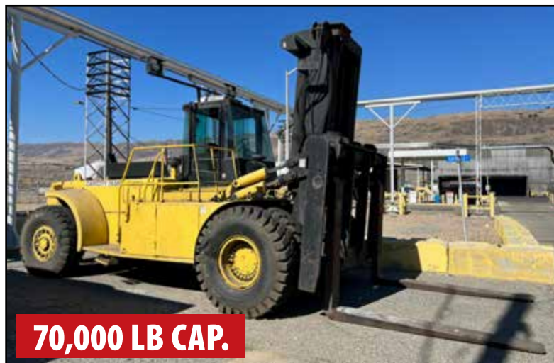
HYSTER H700F FORKLIFT