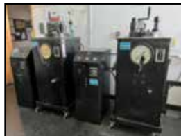
ANGSTROM 4451A-1 SAMPLE PRESSES