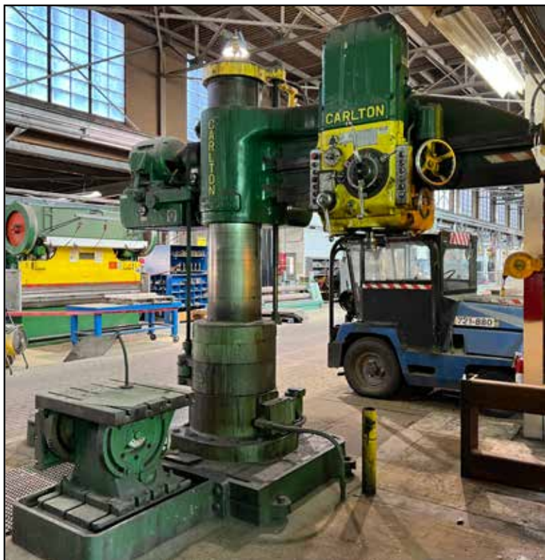
CARLTON 5' X 17" RADIAL ARM DRILL