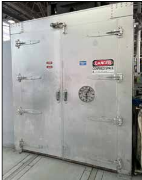
DESPATCH ELECTRIC OVEN