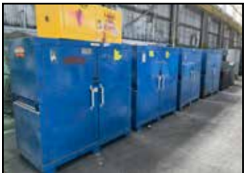
KNAACK JOB BOXES