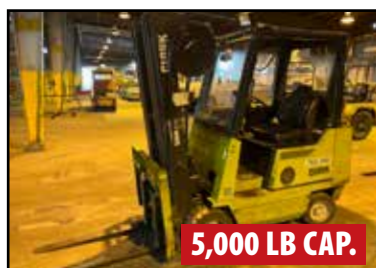
CLARK GCS25MC LP FORKLIFT