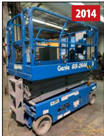
GENIE GS-2646 SCISSOR LIFT