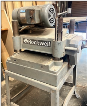
ROCKWELL-INVICTA 22655 13" PLANER