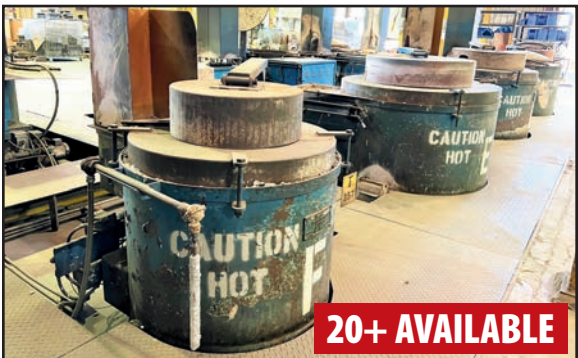
VIEW OF ASSORTED FURNACES