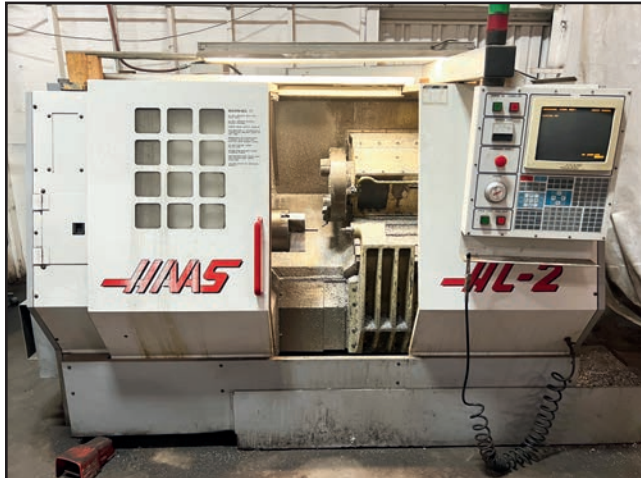
HAAS HL2 TURNING CENTER

Pre-Auction Offers Invited on Major Assets