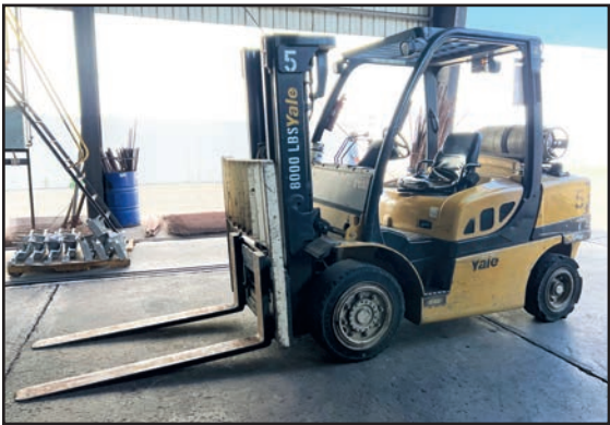
YALE GLP080 8,000 LB LP FORKLIFT

2006 ISUZU STAKE BED PICKUP TRUCK, VIN 4KLB4B1U06J803498, 311,071 Miles