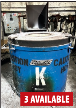
BAKER GAS FIRED 400-S MAG CRUCIBLE FURNACE

Wednesday, August 10, by Appointment Only