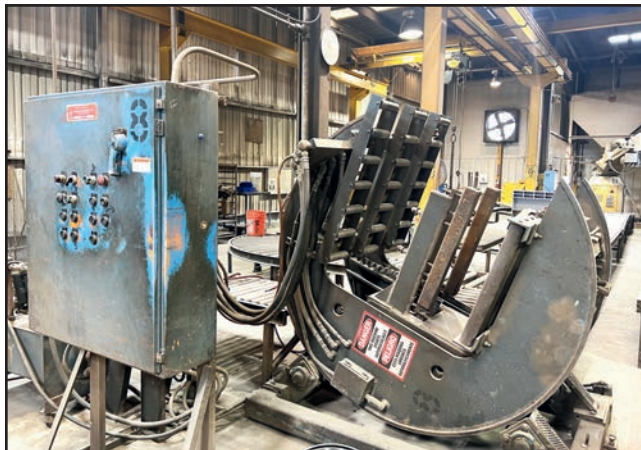
CLEVELAND R-1532 HYDRAULIC MOLD ROLLOVER DRAW