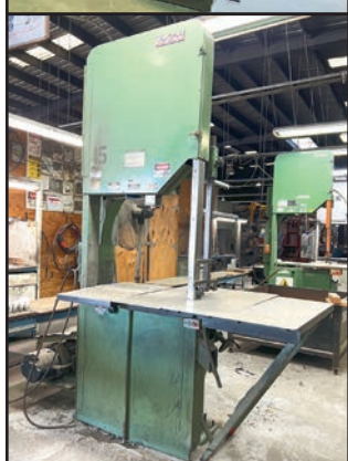
ASSORTED NORTHFIELD VERTICAL BANDSAWS