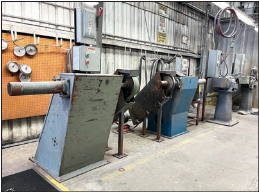
BURR-KING 760 BELT SANDERS