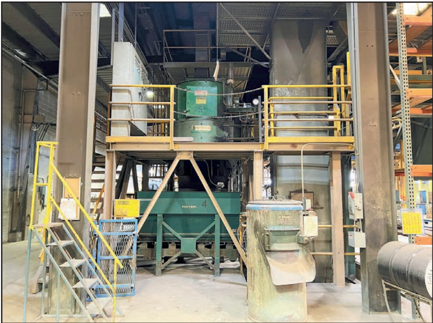
SAND HANDLING AND MOLD MAKING SYSTEM