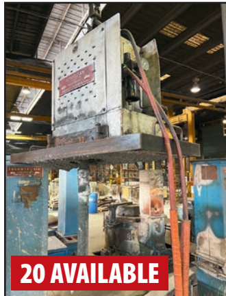
20 AVAILABLE THERMTRONIX 3602 AUTOCLEAN DEGASSING UNITS