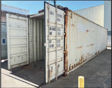
40' AND 20' SHIPPING CONTAINERS