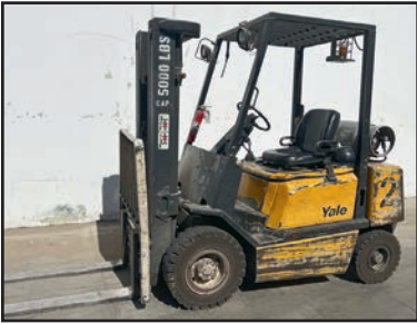
YALE GLP050R 5,000 LB LP FORKLIFT

BOBCAT 751 SKID STEER LOADER, s/n 515711806