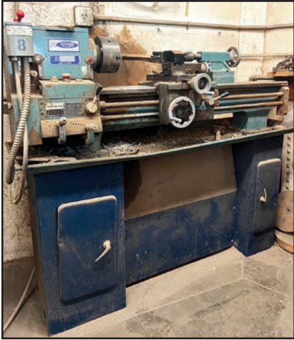
RUTLAND 2649-1190 LATHE