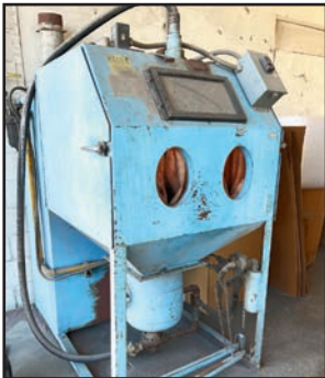
(1 OF 2) KELCO BLAST CABINETS