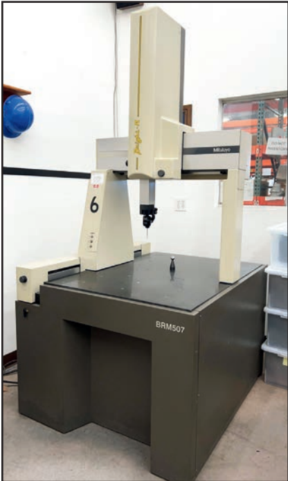
MITUTOYO BRM507 BRIGHT-M CMM

MITUTOYO BRM507 BRIGHT-M COORDINATE MEASURING MACHINE, s/n BB000062, w/RENISHAW MIP Probe MITUTOYO BH-V710 COORDINATE MEASURING MACHINE, s/n 0054711, w/RENISHAW MIP Probe THERMO ARL 4460 OPTICAL EMISSION METALS ANALYZER, s/n 1028 BAIRD METALS ANALYZER, s/n 3298A ALSO: TINIUS OLSEN TENSILE TESTER, Height Master, Height Gauges, Gauge Blocks, 2-4-6 Blocks, Calipers, and More