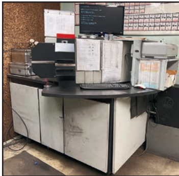
BAIRD METALS ANALYZER