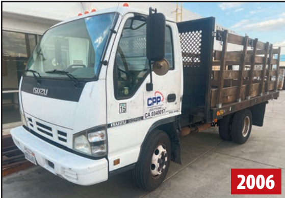
ISUZU STAKE BED PICKUP TRUCK