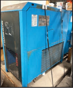
(1 OF 2) HANKINSON HPRP500-460 COMPRESSED AIR DRYERS