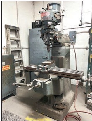
ACRAMILL 942VS VERTICAL MILL