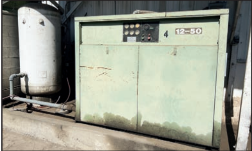
(1 OF 3) SULLAIR AIR COMPRESSORS

CRANEVEYOR SINGLE RAIL CRANE SYSTEM, 1,000 Lb Capacity, 80'L