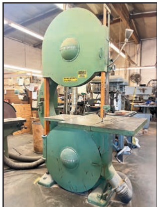
TANNEWITZ GH VERTICAL BANDSAW