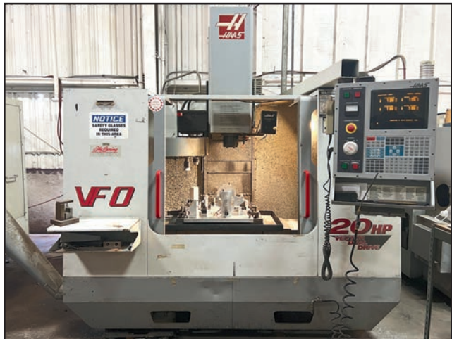
HAAS VF0B VERTICAL MACHINING CENTER

CRAFTSMAN 14" VERTICAL BANDSAW, 2-Speed, 6" Cutting Depth