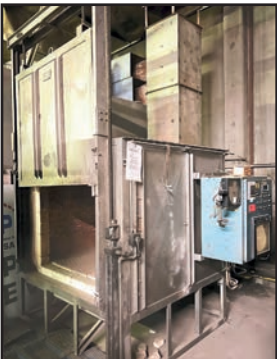
PACIFIC KILN PBF-60F HEAT TREAT FURNACE