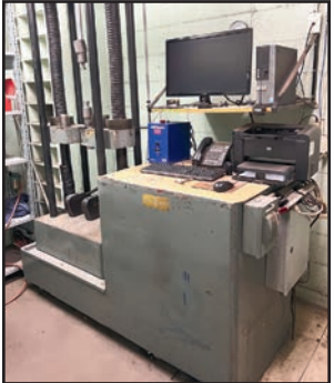
TINIUS OLSEN TENSILE TESTER

CINCINNATI ENGINE LATHE, s/n NA, 15" Swing, 54" Between Centers, 10" 3-Jaw Chuck, 30-1,200 RPM, Tailstock RUTLAND 2649-1190 LATHE, s/n NA, 58-1,100 RPM, 6" 3-Jaw Chuck, 10" Swing, 36" Between Centers, Tool Post, Tailstock KENT KGS-250AH SURFACE GRINDER, s/n 8112191-7 DAKE H-FRAME SHOP PRESS, s/n NA, Approx. 50-Ton Capacity CAROLINA CBP 1200 50-TON H-FRAME SHOP PRESS, s/n 11601 ONSRUD W-1036 OVERHEAD PIN ROUTER, s/n 7358, 36" x 48" Table