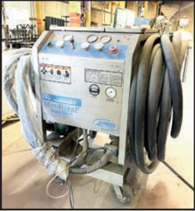
ALPHEUS SD15 CO2 MINIBLAST DRY ICE CLEANING SYSTEM