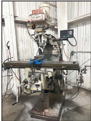
ACCUPATH II AC-3KV VERTICAL MILL