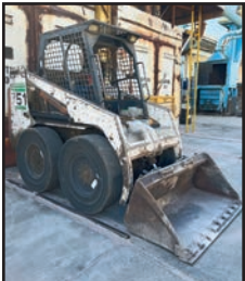
BOBCAT 751 SKID STEER LOADER