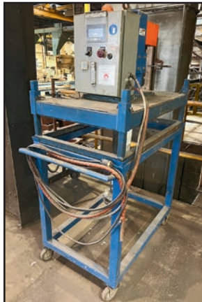
FOSECO MDU-300 DEGASSING UNIT