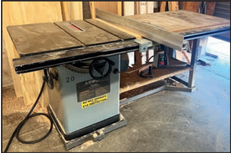
DELTA UNISAW 10" TILTING ARBOR TABLE SAW