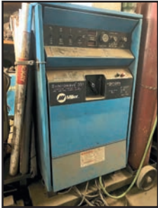
MILLER SYNCROWAVE 351 ARC WELDER