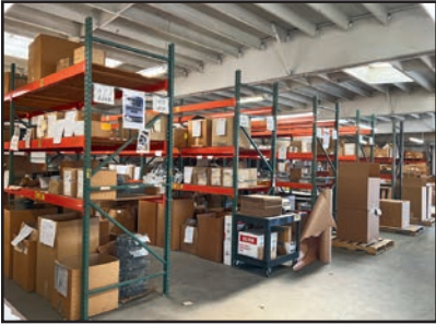
(50+) SECTIONS OF PALLET RACKING