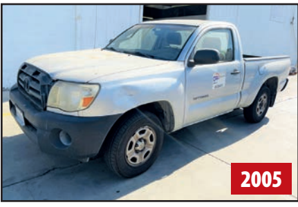
TOYOTA TACOMA PICKUP TRUCK