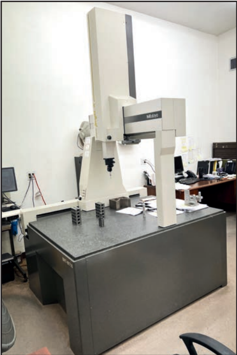
MITUTOYO BH-V710 CMM