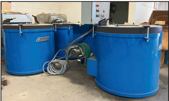
(3) NEW BAKER GAS FIRED 400-S MAG CRUCIBLE FURNACES