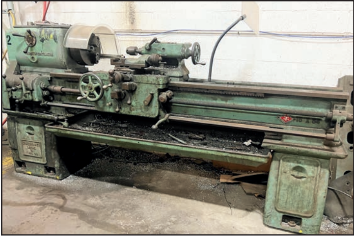
CINCINNATI ENGINE LATHE