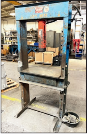
CAROLINA CBP 1200 50-TON H-FRAME SHOP PRESS