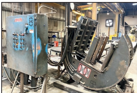
CLEVELAND R-1532 HYDRAULIC MOLD ROLLOVER DRAW