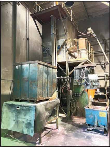
FOUNDRY SAND BLENDING AND HANDLING SYSTEM