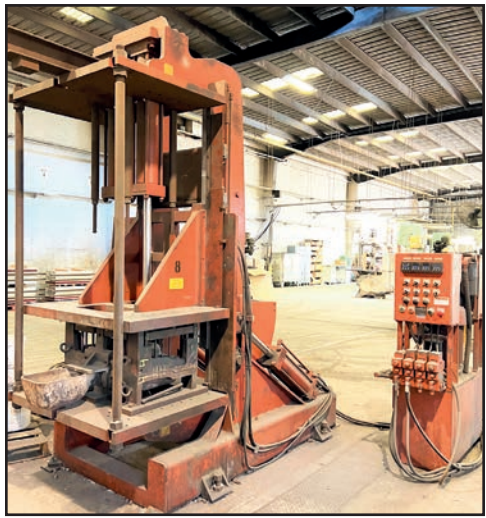
HALL 3HSX PERMANENT MOLD CASTING MACHINE