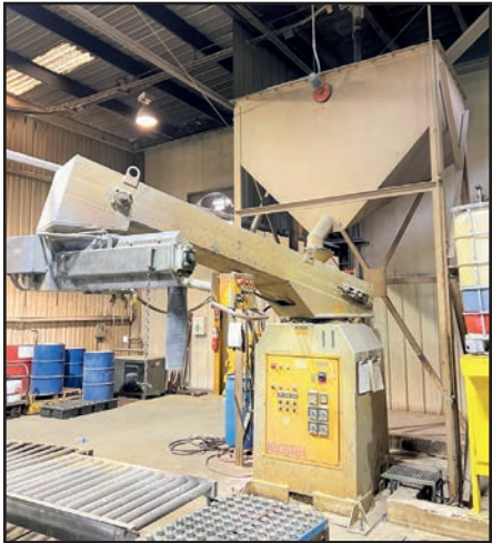
MOLD/CORE SAND MIXING SYSTEM