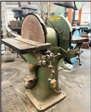
FRIEDRICH ZIMMERMANN SZ2 DUAL DISC SANDER