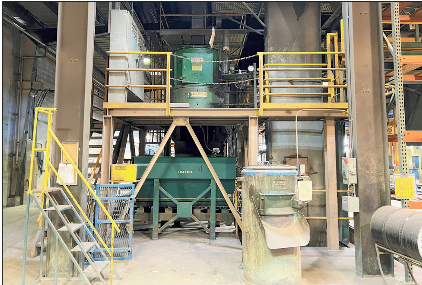
SAND HANDLING AND MOLD MAKING SYSTEM

Featuring: Sand Blending & Handling Systems, Vibratory Shakers, Vertical Bandsaws, Grinding Department, (20+) BAKER & THERMTRONIX Gas-Fired Crucible & Melting Furnaces, CLEVELAND R-1532 Hydraulic Mold Rollover Draw, HALL 3HSX Mold Casting Machine, FOSECO & THERMTRONIX Degassing Units, Heat Treat, CNC Machine Shop Including HAAS & FADAL VMCs, Tool Room, CMM & Inspection Room, (3) YALE Fork Lifts up to 8,000-Lb, Vehicles, Free Standing Bridge Cranes, MRO & Plant Support