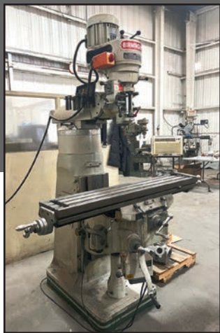
BIRMINGHAM VJ5523 VERTICAL MILL