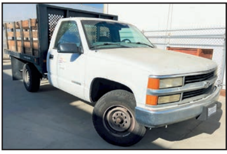
CHEVROLET 2500 STAKE BED TRUCK