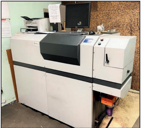
THERMO ARL 4460 OPTICAL EMISSION METALS ANALYZER