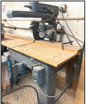
DELTA ROCKWELL RADIAL ARM SAW