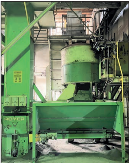
SAND HANDLING SYSTEM

MOLD/CORE SAND MIXING SYSTEM , Comprising Pneumatic Receiver Vessel, 5 Cu./Ft. Sand Hopper, 40 Cu./Ft., KLOSTER II-300 Versa-Mull Mixer, s/n MS-7896, 9.25 HP, Sand Hopper, 40 Cu./Ft., SIMPSON Pro-Mix Jr Mixer, 11.5 HP, Sand Hopper, 40 Cu./Ft., GAYLORD Cold Box Core Machine, DYNAMIC Air Modu-Kleen 343-400, 400 Sq. Ft. Filter Area, Reverse Air Cleaning System