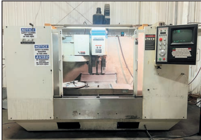
FADAL VMC 4020 VERTICAL MACHINING CENTER