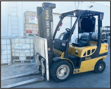
YALE GLP060 6,000 LB LP FORKLIFT