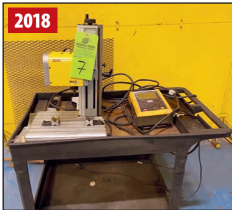
2018 TECHNOMARK MULTI 4 120 DOT PEEN MARKING MACHINE