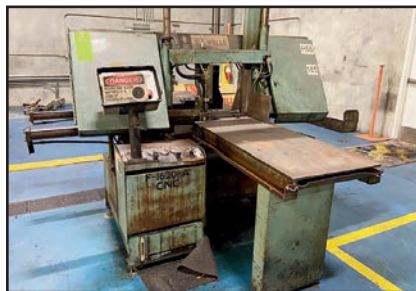
WF WELLS F1620-A CNC HORIZONTAL BANDSAW