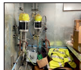
GFS PAINT BOOTH AND KITCHEN W/MIXERS