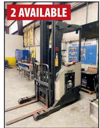
2 AVAILABLE CROWN S200 SERIES ELECTRIC STANDUP FORKLIFT