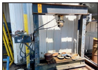
ENERPAC APPROX 100 TON H-FRAME PRESS

To discuss your requirements for an auction, please call Perfection Industrial +1-847-545-6374