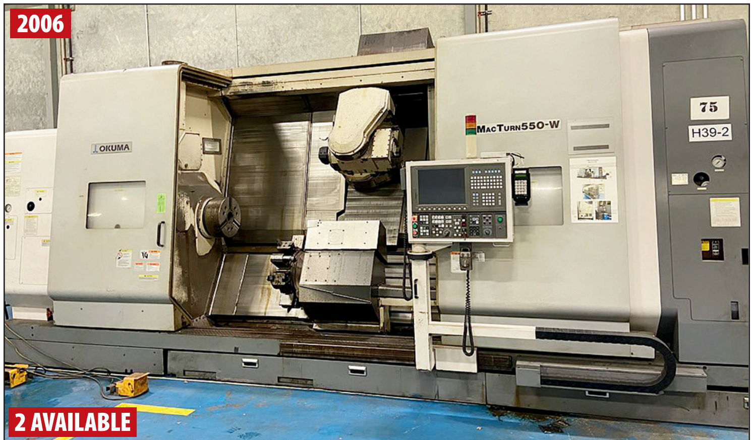
OKUMA MACTURN 550-W CNC TURNING CENTER

FEATURING: (2) 2006 Okuma Macturn 550-W Live Tooling Turning Centers, 10,000 Lb Prestin Easton Welding Positioner, Aronson Welding Positioner, WF Wells Bandsaw, Kubota 50 HP Tractor, CAT 50 Tooling & More