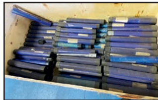
(APPROX. 100) 1.265" GUN DRILLS