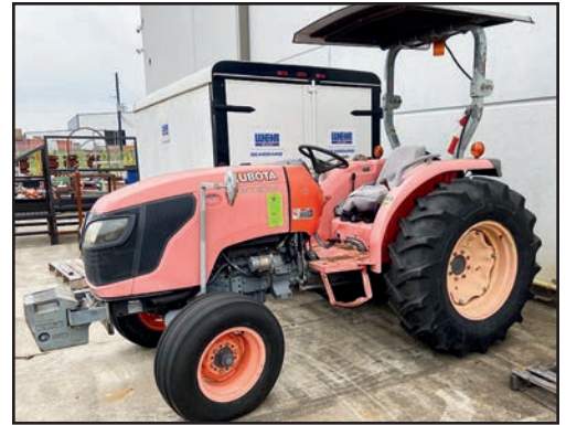
KUBOTA MX5100F TRACTOR

FEATURING: (2) 2006 Okuma Macturn 550-W Live Tooling Turning Centers, 10,000 Lb Prestin Easton Welding Positioner, Aronson Welding Positioner, WF Wells Bandsaw, Kubota 50 HP Tractor, CAT 50 Tooling & More