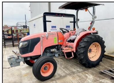
KUBOTA MX5100F TRACTOR