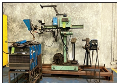
ARONSON/MILLER SUBARC SYSTEM

ENERPAC APPROX. 100 TON H-FRAME PRESS, 57" Between Uprights, 42" Max. Under Ram