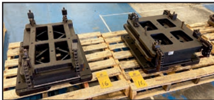
GAGEMAHER VALVE FIXTURES