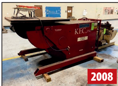
PRESTON-EASTIN PA100HD12 WELDING POSITIONER