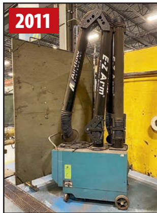
2011 AIRFLOW DUAL FEED SMOG HOG