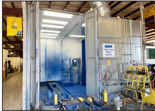
GFS PAINT BOOTH AND KITCHEN W/MIXERS

Pre-Auction Offers Invited on Major Assets