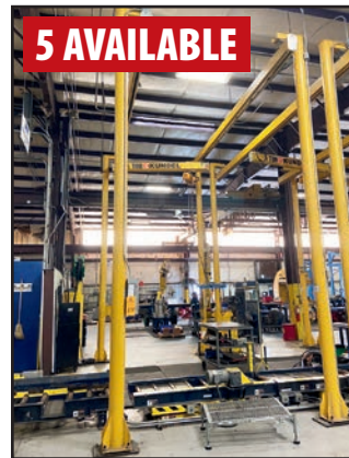
5 AVAILABLE KUNDEL 1/2 TON FREE STANDING GANTRY CRANE