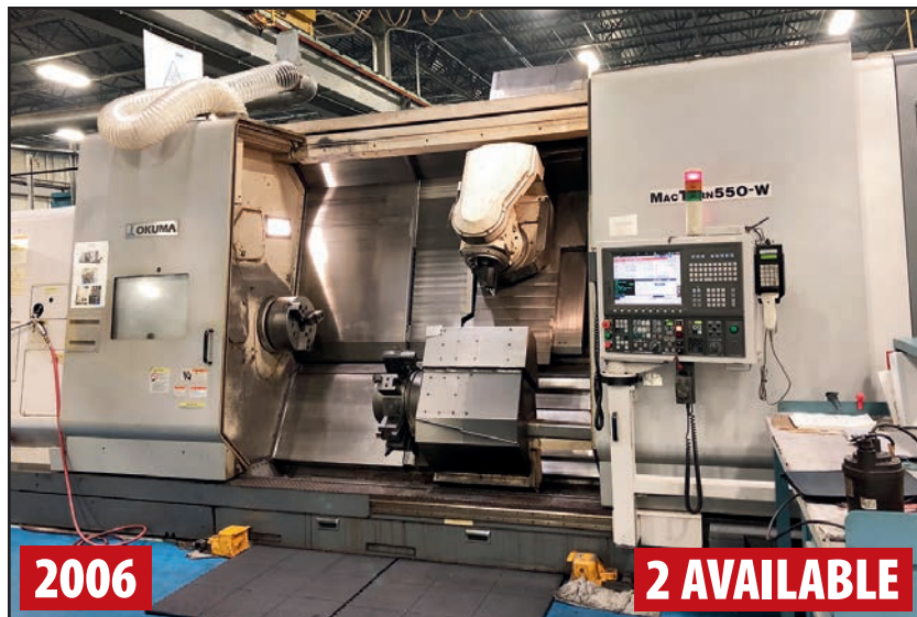
OKUMA MACTURN 550-W CNC TURNING CENTER