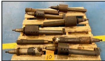
ASSORTED 50 TAPER TOOLING

ADJUSTABLE ROLL OVER W/ROTATION CONVEYOR TABLE