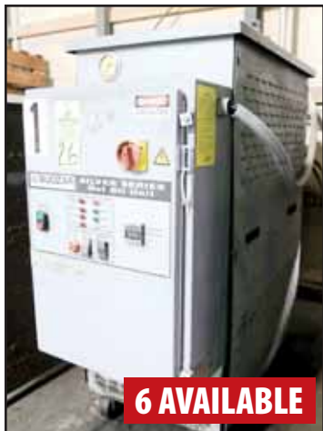
BUDZAR HOT OIL UNIT