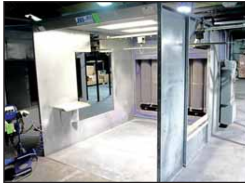
JB I OPEN FACE/PASS THRU PAINT BOOTH