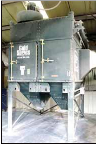
FARR DUST COLLECTOR