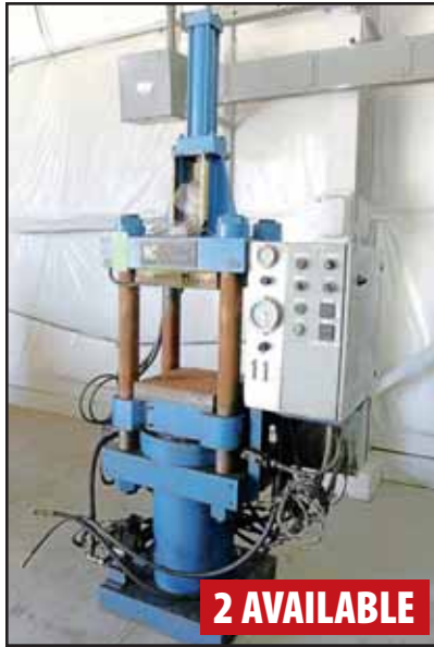
WEST COAST 98.1 TON 4 POST PRESS