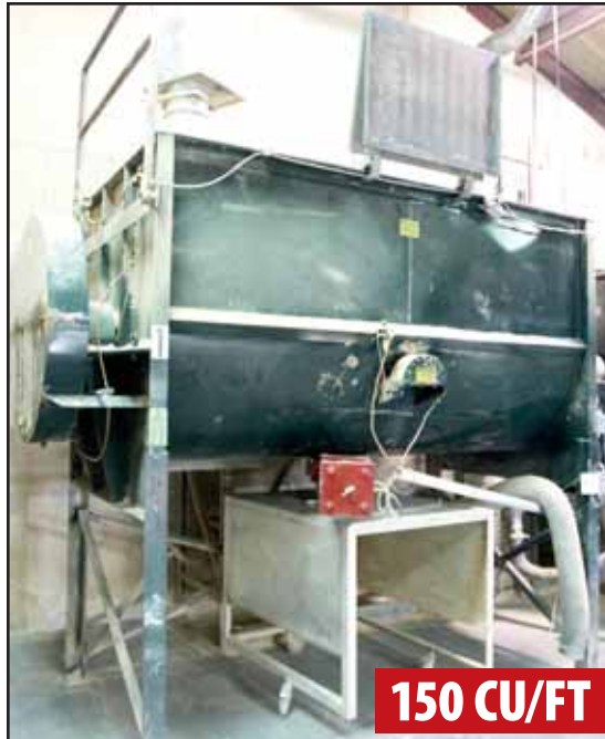
MUNSON RIBBON BLENDER