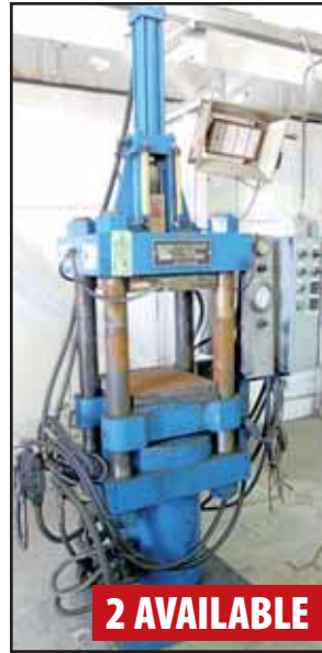
WEST COAST 98.1 TON 4 POST PRESS