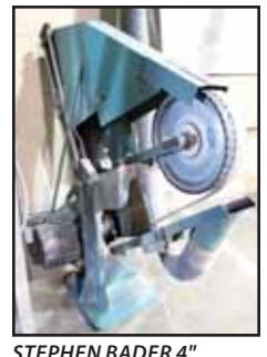
STEPHEN BADER 4" BELT GRINDER