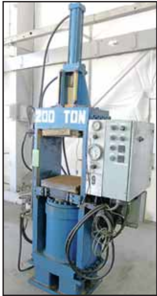
CHRISTY 141.3 TON SLABSIDE PRESS