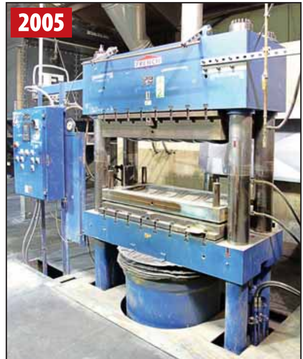
FRENCH OIL 500 TON PRESS

Sale Closing Date: Thursday, November 5, 2015 at 1:00 PM EST