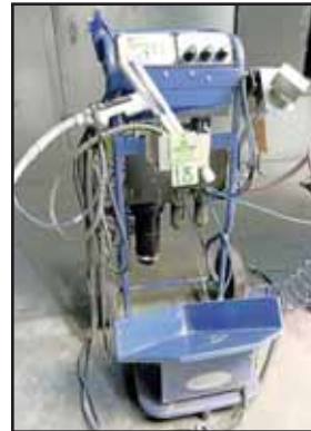
NORDSON SURE COAT PAINT GUN