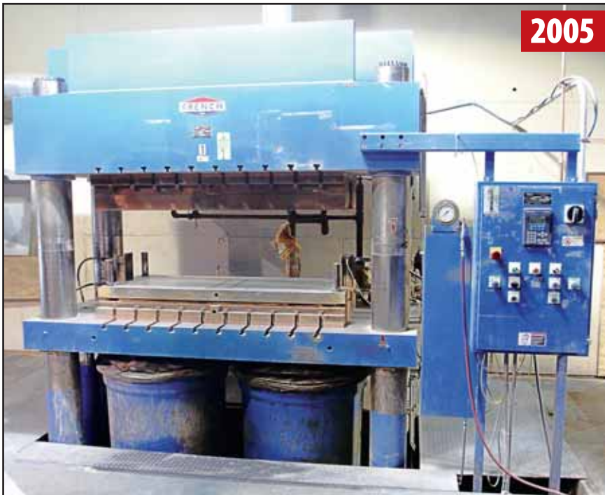
FRENCH OIL 1,130 TON PRESS