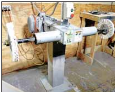
G&P PW-5 DBL. END POLISHER/GRINDER