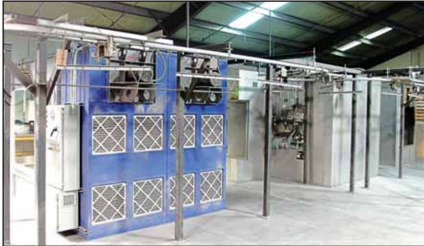
VIEW OF POWDER COAT SYSTEM

144' Enclosed Overhead Conveyor , w/36 Swivel Self Locking Universal Hanging Bars, 100-Lb./Bar Max. Load