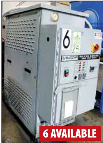
BUDZAR HOT OIL UNIT