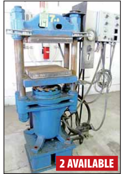
FH MALONEY 62.8 TON 4 POST PRESS