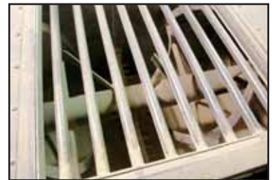
INTERIOR VIEW OF MUNSON