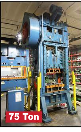
PERKINS 75-T STRAIGHT SIDE PRESS