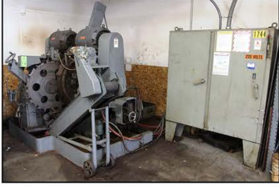
GARDNER 125 DOUBLE DISC GRINDER