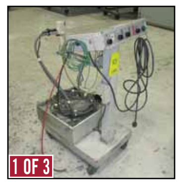
(3) GEMA Manual Powder Shaker Box Units