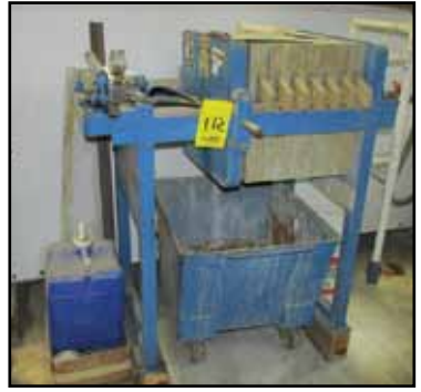
JWI Filter Press