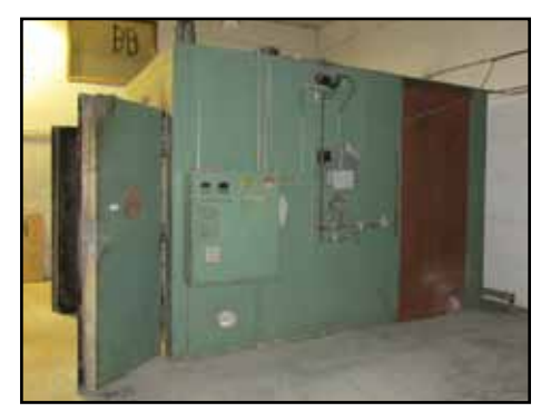
WISCONSIN OVEN 500° Curing Oven