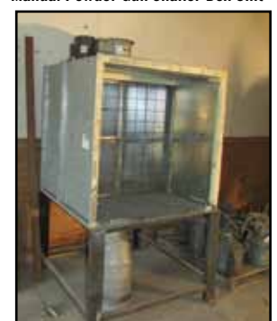
40" x 40" x 25" Liquid Spray Booth