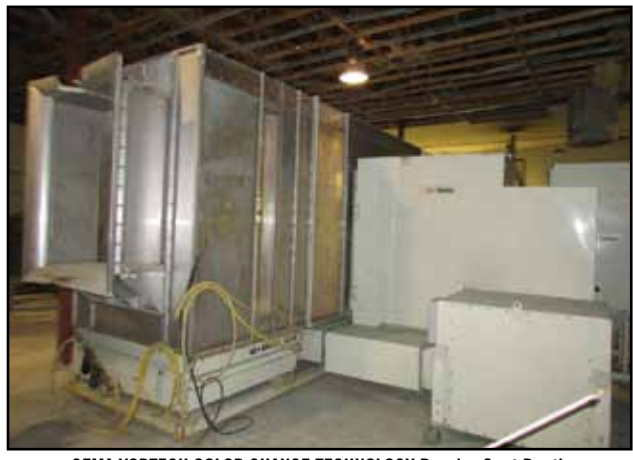
GEMA VORTECH COLOR CHANGE TECHNOLOGY Powder Coat Booth