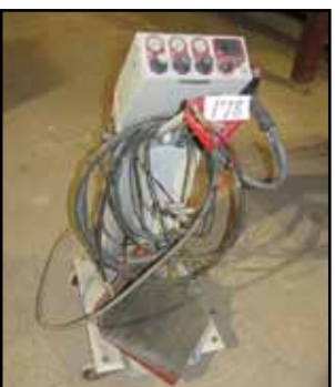
SAMES E-Series Manual Powder Gun Shaker Box Unit