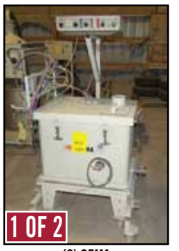
(2) GEMA Powder Transfer Hoppers