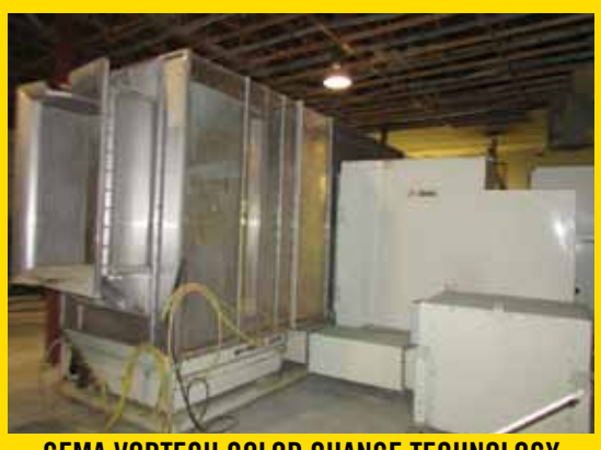
GEMA VORTECH COLOR CHANGE TECHNOLOGY Powder Coat Booth

Inspection: Day Prior to Auction From 9AM - 4PM