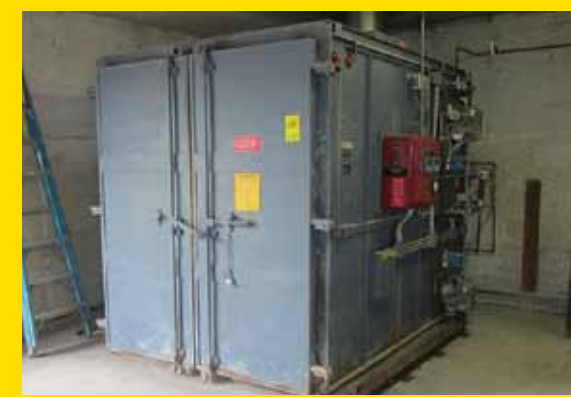
POLLUTION CONTROL PRODUCTS Burnoff Oven