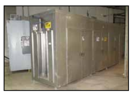
PROTHERM Infrared Oven