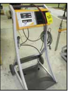
OPTIFLEX F Control Unit