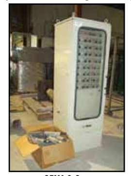
GEMA 8-Gun PGC1 Powder Control Units