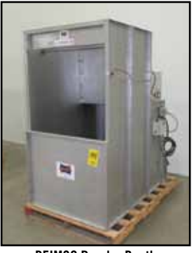
DEIMCO Powder Booth