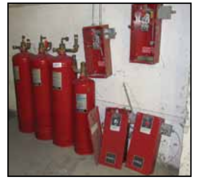
Fire Suppression System