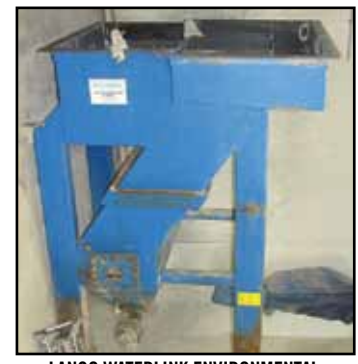
LANCO WATERLINK ENVIRONMENTAL PRODUCTS Slant Bed Clarifier