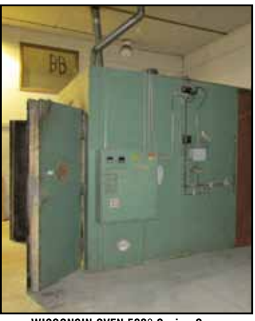
WISCONSIN OVEN 500° Curing Oven