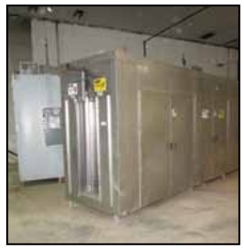
PROTHERM Infrared Oven