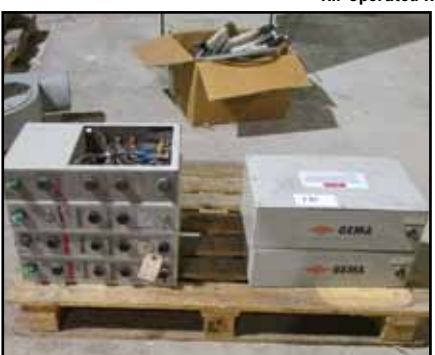
SILA GEMA Power Units for Powder Guns