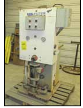
US FILTER Rinse Recirc Aquasaver System & CULLIGAN RO System