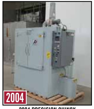
2004 PRECISION QUINCY 3x3x3 500°F Curing Oven