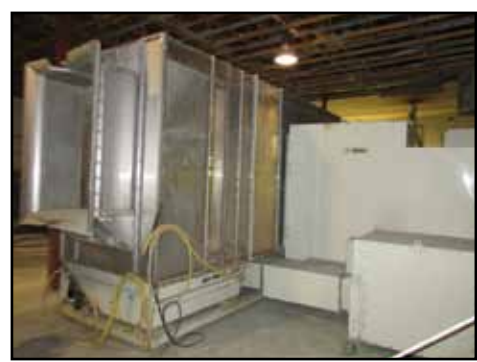
GEMA VORTECH COLOR CHANGE TECHNOLOGY Powder Coat Booth