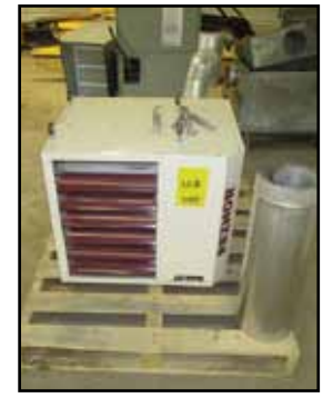
REZNOR Forced Air Propane Heater