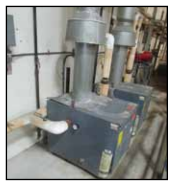
(2) WELL-McLAIN Boilers