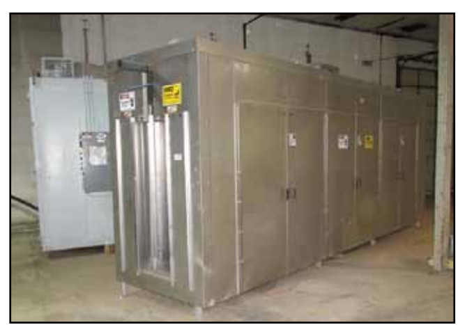
PROTHERM Infrared Oven

Inspection: Day Prior to auction from 9AM - 4PM