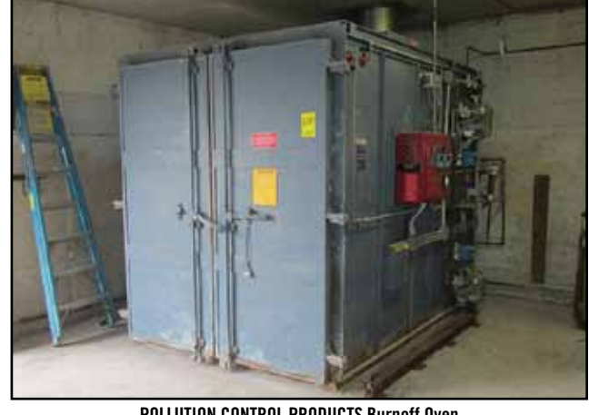
POLLUTION CONTROL PRODUCTS Burnoff Oven