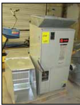
TRANE Electric Furnace