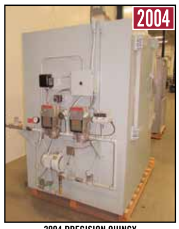
2004 PRECISION QUINCY 3x3x3 500°F Curing Oven