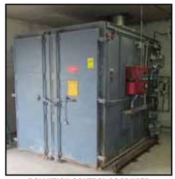
POLLUTION CONTROL PRODUCTS Burnoff Oven