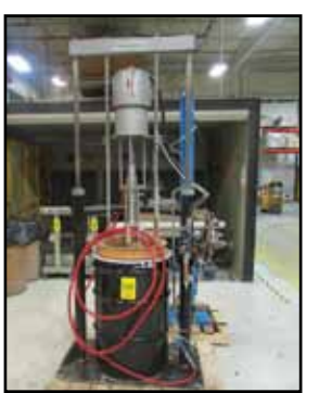
GRACO Paint Pump w/Gun Parts