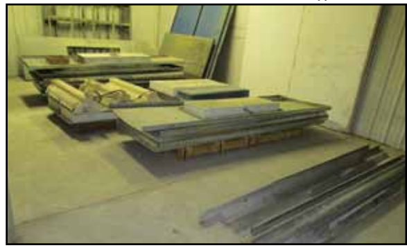
Paint Booth Panels, Lights & Exhaust Fan