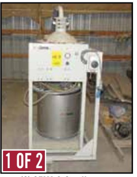
(2) GEMA 8-Gun Hoppers