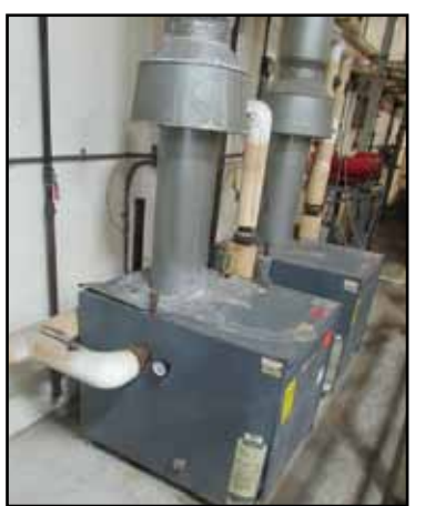
(2) WELL-McLAIN Boilers