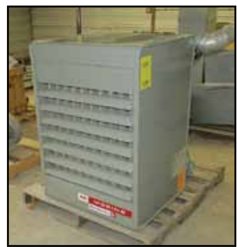
MODINE Forced Air Propane Heater