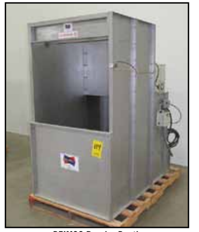
DEIMCO Powder Booth