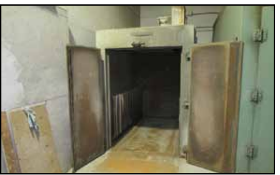
DESPATCH Gas Fired Curing Oven