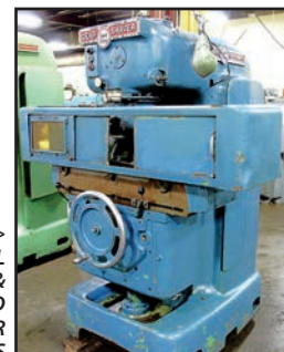
> NATIONAL BROACH & MACHINE RED RING GEAR SHAVERS

Sale Closing From: Thursday, September 29, 2016 at 10:00 AM CDT