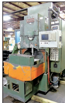
FELLOWS 10-4 GEAR SHAPER