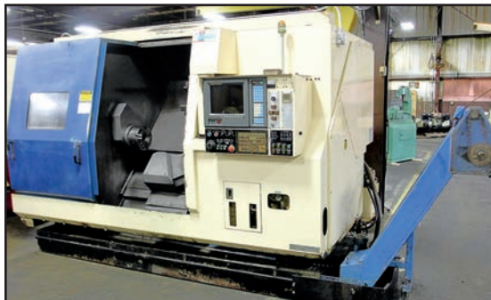
IKEGAI TT25 4-AXIS SLANT BED CNC LATHE