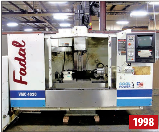
FADAL 906 VMC 4020HT VERTICAL MACHINING CENTER