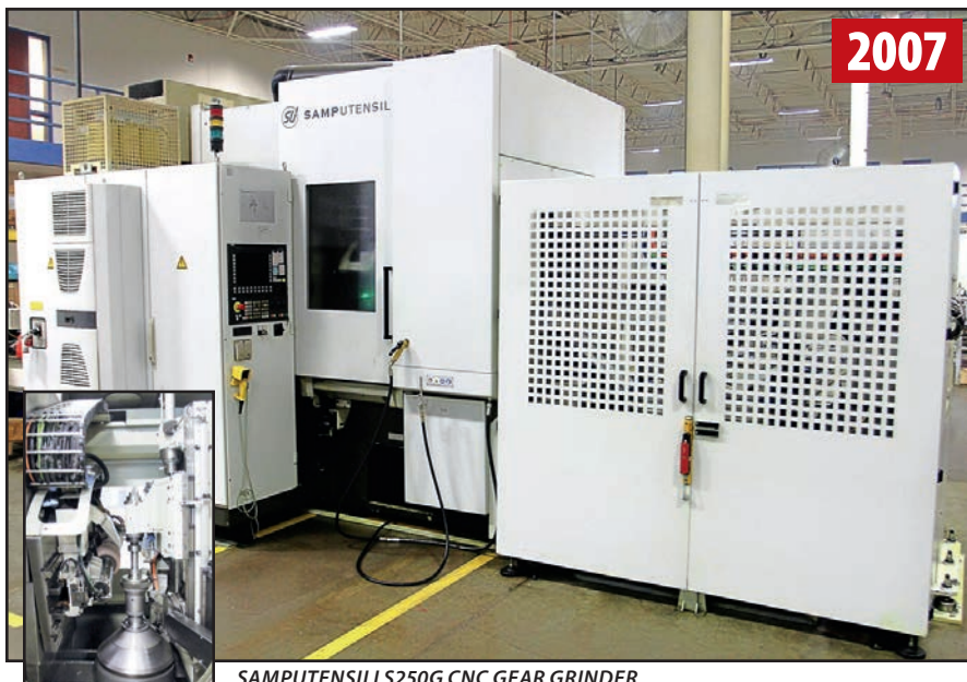
SAMPUTENSILI S250G CNC GEAR GRINDER