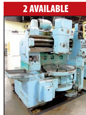
2 AVAILABLE FELLOWS 36-TYPE GEAR SHAPER