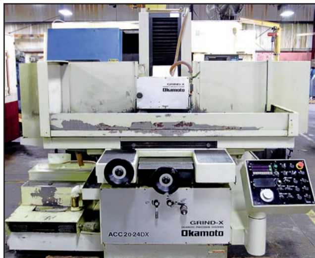
OKAMOTO ACC 20-24DX WET-TYPE SURFACE GRINDER