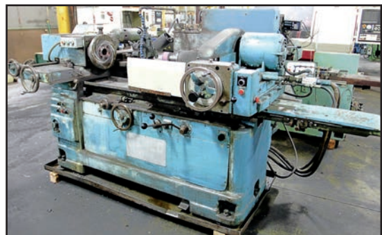
HEALD 272 PLAIN INTERNAL GRINDER