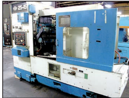
BARBER COLMAN 25-15 GEAR HOBBER