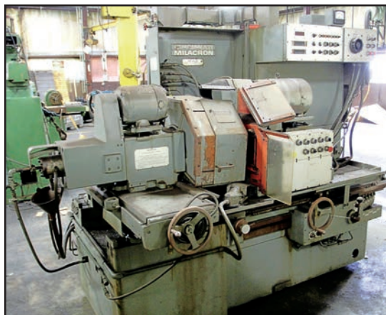
CINCINNATI MILACRON/HEALD 2EF73 SIZEMATIC INTERNAL GRINDER