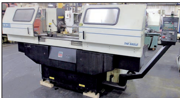
KO LEE 032.033 TOOL AND CUTTER GRINDER

To discuss your requirements for an auction, please call Perfection Industrial 847-545-6374