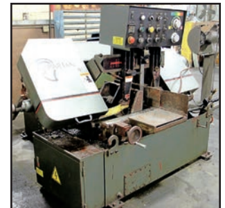
MARVEL SPARTAN PA10 HORIZONTAL BANDSAW