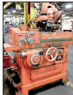
< BARBER COLMAN 6-5R HOB SHARPENER

1998 FASSLER K-300 CNC GEAR HONING MACHINE , s/n 721, Num CNC Control