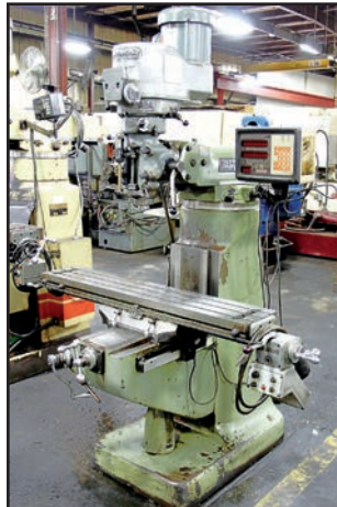
BRIDGEPORT 2 HP MILLING MACHINE