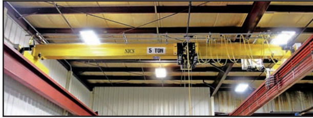
NICS FREE-STANDING BRIDGE CRANE SYSTEM

1-TON CONTRX CRANES FREE-STANDING JIB CRANE , w/Stahl ST10 Electric Hoist w/Pendant Control, 11'H x 13' Arm