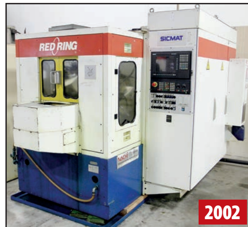
2002 SICAT RASO 200 A6 CNC GEAR SHAVER