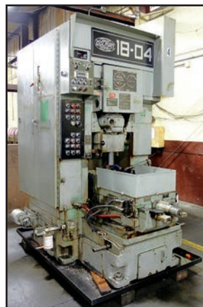
BARBER COLMAN 18-04 GEAR SHAPER

NATIONAL BROACH & MACHINE RED RING GEAR SHAVER , s/n GC1-2105, 9" Cutterhead, 7.5" x 35.5" Table