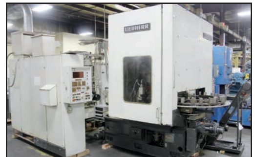
LIEBHERR LC255 CNC GEAR HOBBER