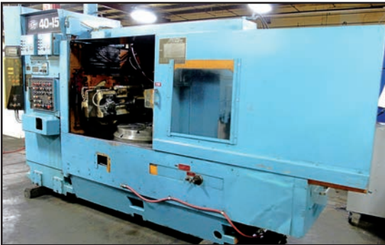
BARBER COLMAN 40-15 GEAR HOBBER

ALSO AVAILABLE: LARGE SELECTION OF ASSORTED GEAR HOBBS