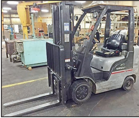
NISSAN MCPL02A25LV LP FORKLIFT