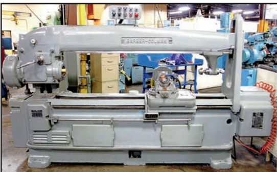
BARBER COLMAN 16-56 GEAR HOBBER