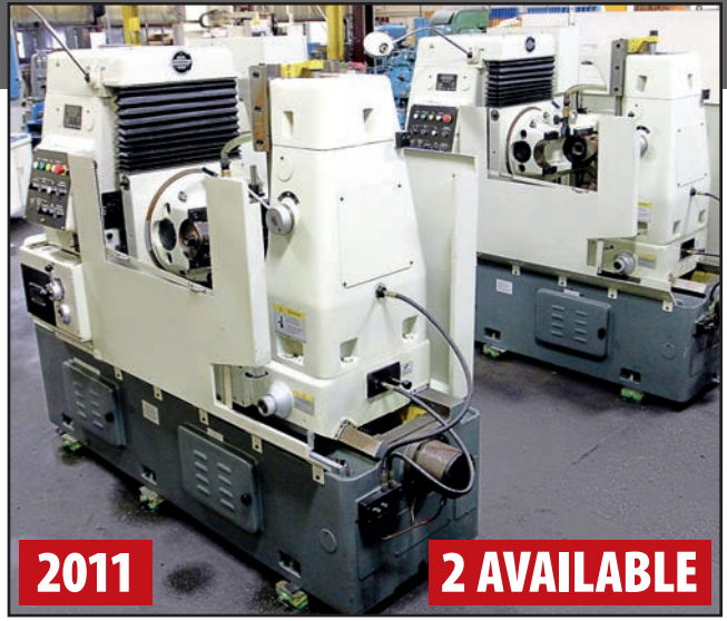
CHONGQING MACHINE TOOL Y3150E GEAR HOBBER