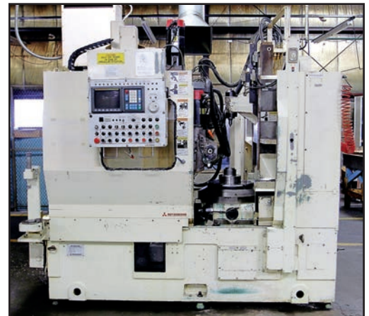
MITSUBISHI GC40 CNC GEAR HOBBER