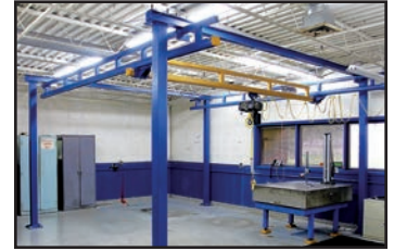
GORBEL FREE-STANDING CRANE SYSTEM

ALSO AVAILABLE: PEDESTAL GRINDERS, BUFFERS, WORK BENCHES, VISES, STEEL STORAGE SYSTEMS HEAVY-DUTY STOCK RACKS, PALLET RACKING, OFFICE FURNITURE AND MORE