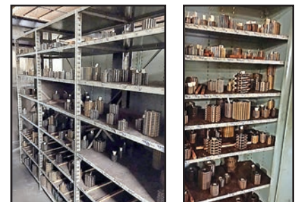
LARGE SELECTION OF GEAR HOBBS

View our current auction schedule at www.perfectionindustrial.com