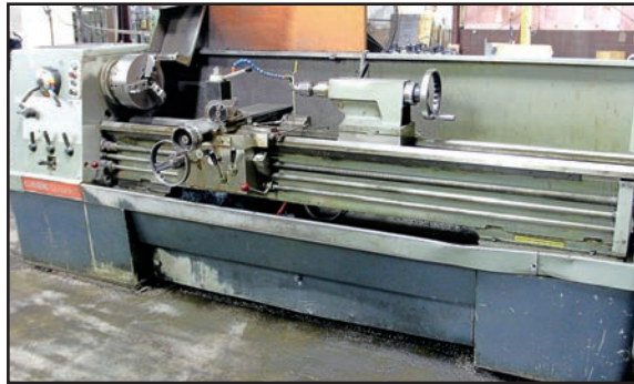
CLAUSING COLCHESTER 17" ENGINE LATHE

IKEGAI TT25 4-AXIS SLANT BED CNC LATHE , s/n 51617V, Fanuc Series 15-TT CNC Control, 21" Swing x 60" Between Centers, 10" 3-Jaw Chuck, 12-Position Upper and Lower Turrets