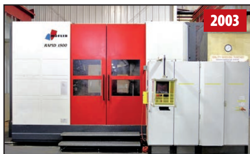
HOFLER RAPID 1500 7-AXIS CNC PROFILE GEAR GRINDER

Featuring: Gear Grinders, Gear Hobbers, Gear Shapers, Gear Shavers, Hob Sharpeners, Gear Hone, CNC Machine Tools, Tool Room Machinery, Grinding, Forklift, Cranes & More – Plus Real Estate Opportunity