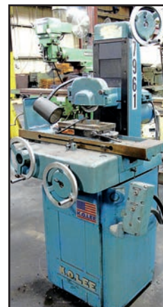
KO LEE 6 X 12 SURFACE GRINDER