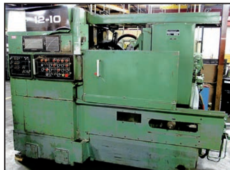
BARBER COLMAN 12-10 GEAR HOBBER