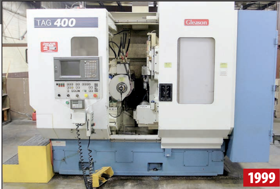
GLEASON TAG 400 CNC SPUR AND HELICAL GEAR GRINDER