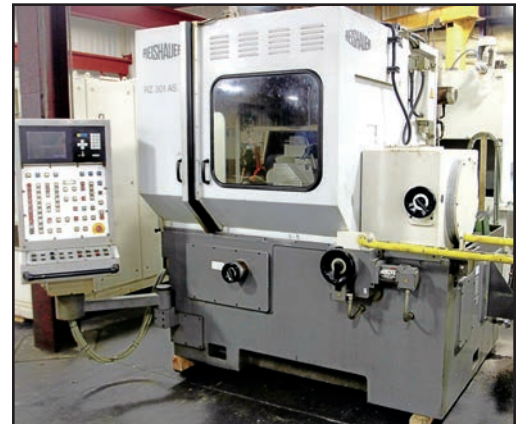
REISHAUER RZ301AS CNC GEAR GRINDER