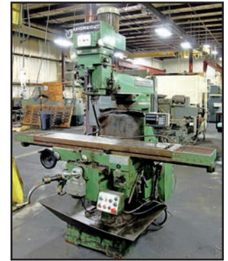
MICROCUT 5000VS VERTICAL MILLING MACHINE