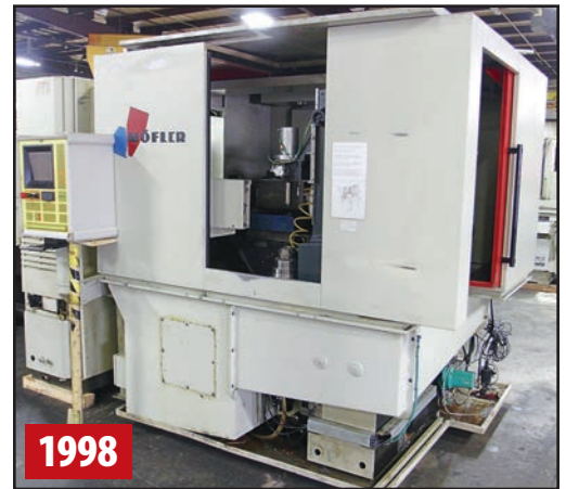
HOFLER HELIX 400 CNC GEAR GRINDER