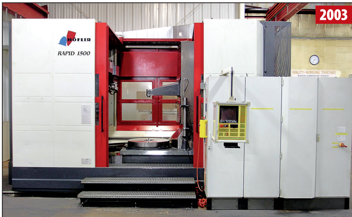
HOFLER RAPID 1500 7-AXIS CNC PROFILE GEAR GRINDER

Assets Surplus to the Continuing Operations of