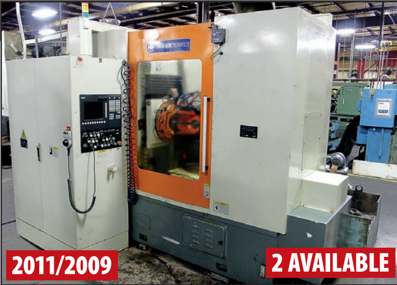
CHONGQING MACHINE TOOL YKB3180 CNC GEAR HOBBER