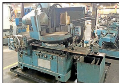
< HEALD 361 ROTARY SURFACE GRINDER

KO LEE 6" X 12" SURFACE GRINDER , s/n 25642WM