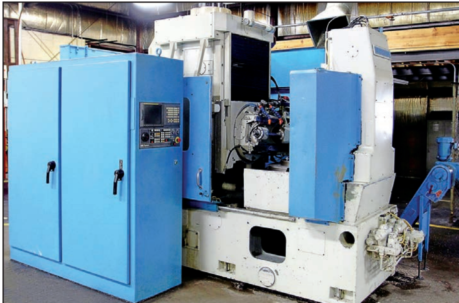
LIEBHERR L-652 5-AXIS CNC GEAR HOBBER

1982 REISHAUER RZ300E HIGH PRECISION GEAR GRINDER , s/n 5300-22, 11.8" Max. Tip Diameter, 39" Min. Root Diameter, 7.1" Max. Tooth Face, 16.5" Max. Chucking Length, 5.08" Max. Pitch, 5 Module