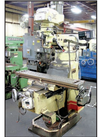
MICROCUT 1050 VERTICAL MILLING MACHINE