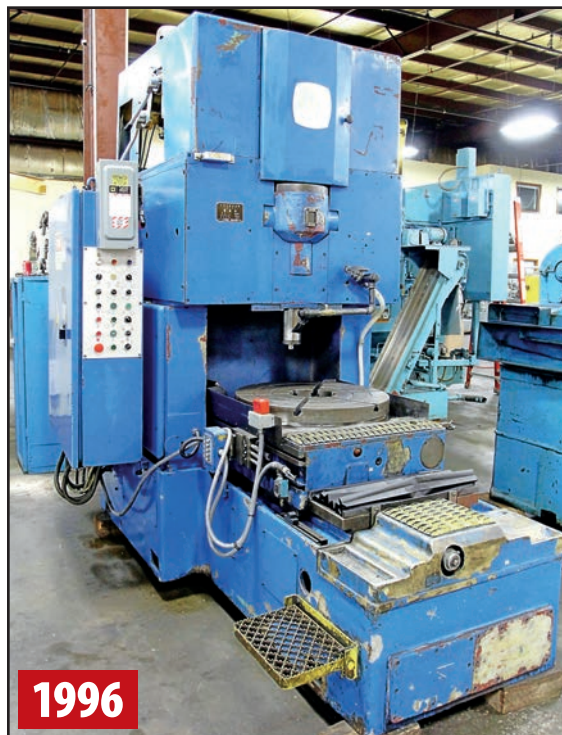
1996 CHANGJIANG Y5180A GEAR SHAPER