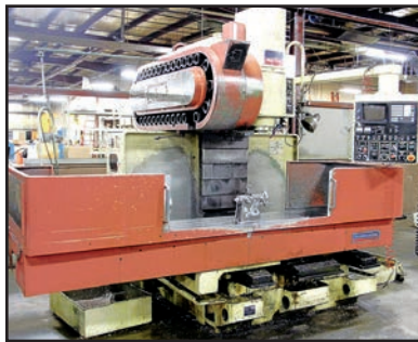
OKUMA & HOWA MILLAC 6VA CNC VERTICAL MACHINING CENTER