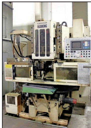
MITSUBISHI FA30CNC 4-AXIS CNC GEAR SHAVER