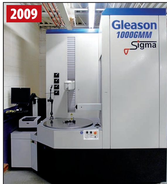
GLEASON 1000GMM SIGMA GEAR INSPECTION SYSTEM

Sale Date: Thursday, September 29, 2016 at 10:00 AM CDT Sale Location: 5876 Sandy Hollow Road, Rockford, Illinois 61109 Inspection: Wednesday, September 28, 2016 from 9:00 AM–4:00 PM CDT, or By Special Appointment