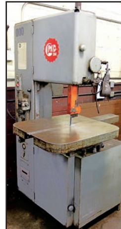
GROB 4V-18 VERTICAL BANDSAW