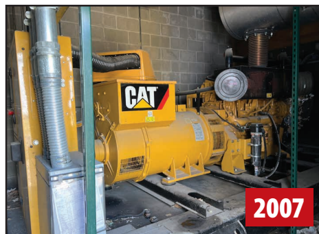
CATERPILLAR C18 GENERATOR SET