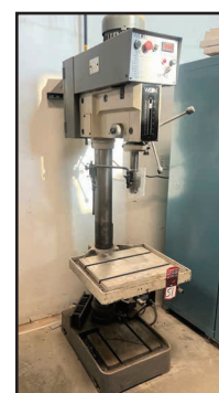
WILTON 20VS 2232AC DRILL PRESS