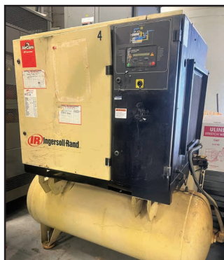
INGERSOLL RAND SSR-UP6-25-125 AIR COMPRESSOR