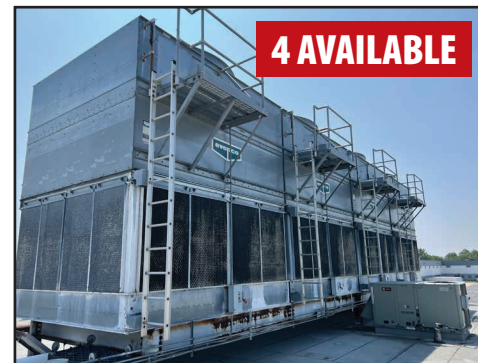
EVAPCO AT212-428 COOLING TOWER