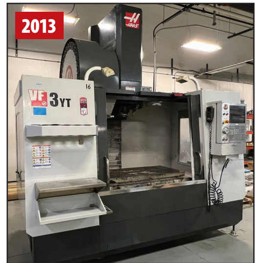
(1 OF 2) HAAS VF-3YT/50 VERTICAL MACHINING CENTER