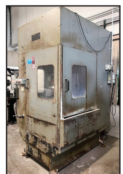
KALAMAZOO 30" CHOP SAW