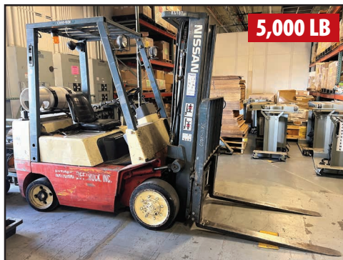
NISSAN CPJ02A25V LP FORKLIFT

WATER SYSTEM Featuring POLARIS S100IS353 Heat Exchanger, ALFA LAVAL MX25-BFG Heat Exchanger, (3) 100 HP Motors, (5) 75 HP Motors, Pumps, (6) 300-Line Control, w/ (4) EVAPCO AT212-428 Chiller Systems