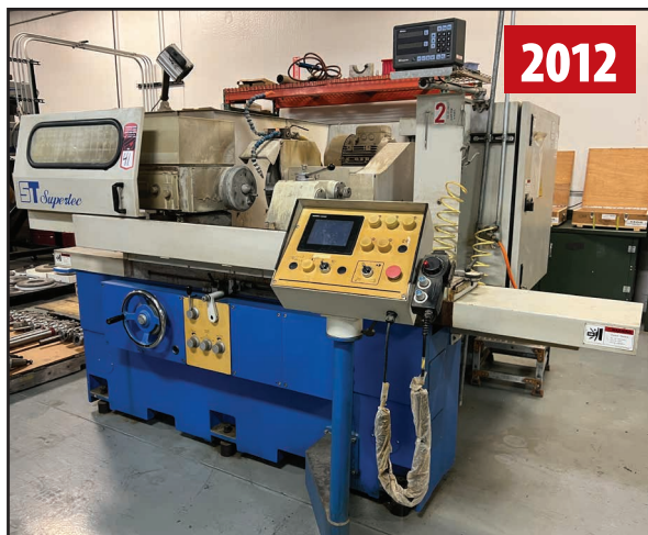
SUPERTEC G50P-60NC UNIVERSAL CYLINDRICAL GRINDER