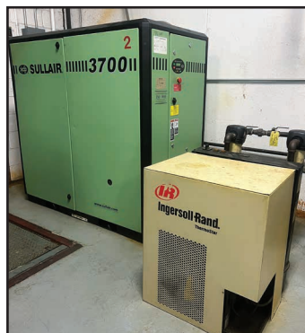
SULLAIR AIR COMPRESSOR & IR AIR DRYER