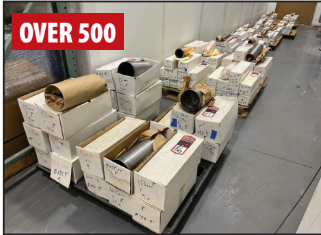
METAL BOND DIAMOND CORE DRILLS

HUGE AMOUNT OF INVENTORY: Sapphire Crystal Cores, Boules, Sasol, Dalian, and Thermal Shock