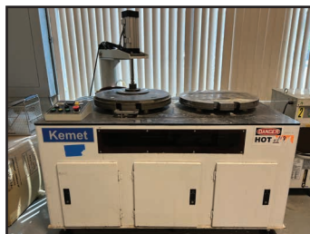
KEMET HT56 LAPPING MACHINE