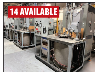
190 KG KYROPOULOS METHOD GROWTH FURNACE