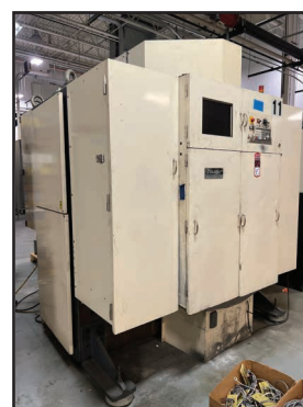
TAKATORI MWS-812SD DOWN CUT MULTI WIRE SAW