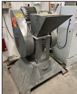
BICO 6" X 11" JAW CRUSHER