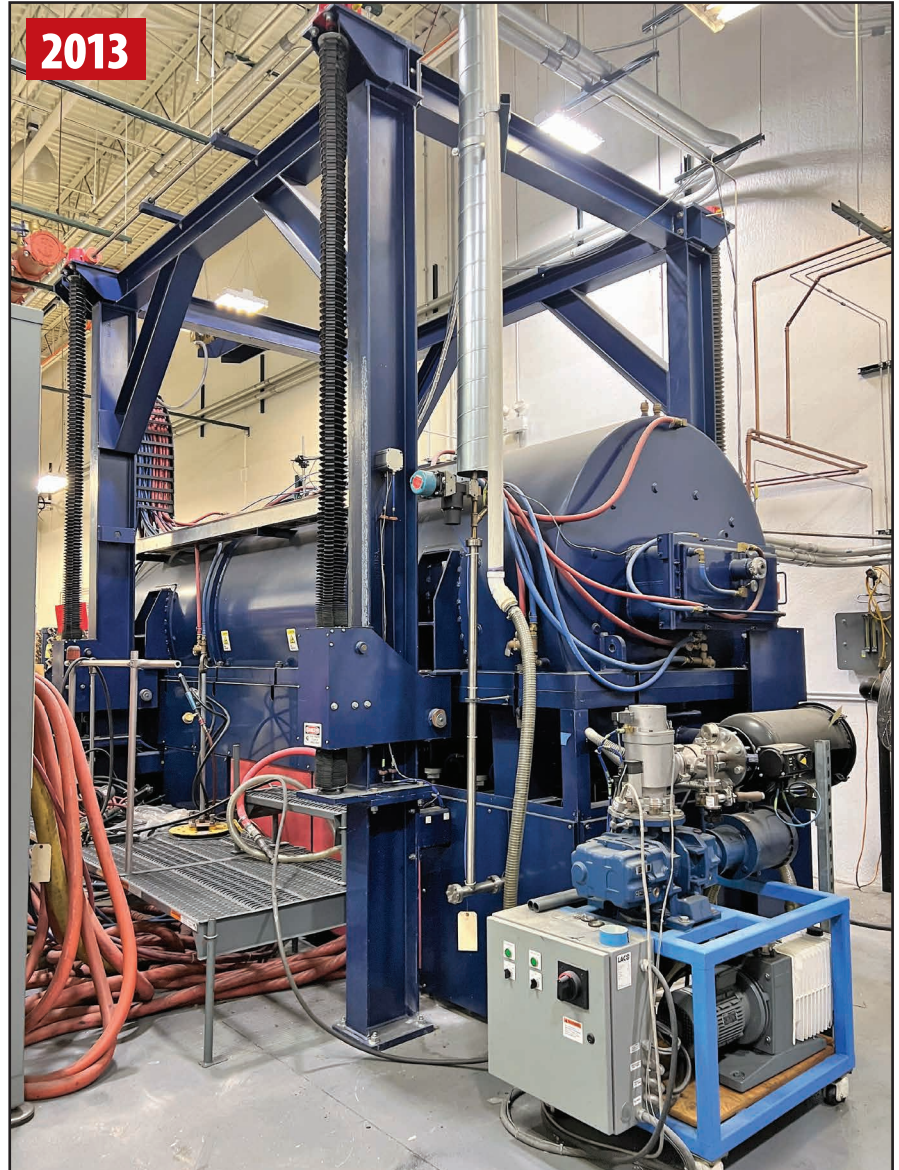
CENTORR VACUUM INDUSTRIES "LARGE AREA NET-SHAPE CRYSTAL EXTRACTION" GROWTH FURNACE

FEATURING: CENTORR VACUUM INDUSTRIES Crystal Growth Vacuum Furnace, Sapphire Growth Furnaces, Sapphire Boules, Sapphire Window Inventory, Sapphire Raw Material & WIP Inventory, (2) 2013 HAAS VF-3YT/50 VMC's, 2012 & 2008 SUPERTEC Cylindrical Grinders, Machine Tools, 2007 CAT 550kW Generator Set, Forklifts & Plant Support