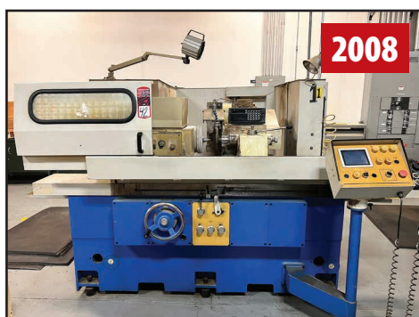
SUPERTEC G38P-60NC UNIVERSAL CYLINDRICAL GRINDER