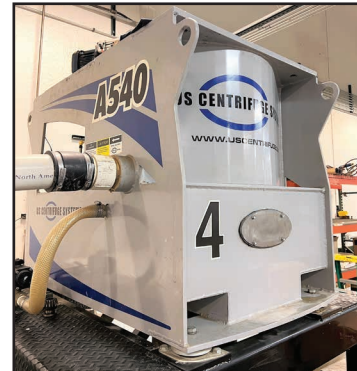
US CENTRIFUGE SYSTEMS A540 AUTOMATIC CENTRIFUGE SYSTEM