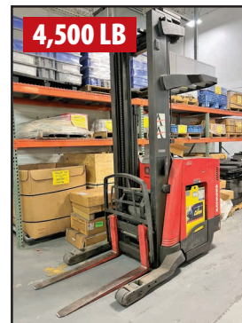
RAYMOND 7400 R45TT ELECTRIC REACH TRUCK