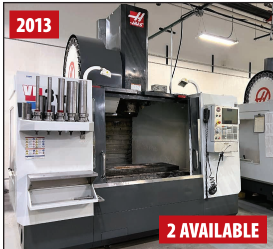
HAAS VF-3YT/50 VERTICAL MACHINING CENTERS