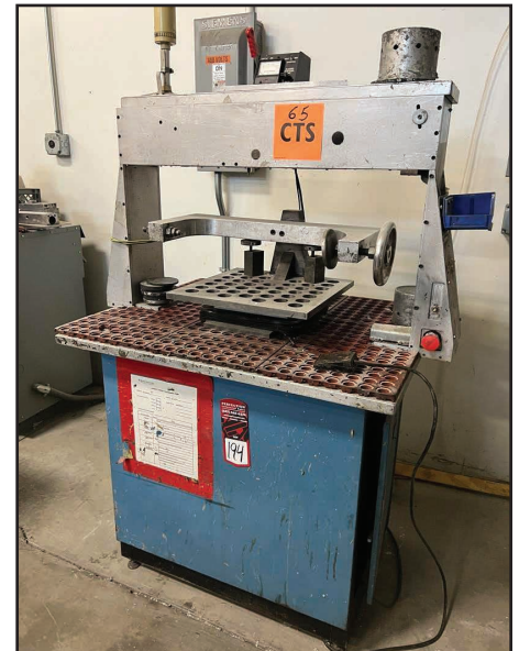
ALVORD SYSTEMS DO120-SZ56 PIEZOGONIOMETER