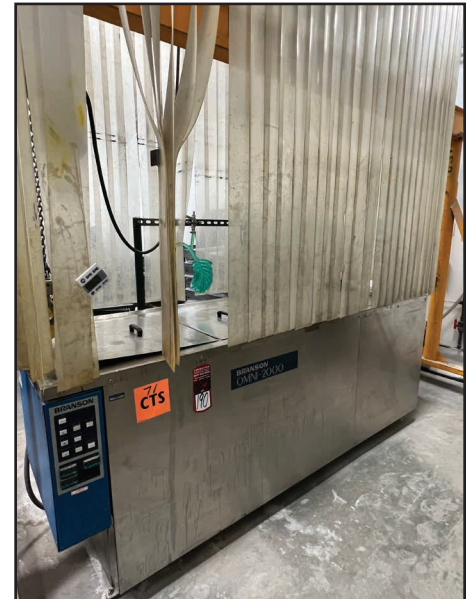
BRANSON OMNI-1620-40 AQUEOUS CLEANING SYSTEM

HUGE AMOUNT OF INVENTORY INCLUDING SAPPHIRE CRYSTAL CORES, BOULES, SASOL, DALIAN, AND THERMAL SHOCK