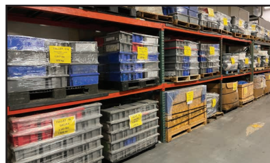
HUGE QTY OF SAPPHIRE BOULES, MATERIALS & INVENTORY

HUGE AMOUNT OF INVENTORY INCLUDING SAPPHIRE CRYSTAL CORES, BOULES, SASOL, DALIAN, AND THERMAL SHOCK