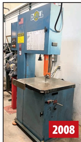
DO-ALL 2013-V3 VERTICAL BANDSAW