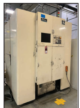
TAKATORI MWS-612SD DOWN CUT MULTI WIRE SAW