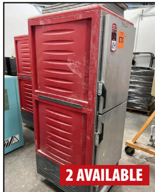
2 AVAILABLE 2010 METRO C5 3 SERIES HOLDING/PROOFING CABINET