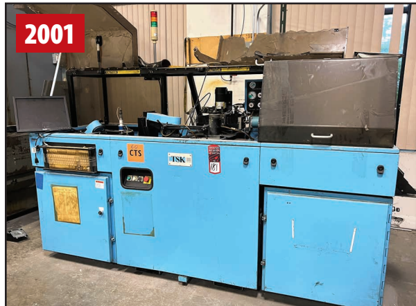
TSK EP-2600 EDGE GRINDER

BRANSON OMNI-1620 AQUEOUS CLEANING SYSTEM, s/n 01-1608-10