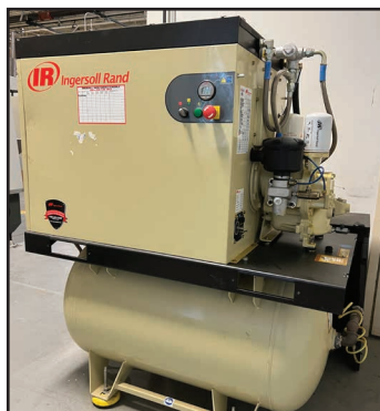
INGERSOLL RAND IRN7.5H-CC-115H AIR COMPRESSOR