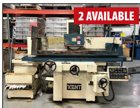
(1 OF 2) KENT KGS-84AHD AUTOMATIC PRECISION SURFACE GRINDERS