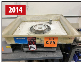
(1 OF 2) ATA SAPHIR 320 GRINDER POLISHER