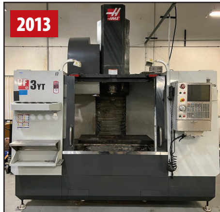
(1 OF 2) HAAS VF-3YT/50 VERTICAL MACHINING CENTER

ALSO: WILTON 20VS 2232AC Drill Press, s/n 8010451, 65-2000 RPM, 14-3/4" x 18" Table, SHOP FOX Drill Press, 8" x 29" Table, 120-2580 RPM, JET Base, KALAMAZOO 30" Chop Saw, 6" Vise, Enclosure, SCOTCHMAN CP0350 Cold Saw w/ Graymills Coolant, DAKE 25H H-Frame Press, s/n 191693, BALDOR 1022HD Pedestal Grinder, 1 HP, Table w/ Mounted WESTWARD 10" 5-Speed Drill Press and WESTWARD Bench Grinder, (2) DONALDSON TORIT DB-800 Downdraft Tables, 1.5 HP, 27" x 26" Working Area