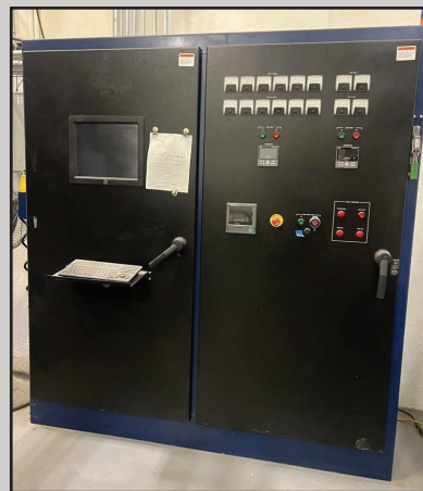
CENTORR VACUUM INDUSTRIES "LARGE AREA NET-SHAPE CRYSTAL EXTRACTION" GROWTH FURNACE