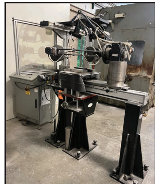
ALVORD SYSTEMS XFL BOULE X-RAY SYSTEM