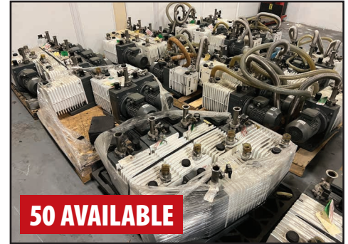
ADIXEN VACUUM PUMPS