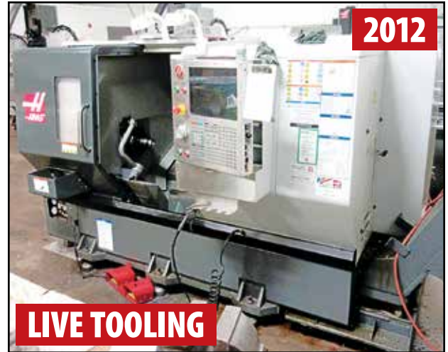
HAAS ST-20 TURNING CENTER