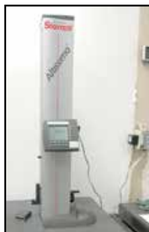
STARRETT ALTISSIMO DIGITAL HEIGHT GAUGE

Online Bidding at www.perfectionindustrial.com