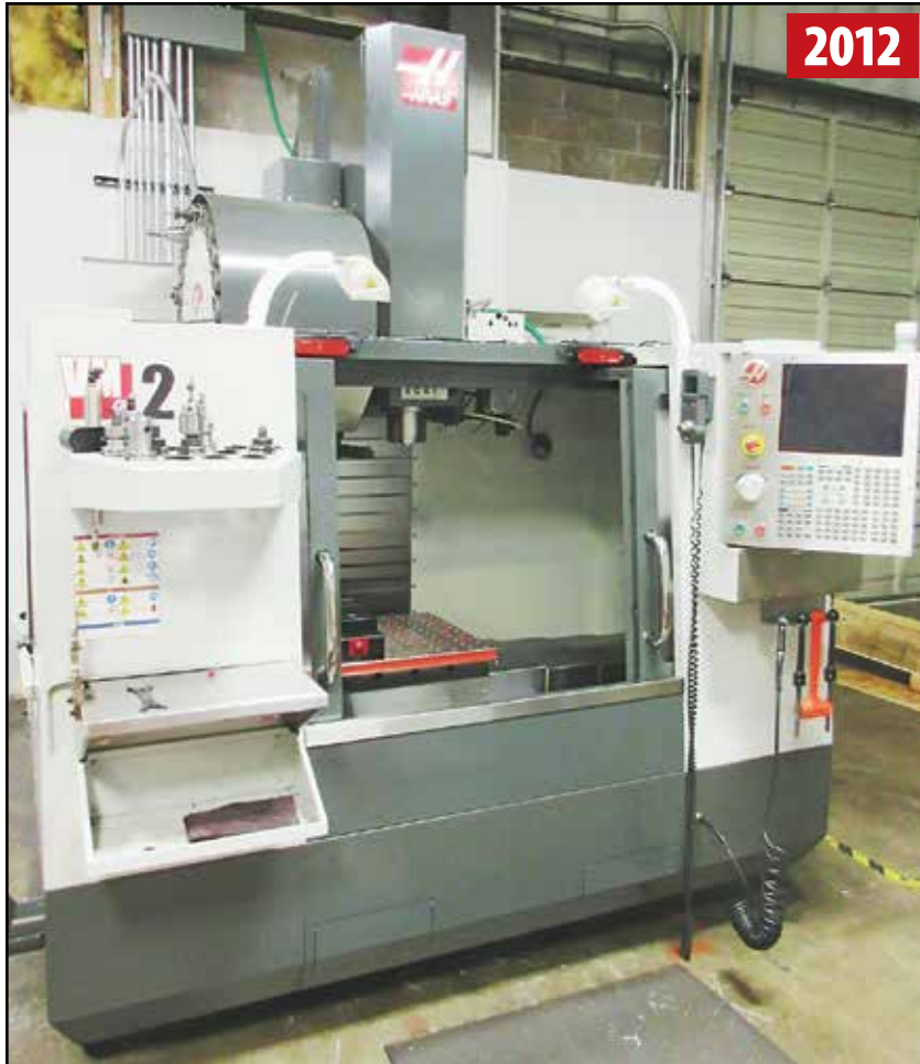
HAAS VM-2 VERTICAL MOLD-MAKING MACHINING CENTER

Featuring: (4) Vertical Machining Centers, Vertical Mold-Making Machining Center, (4) Turning Centers, CNC Machine Tools, Mills, Bandsaws, Drills, Grinders, CMM, Comparator, Inspection Equipment, Forklift, Air Compressor, Perishable Tooling, Factory Support & More