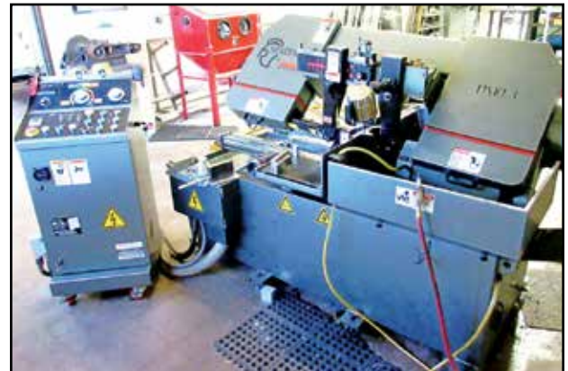
MARVEL SPARTAN PA10/3 AUTOMATIC HORIZONTAL BANDSAW

Sale Closing From: Thursday, August 18, 2016 at 11:00 AM MDT