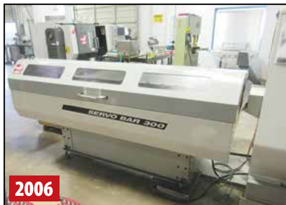
HAAS SERVO BAR 300 BAR FEED