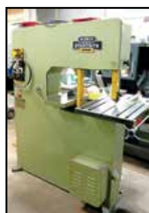
KALAMAZOO STARTRITE 30RWS VERTICAL BANDSAW