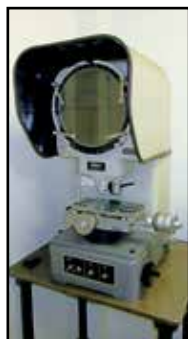
NIKON 6C-2 PROFILE PROJECTOR

MIYANO BNC-34 CNC LATHE , s/n BN30348C, w/Fanuc Control, Bar Feed