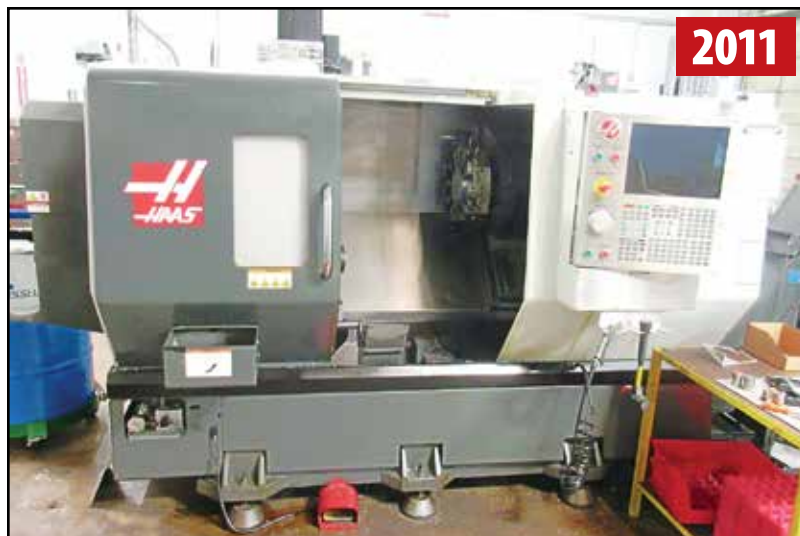
HAAS ST-20 TURNING CENTER