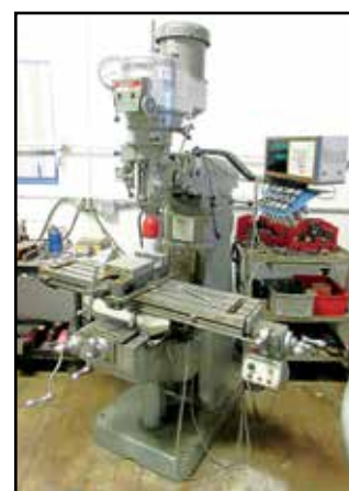
BRIDGEPORT SERIES I 2 HP MILL