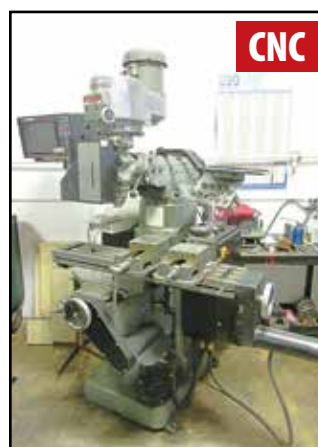
BRIDGEPORT SERIES I 2 HP CNC MILL

ALSO: DOUBLE-END GRINDERS, DRILL PRESSES, TABLE SAW, SHOT BLAST CABINETS, KURT VISES, ROTARY TABLES, 40-TAPER TOOL HOLDERS, ANGLE PLATES, LATHE TOOLING, PERISHABLE TOOLING, CLAMPING TOOLS, ETC.