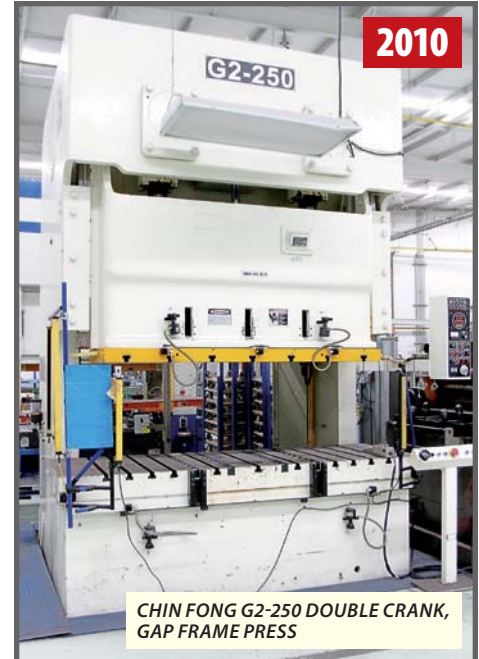
CHIN FONG G2-250 DOUBLE CRANK, GAP FRAME PRESS

Sale Date: Tuesday, June 24 at 10:00 AM PDT