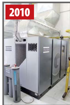
(2) 223 HP ATLAS COPCO GA160FF AIR COMPRESSORS