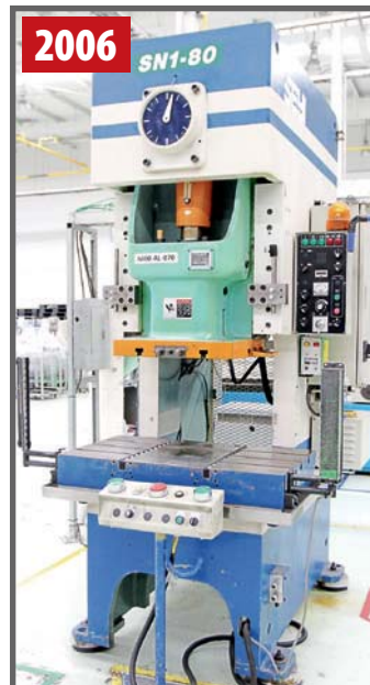
SEYI SN1-80 GAP FRAME PRESS