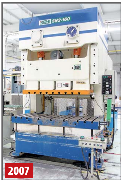
SEYI SN2-160 DOUBLE CRANK, GAP FRAME PRESS