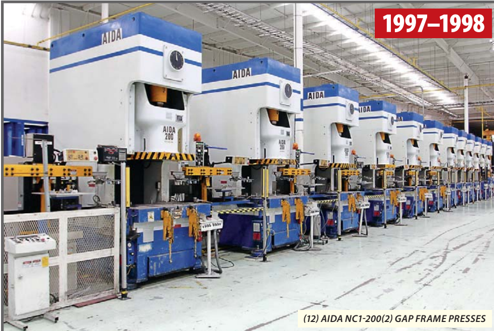
(12) AIDA NC1-200(2) GAP FRAME PRESSES