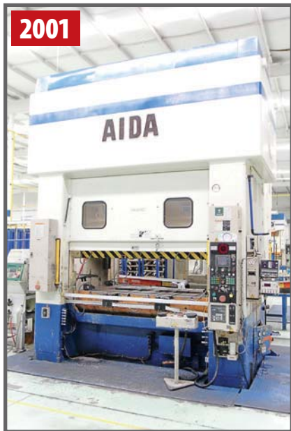
AIDA PMX-L2-3000 (1) STRAIGHT SIDE PRESS

> SODICK K1C HIGH-SPEED SMALL HOLE DRILL EDM