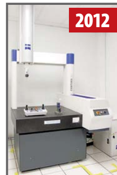
ZEISS CONTURA G2 CMM

Sale Date: Tuesday, June 24 at 10:00 AM PDT