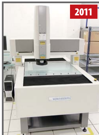
NIKON VMR-6555 VIDEO MEASURING SYSTEM