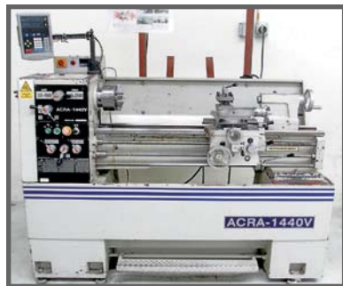
ACRA 1440V TOOL ROOM LATHE