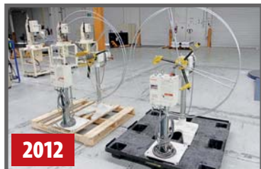
(2) FUTABA ARV100C AUTO COIL REELS