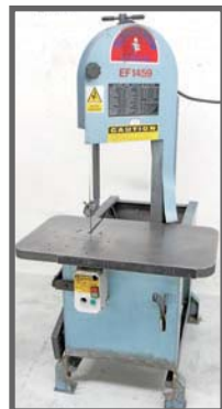
ROLL-IN SAW EF1459 VERTICAL BANDSAW