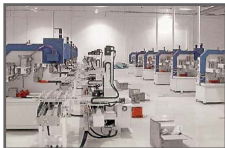
HAEGAR INSERTION MACHINES & SAILOR ROBOTS