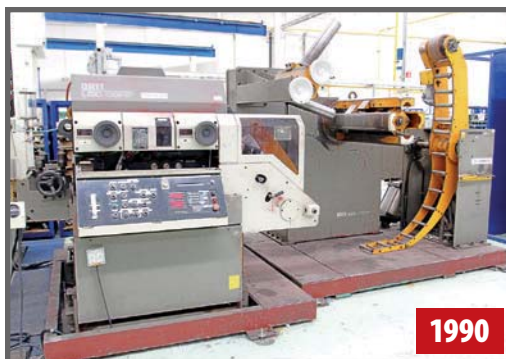
ORII LCC 08HP2JBX-YHS UNCOILER, STRAIGHTENER AND ROLL FEEDER