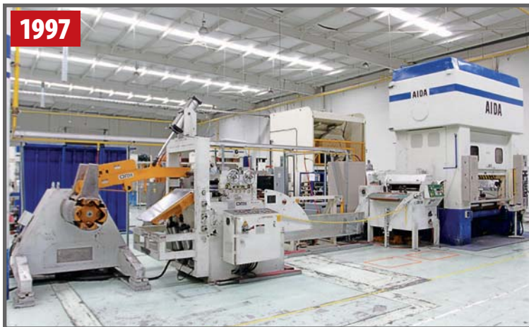
ORII MH-08HKA-DZK UNCOILER, LHJ08ACAB-X STRAIGHTENER, ACB08NAFX ROLL FEEDER