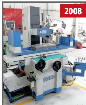
ACRA ASG-1020HS SURFACE GRINDER