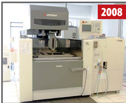
MITSUBISHI FA20S WIRE EDM