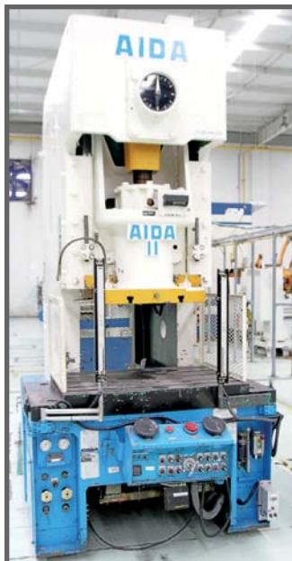
(2) AIDA C1-110(2) GAP FRAME PRESSES