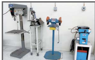
GRINDERS AND DRILLS