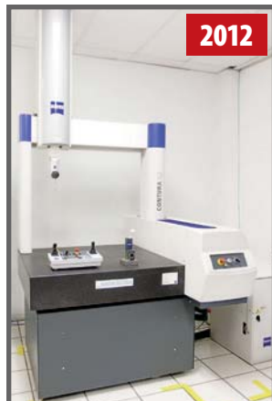
ZEISS CONTURA G2 CMM