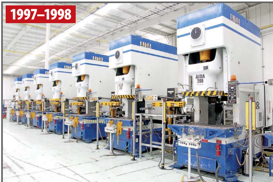
(7) AIDA NC1-200(2) GAP FRAME PRESS W/ORII TRANSFER ROBOTS