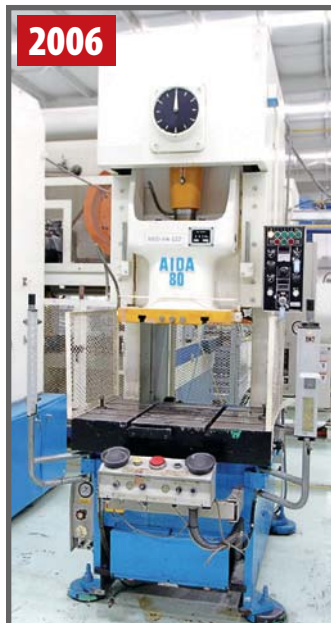
(2) AIDA NC1-80(2) GAP FRAME PRESSES