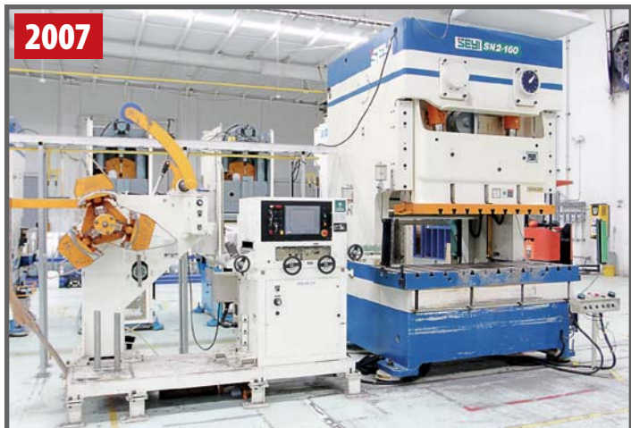
SEYI SN2-160 DOUBLE CRANK, GAP FRAME PRESS AND COIL LINE