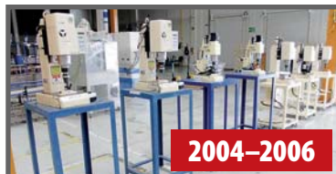
(7) YOSHIKAWA US-66 AND US-1 RIVETING MACHINES