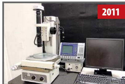
NIKON MM-400 MICROSCOPE