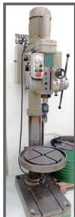
> KIWA KUB-560FS DRILL PRESS