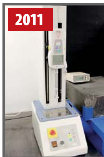
IMADA MX-5000N-E FORCE MEASURING MACHINE