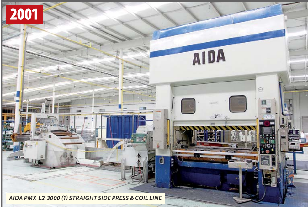
AIDA PMX-L2-3000 (1) STRAIGHT SIDE PRESS & COIL LINE