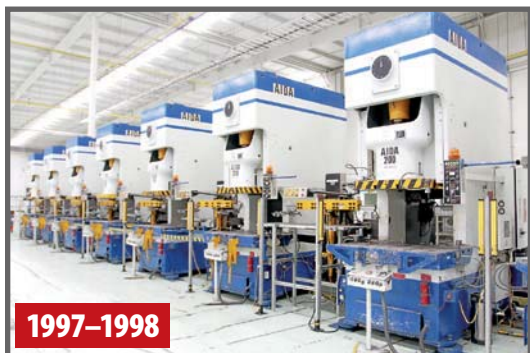
(7) AIDA NC1-200(2) GAP FRAME PRESS W/ORII TRANSFER ROBOTS

COMPLETE FACILITY CLOSURE OF ELECTRONIC PARTS MFR.