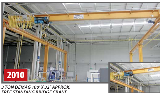
3 TON DEMAG 100' X 32" APPROX. FREE STANDING BRIDGE CRANE

LANTECH Q300 STRETCH WRAPPING MACHINE, S/N QM029414, (2012), 65" Dia. Table 120V, Single Phase