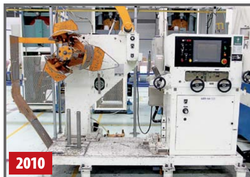
AIDA LFL-300E UNCOILER, STRAIGHTENER AND ROLL FEEDER

275 TON CHIN FONG G2-250 DOUBLE CRANK GAP FRAME PRESSES , S/N B00926, (2010), 11.02" Slide Stroke, 20-35 SPM, 21.65" Die Height, 4.72" Slide Adjustment, 82.67" x 27.55" Slide Area, 106.29" x 31.49" Bolster Area, 30 HP Main Motor