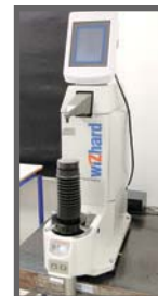
MITUTOYO WIZHARD HARDNESS TESTER