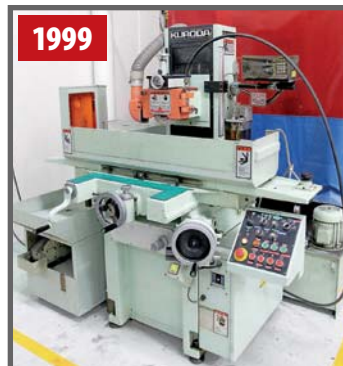
KURODA GS-BMHFL SURFACE GRINDER