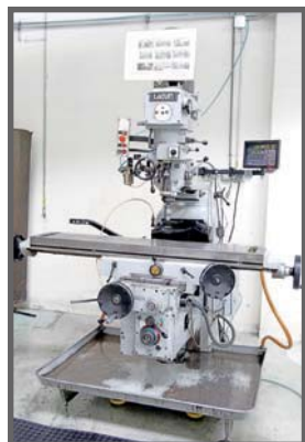
< LAGUN FTV-4L VERTICAL MILLING MACHINE