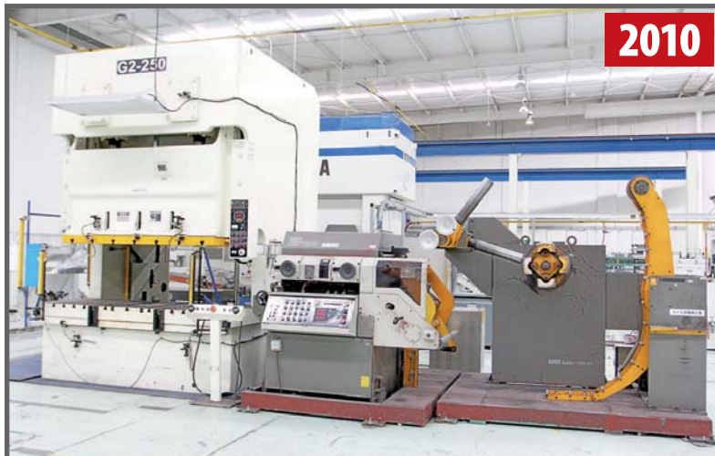
CHIN FONG G2-250 DOUBLE CRANK, GAP FRAME PRESS AND COIL LINE

(12) 220 TON AIDA NC1-200(2) GAP FRAME PRESSES, (1997–1998), 9.84" Slide Stroke, 25–45 SPM, 17.71" Die Height, 4.33" Slide Adjustment, 34.6" x 25.6" Slide Area, 54.7" x 33" Bolster Area, (7) with Cushions, Hydraulic Clamping, Die Rails, 20 HP Main Motor, w/(7) ORII RY-120L-2GS Transfer Robots