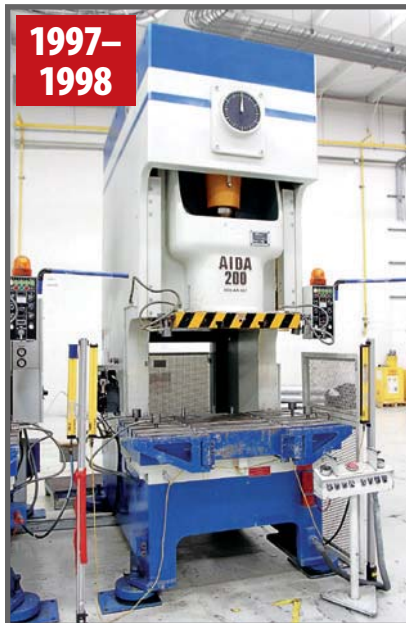
(12) AIDA NC1-200(2) GAP FRAME PRESSES