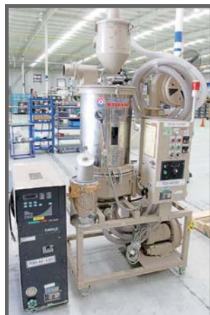
NISSUI KAKO NB-045-222 HOPPER/DRYER