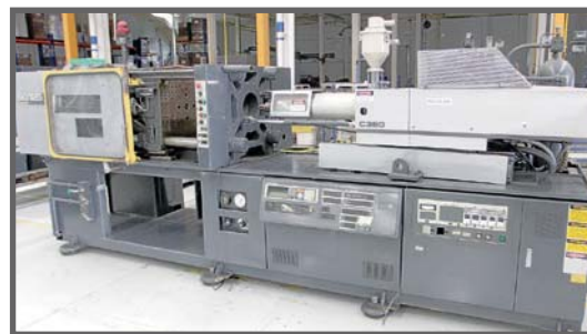
125 TON SUMITOMO SG125-HIIR0-M11A INJECTION MOLDING MACHINE