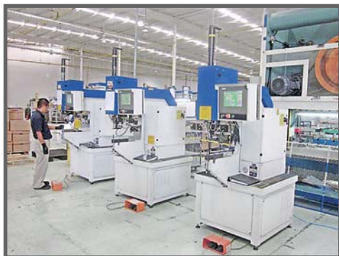
HAEGER 824 INSERTION MACHINES