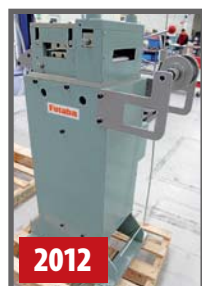
FUTABA UR-150-2 LEVELER