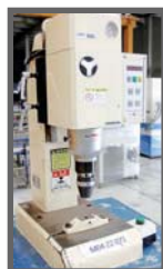
YOSHIKAWA US-66 RIVETING MACHINE