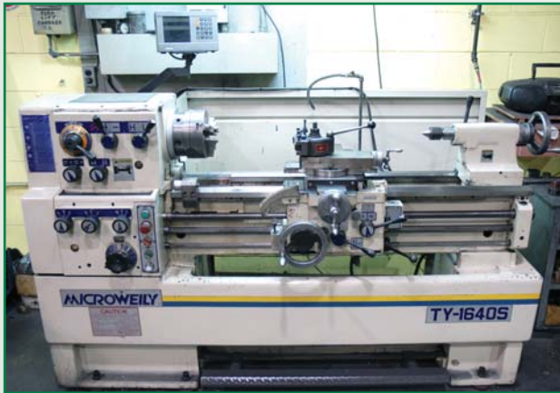
MICROWEILY GAP BED LATHE MODEL TY-1640S