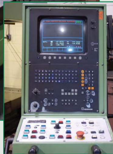
HEIDENHAIN 426 CNC CONTROL

1997 ALESA MONTI FT50TG CNC Universal Table Type Boring Mill, Control: Heidenhain 426; Axis Travels: X = 3,000 mm (118.11"), Y = 2,000 mm (78.74"), Z = 1,000 mm (39.37"), W Axis = 1500 mm (59.06"), Rotary Table Size: 71" x 63", Full B Axis (360,000 Degree Positions), Max. Table Load 7,000 kg (15,432 lbs), Spindle 50 Taper, 5" Spindle, Max. Spindle Speed 2,000 RPM, Universal Head Attachment, EATA Equipaggiamenti Chiller Model CRIO 6/AMO 969, S/N. 332 0697