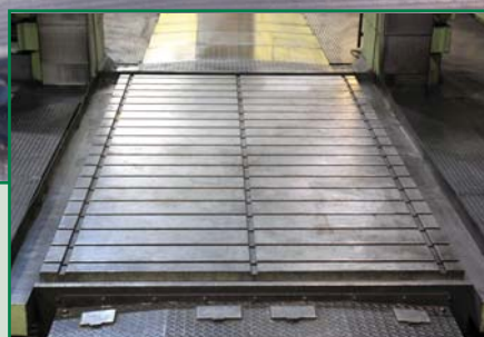
OKUMA MODEL MCR-B TABLE AREA