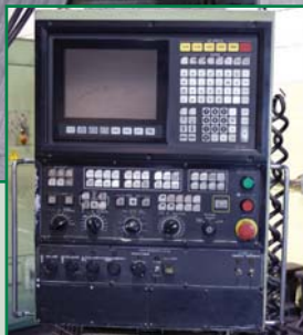
OKUMA MODEL MCR-B CNC CONTROLS