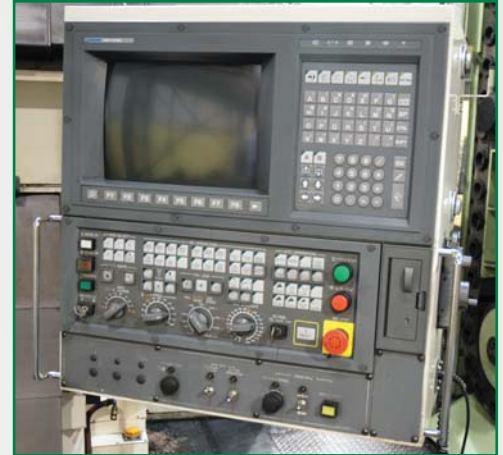
OKUMA OSP-U 100L CNC CONTROL