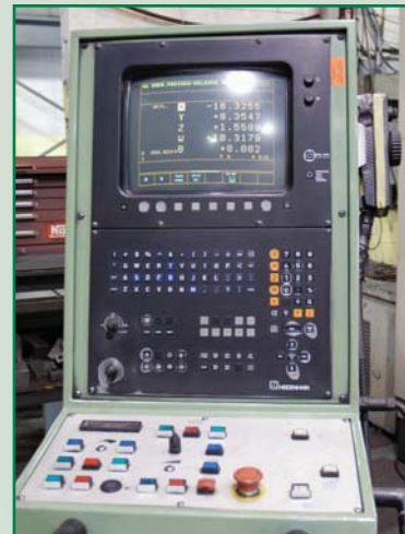
HEIDENHAIN TNC 426 CNC CONTROL