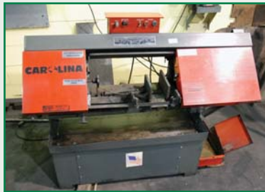
CAROLINA BANDSAW MODEL LDC 814