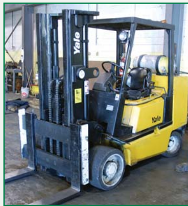
YALE 12,000 LB FORKLIFT, MODEL GLC 120 MGN/GAF 085