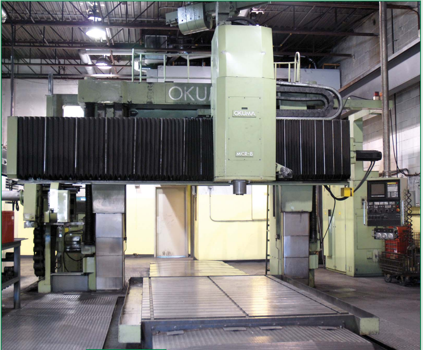
OKUMA MCR-B CNC DOUBLE COLUMN VERTICAL MACHINING CENTER