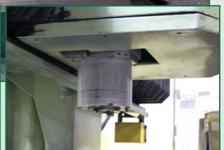
OKUMA MODEL MCR-B SPINDLE

1991 OKUMA MCR-B 25 X 40 CNC Double Column Vertical Machining Center, Control: OSP5020M; Axis Travels: X = 157.5", Y = 118.11", Z (Quill) = 27.55", W (Rail) = 37.40", Table Size 78.74" x 161", Table Load Capacity 48,400 lbs., Feed Rates (X,Y,Z) 04 ~ 157 IPM, Rapid Traverse (X,Y) = 394 IPM, Rapid Traverse Z = 295 IPM, Distance Between Columns 100.39", Spindle Speed Range 30 ~ 6,000 RPM, Spindle 50 Taper, Distance Spindle Nose to Table 0 ~ 63.97", 32 Station ATC, Tool Life Management, Tool Offset, RS 232 C, Coolant System, Tool Offset, Helical Interpolation, Chip Conveyor, Hi 2NC, Memory-2560 Meters, Spindle Motor Power 40/30 HP, S/N. 0079