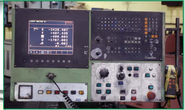
HEIDENHAIN TNC 407 CNC CONTROL