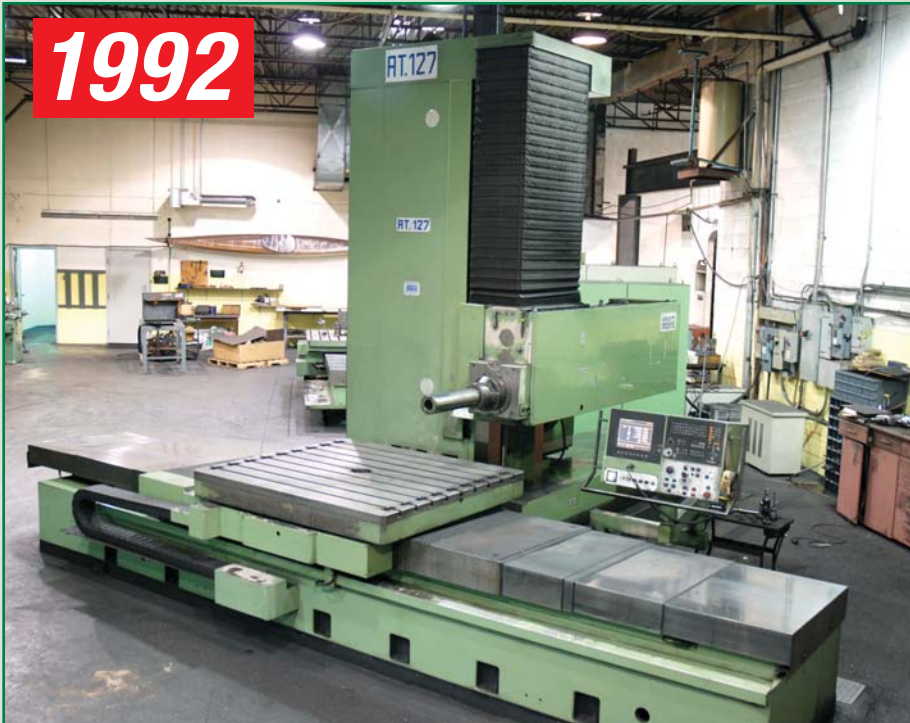
ALESA MONTI MODEL AT127