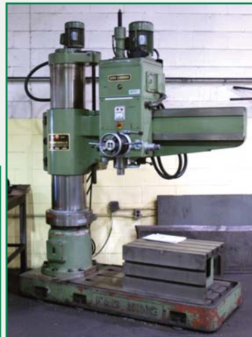
KAO MING 4' RADIAL ARM DRILL, MODEL KMR 1250 DH