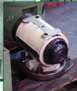
RIGHT ANGLE HEAD

2000 OKUMA MCV-A II 20 X 40 CNC Double Column Vertical Machining Center, Control: OSP-U 100L; Axis Travels: X = 157.5", Y = 78.74", Z (Quill) = 17.71", W (Rail) = 45.28", Table Size 59" x 149.5", Table Load Capacity 26,400 lbs., Feed Rates (X,Y) = .04 ~ 157 IPM, Rapid Traverse (X,Y) = 787 IPM, (Z) = 393 IPM, Distance Between Columns 80.70", Spindle Speed Range 40 ~ 6,000 RPM, Spindle 50 Taper, Distance Spindle Nose to Table 0 ~ 59.4", 24 Station ATC, Tool Offset-300, RS 232 C, Coolant System, Graphic Function, Rigid Tapping, Helical Interpolation, Auto Rail Positioning, Memory-2560 Meters, Spindle Motor Power 30/25 HP, Accessories: W/ 90 Degree Right Angle Head Attachment (Max. 600 RPM of 90 Degree Head), S/N. 2585