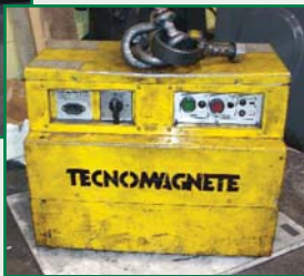
TECHNOMAGNETE ELECTRIC LIFT MAGNET MODEL BAT-GRIP 300