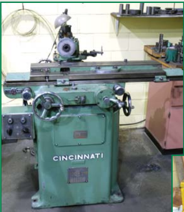
CINCINNATI HORIZONTAL MILL MODEL NO 2