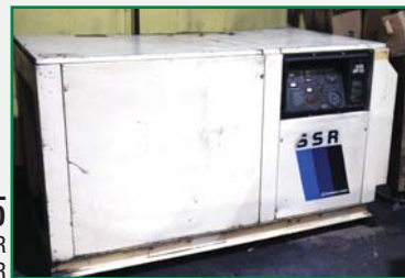
INGERSOLL RAND 50HP AIR COMPRESSOR