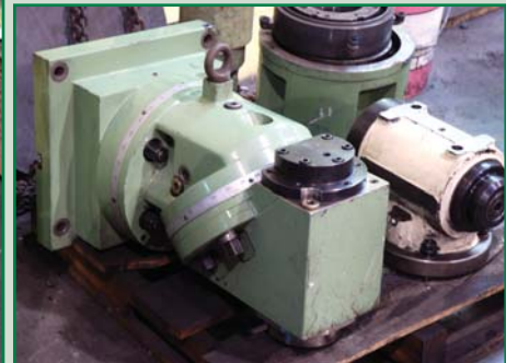
ALESA MONTI UNIVERSAL HEAD

1992 ALESA MONTI AT 127 CNC Universal Table Type Boring Mill, Control: Heidenhain TNC 407; Axis Travels: X = 4,000 mm (157.48"), Y = 2,000 mm (78.74"), Z = 700mm (27.56"), W = 1700mm (66.93"), Rotary Table Size: 59" x 65", Full B Axis (360,000 Degree Positions), Max. Table Load 7,000 kg (15,432 lbs), Spindle Taper 50, 5" Spindle, Spindle Speed Range 350 ~ 1,300 RPM, Universal Head Attachment, Euro Cold Cooling System, S/N. 2701409