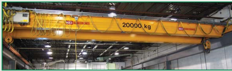
KONE 20 TON OVERHEAD CRANE