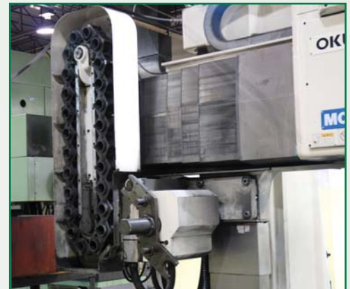
24 STATION ATC