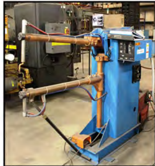
LORS / TJ SNOW 150AR 50 KVA ROCKER ARM SPOT WELDER

(6) NISSAN and TOYOTA Forklifts (All in Need of Repair); DETROIT HOIST 1/2 Ton Floor Standing Jib Crane w/ CM Valustar Electric Chain Hoist; WOOD'S POWR-GRIP 250-Lb. Capacity Vacuum Type Sheet Lifter Attachment, (4) Vacuum Pods; Over 60 Sections Adjustable Pallet Racking, Roller Conveyor, Overhead Monorail Conveyor System (Disassembled), Material Handling, Work Stations, Tool & Material Carts, Scissors Lift Tables, Self-Dumping Hoppers, Rolling Step Ladders, Worktables, Paint Spray