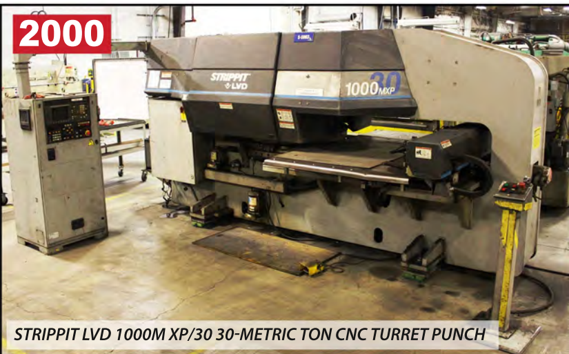
STRIPPIT LVD 1000M XP/30 30-METRIC TON CNC TURRET PUNCH