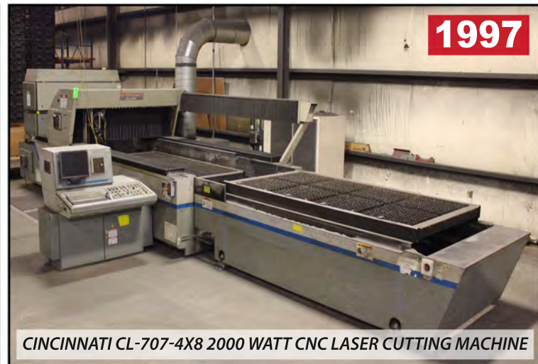
CINCINNATI CL-707-4X8 2000 WATT CNC LASER CUTTING MACHINE

Sale Closing From: Thursday, February 9 th , 2017, 1PM ET Sale Location: 62 Vermont Castings Road, Bethel, VT 05032 Inspection: Wednesday, February 8 th , 2017 or by Appointment