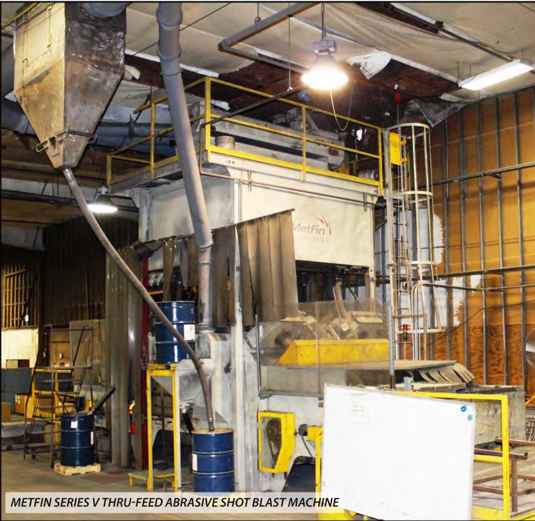
METFIN SERIES V THRU-FEED ABRASIVE SHOT BLAST MACHINE

GREAT OFFERING OF SHOT BLAST, CNC LASER, TURRET PUNCHES, CNC PRESS BRAKES, TOOLING, TOOL ROOM MACHINES, MATERIAL HANDLING, SHEET STOCK & MORE