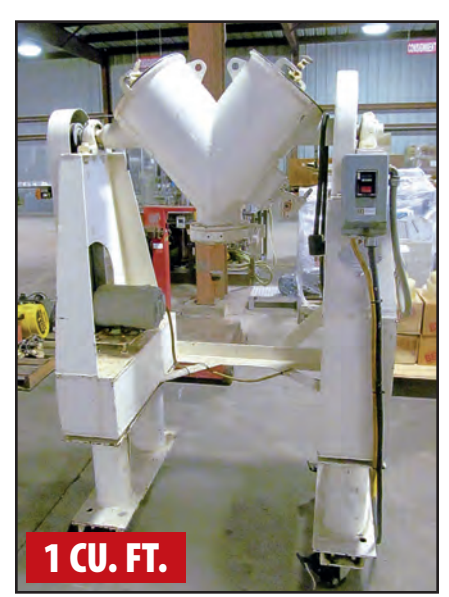
PATTERSON-KELLEY CROSS-FLOW TWIN SHELL BLENDER

200 CU. FT. PATTERSON-KELLEY CROSS-FLOW TWIN SHELL BLENDER, s/n C428953, Stainless Steel Construction, Rated 60 Lbs/Cu. Ft. Max. Material Density, 25 HP Motor Drive, 12" Discharge w/Manual Butterfly Valve, Standard Feed Ports w/Solid Covers, on Legs w/Control Panel, Approx. 14" Discharge Height