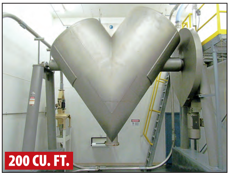
PATTERSON-KELLEY CROSS-FLOW TWIN SHELL BLENDER

FEATURING: Twin Shell Blenders, Mateer Rotary Auger Powder Filling Line, Shionogi Capsule Bander, Zanasi Capsule Filler, Bartelt & Volpak Form Fill & Seal Units, IAC Bag Dump Stations, Case Sealers, (8) Hyster, Raymond & Yale Standup Forklifts, Dust Collection Systems & Plant Support