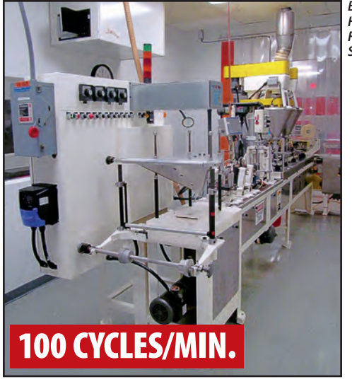
BARTELT IM-7 HORIZONTAL FORM FILL AND SEAL MACHINE