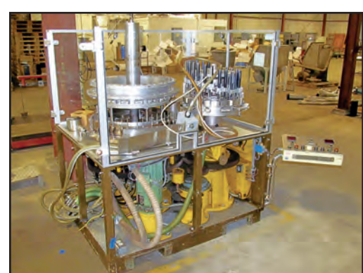
ZANASI 2500R2 HARD GELATIN CAPSULE FILLER