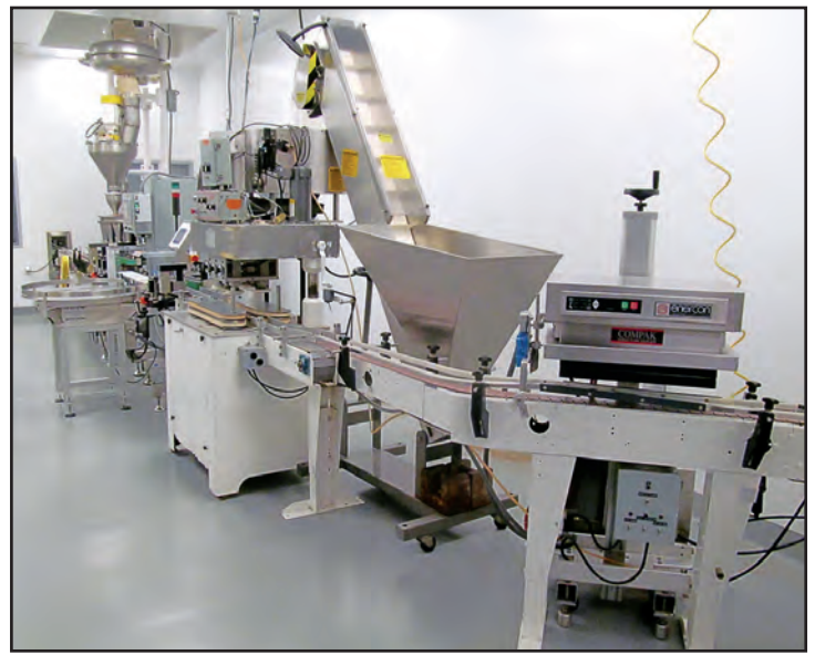
MATEER 34-B ROTARY AUGER POWDER FILLING LINE