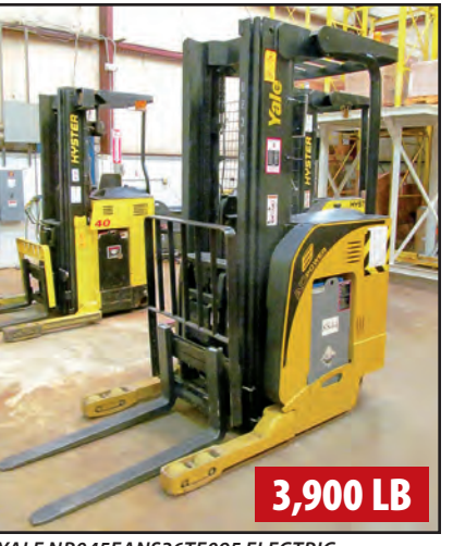
YALE NR045EANS36TE095 ELECTRIC ORDER PICKER