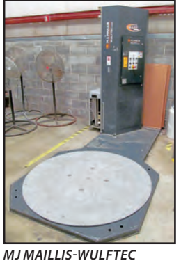
MJ MAILLIS-WULFTEC WSML-150-B STRETCH WRAPPER