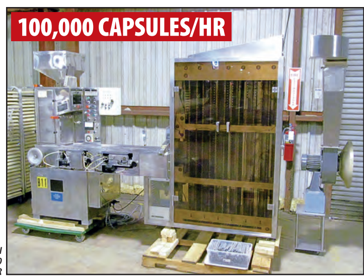
SHIONOGI QUALICAPS S-100 CAPSULE BANDER

Sale Closing From: Thursday, September 20th at 1:00 PM ET