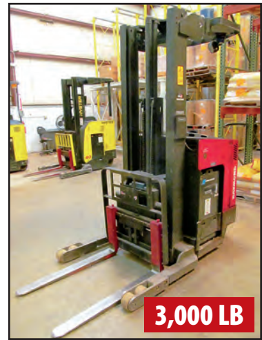
RAYMOND EASI R30TT ELECTRIC ORDER PICKER