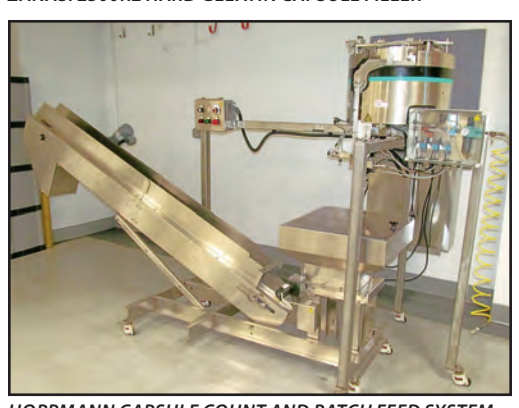
HOPPMANN CAPSULE COUNT AND BATCH FEED SYSTEM