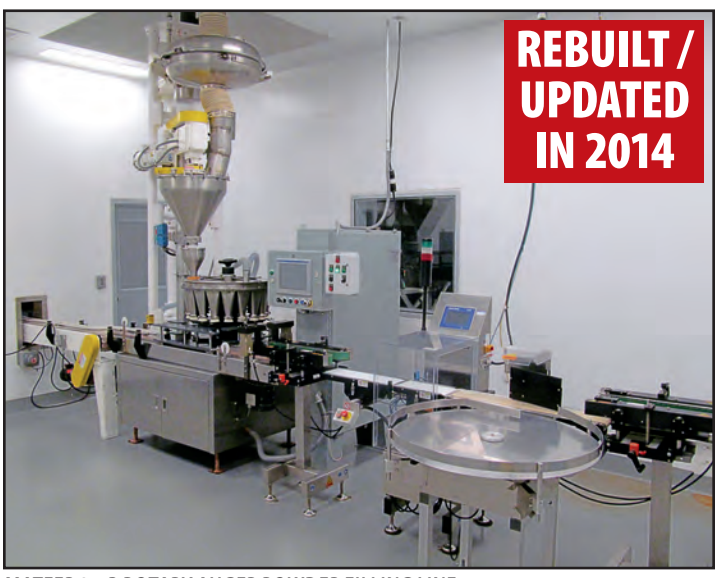
MATEER 34-B ROTARY AUGER POWDER FILLING LINE