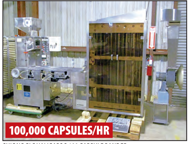
SHIONOGI QUALICAPS S-100 CAPSULE BANDER