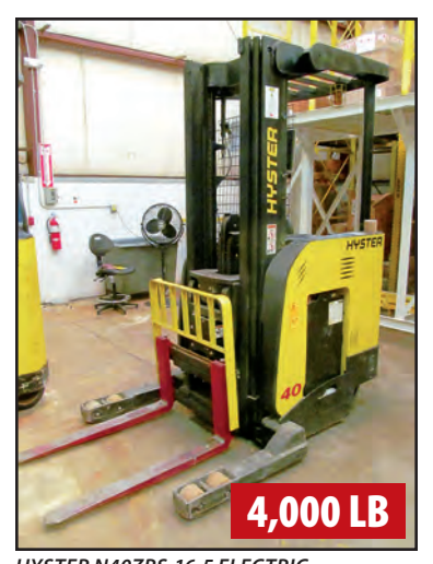
HYSTER N40ZRS-16.5 ELECTRIC ORDER PICKER