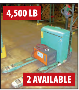
MITSUBISHI PMW23N ELECTRIC PALLET JACK