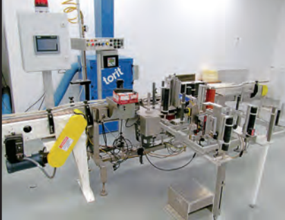
ACCRAPLY 35PW WRAP AROUND LABELER