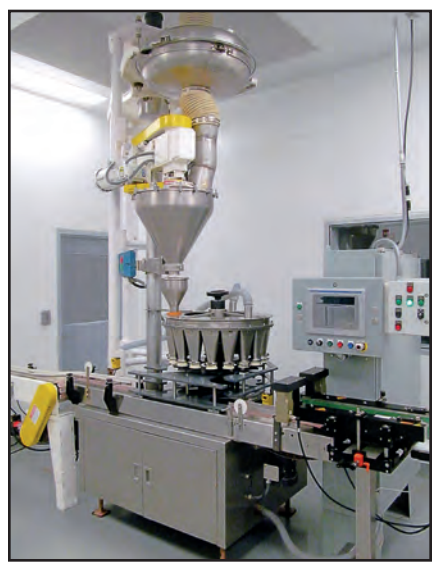
MATEER 34-B SINGLE HEAD ROTARY AUGER FILLER