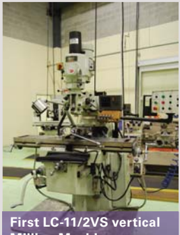
Milling Machine, s/n 40901693