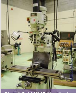
First LC-11/2VS Vertical Milling Machine, s/n 41028942