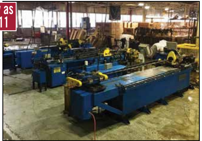
(10) EATON LEONARD, ALPINE, KEINS, HORN (HMT) & PINES CNC Tube Benders