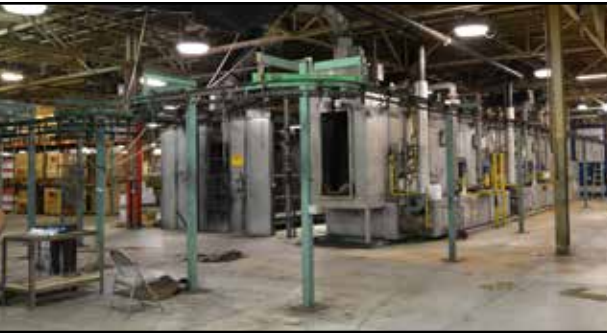
CINCINNATI Paint Line