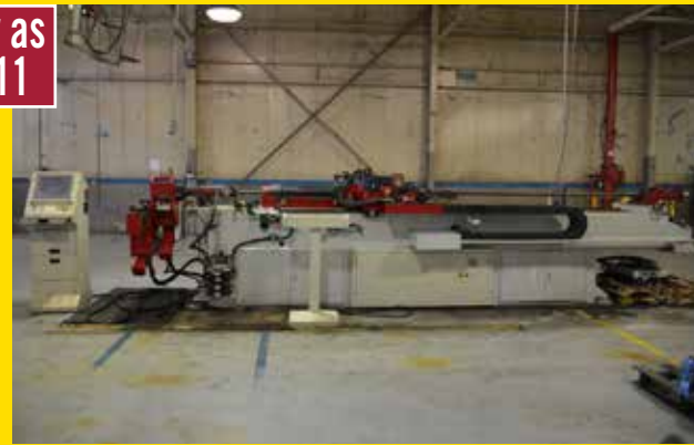
(10) EATON LEONARD, ALPINE, KEINS, HORN (HMT) & PINES Tube Benders