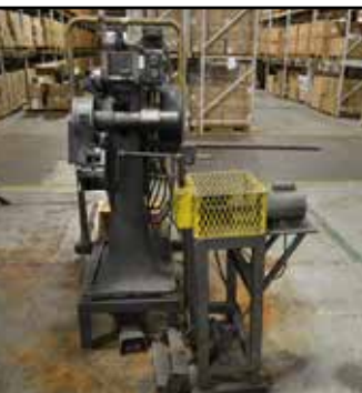
CONTINENTAL Vertical Tube Cutoff Saw