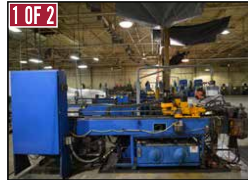
(2) EATON LEONARD Tulip-42 1.75" CNC Tube Benders