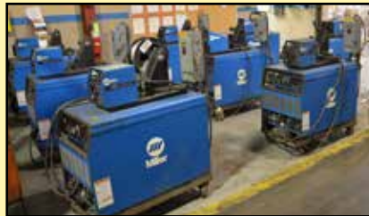
(35+) MILLER & LINCOLN Welders