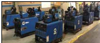
(35+) MILLER & LINCOLN Welders