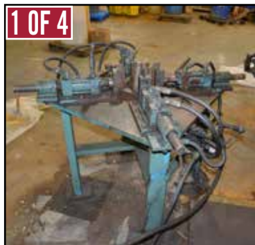
(4) Ram Hydraulic Horizontal Pipe Flangers

S/N 09L23261B, Bendpro G2 Control, Foot Switch, 174.5" Rod Length, Hoffman Hydraulic Cooling System PINES 2" Hyd , S/N 11290-68305, 12' Bed Hydraulic, Dual Ram Swivel, Back Single Bender on Casters Lots of Bender Tooling