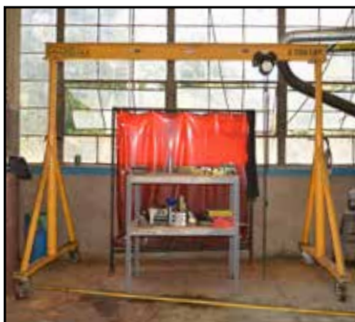
CALDWELL 2-Ton H-Frame Hoist