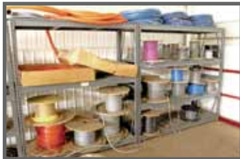
VIEW OF CABLE