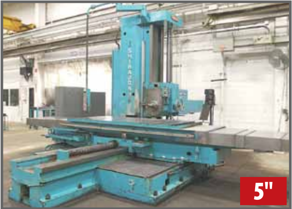
SHIBURA BFT 13C W2 BORING MILL