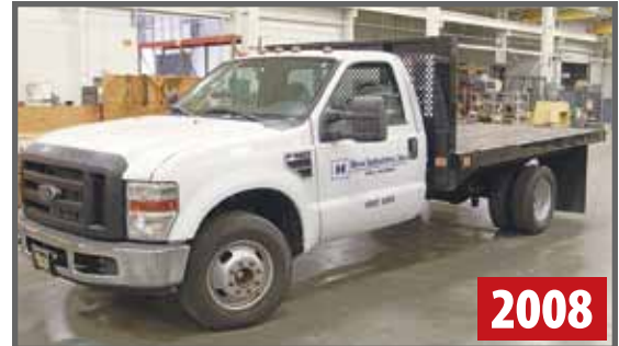
FORD F-350 SUPER DUTY STAKE TRUCK