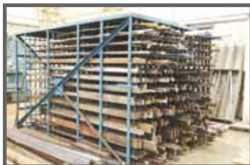
VIEW OF TOOL STEEL