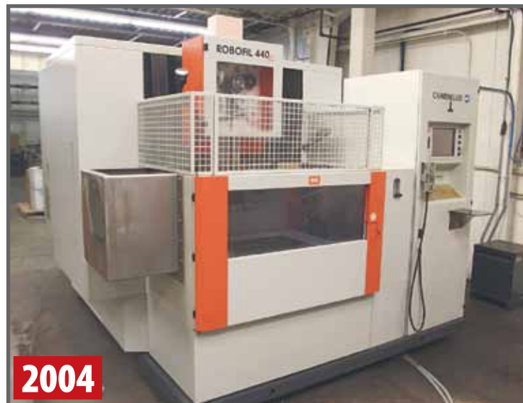
CHARILLES ROBOFIL 440CC WIRE EDM