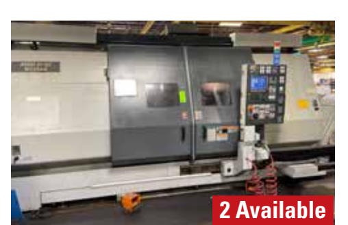
MORI SEIKI MT2500S/1500 CNC TURNING CENTER