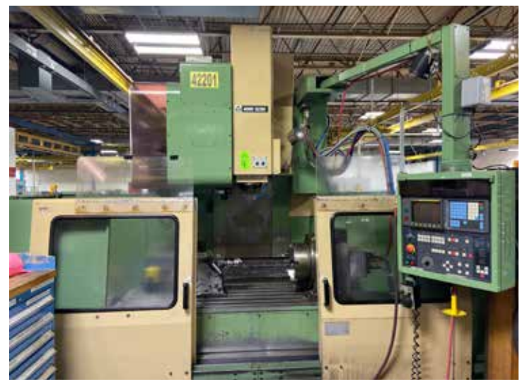
MORI SEIKI MV65 VERTICAL MACHINING CENTER

MAKINO FNC 128 VMC, s/n LM3-063; 49" X, 31" Y, 27" Z, 32" x 75" Table, 34" Under Spindle, 60-ATC (CAT50), Tsudakoma 12" A-Axis, Tailstock, Located in Carrollton