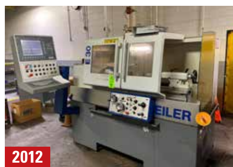
WEILER E30 CNC TURNING CENTER