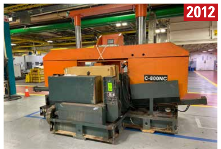
COSEN C-800 NC HORIZONTAL BANDSAW

An 18% buyer's premium will be charged on all assets. The buyer's premium will be reduced to 16% for payments made by means of cashieræs check or wire transfer within 48 hours of sale close. If paying by company check, a paid in full invoice will be issued upon the check clearing. Credit card payments are limited to a maximum of $2,000. All items are sold "As is, Where is" without any warranty, express or implied.