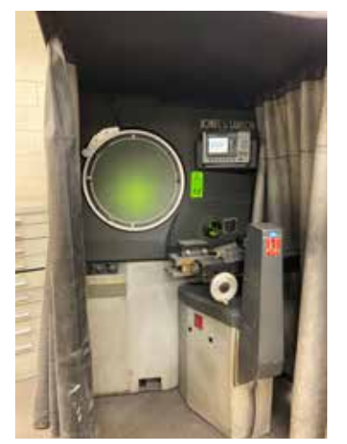
JONES & LAMSON EPIC 120 OPTICAL COMPARATOR

Assortment of Chucks, Steady Rests, Hardness Tester and Calibrators