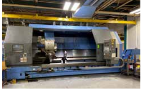
MAZAK ST60N CNC TURNING CENTER