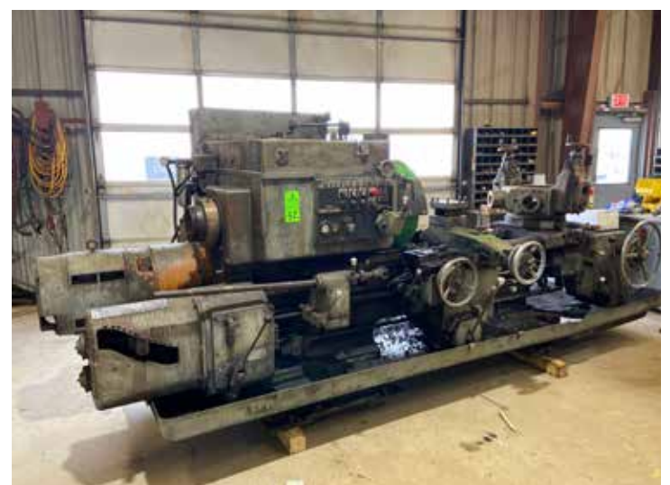
WARNER & SWASEY 3A SQUARE HEAD TURRET LATHE

WARNER & SWASEY 3A SQUARE HEAD TURRET LATHE, s/n 2669205; 80" Bed, 48" Chuck to Turret, Left and Right Hand Threading, 21" 3-Jaw Chuck, Power Chuck Tightener, 6 Position Turret, 6" Hole Through, Cross Slide, 40 HP, Located in Duncan