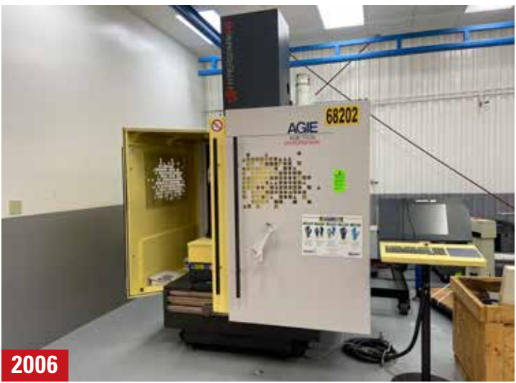
AGIE CHARMILLES HYPERSPARK 3 EDM

2006 AGIE CHARMILLES HYPERSPARK 3 EDM, s/n 592-100-12; 35" x 27" x 14" Capacity, 32" x 25" Table, 1500 Lbs Capacity, 28-ATC, Agie Control, 28" Max Height Table to Electrode, 72A, C-Axis, Located in Carrollton