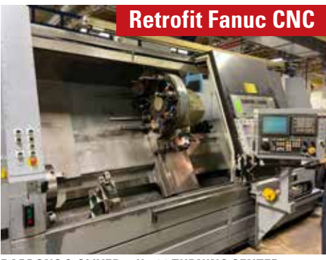
BARDONS & OLIVER 15U-100 TURNING CENTER