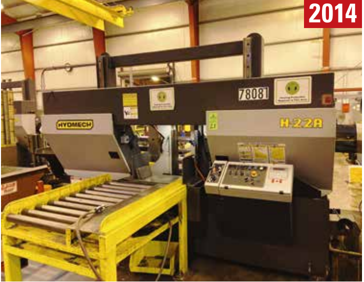
HYDMECH H-22A HORIZONTAL BANDSAW

2012 COSEN C-800 NC Horizontal Bandsaw, s/n 1010314; 31.5" x 31.5" Capacity, 24" Stroke, 12" x 21" Vises (2), 2.6" Blade, Variable Speed, Coolant, PLC Control, 15 HP, Located in Carrollton