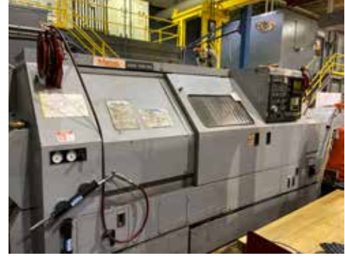
MAZAK QT35N TURNING CENTER

Online Bidding at www.perfectionindustrial.com