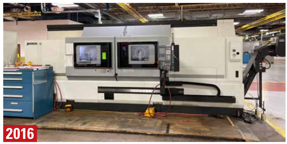
OKUMA LB4000 EX-II MY 2000 CNC TURNING CENTER