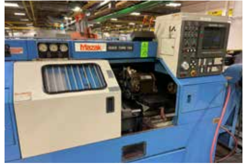
MAZAK QT15NU TURNING CENTER

(2) MAZAK QT15U CNC TURNING CENTERS, s/n77384&77385;10" 3-Jaw Chuck, 32" Between Centers, 6/6 Turret, Fanuc 10T, Chip/Coolant, Located in Carrollton