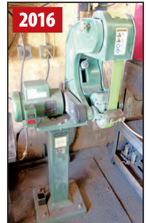
BURR KING VERTICAL BELT GRINDER

ATTENTION US BUYERS – TAKE ADVANTAGE OF VERY FAVORABLE CURRENCY EXCHANGE RATE