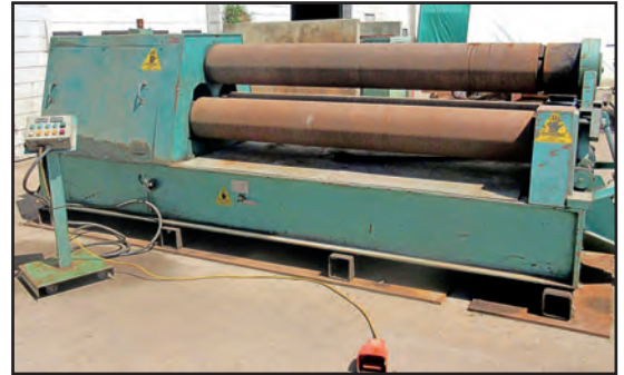
MONTGOMERY RS 8/13 PLATE ROLLS