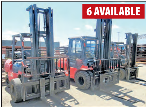
VIEW OF FORKLIFTS