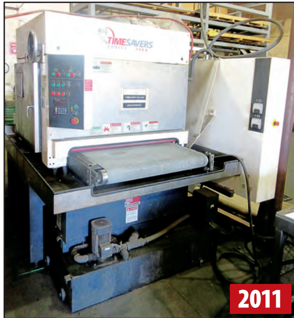
TIMESAVERS SERIES 3100 PPA-240-3 DUAL HEAD WET-TYPE BELT GRINDER