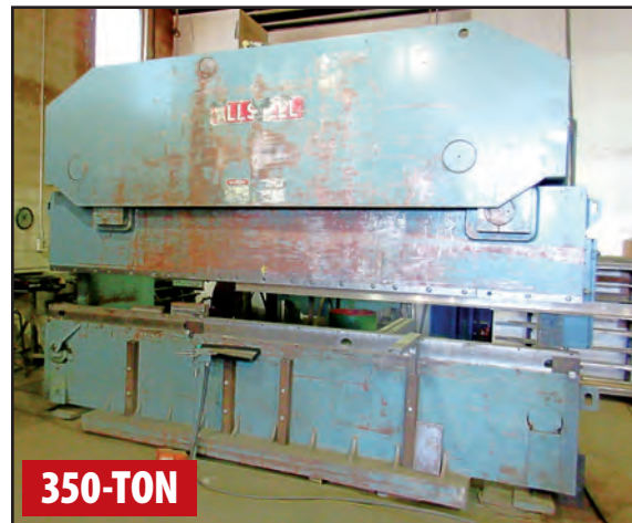
ALLSTEEL 350-14 HYDRAULIC PRESS BRAKE