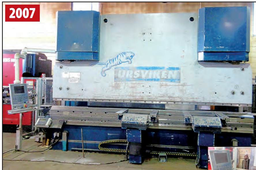
URSVIKEN OPTIMA 500 CNC PRESS BRAKE WITH URSVIKEN CNC CONTROL