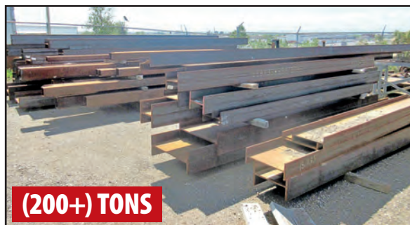
VIEW OF RAW MATERIAL

Sale Closing From: Tuesday, June 26th at 10:00 AM MT