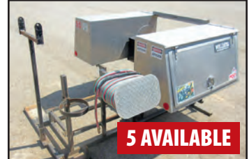
TRUCK BOX WELDING KIT