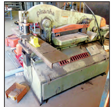
PIRANHA P90 HYDRAULIC IRONWORKER