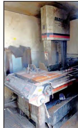
MARVEL SERIES 8 MARK II VERTICAL BANDSAW