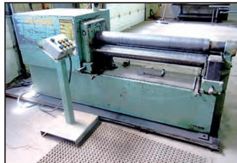
MONTGOMERY 4818-H INITIAL PINCH SHEET ROLLS