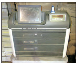
2014 MATRIX MINI AUTOMATED TOOL DISPENSER