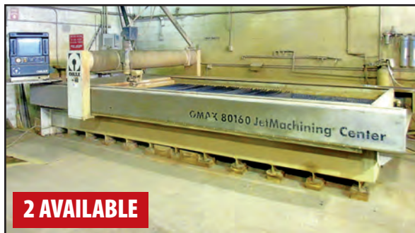
OMAX 80160 CNC WATERJET CUTTING SYSTEMS

HCT METAL MANUFACTURING, INC. D/B/A JP METAL MANUFACTURING