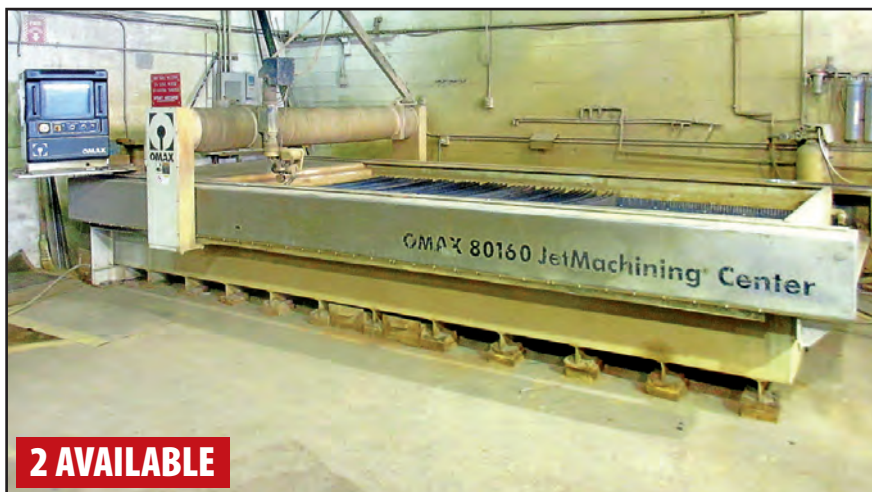
OMAX 80160 CNC WATERJET CUTTING SYSTEMS