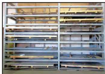
(1 OF 6) HD PLATE/SHEET STORAGE RACKS