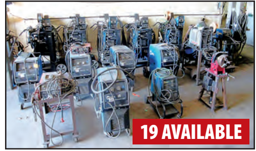
VIEW OF MIG, TIG AND ARC WELDERS