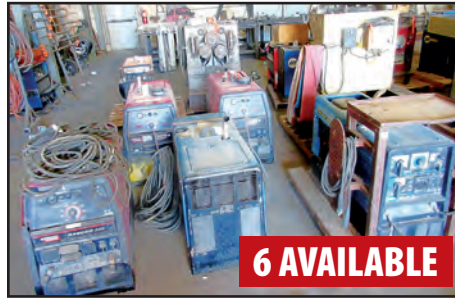
VIEW OF GENERATOR WELDERS