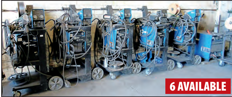
VIEW OF MILLER XMT 350 MIG WELDERS