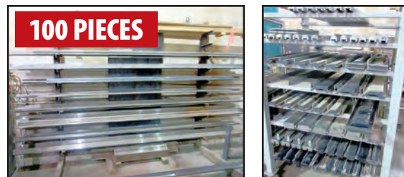
VIEW OF ASSORTED BRAKE DIES