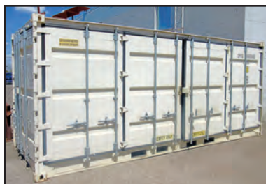
(1 OF 5) C-CANS

Online Bidding at www.perfectionindustrial.com