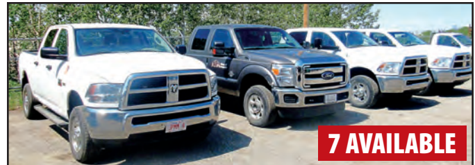
VIEW OF PICKUPS