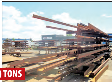
VIEW OF RAW MATERIAL