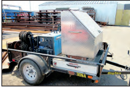
BIG TEX WELD RIG TRAILER