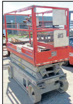
SKYJACK SCISSOR LIFT