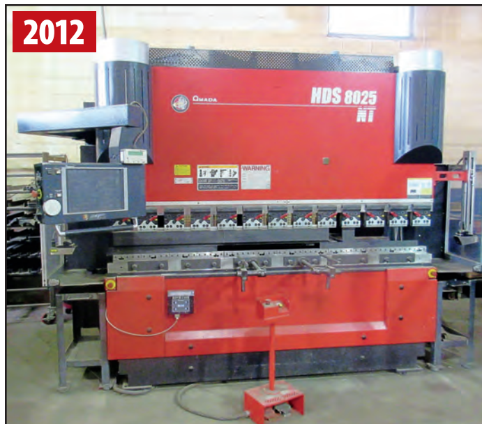
AMADA HDS-8025NT 80-TON X 102" CNC PRESS BRAKE