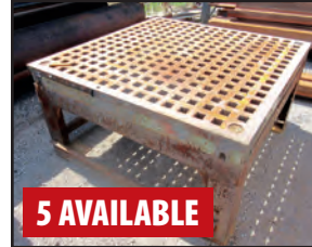
WELDSCALE CLAMPING TABLE