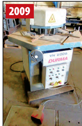
DURMA VN2006 HYDRAULIC CORNER NOTCHER

ALSO: BURR KING, FEIN BELT GRINDERS, SCOTCHMAN COLD SAW, EVERETT 20-22 ABRASIVE SAW, GEARED HEAD AND VARIABLE SPEED DRILL PRESSES, DRILL POINT AND DOUBLE END BENCH GRINDERS, ETC.