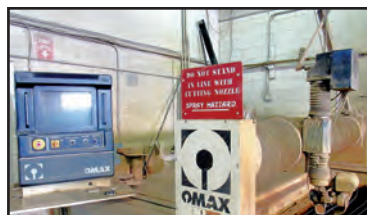
OMAX CUTTING HEAD AND CONTROL