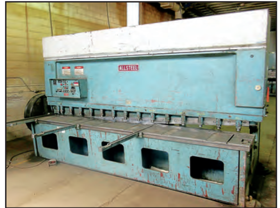
ALLSTEEL 3/8-12 HYDRAULIC SQUARING SHEAR

ALLSTEEL 3/8-12 HYDRAULIC SQUARING SHEAR , s/n S-38136, w/Front Operated Power Back Gauge, 72" Squaring Arm RK MACHINERY MS-25-5 5'X .250" HYDRAULIC SQUARING SHEAR , s/n NA MONTGOMERY RS 8/13 PLATE ROLLS , s/n 99014, w/8'x 12" Diameter Rolls, Hydraulic Drop End SAHINLER MRM-S 26/6 INITIAL PINCH PLATE ROLLS , s/n 98-03, w/8' x .25" Capacity, 8' x 8" Rolls MONTGOMERY 4818-H INITIAL PINCH SHEET ROLLS , s/n 98018, w/48" x 18 Ga Capacity SMT PULLMAX ANGLE/PIPE BENDING ROLLS , s/n NA, w/3" Capacity, Assorted Dies 2011 TIMESAVERS SERIES 3100 PPA-240-3 DUAL HEAD WET-TYPE BELT GRINDER , s/n 32015, w/37" Belt, Oscillating Brush, 15 to 45 FPM Feed PIRANHA P90 HYDRAULIC IRONWORKER , s/n 1138, w/90-Ton Punch Capacity, 6" x 6" x .625" Angle Capacity, Selection of Punches and Dies 2009 DURMA VN2006 HYDRAULIC CORNER NOTCHER , s/n 654309461, w/6" x 6" x .250" Capacity MARVEL SERIES 8 MARK II VERTICAL BANDSAW , s/n 830051