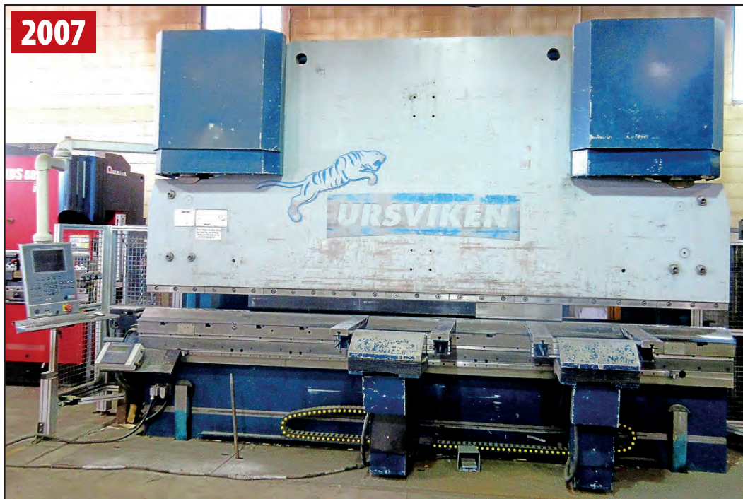
URSVIKEN OPTIMA 500 CNC PRESS BRAKE

FEATURING (600+) LOTS INCLUDING: PRESS BRAKES, CNC WATERJETS, 4,000 WATT CNC LASER, SHEARS, PLATE BENDING ROLLS, IRONWORKER, WELDING DEPT., (200+) TONS OF STEEL STOCK, BRIDGE CRANES, FORKLIFTS, VEHICLES & TRAILERS, & MANUFACTURING SUPPORT ASSETS