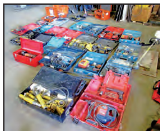
VIEW OF POWER TOOLS