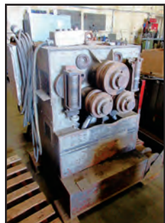
SMT PULLMAX ANGLE/PIPE BENDING ROLLS

ALSO: BURR KING, FEIN BELT GRINDERS, SCOTCHMAN COLD SAW, EVERETT 20-22 ABRASIVE SAW, GEARED HEAD AND VARIABLE SPEED DRILL PRESSES, DRILL POINT AND DOUBLE END BENCH GRINDERS, ETC.