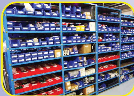
VIEW OF SPARE PARTS FOR SPINNERS AND CNC LATHES