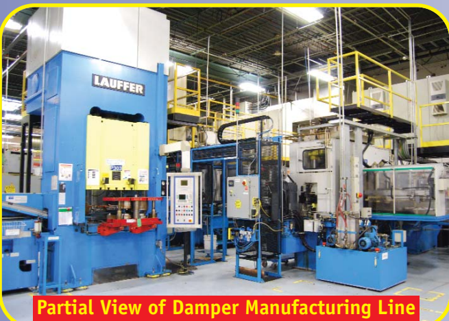
Partial View of Damper Manufacturing Line

COLT 'CERFS-40-12' STRAIGHTENER & FEED; S/N. 1141078; 12" WIDE X .150", (5) STRAIGHTENING & (4) FEED ROLLS X 4" DIAMETER, 80 FT/MIN MAX. SPEED, INDRAMAI CTA CONTROL