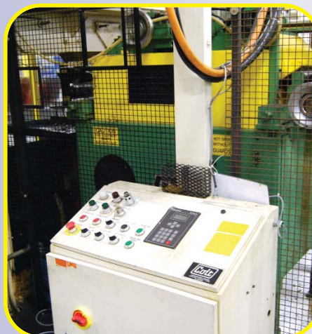
COLT 'CERFS-40-18' STRAIGHTENER & FEED; S/N. 1141227; 18" WIDE X .135", (5) STRAIGHTENING & (4) FEED ROLLS X 4" DIAMETER, 80 FT/MIN MAX. SPEED, COLT INDRAMAI CTA4 CONTROL

The Following Coil Line is Operating with the 500 TON BLOW 'SC2-500-120-54' Press: