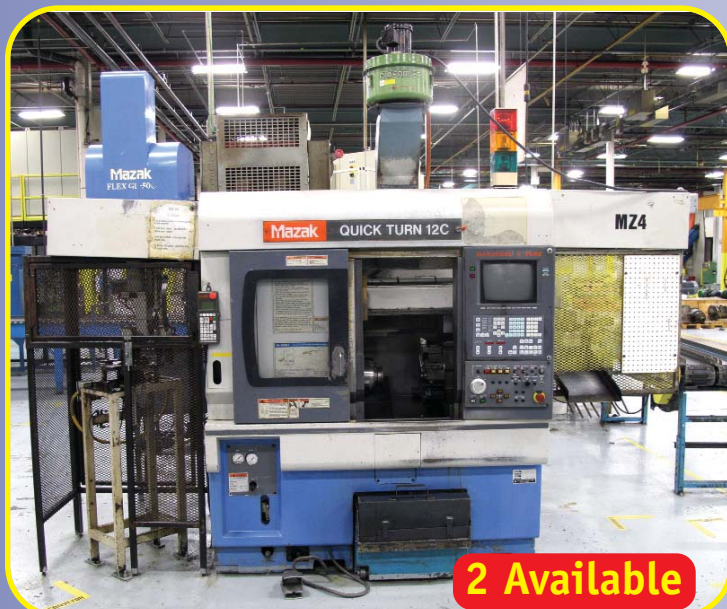
(2) MAZAK, QT-12C, 2 AXIS CNC CHUCKING LATHES, 25.75" SWING, 10.78 MAX. MACHINING LENGTH, X-AXIS 5.12", Z-AXIS 11.42", FLEX GL-50N, ROBOTIC LOADER/UNLOADER