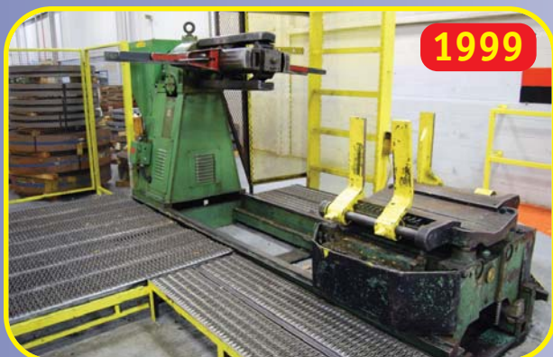
LITTELL '90-30' POWERED UNCOILER & BUGGY; S/N. 89691-89; 10,000 LB X 30" WIDE COIL CAPACITY, 60" MAX. COIL O.D., 20" ~ 24" LITTELL '41805PD' STRAIGHTENER; S/N. 78327-70' 12" WIDE X .125".

The Following Coil Line is Operating with the 500 TON BLOW 'SC2-500-120-54' Press: