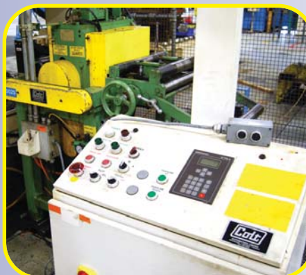
COLT 'CERFS-40-18' STRAIGHTENER & FEED; S/N. 1141180; 18" WIDE X .135", (5) STRAIGHTENING & (4) FEED ROLLS X 4" DIAMETER, 80 FT/MIN MAX. SPEED, INDRAMAI CTA4 CONTROL

To find out more about Platinum's extensive range of Auction, Liquidation, Investment Recovery and Appraisal services please call us at 416-366-2326 or email us at info@platinumassets.com