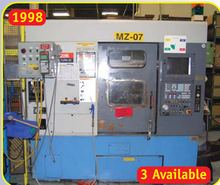
(3) MAZAK, T-20, 2 AXIS CNC LATHES, 17.32" SWING, 17.5" MAX. MACHINING LENGTH, X-AXIS 7.12", Z-AXIS 20.12", FLEX GL-50N, ROBOTIC LOADER/UNLOADER