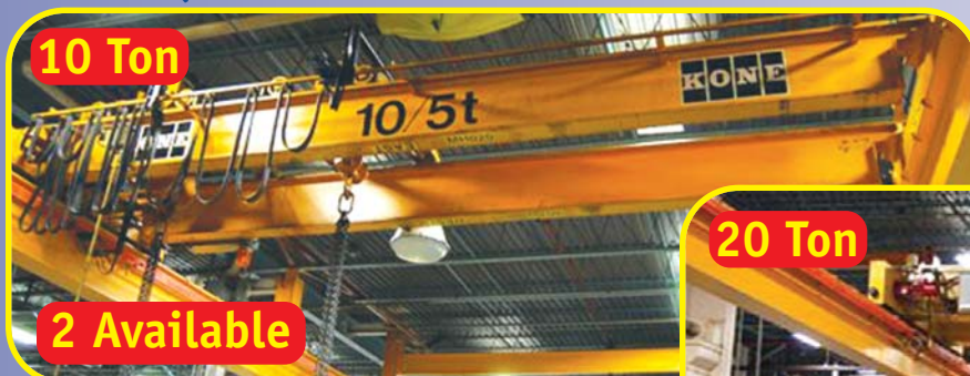
(2) KONE 10 TON DOUBLE GIRDER TOP RIDING OVERHEAD CRANE WITH 5 TON AUXILLARY HOIST, 30' SPAN AND RAILS