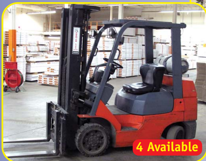
TOYOTA, 7FGU25, 3 STAGE LPG FORKLIFT