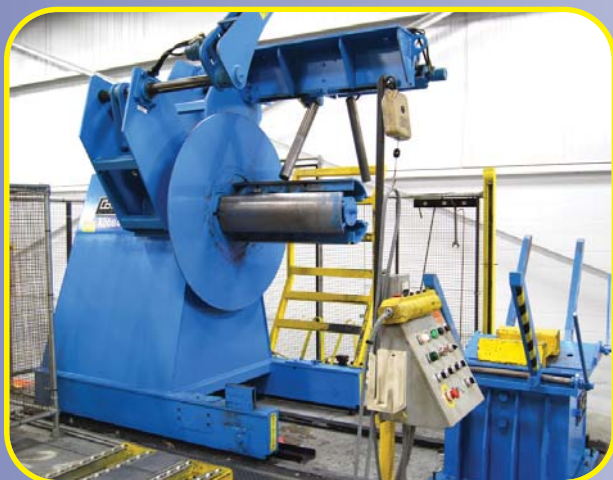
COLT 'CHDRCK-1500-36' POWERED UNCOILER & BUGGY; S/N. 1202062; 15,000 LB X 36" WIDE COIL CAPACITY, 72" MAX. COIL O.D., 18"~22" I.D, HYDRAULIC MANDREL EXPANSION