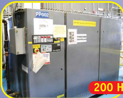
ATLAS COPCO, GA160W, 200HP ROTARY SCREW AIR COMPRESSOR

Warehouse: 149,000 SF Main Floor Office: 18,426 SF Second Floor Office: 8,058 SF Estimated Total: 175,484 SF