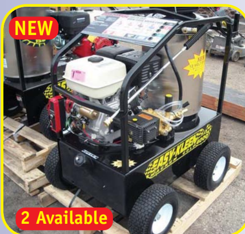
NEW! 2009 EASY KLEEN, MAGNUM PLUS, 15HP, 4000 PSI, SELF CONTAINED GAS POWERED HOT WATER PRESSURE WASHER WITH ELECTRIC START, S/N 50771

This auction is being conducted Theatre Style.