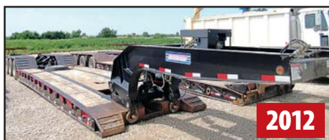
PITTS 55-TON TRI-AXLE HYDRAULIC DOUBLE-DROP LOWBOY