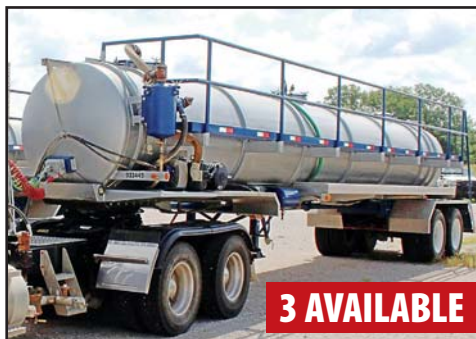
2014 YOUNG'S WELDING T/A 5, 470-GAL. VACUUM TANK TRAILERS