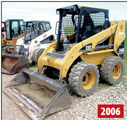
CATERPILLAR 246B SKID STEER LOADER