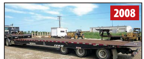
LANDOLL TRI-AXLE TILT-DECK SINGLE-DROP LOWBOY TRAILER

To discuss your requirements for an auction, please call Perfection Industrial 847-545-6374