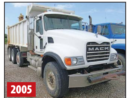
MACK CV713 GRANITE TRI-AXLE SAND TRUCK