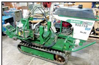
MCELROY NO. 28 FUSION WELDER