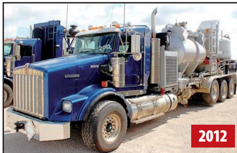
KENWORTH T800 TRI-AXLE CEMENT PUMPING RIG

Late-Model Development & Maintenance Fleet of a Gas Exploration & Service Company