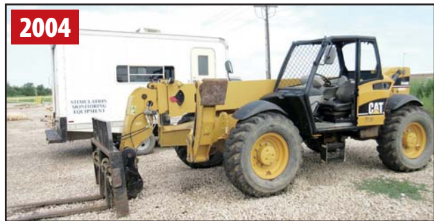
CATERPILLAR TH460B TELEHANDLER

Online Bidding at www.perfectionindustrial.com