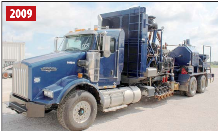
KENWORTH T800 T/A FRAC PUMPING RIG