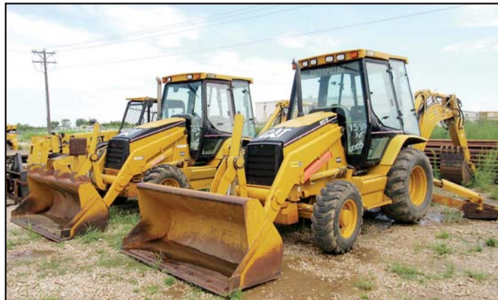
(2) CATERPILLAR LOADER BACKHOES