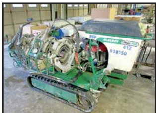
MCELROY NO. 412 FUSION WELDER

ASSORTED ELECTRIC WELDING MACHINES, PLASMA CUTTER, GENERATORS, SPRAYER TANKS, PORTABLE AIR COMPRESSOR, TRUCK TOOL BOXES, MASTER COOLING FANS, TRUCK ACCESSORIES AND PARTS, LARGE QUANTITY NEW TRUCK PARTS INVENTORY, BEARINGS, NEW TRUCK TIRES, TIRE MOUNTING AND BALANCING MACHINES, FLOOR JACKS, JACK STANDS, CABLE SPOOLS, CHAINS AND BINDERS, FRACKING RIG SUPPORT EQUIPMENT AND TOOLING, DRILL PIPE AND ROD, PIPE STANDS, SAND FILTERS, PUMP JACKS, GARAGE AND SHOP EQUIPMENT AND MUCH MORE