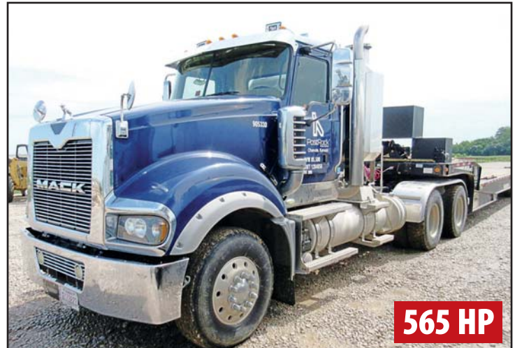
2010 MACK TD713 TITAN T/A DAY CAB TRUCK TRACTOR