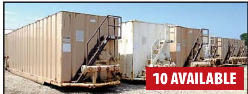
2007 TRAXELL 500BBL S/A FRAC TANK TRAILERS

2007 TRAXELL 500BBL S/A FRAC TANK TRAILERS , w/ 42' Long, 102" Wide, 102" High, VIN: 1T9TF421571867188, Unit #23, VIN: 1T9TF421X71867204, Unit #54, VIN: 1T9TF421771867189, Unit #25, VIN: 1T9TF421671867202, Unit #51, VIN: 1T9TF421371867809, Unit #11, VIN: 1T9TF421871867198, Unit #40, VIN: 1T9TF421171867088, Unit #12, VIN: 1T9TF421871867203, Unit #45, VIN: 1T9TF421271867200, Unit #42, VIN: 1T9TF421171867205, Unit #55