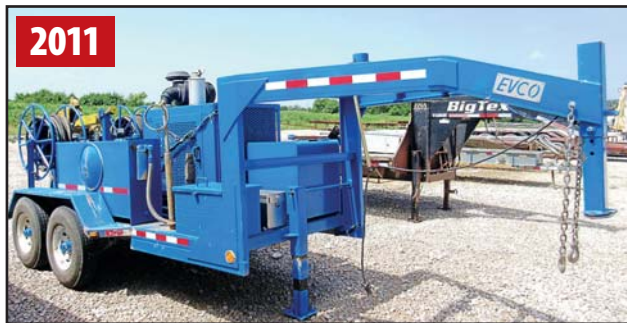
EVCO GT222 GOOSENECK TRAILER-MOUNTED POWER SWIVEL