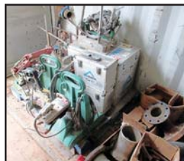
MCELROY HAND HELD FUSION WELDERS