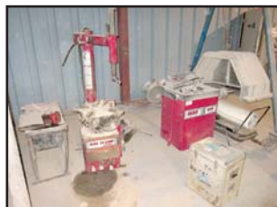
TIRE CHANGER AND BALANCER