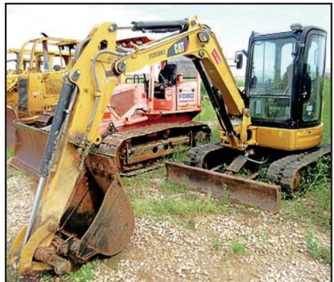
CATERPILLAR 305DCR MINI HYDRAULIC EXCAVATOR