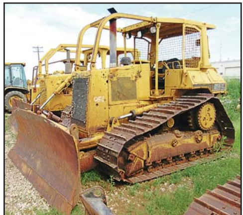
CATERPILLAR D5HXL DOZER

2012 YOUNG'S WELDING 60BBL OPEN TOP WASH PIT GOOSENECK TRAILER , Unit #933270