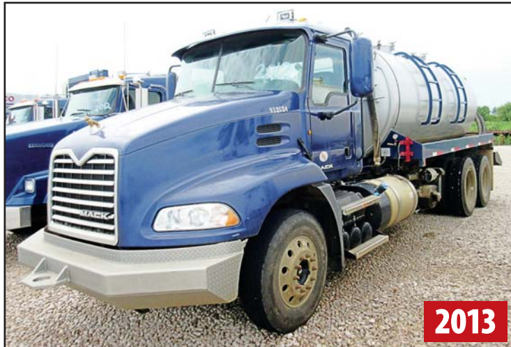
MACK CXU613 T/A VACUUM TANK TRUCK