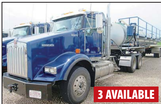
2014 KENWORTH T800 T/A DAY CAB TRUCK TRACTOR

2007 LANDOLL 435B 35-TON T/A TILT-DECK SINGLE-DROP LOWBOY TRAILER , VIN: 1LH435WH471B16083, Unit #933025