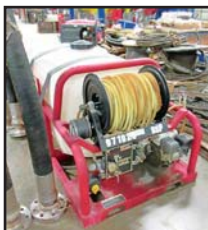
GAS POWERED SPRAYER