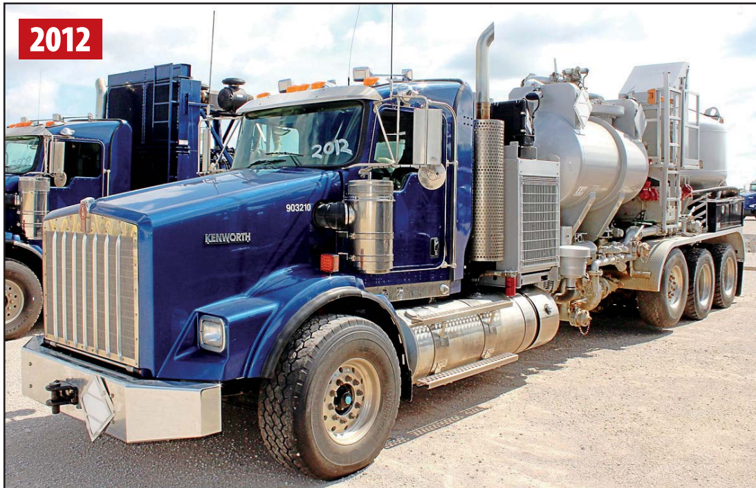
KENWORTH T800 TRI-AXLE CEMENT PUMPING RIG

Cementing Rigs, Fracture Treatment Rigs, Well Servicing Rigs, Plus (53) FORD F-350, F-250 and F-150 Service Trucks, Crawler Dozers, Backhoe Loaders, Telehandlers & Support Equipment