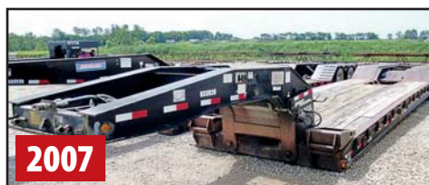
EAGER BEAVER 50-TON TRI-AXLE HYDRAULIC DOUBLE-DROP LOWBOY TRAILER