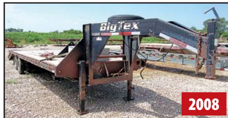
BIG TEX 25GN-26+5 T/A DUALY GOOSENECK TRAILER

Online Bidding at www.perfectionindustrial.com