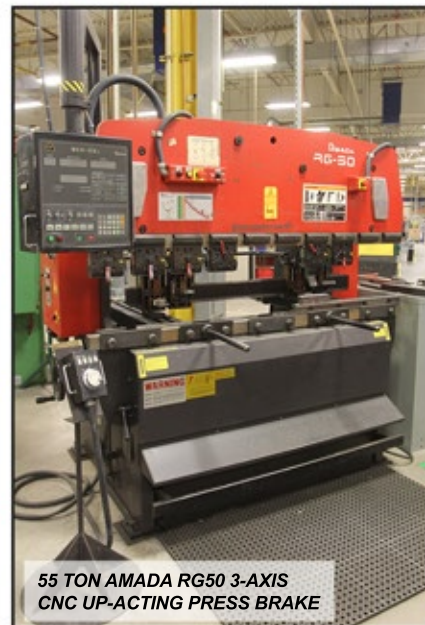
55 TON AMADA RG50 3-AXIS CNC UP-ACTING PRESS BRAKE