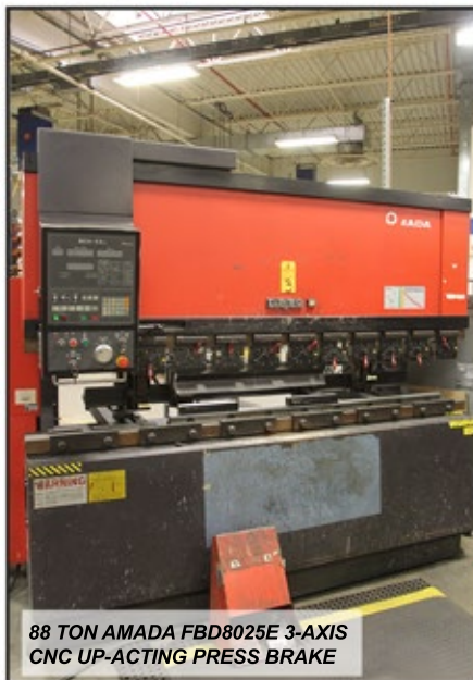
88 TON AMADA FBD8025E 3-AXIS CNC UP-ACTING PRESS BRAKE