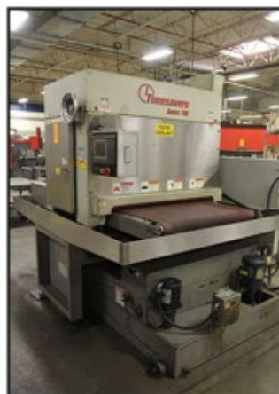
TIMESAVERS 137-HDMW SHEET METAL FINISHING MACHINE