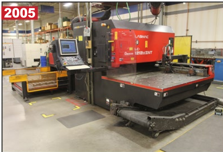
AMADA PULSAR 1212AIII-NT CNC HYBRID LASER