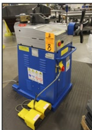
ERCOLINA TB60 "TOP BENDER" TUBE & PIPE BENDER

ERCOLINA TB60 "Top Bender" Tube & Pipe Bender, S/N. 6008042, (2008) 2-1/2" Tube, 2" Sch 40 Pipe, Touch Screen PLC Control, 15" Max CLR, Digital Bend Angle Display, Dual Foot Switch