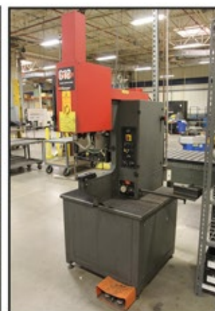
6 TON HAEGER 618 PLUS L INSERTION PRESS

View our current auction schedule at www.perfectionindustrial.com