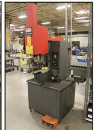
6 TON HAEGER 618 PLUS L INSERTION PRESS

View our current auction schedule at www.perfectionindustrial.com