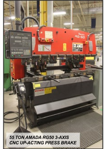
55 TON AMADA RG50 3-AXIS CNC UP-ACTING PRESS BRAKE