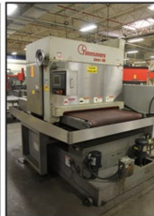
TIMESAVERS 137-HDMW SHEET METAL FINISHING MACHINE