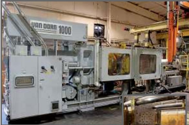
VAN DORN 1,000 TON INJECTION MOLDER