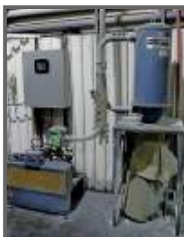
AEC MATERIAL DISTRIBUTION SYSTEM