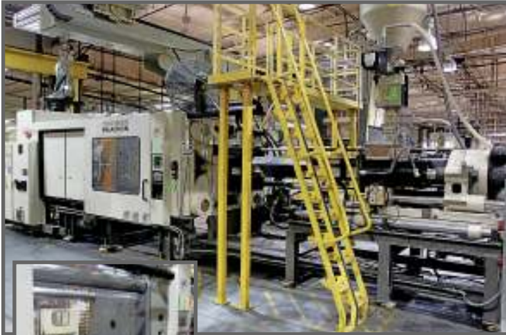
CINCINNATI MILACRON 850 TON INJECTION MOLDER