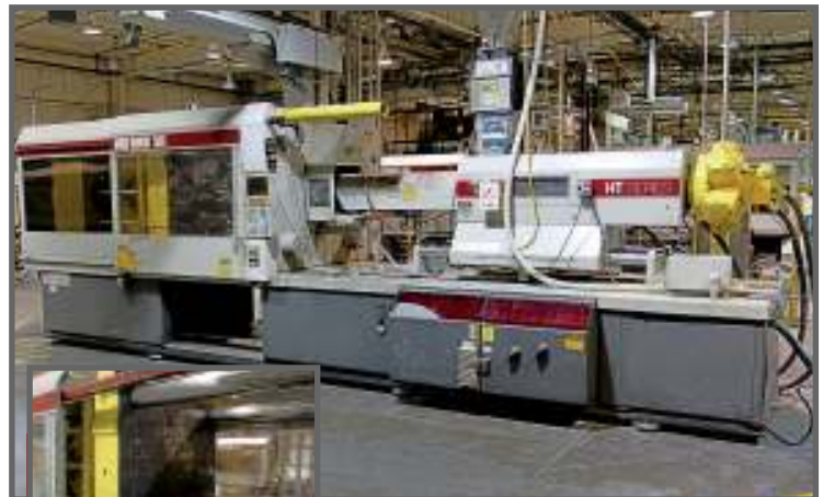
VAN DORN 500 TON INJECTION MOLDER

View our current auction schedule at www.perfectionindustrial.com