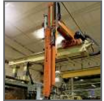
HUSKY MTE-50 3-AXIS SERVO ROBOT