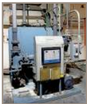
ADVANTAGE PTS-800-3P CHILLER