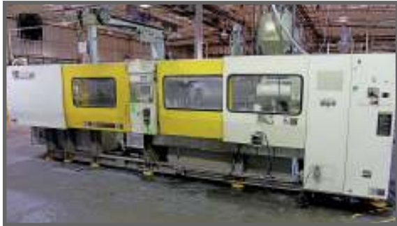
TOSHIBA 390 TON INJECTION MOLDER