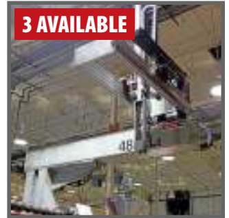
MARK II 480EL2 3-AXIS SERVO ROBOT