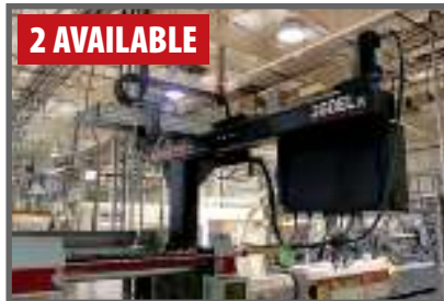
MARK II 360EL3S 3-AXIS SERVO ROBOT