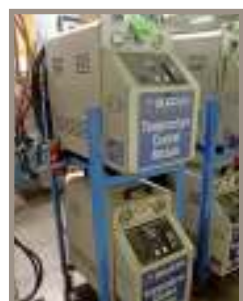
TEMPERATURE CONTROLLERS & GRINDER