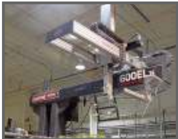
MARK II 600EL3S 3-AXIS SERVO ROBOT