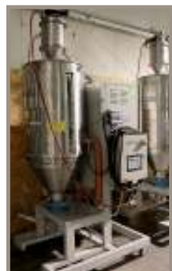
DRI-AIR APD-9 DRYER