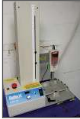
CHATILLON LTCM-100 20" DIGITAL TENSILE TESTER