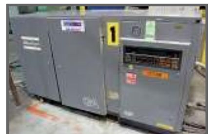
ATLAS COPCO GAU410 40 HP ROTARY SCREW AIR COMPRESSOR

To discuss your requirements for an auction, please call Perfection Industrial 847.427.3333