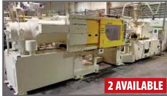
MITSUBISHI 390 TON INJECTION MOLDER