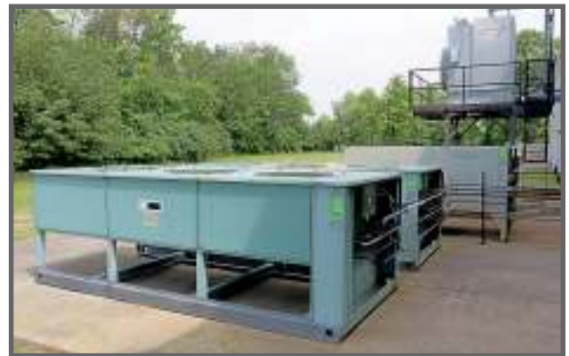
VIEW OF WATER SYSTEMS

NISSUI SA-24 2 HP PORTABLE GRANULATOR , S/N SA3400517, w/22" x 22" Top Load Opening