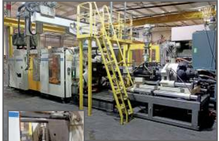
CINCINNATI MILACRON 725 TON INJECTION MOLDER