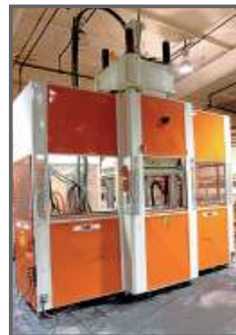
MIR 500 TON VERTICAL CLAMP INJECTION MOLDER