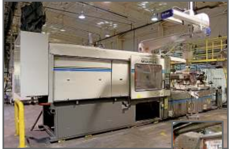
CINCINNATI MILACRON 600 TON INJECTION MOLDER

Sale Date: Tuesday, July 16, Beginning at 10:00 AM EDT