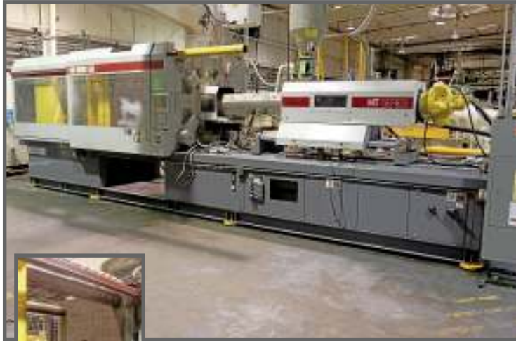
VAN DORN 650 TON INJECTION MOLDER