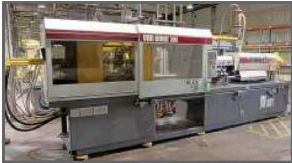
VAN DORN 300 TON INJECTION MOLDER