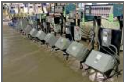
(20) YUDO, KONA-ATHENA, DME, & IMS HOT RUNNER TEMPERATURE CONTROLLERS