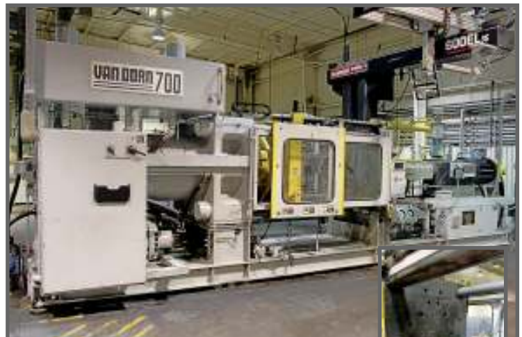
VAN DORN 700 TON INJECTION MOLDER

Inspection: Monday, July 15, from 9:00 AM to 4:00 PM or by Appointment