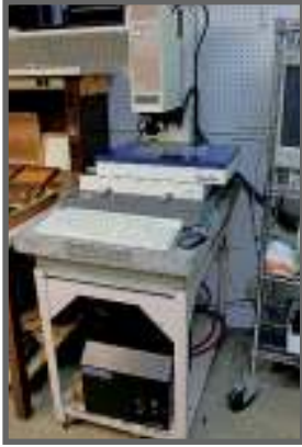
RAM OPTICAL INSTRUMENTATION DATA STAR-200 OPTICAL VIDEO PROBE