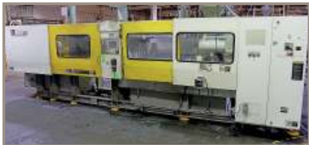
TOSHIBA 390 TON INJECTION MOLDER

MAJOR PLASTIC INJECTION MOLDING FACILITY & REAL ESTATE FOR SALE