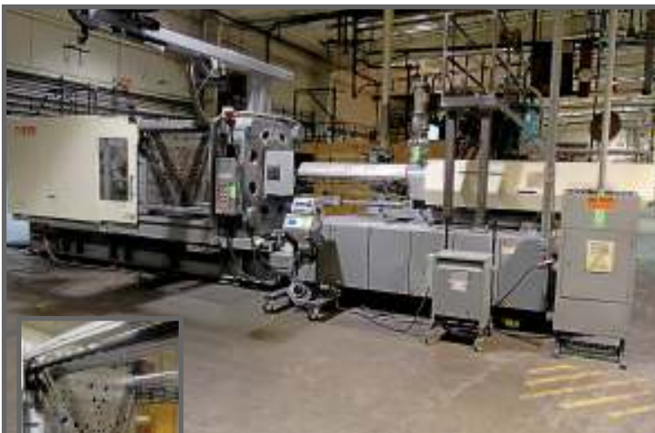
NISSEI 720 TON INJECTION MOLDER