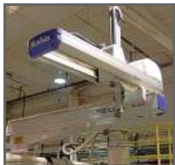
YUSHIN WEBLINER RAI-A-400 SLL-13 3-AXIS SERVO ROBOT