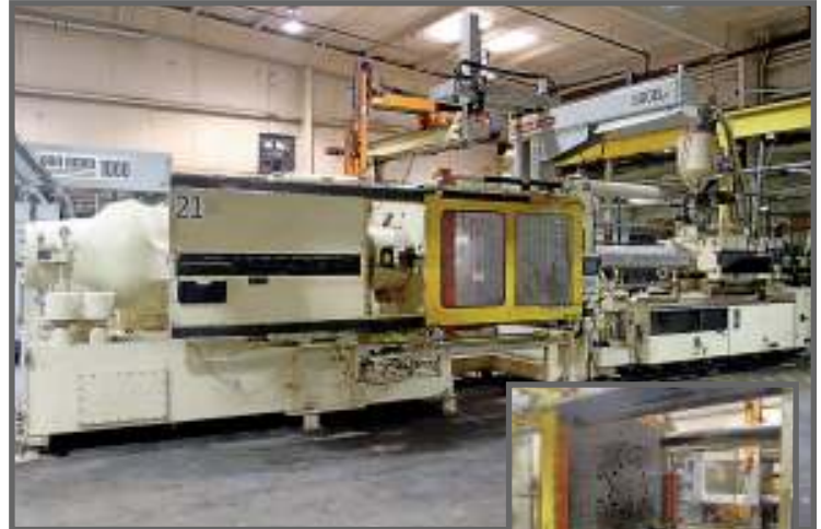
MITSUBISHI 950 TON INJECTION MOLDER