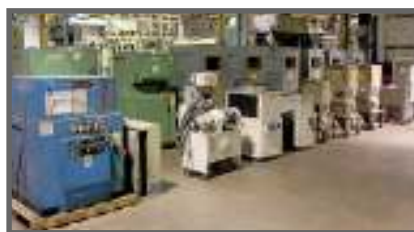
VIEW OF GRANULATORS