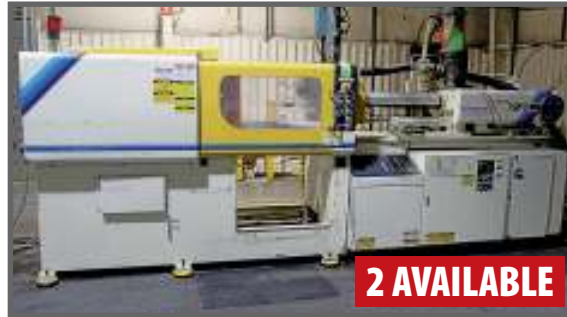
MITSUBISHI 120 TON INJECTION MOLDER