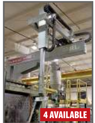
MARK II 600EL2 3-AXIS SERVO ROBOT