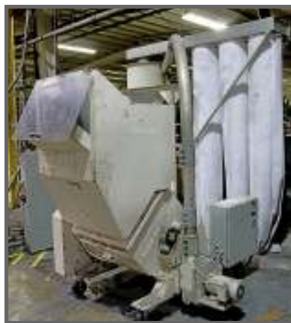
AEG G1628 30 HP PORTABLE GRANULATOR