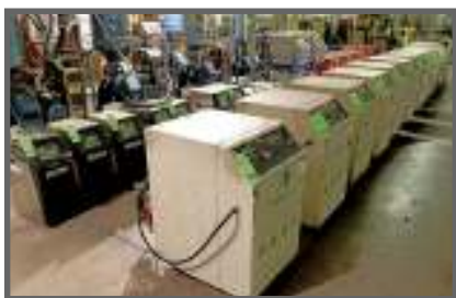
VIEW OF TEMPERATURE CONTROLLERS

(2) UNA-DYN UDC-30 PORTABLE AUTO MINI-DRYERS , w/Microprocessor Control, 200 LB Modular Drying Hopper and Vacuum Loader