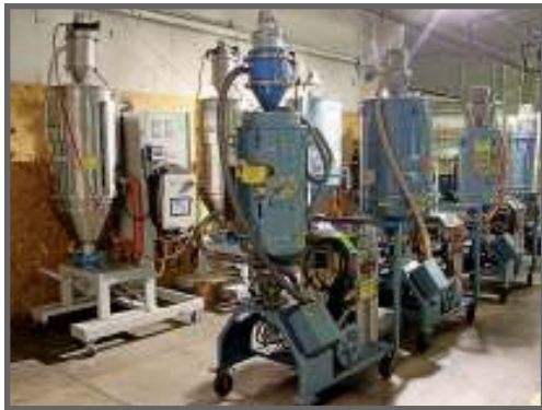
VIEW OF MATERIAL DRYERS