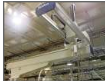
YUSHIN NETLINER YAI-600SL-15.5 3-AXIS SERVO ROBOT