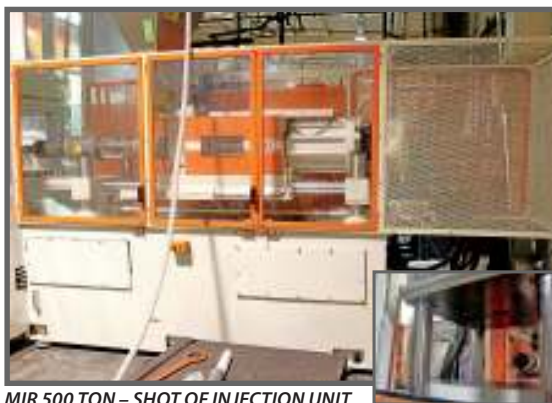
MIR 500 TON – SHOT OF INJECTION UNIT

Note: Robots Will Be Sold Separate From Machines