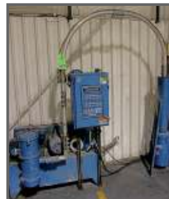
2002 NOVATEC MCS-216 MATERIAL DISTRIBUTION SYSTEM