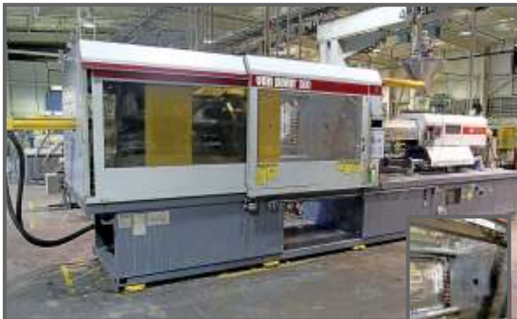
VAN DORN 500 TON INJECTION MOLDER