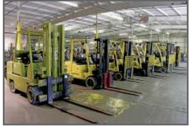
VIEW OF FORKLIFTS