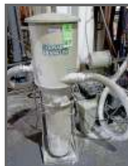
CONAIR FRANKLIN VACUUM LOADING SYSTEM