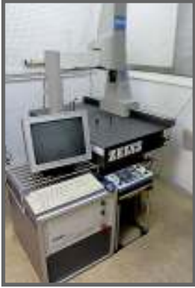
1994 ZEISS C400-1532-12 COORDINATE MEASURING MACHINE