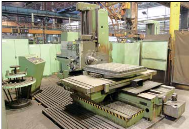
TOS VARNSDORF WHN 9B HORIZONTAL BORING MILL