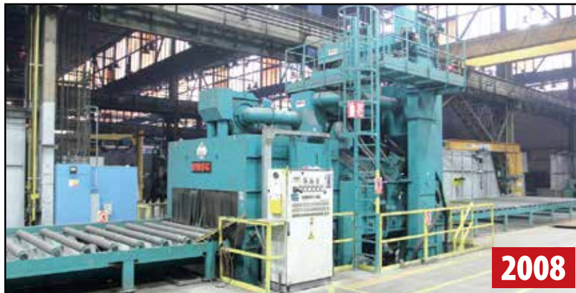
OMSG LAUCO 250NS-PR400 SHOT BLAST SYSTEM