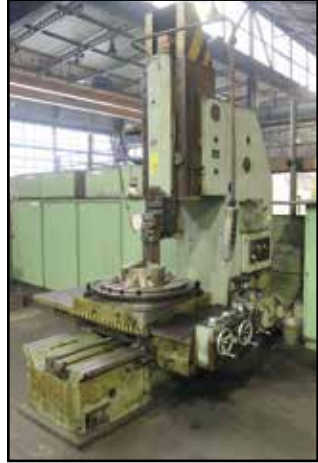
ROMENB 74450 VERTICAL SHAPER

TOS HD12.5/4 PLANING MILL , s/n 57184, 4000mm Max. Planing Length, 1250mm Max. Planing Width, 4000mm x 1100mm Table, 60mm Stroke Knife Holder, 250mm Slide Knife Adjustment, 1270mm Between Columns