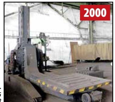
KOVACO WELDING POSITIONER