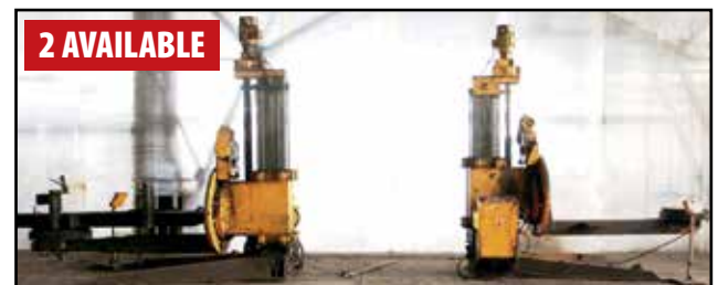
4,500 KG STA SOM 61 WELDING POSITIONERS

To discuss your requirements for an auction, please call Perfection Industrial +1.847.427.3333