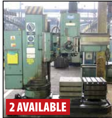
MAS V050 RADIAL ARM DRILL

CSEPEL RFH 75/1500 RADIAL ARM DRILL , s/n 79013, Morse 5 Taper, 75mm Max. Drilling Diameter, 1200mm Max. Vertical Arm Adjustment, 800mm x 600mm x 450mm H Box Table