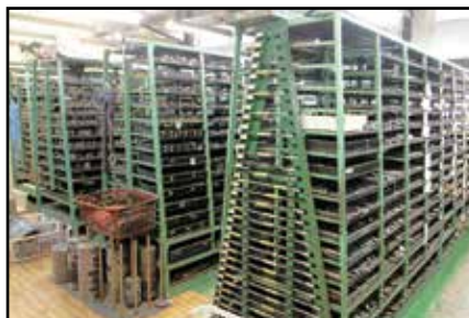
VIEW OF TOOLING ROOM