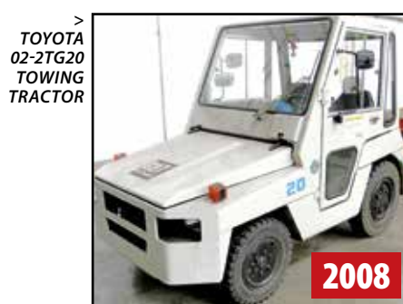
TOYOTA 02-2TG20 TOWING TRACTOR