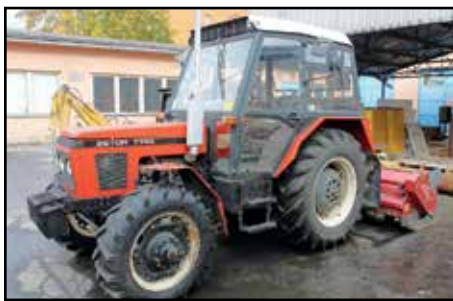
ZETOR 7745 DIESEL TRACTOR

2012 ISAL PB120D DIESEL FLOOR SWEEPER, s/n 0181001/5796