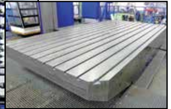
TOS ROTARY TABLE