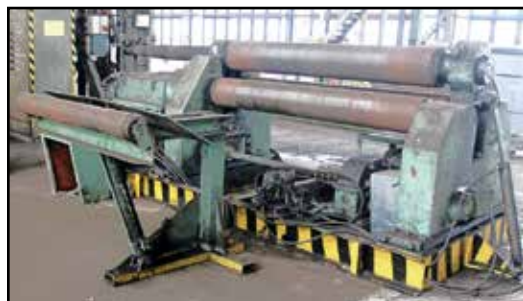
PLATE BENDING ROLL