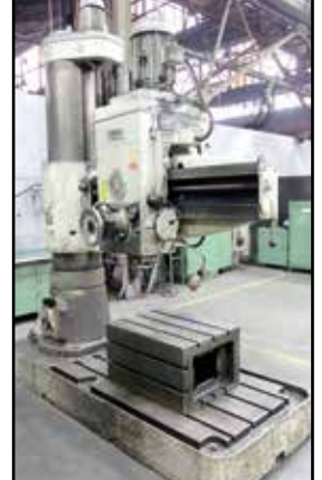
CSEPEL RFH 751500 RADIAL ARM DRILL