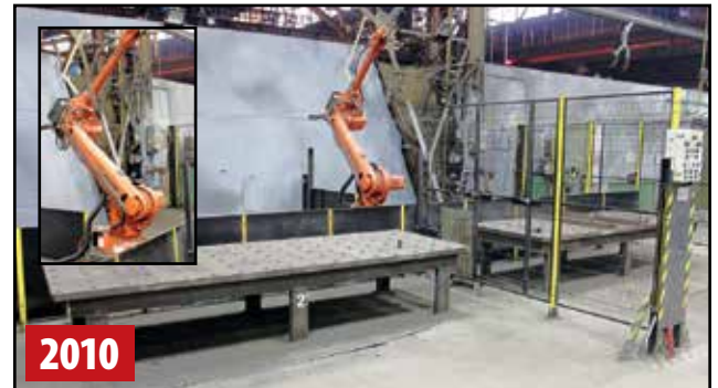
ABB IRB4600 BEVELING ROBOT

UNKNOWN MFR BEVEL MACHINE , 8m Capacity, (9) Clamps, (6) 1.2m Front Supports, (2) Tools Post w/Operator Platform on Track, Hydraulic Unit