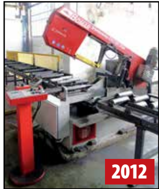
2012 BOMAR TRAVERSE 510.330.DGH HORIZONTAL BANDSAW