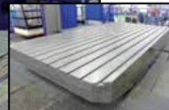
TOS ROTARY TABLE

< TOS VARNSDORF WRD150Q FLOOR TYPE CNC BORING MILL