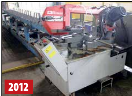
2012 BOMAR ERGONOMI 320.250GH HORIZONTAL BANDSAW