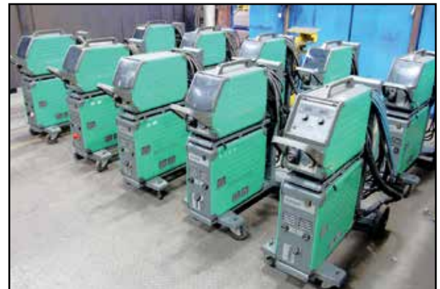
VIEW OF MIGATRONIX WELDERS

Sale Closing Date: Tuesday, December 1, 2015 at 9:00 AM GMT