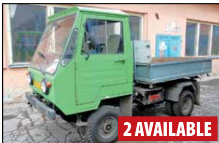
MULTICAR 25.1A FLATBED TRUCK