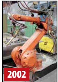
ABB IRB2400 BEVELING ROBOT