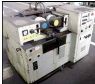
WMW UPW 25.1 THREAD ROLLER