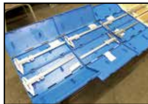
VIEW OF INSPECTION ITEMS