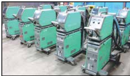
VIEW OF SIGMA 500 MIG WELDERS