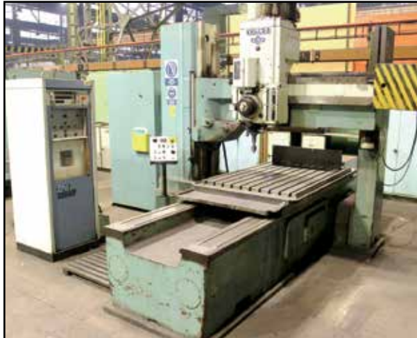
MAS VR5N-B JIG BORER

MAS VR5N-B JIG BORER , s/n 257, 50mm Drilling Capacity, ISO 40 Spindle Taper, 1600mm x 1000mm Table Dimensions, 1600mm Distance Between Columns, 28–2,500 RPM