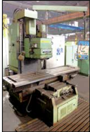
TOS KURIM FC50V MILLSTAR VERTICAL MILLING MACHINE