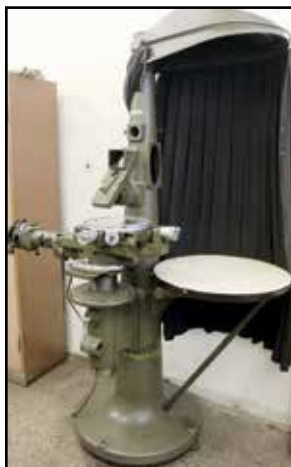
CARL ZEISS JENA PROFILE PROJECTOR 600