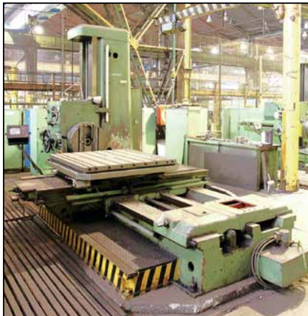
TOS VARNSDORF W100 HORIZONTAL BORING MILL