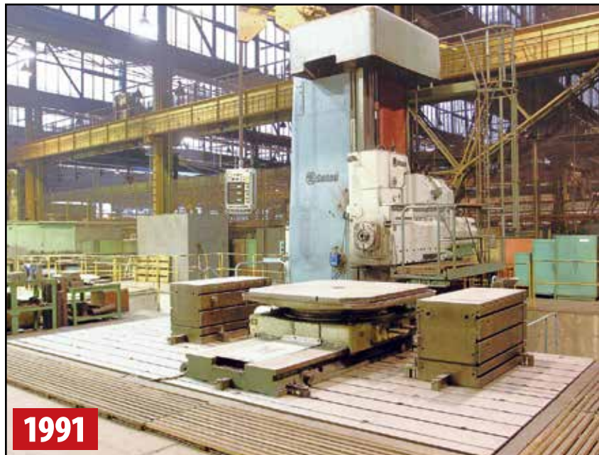
SKODA W160HC FLOOR TYPE BORING MILL