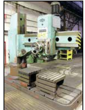
MAS VR6A RADIAL ARM DRILL