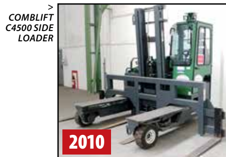
COMBLIFT C4500 SIDE LOADER

(4) CIPRES FILTER BRNO FILTRCARM GH15/1/6/15/RP W/EN134452009 TLAKOVA NABODA 1400/15 PRESSURE VESSEL – As new as 2013