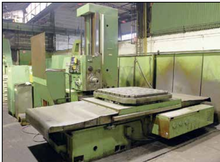
TOS VARNSDORF WHN 11 HORIZONTAL BORING MILL

TOS VARNSDORF WHN 9B HORIZONTAL BORING MILL , s/n 2726, 1000mm x 1100mm Table, 90mm Spindle Diameter, 680mm Spindle Travel, 1250mm X, 900mm Y, 1000mm