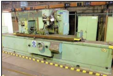
STANKO IMPORT 3M451B SPLINE GRINDER