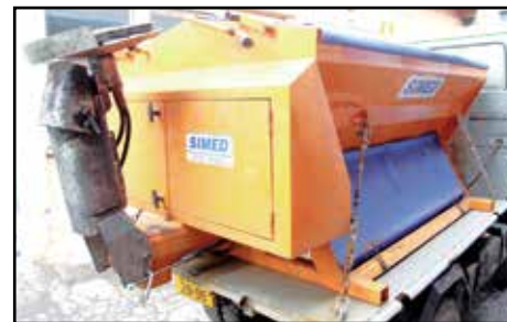
SIMED SVS 1.0 E SALT SPREADER