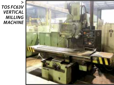
TOS FC63V VERTICAL MILLING MACHINE