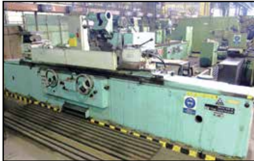
TOS HOSTIVAR BHU 40A UNIVERSAL GRINDER

TOS BP 12 SAW BLADE SHARPENER GRINDER , s/n 024524319, 260–1200mm Saw Diameter (2) TOS KURIM BP2 SAW BLADE SHARPENER GRINDER , s/n 40562 and 40568, 20–350mm Diameter Circular Saws, 5–50mm Hole Saw, 23mm Height of Teeth, 0–23mm Pitch