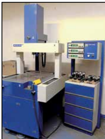
SOMET XYZ 643 CMM