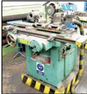
TOS BN 102 TOOL CUTTER AND GRINDER