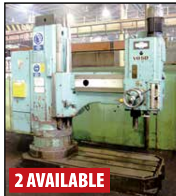
MAS V050 RADIAL ARM DRILL