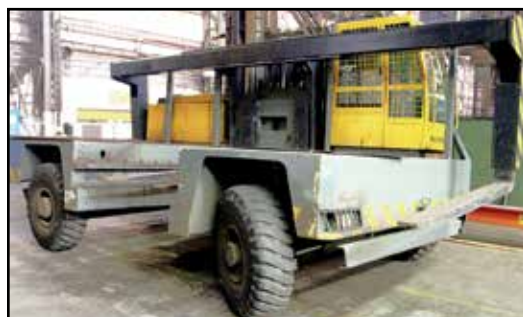
CAVIAN BAUMAN GS120.80/25/25/36 SIDE LOADER