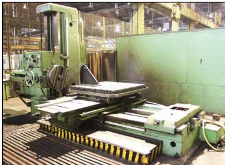
TOS VARNSDORF W100A HORIZONTAL BORING MILL