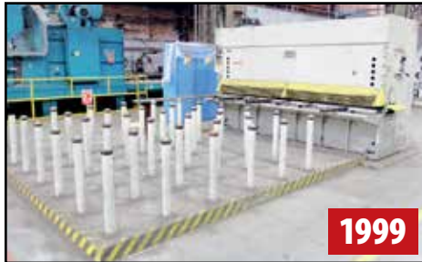
1999 FORMETAL PIESK CNTA 3150/16A SHEAR