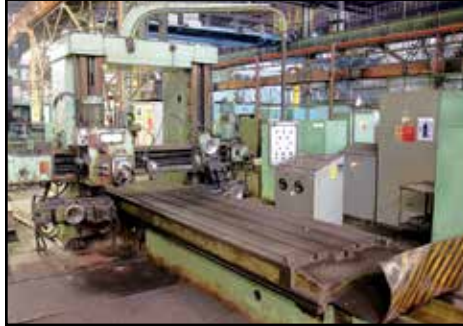
TOS HD12.5/4 PLANING MILL