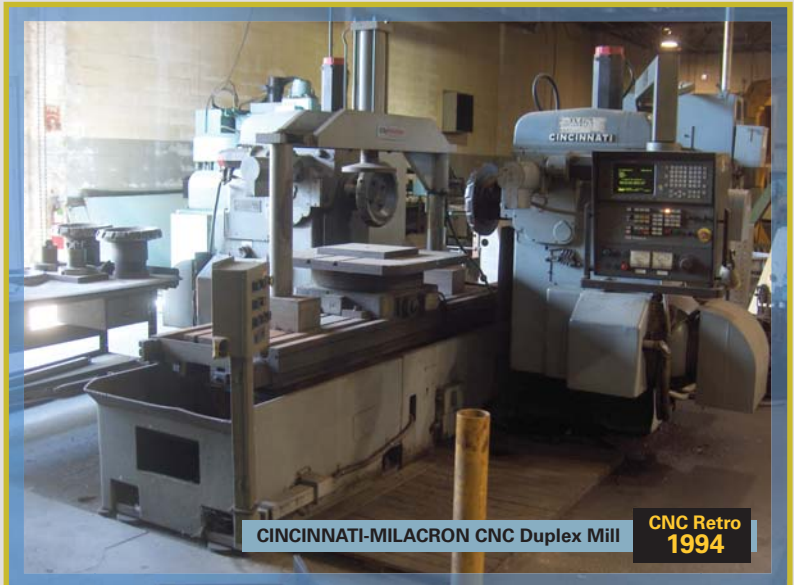
CINCINNATI-MILACRON CNC Duplex Mill