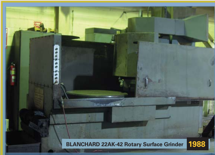
BLANCHARD 22AK-42 Rotary Surface Grinder 1988