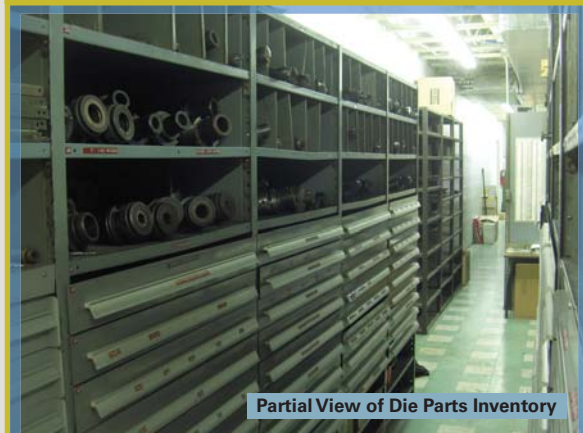
Partial View of Die Parts Inventory