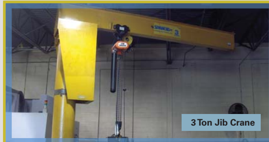
3 Ton Jib Crane