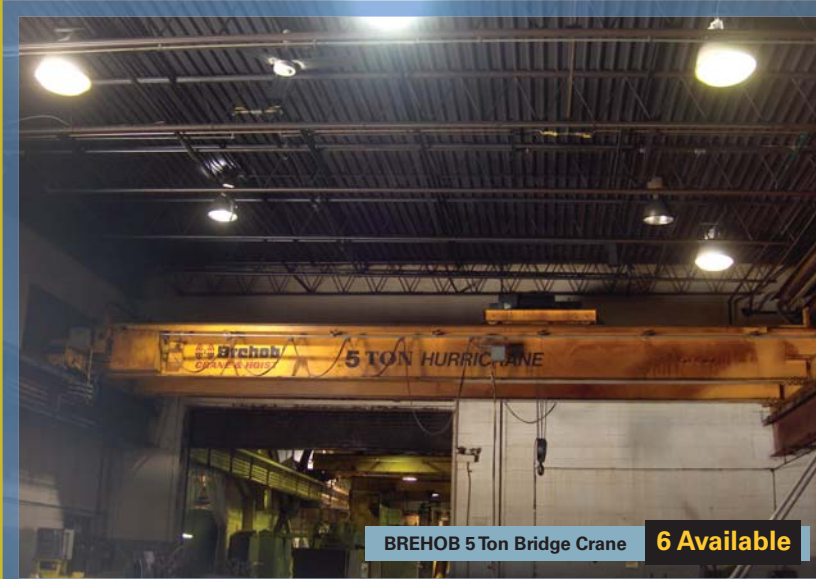
BREHOB 5 Ton Bridge Crane 6 Available