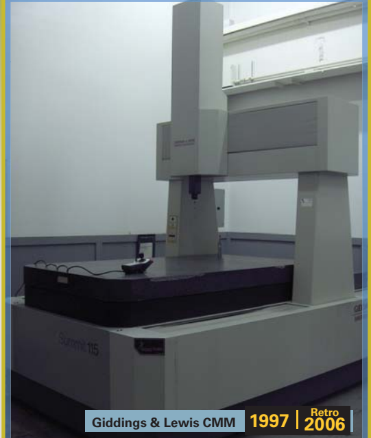
Giddings & Lewis CMM 1997 | Retro 2006