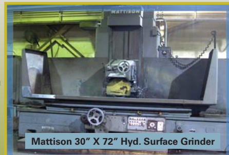
Mattison 30" X 72" Hyd. Surface Grinder