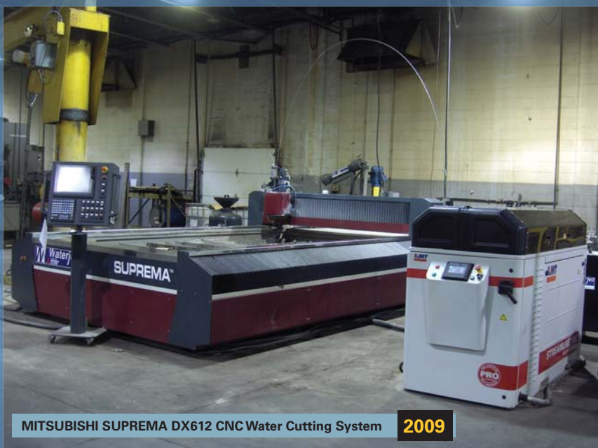
MITSUBISHI SUPREMA DX612 CNC Water Cutting System 2009