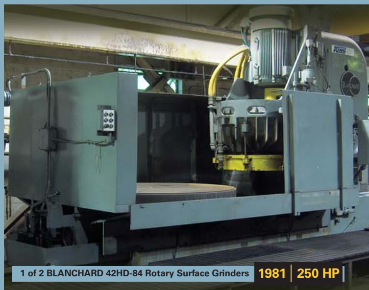
1 of 2 BLANCHARD 42HD-84 Rotary Surface Grinders 1981 | 250 HP |

Location: 927 S Pennsylvania St., Indianapolis, IN Inspection: Monday, September 20 th , 2010 or by appointment