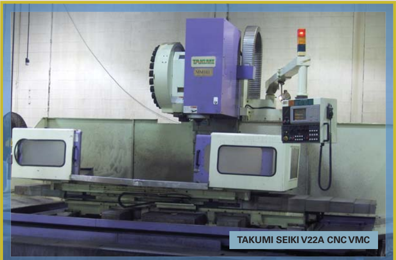
TAKUMI SEIKI V22A CNC VMC