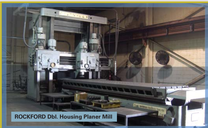
ROCKFORD Dbl. Housing Planer Mill