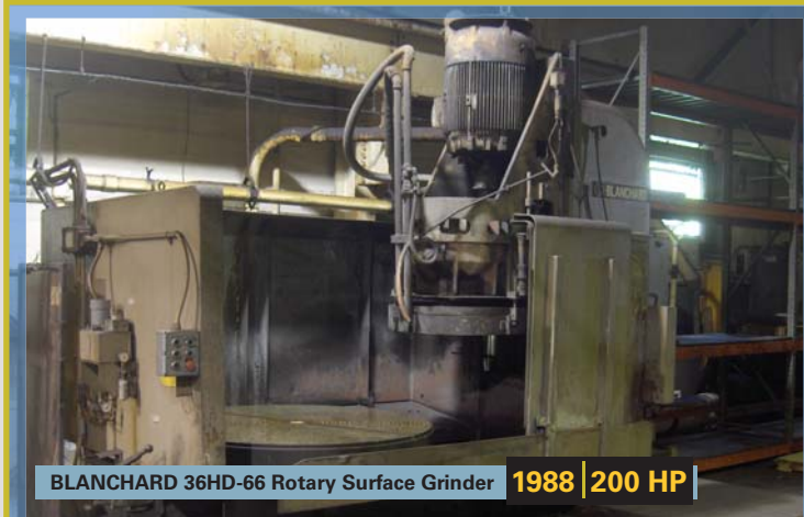
BLANCHARD 36HD-66 Rotary Surface Grinder 1988 | 200 HP