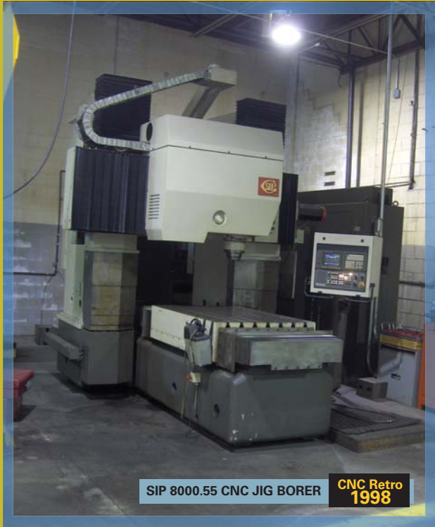
SIP 8000.55 CNC JIG BORER