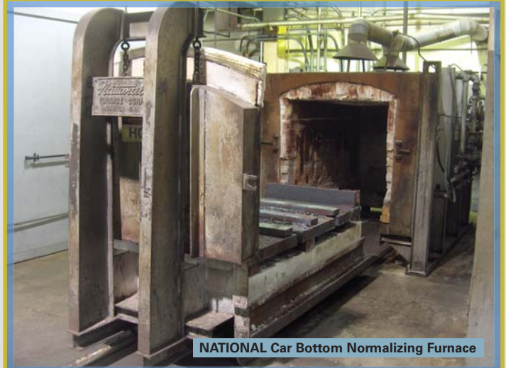
NATIONAL Car Bottom Normalizing Furnace