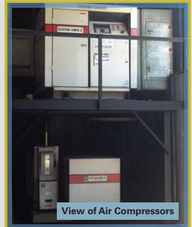
View of Air Compressors