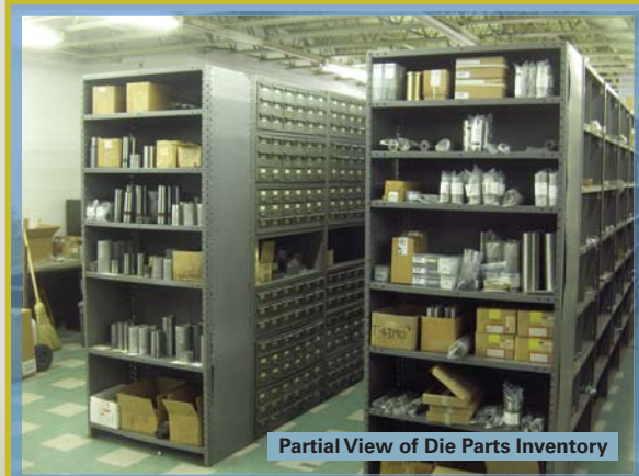
Partial View of Die Parts Inventory