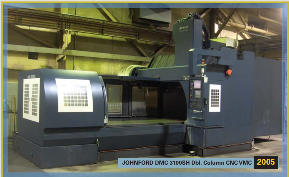
JOHNFORD DMC 3100SH Dbl. Column CNC VMC 2005