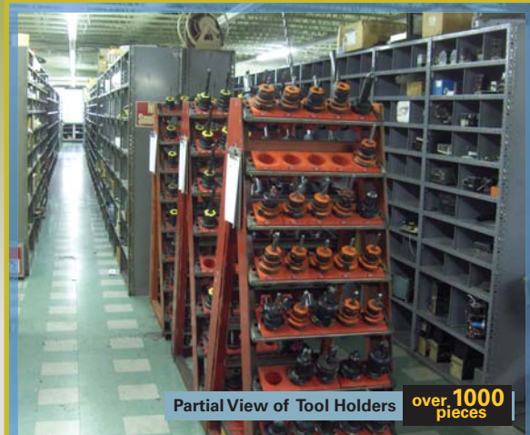
Partial View of Tool Holders