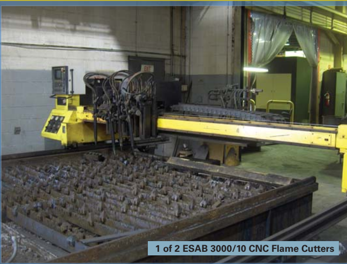
1 of 2 ESAB 3000/10 CNC Flame Cutters