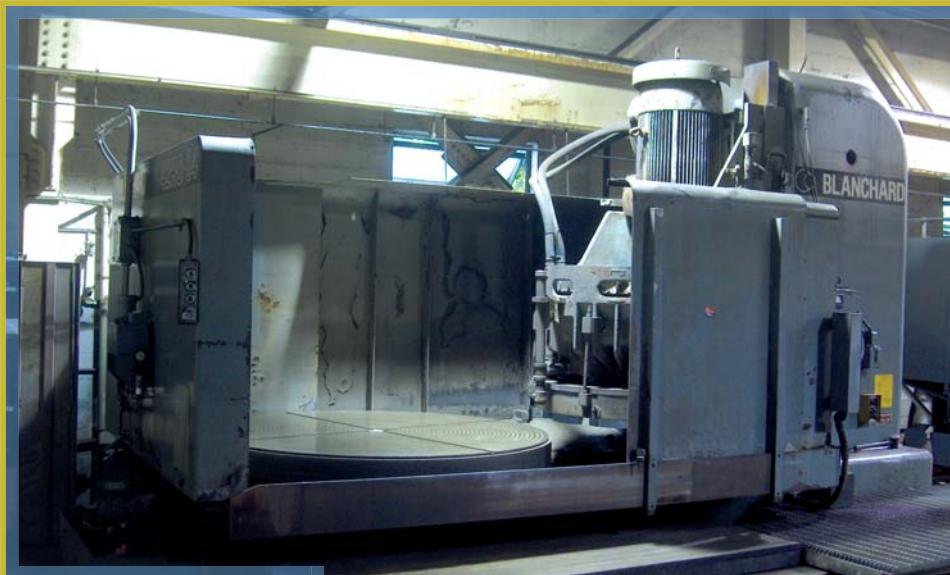
BLANCHARD 42HD-84 Rotary Surface Grinder 1981 | 250 HP