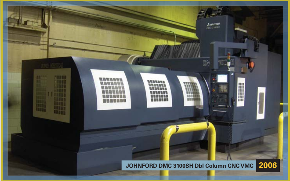
JOHNFORD DMC 3100SH Dbl Column CNC VMC 2006