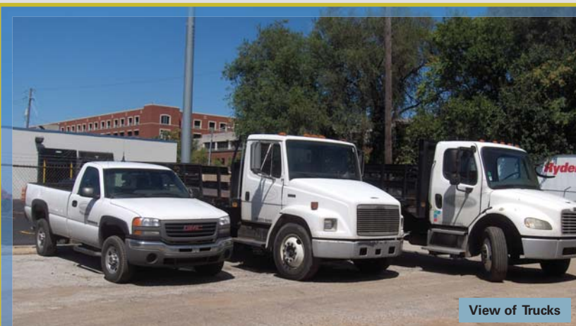
View of Trucks