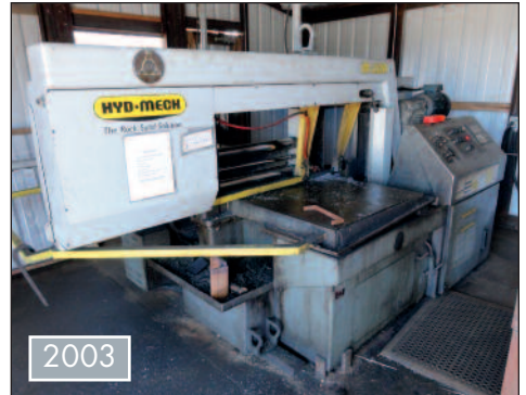
HYD MECH MODEL M-20A