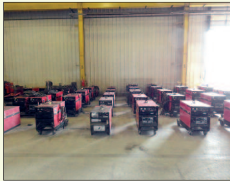
VIEW OF LINCOLN IDEALARC DC 600 WELDERS