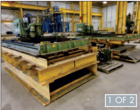
HEARN MODEL SDT7AC RAIL DRILL 5 X10'