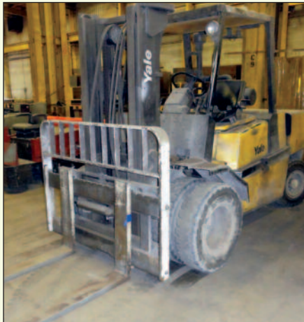
YALE MODEL GDP110, 11,000 LB. CAP DIESEL FORKLIFT TRUCK