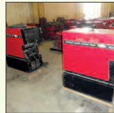
VIEW OF LINCOLN DC 600 WELDERS