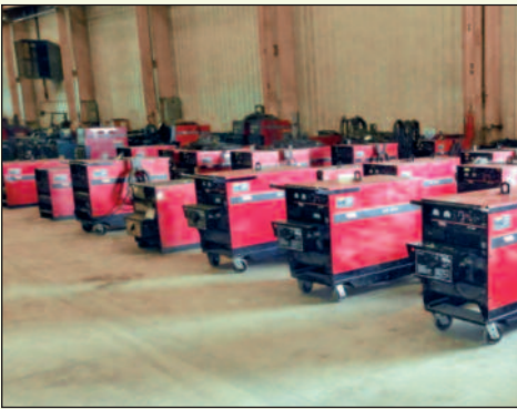
VIEW OF LINCOLN IDEALARC DC 600 WELDERS