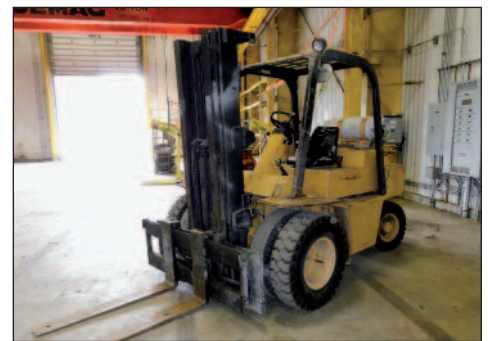
CATERPILLAR LP FORK TRUCK, MODEL 90E, 8000 LB CAP