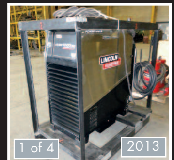
LINCOLN ELECTRIC ACDC 1000SD POWERWAVE SUBARC WELDERS W/ NEW LINCOLN CRUISER TRACTOR SYSTEMS

VISIT THE ONLINE LOT CATALOG FOR THE COMPLETE AUCTION OFFERING