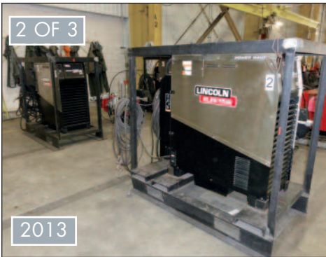
LINCOLN ELECTRIC ACDC 1000SD POWERWAVE SUBARC WELDERS