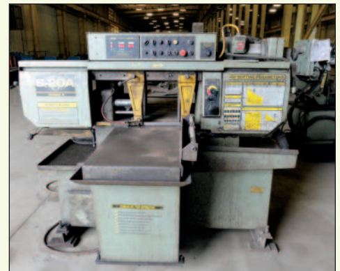
HYD MECH MODEL S 20 A HORIZ BAND SAW