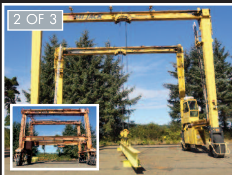
MI-JACK 50 TON TRAVELIFT GANTRY CRANES, MODEL 1000R & 750D

Major Fabricator of Structural Steel Bridges Featuring Equipment as late as 2013