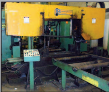
GERNETTI SHN38-18 TWIN COLUMN HORIZ. BAND SAW 38 X 18 SQUARE CAP.

THE GERNETTI SAW WILL BE OFFERED SEPARATELY FROM THE BEAM-LINE, PLEASE CONTACT AUCTIONEER WITH QUESTIONS