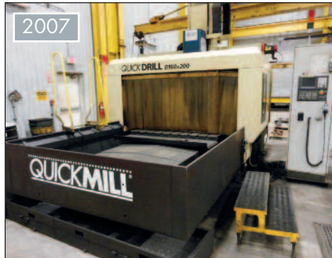
QUICKMILL QUICK DRILL MODEL B160 X 200