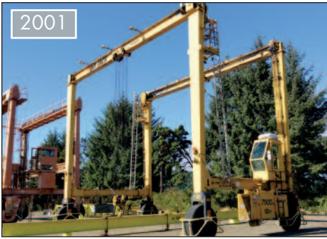
MI JACK 750D