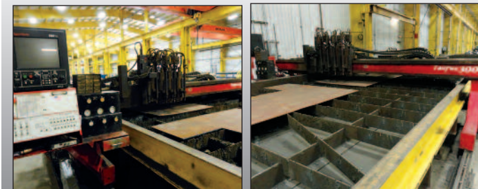
CG SYSTEMS TAURUS 3000 BURN TABLE SYSTEM, PLASMA ARC