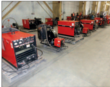
PARTIAL VIEW OF LINCOLN IDEALARC DC 600 WELDERS