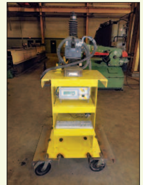
COUTH DOT MARKING MACHINE ENGRAVER