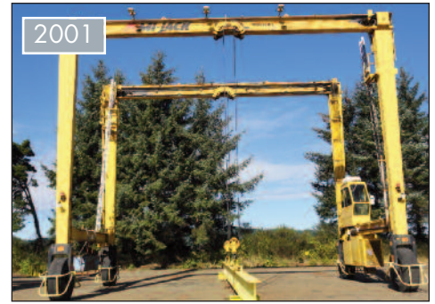
MI-JACK 50 TON TRAVELIFT GANTRY CRANE, MODEL 750D