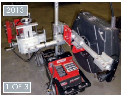
LINCOLN CRUISER SUBMERGED ARC TRACTOR SYSTEM