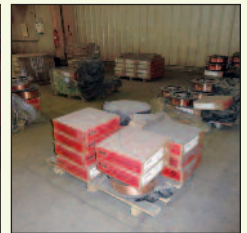
VIEW OF WELDING WIRE