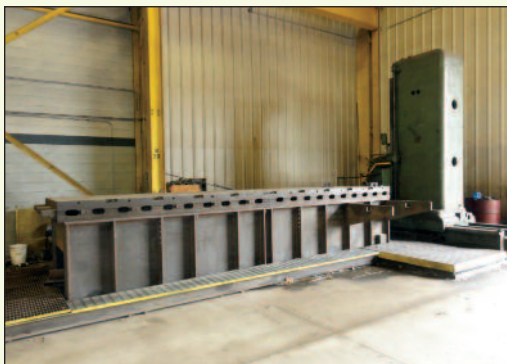
SELLERS HORIZONTAL BORING MILL