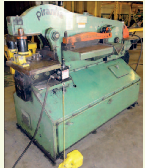
PIRANHA 90 TON IRONWORKER