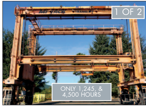
MI-JACK 50 TON TRAVELIFT GANTRY CRANES, MODEL 1000R