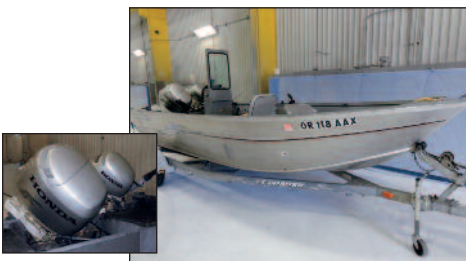
ALUMAWELD SUPER VEE, 19 FT ALUMINUM BOAT