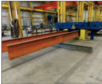
HYDRAULIC FLANGE TABLE