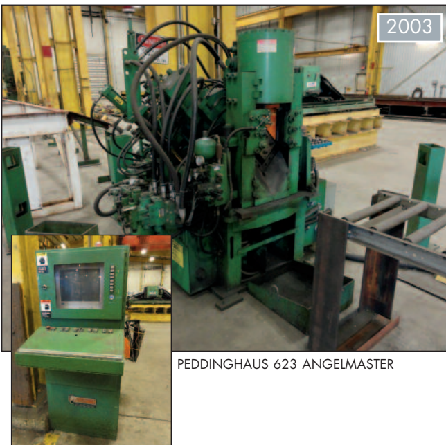
PEDDINGHAUS 623 ANGELMASTER