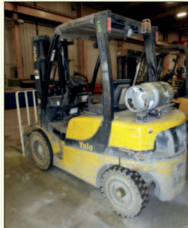
YALE 4800 LB, CAP PROPANE FORKLIFT TRUCK