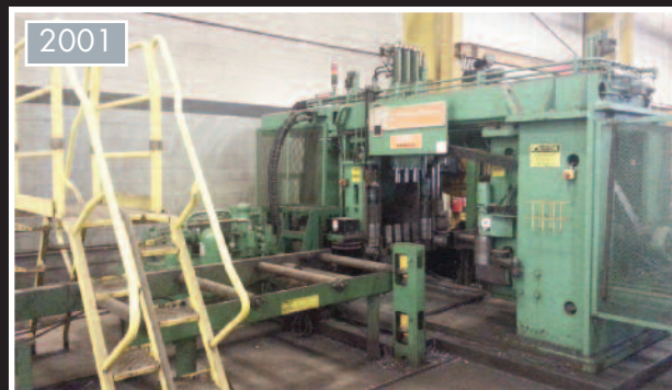
PEDDINGHAUS MODEL 'BDL-1250/9A AUTOMATED (9) SPINDLE CNC STRUCTURAL BEAM DRILLING SYSTEM