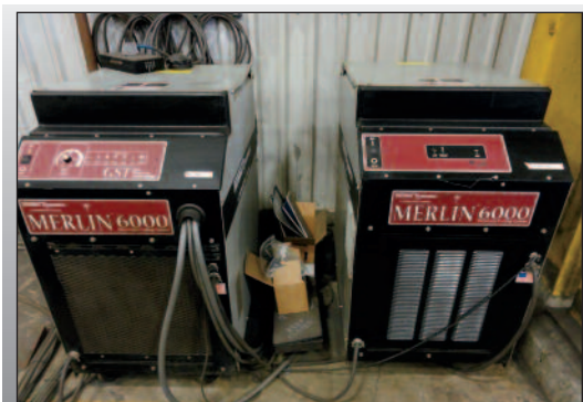
THERMAL DYNAMICS 6000 MAXIMIZER CUTTING SYSTEMS