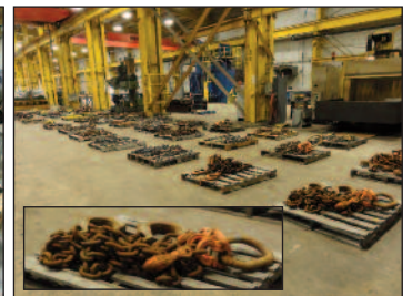
HEAVY LIFTING CHAINS