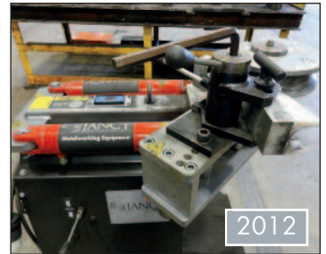
JANCY JB 2500 TUBE PIPE BENDER