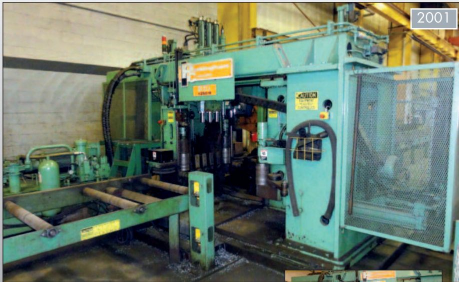
PEDDINGHAUS MODEL 'BDL-1250/9A AUTOMATED (9) SPINDLE CNC STRUCTURAL BEAM DRILLING SYSTEM