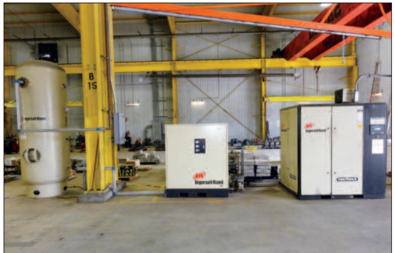
IR AIR COMPRESSOR, MODEL IRN 75H, 75 HP WITH IR AIR DRYER