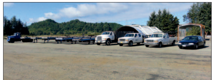
VEHICLES & TRAILERS