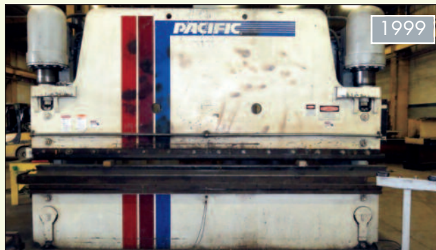
PACIFIC 400 TON PRESS BRAKE MODEL K 400-12-10