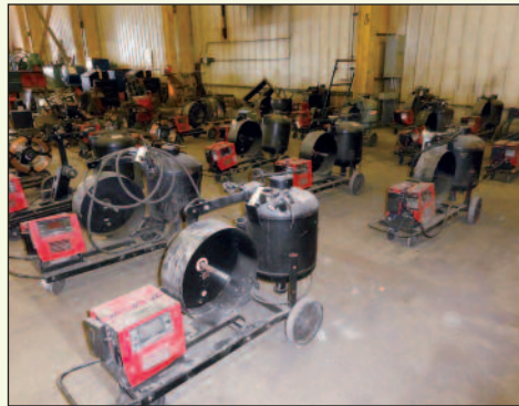
VIEW OF WIRE FEEDERS