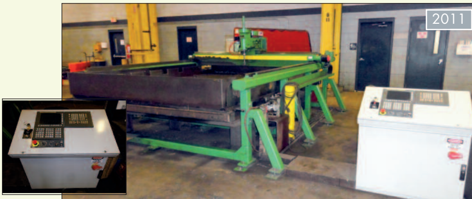
2011 HEARN CNC DRILL MODEL SDT 7AC