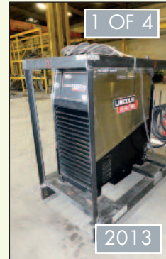
LINCOLN POWERWAVE ACDC 1000 WELDERS