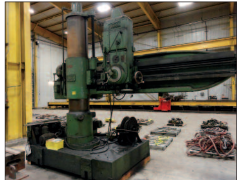
FOSDICK RADIAL ARM DRILL