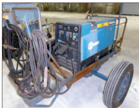
MILLER BOBCAT WELDER