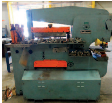
SCOTCHMAN 120 TON IRON WORKER