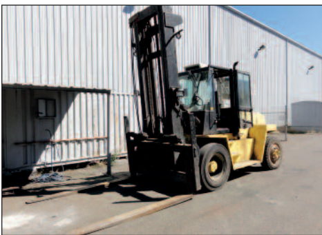
HYSTER DIESEL FORKLIFT TRUCK, MODEL H280XL, 30,000 LB CAP