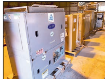
(20+) NEW AC SYSTEMS