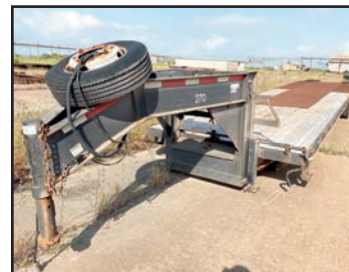
SELECTION OF TRAILERS

HP Air Compressors. Motor Building —Over (100) Motors up to 200 HP, (24) Sections of Maintenance Crib, Over (120) Sections of Pallet Racking. Stock Yards —Plate, Sheet, Bar & Tube Stock,