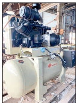
INGERSOLL RAND 2000 AIR COMPRESSOR