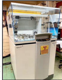
MALVERN PANALYTICAL AXIOS MAX X-RAY FLUORESCENCE SPECTROMETER