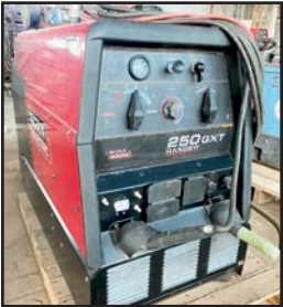
LARGE ASSORTMENT OF WELDER-GENERATORS