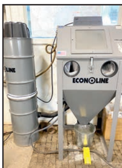
ECONOLINE BLAST CABINET