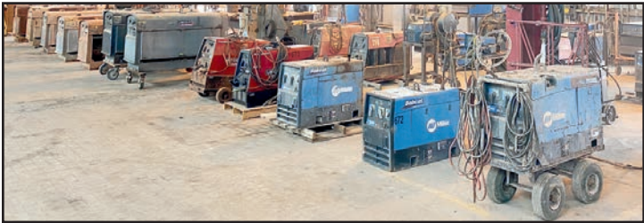
VIEW OF WELDERS

FEATURING: Woodworking Shop —Jointers, Planers, Panel, Table & Miter Saws, Stronghold Cabinets, Positioner, Horizontal Bandsaws, (20) WARMAN Pumps w/WEG Motors up to 350 HP, Powered Wheelbarrows – Rotary 2-Post Vehicle Lifts, Diagnostics & Testing Equipment, Complete Automotive Maintenance Crane Lift, COATS & BRANICK Tire & Wheel Equipment, Large Assortment of Tires. Rolling Stock Yard – FOM Terrain Loaders, Skid Steers, TENNANT Floor Scrubbers, KUBOTA Utility Vehicles, Assorted Trailers