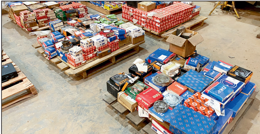
HUGE QUANTITY OF BEARINGS