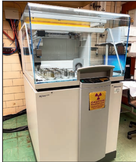
MALVERN PANALYTICAL AXIOS MAX X-RAY FLUORESCENCE SPECTROMETER