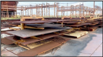
SHEET AND PLATE