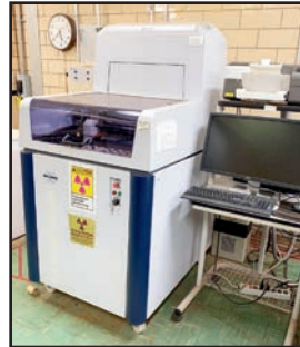
BRUKER D4 ENDEAVOR X-RAY