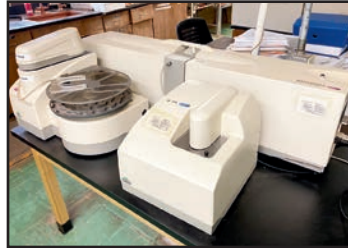
MALVERN HYDRO 200G MASTERSIZER PARTS ANALYZER