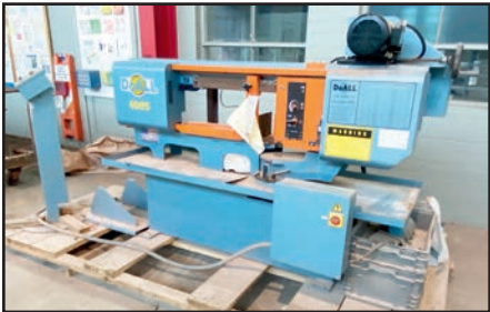
2014 DOALL 400S HORIZONTAL BANDSAW