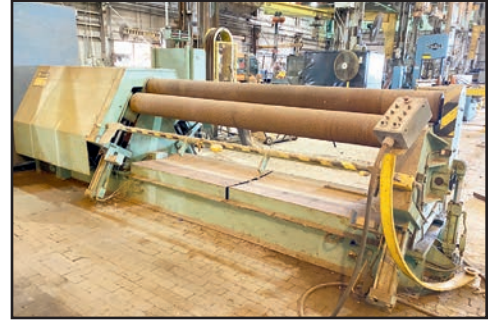
BERTSCH PLATE BENDING ROLL