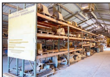
BLOWERS, REELS AND MORE