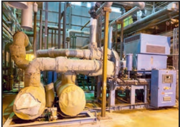
(3) INGERSOLL RAND CENTAC 2000 HP AIR COMPRESSORS