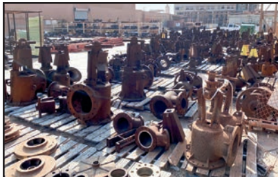
HUNDREDS OF VALVES