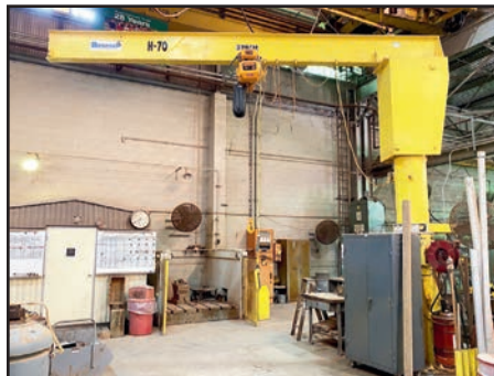
BUSHMAN 3-TON FREE STANDING JIB CRANE