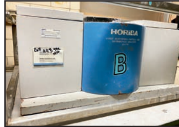
HORIBA LA-910 LASER SCATTERING PARTICLE SIZE DISTRIBUTION ANALYZER