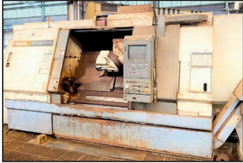
MAZAK INTEGREX 35 TURNING MILLING CENTER

FEATURING: Complete Machine Shop – CNC & Conventional Lathes, Plate Bending Rolls, Shears, Press Brakes, Bandsaws, Ironworker, Radial Arm Drills, Boring Mills, VTLs, Welding Positioners & Tank Turning Rolls, Welders, Plasma Cutting Systems, Tooling, Vises, Motors, Bearings, Tool Boxes, Power & Hand Tools, Steel Tables, Cabinets, Bridge & Jib Cranes, Rigging Straps, Chainfall, PPE, Shop Fans & More