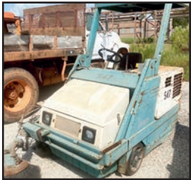
TENNANT 235 FLOOR SCRUBBER