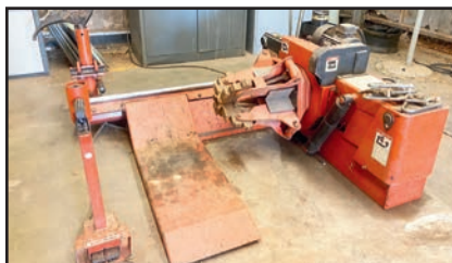
COATS ACCU 4440 ELECTRIC-HYDRAULIC TIRE CHANGER