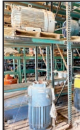
MOTORS AND VALVES WAREHOUSE