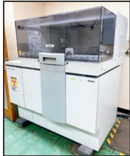
PHILIPS PW24104 X-RAY SPECTROMETER