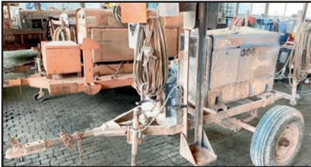
VIEW OF WELDER GENERATORS