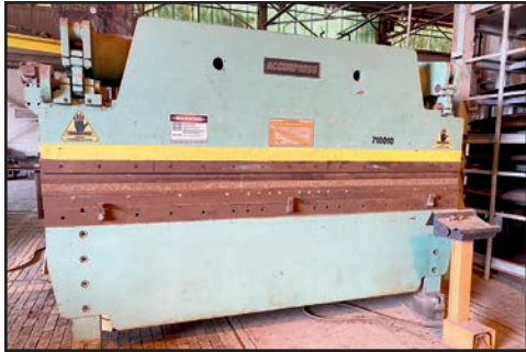
ACCURPRESS 710010 PRESS BRAKE