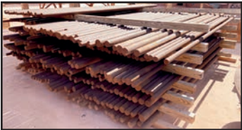
VIEW OF BAR STOCK