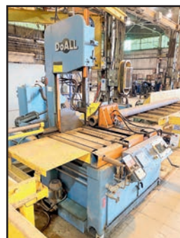
2012 DOALL TF-2525 VERTICAL BANDSAW