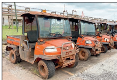
KUBOTA UTILITY VEHICLES