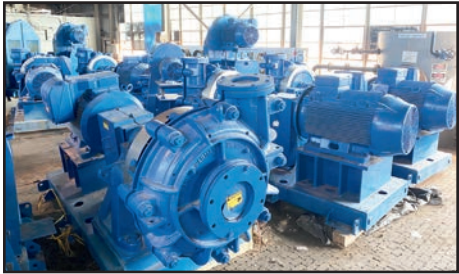
(21) WARMEN PUMPS W/WEG MOTORS UP TO 350 HP