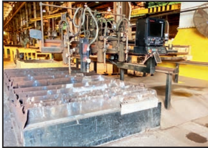
ESAB CM-250 PLASMA AND TORCH CUTTING SYSTEM