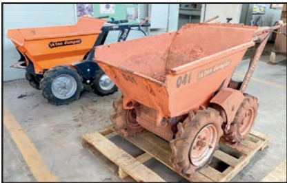
MUCKTRUCK POWERED WHEELBARROWS