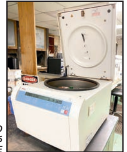
THERMO SCIENTIFIC ST16 CENTRIFUGE