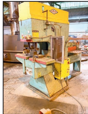
METAL MUNCHER MM-135 IRONWORKER