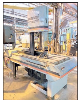
MARVEL SERIES 8 MARK II VERTICAL BANDSAW

SALE LOCATION Hwy. 35, Point Comfort, TX