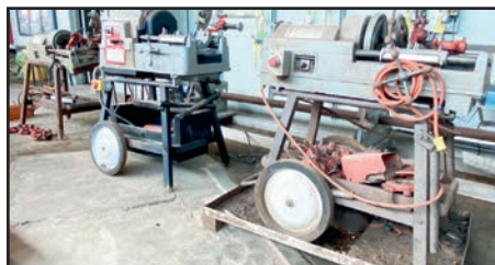
RIDGID 535 PIPE THREADERS

Transits, Power & Pneumatic Tools & More. Learning Center ver (50) Welders & Generators, Albarrows, TENNANT Floor Scrubbers, Air Compressors, Pipe Threaders & More. Automotive Shop rib, VIDMAR Cabinets, Power & Pneumatic Tools & More. Tire Repair Shop – Rotary 2-Post Vehicle RD Trucks & Buses, HYSTER KD 8,000 Lb Karry Crane, CAT Forklifts, CAT Excavator, CASE Multi-