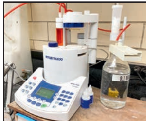
METTLER TOLEDO DL15 TITRATOR