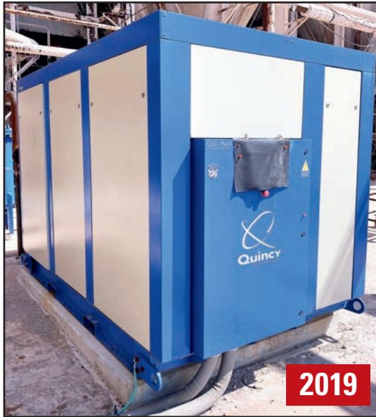
(2) QUINCY QSI-1500 300 HP AIR COMPRESSORS

UNPRECEDENTED OFFERING OF THOUSANDS OF LOTS FOR ALCOA'S POINT COMFORT, TEXAS