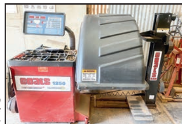
COATS 1250 DIRECT DRIVE WHEEL BALANCER