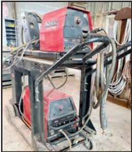
VIEW OF WELDERS