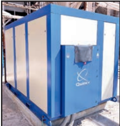
2019 QUINCY QSI-1500 300 HP AIR COMPRESSORS

FEATURING: (2) 2019 QUINCY QSI-1500 300 HP Air Compressors, (3) INGERSOLL RAND CENTAC 2000 Tear Drop Pallet Racking. Complete Warehouse —Over (100) Motors, Large Assortment of Valves, Main Timber, Hundreds of Valves & Spare Parts, Cable Spools & More.