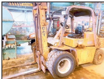
CAT V80E FORKLIFT