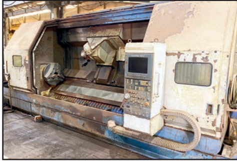
MAZAK INTEGREX 60 3000U TURNING MILLING CENTER