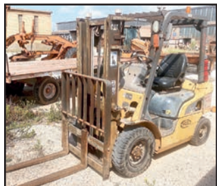
CAT P4000 FORKLIFT