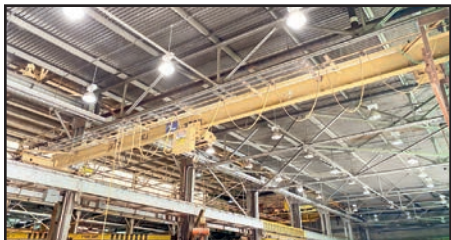
AIR SPECIALTY 2-TON SINGLE RAIL BRIDGE CRANE