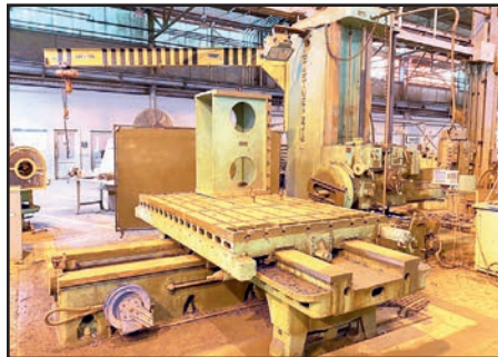
GIDDING & LEWIS 350-T HORIZONTAL BORING MILL