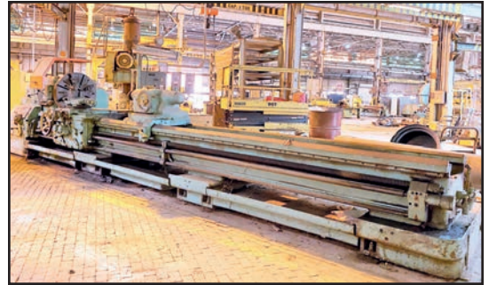
AXELSON A3419 LATHE