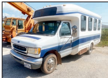
FORD E-350 THOR TOUR BUS