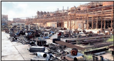
LARGE ASSORTED OF BUSHINGS, ROTORS AND SPARES