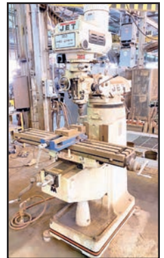
JET MILLING MACHINE