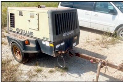
SULLAIR 185DP0 CA3 AIR COMPRESSOR