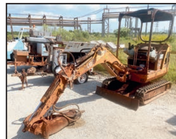
CAT 301.8C MINI EXCAVATOR