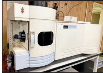
PERKIN ELMER OPTIMA 5300 V OPTICAL EMISSION SPECTROMETER

FEATURING: Complete Metallurgical Lab—X-Ray Machines, Particle Analyzers, Refrigerated Samplers, Parts Analyzers, Titrators, Mercury Analyzers, Spectrometers, Centrifuges, Lab Ovens & Furnaces, Microscopes, Water Baths, Turbidimeters, Glassware, Air Compressors & More, Warehouse w/Over (20) *New* Carrier & Bryant Air Conditioning Systems, Multiple Buildings Throughout Campus w/Hundreds of Stronghold Cabinets, Large Assortments of Bearings, Motors, Electrical Supplies, Test Equipment, Blowers, House Reels, Welders, Grinders, Sanders, Pipe Threaders, Saws, Hand & Power Tools, Multiple Cribbs & Much More.