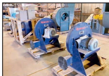
BLOWERS AND MORE