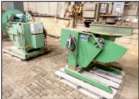
(2) CWI 36" WELDING POSITIONERS