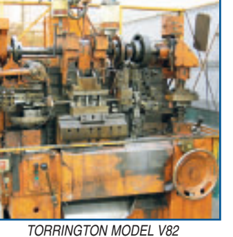
TORRINGTON MODEL V82 VERTI-SLIDE

BIHLER MODEL GRM-80 WIRE FORMING MACHINE