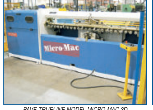
PAVE TRUELINE MODEL MICRO-MAC 3D CNC WIRE FORMING MACHIINE

60 TON MINSTER MODEL NO. 6 O.B.I MECHANICAL PRESS