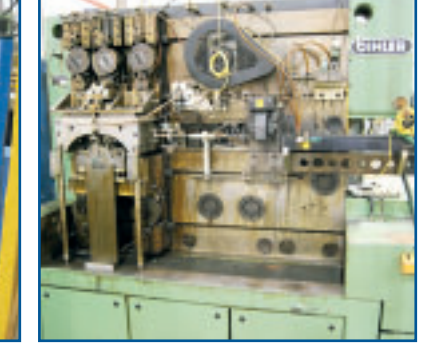
BIHLER MODEL BZ-2 WIRE FORMING MACHINE