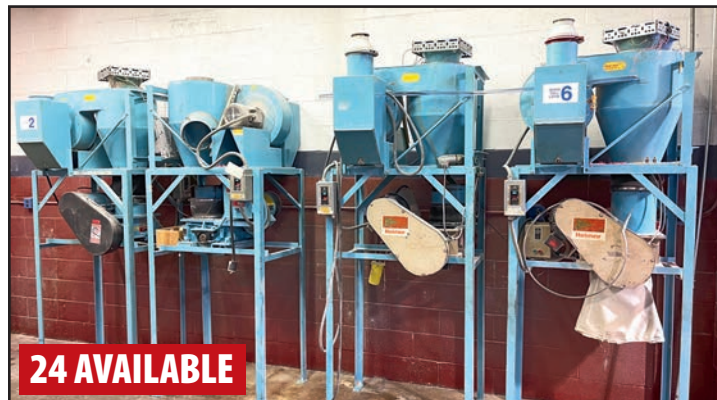
NELMOR G810P1 AND G810M1 GRANULATORS