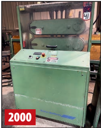
BOSTON MATTHEWS CATERPULLER (EXTRUSION LINE #1)