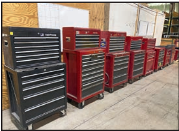
ROLLING TOOL CHESTS