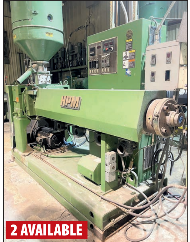
EXTRUSION LINE W/HPM 3.5" EXTRUDER