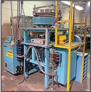
PAINT LINE W/VIBRO BLOCK 30L BOWL FEEDER

CENTRAL MACHINERY T-149 HEAVY DUTY DRILL PRESS, 9-Speed, 15-2,220 RPM Spindle Speed, 1.5 HP