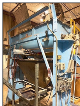
S. HOWES 4012 BLENDER/LOADER SYSTEM (COMPOUNDING LINE)

CUMBERLAND 24B GRANULATOR, s/n 58500-90003