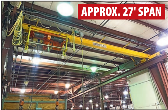
ATLANTIC CRANE 2-TON BRIDGE CRANE