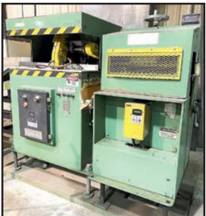
RDN CATERPULLER AND RDN TRAVELING SAW (EXTRUSION LINE #6)

Pre-Auction Offers Invited on Major Assets