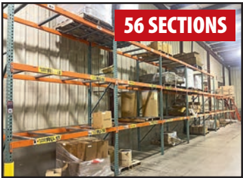
ASSORTED PALLET RACKING