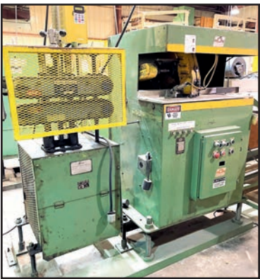
BOSTON MATTHEWS/FARRIS CATERPULLER AND RDN AUTO SAW (EXTRUSION LINE #5)