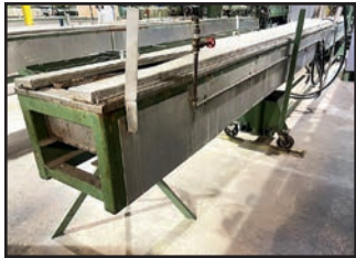
HEATED WATER BATH (EXTRUSION LINE #1)