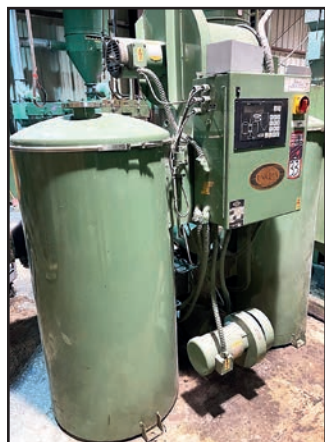
UNA-DYN DHD-8 SB HP DEHUMIDIFIER HOPPER DRYER