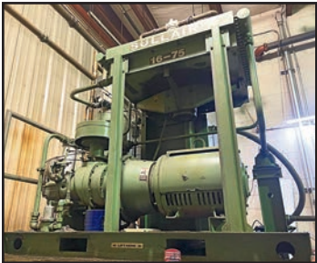
SULLAIR 16-75 75 HP ROTARY SCREW AIR COMPRESSOR

ALLIS CHALMERS C50 LPS 5,000 LB LPG FORKLIFT, s/n AJQ521854 KOMATSU FG15ST-15 3,000 LB LPG FORKLIFT, s/n 364064A, w/3-Stage Mast, Side Shift KALMAR AC C30 2,220 LB LPG FORKLIFT, s/n 181412A, w/3-Stage Mast