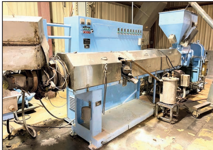
PRODEX 4.5" EXTRUDER (COMPOUNDING LINE)