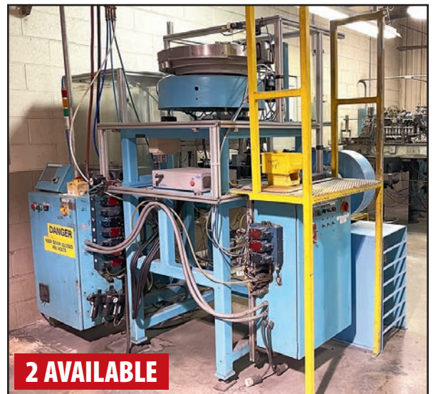
PAINT LINE W/VIBRO BLOCK BOWL FEEDER