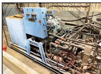
REFRIGERATION SYSTEM CCM-R-020-1PTT0 CHILLER SYSTEM (COMPOUNDING LINE)