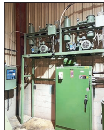
HPM PRODEX I 3.5" VACUUM LOADER POWER UNIT W/(6) HOPPERS