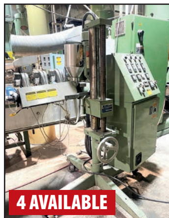
KILLION KTS-100 1" SIDE EXTRUDERS

Pre-Auction Offers Invited on Major Assets