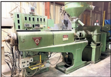
PRODEX C350-24 3.5" EXTRUDER (EXTRUSION LINE #6)