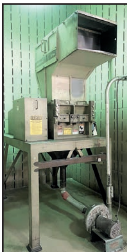
CUMBERLAND 24B GRANULATOR