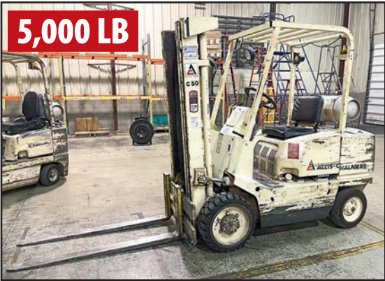
ALLIS CHALMERS C50 LPS LPG FORKLIFT