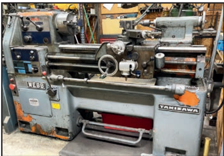
TAKISAWA WEBB TSL-800 DELUXE LATHE