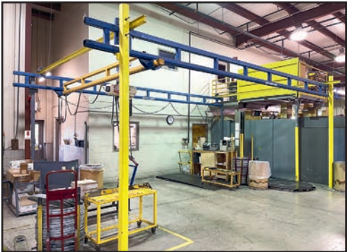
GORBEL 1/2-TON FREE STANDING BRIDGE CRANE