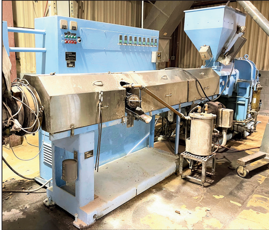
COMPOUNDING LINE W/PRODEX 4.5" EXTRUDER

FEATURING: Plastic Extrusion Lines & Ancillary Equipment, Granulators, Screw Machines, Drilling, Cut-Offs, Paint Lines, Acetone Dip Wash Lines, Heated Stamp Machines, Compressors, Maintenance, Pallet Racking & Facility Support