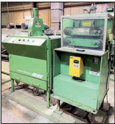
RDN CATERPULLER AND BOSTON MATTHEWS CUT-OFF (EXTRUSION LINE #4)