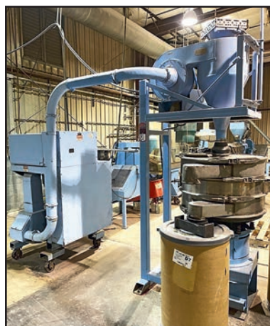
CUMBERLAND 6 QUIETIZER PELLETIZER W/VACUUM AND SEPARATOR (COMPOUNDING LINE)