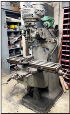
PAINT LINE W/VIBRO BLOCK 1C-0 BOWL FEEDER BRIDGEPORT MILLING MACHINE