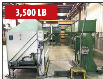
NATIONAL BULK EQUIPMENT SP-DUMPSTER ROPAK LOADER

INSPECTION Monday, November 1, by Appointment Only