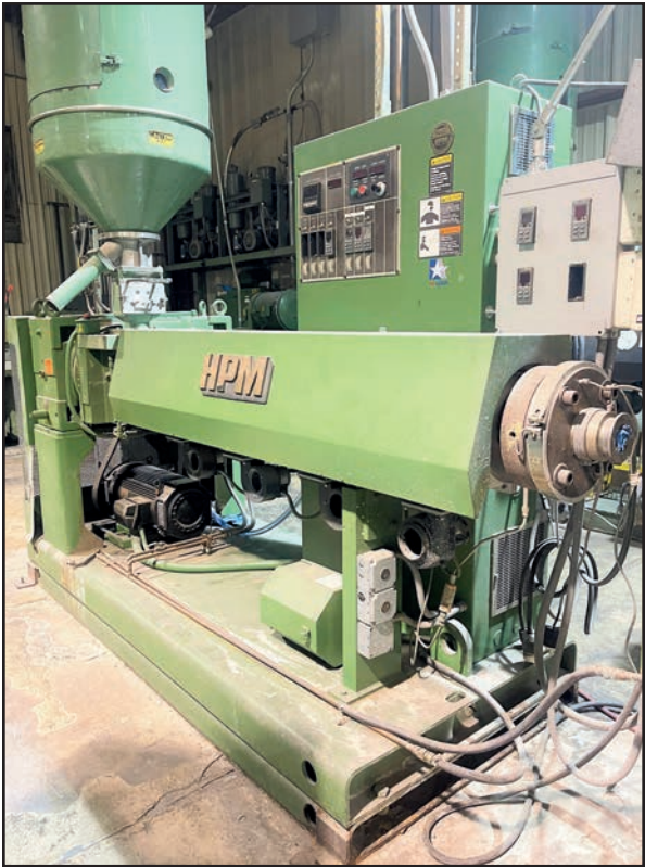
HPM 3.5 TMC 3.5" EXTRUDER (EXTRUSION LINE #1)