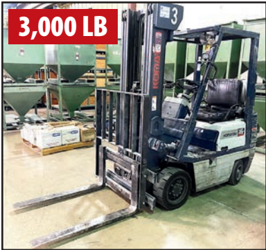
KOMATSU FG15ST-15 LPG FORKLIFT