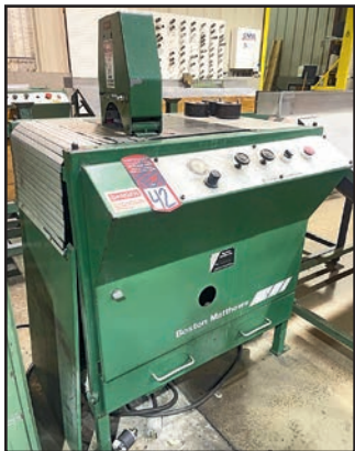
BOSTON MATTHEWS AS75 UP-STROKING TRAVELING CUT-OFF (EXTRUSION LINE #1)