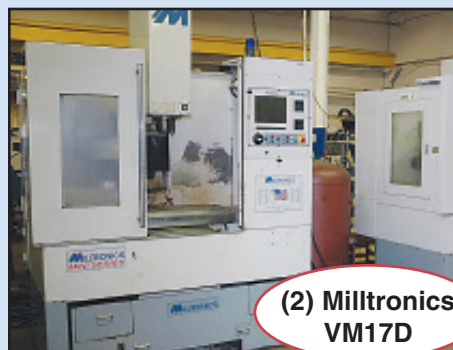
(2) Milltronics VM17D