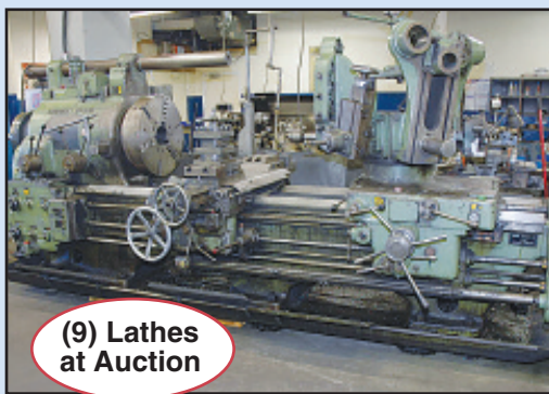
(9) Lathes at Auction