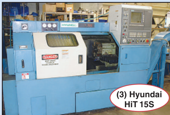
(3) Hyundai HiT 15S

CNC Turning Centers • CNC Vertical Machining Centers • CNC Mills • Wire EDM • Jig Mills Lathes • Horizontal Mills • Vertical Mills • Keyseater • Slotter • Grinders • Drills • Band Saws Hone • Rotary Tables • Forklifts • Air Compressors • Inspection Equipment • Hand Tools Factory Equipment • Perishable Tooling • Van • Office Furniture & Equipment • Real Estate