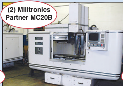
(2) Milltronics Partner MC20B