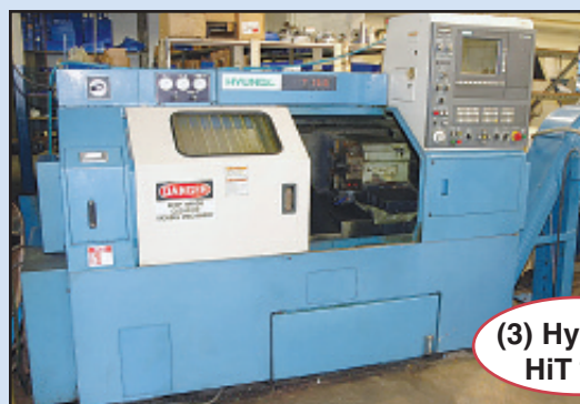
(3) Hyundai HiT 15S