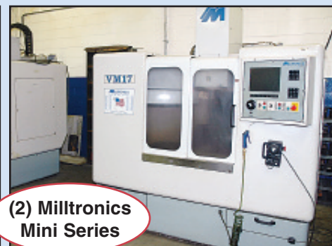
(2) Milltronics Mini Series