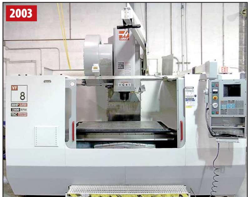
2003 HAAS VF8/50 VERTICAL MACHINING CENTER

Advanced Energy Systems, Inc. specialized in advance radiation sources based upon high-brightness electron accelerator technology for science, defense, homeland security and medical.