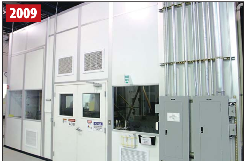
BCP NEGATIVE PRESSURE EXHAUST ROOM

View our current auction schedule at www.perfectionindustrial.com