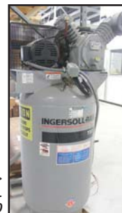
INGERSOLL RAND T30 COMPRESSOR