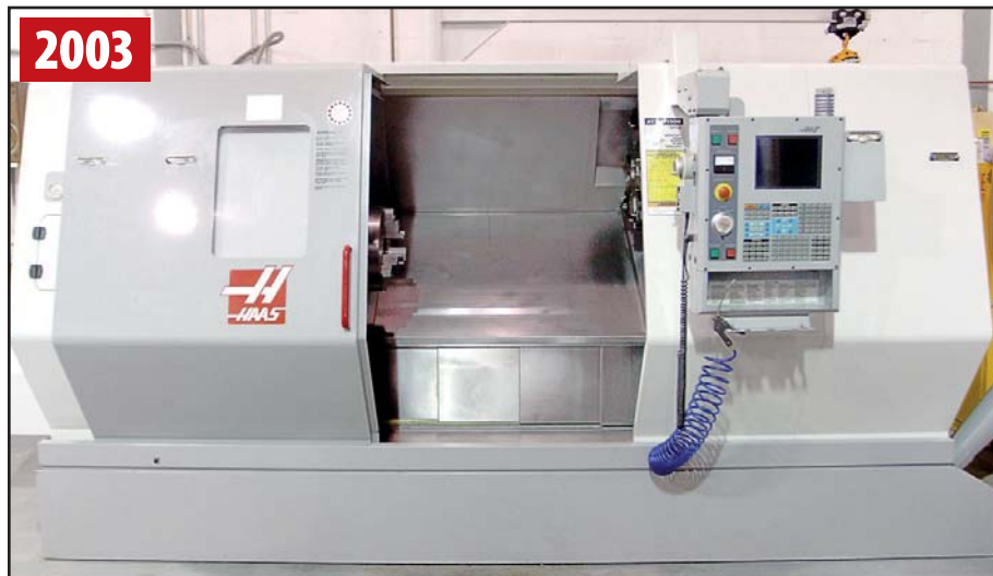
HAAS SL-40T CNC LATHE