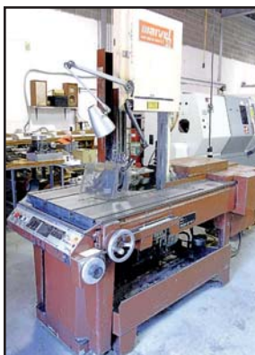
MARVEL SERIES 8 MARK I VERTICAL BANDSAW

2010 COGAN USA 150 PSF MEZZANINE , s/n 104974M, w/16' W x 32" Section, 112" Under Deck