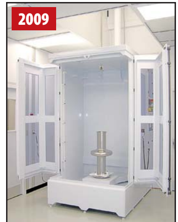
SRF CAVITY PROCESSING CENTER