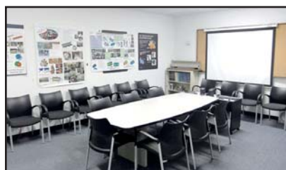
PRESENTATION ROOM FURNITURE