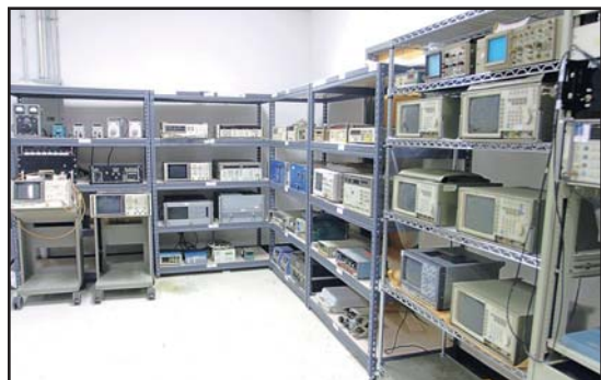
SELECTION OF TEST EQUIPMENT