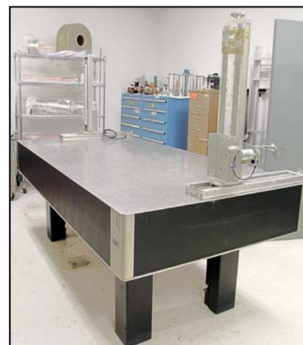
TMC 96" X 48" OPTICAL TABLE

ALSO: LARGE QUANTITY OF AGILENT, HEWLETT PACKARD, TEKTRONIX, HITACHI, LECROY, WAVETEK AND WILTRON NETWORK ANALYZERS, UNIVERSAL COUNTERS, OSCILLOSCOPES, POWER METERS, SIGNAL GENERATORS AND VOLTMETERS