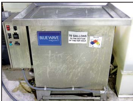
BLUEWAVE 78 GALLON ULTRASONIC CLEANER