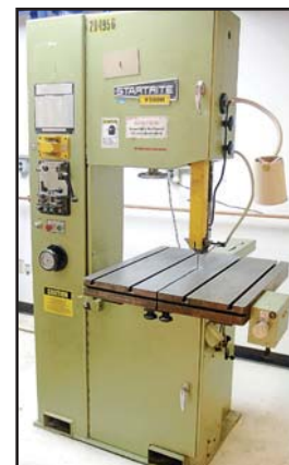
STARTRITE V500H VERTICAL BANDSAW