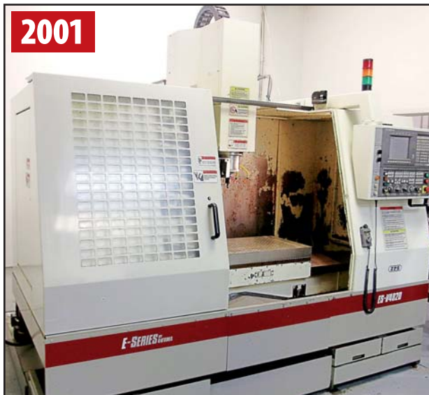
OKUMA ES-V4020 VERTICAL MACHINING CENTER