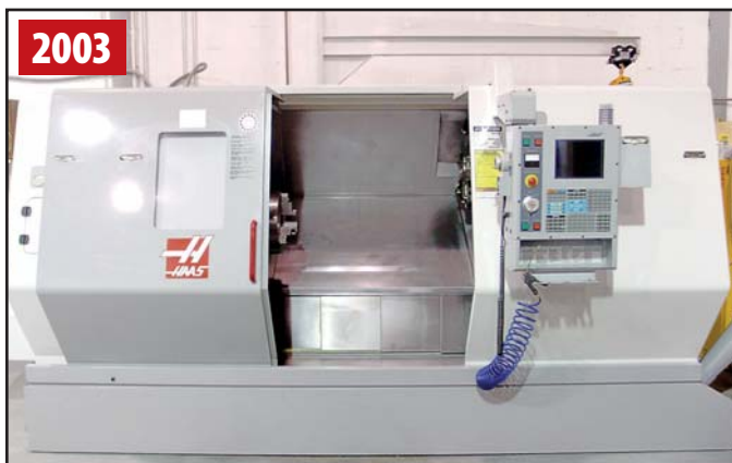
2003 HAAS SL-40T CNC LATHE