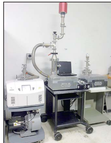
VARIAN LEAK TESTERS