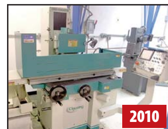
CLAUSING CSG-1224 ASDII GRINDER

SEALED AIR CORP. SP-4261 FOAM IN-BAG SPEEDYPACKER SYSTEM, (3) BALLYMOOR 800 LB ROLLING STEPS, PALLET RACKING, BARREL LIFTER, WELDING CLAMPS, DEWALT CORDLESS DRILLS, PALLET RACKING, VARIOUS WIRE SPOOLS, COUPLINGS, FITTINGS, QTY. OF LISTA BALL BEARING CABINETS AND SHOP DESKS, OVER 6,000 SQ. FT. OF OFFICE FURNITURE, COMPUTER AND OFFICE EQUIPMENT