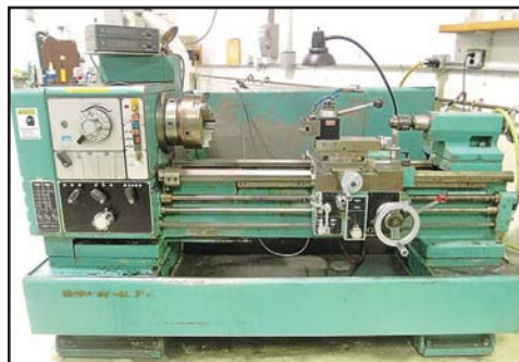
HARRISON M400 ENGINE LATHE