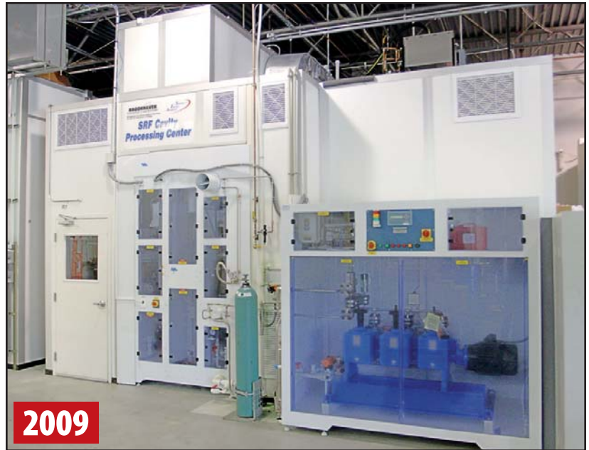
SRF CAVITY PROCESSING CENTER AND CLEAN ROOM

2009 SIMPLEX STRIP DOORS INC. , 14' Wide x 24' Deep x 15' Tall, Class 1000 and Class 100 Clean Room