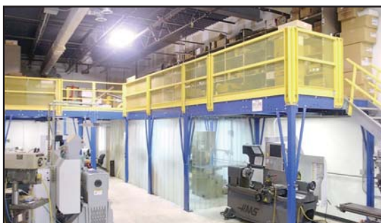
EQUIPTO 150 PSF MEZZANINE