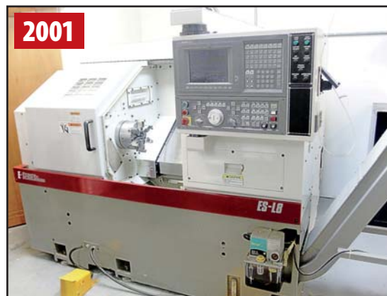
OKUMA ES-L8 CNC LATHE