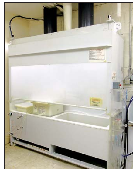
FUME HOOD CABINET