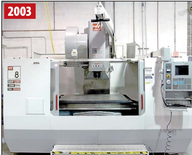
HAAS VF8/50 VERTICAL MACHINING CENTER