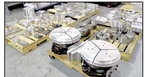
ROTARY TABLES, CHUCKS AND JAWS