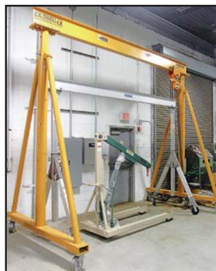
SELECTION OF A-FRAMES AND LIFTS