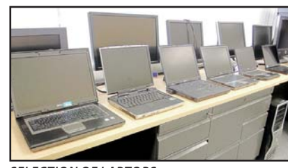
SELECTION OF LAPTOPS

View our current auction schedule at www.perfectionindustrial.com