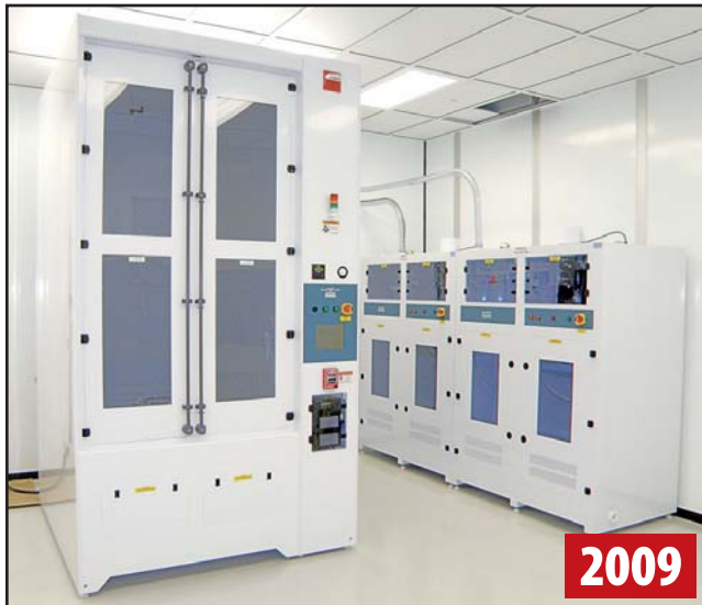
BCP CAVITY CLEANING