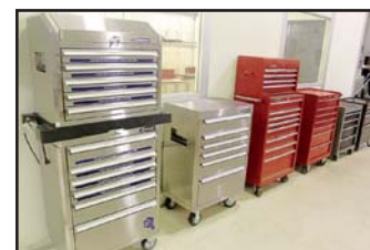
SELECTION OF BALL BEARING CABINETS