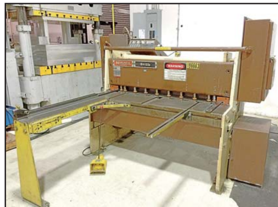
NIAGARA 1R-4 10 GA SHEAR

To discuss your requirements for an auction, please call Perfection Industrial 847-545-6374