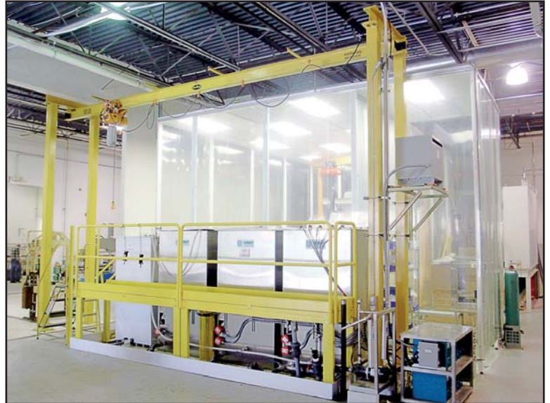
CREST 4-STAGE ULTRASONIC DIP LINE

CREST 4-STAGE ULTRASONIC DIP CLEANING LINE , w/(10) x 1,000 Watt Power Controls, (3) Stainless 430 Gallon Tanks 41" x 44" x 78" Deep, (1) Poly 381 Gallon Tank 36" x 36" x 72" Deep, Craneworks Fixed Rail, Free-Standing Crane System w/1/2-Ton Harrington Hoist, 270" Hoist Travel, Fabricated Walkway