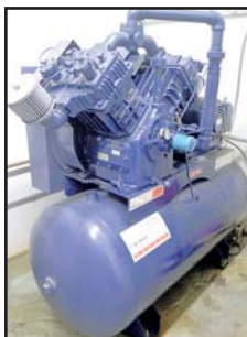
QUINCY 51200RB1-102 COMPRESSOR