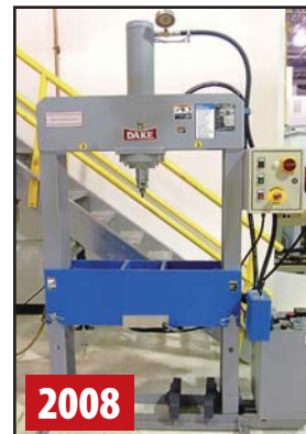
DAKE PSS40 40-TON SHOP PRESS