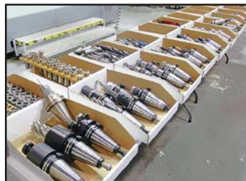
QUANTITY OF CAT 40 AND 50 TOOLING