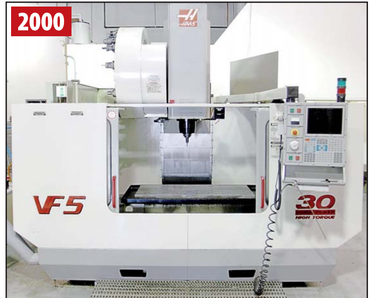
HAAS VF5 VERTICAL MACHINING CENTER