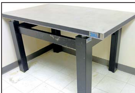
TMC 5' X 3' OPTICAL TABLE