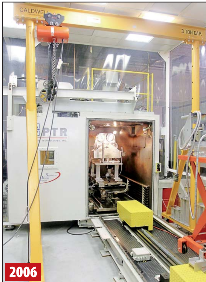
PTR ELECTRON BEAM WELDER