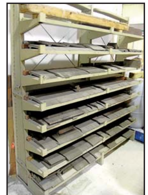
SELECTION OF PRESS BRAKE TOOLING