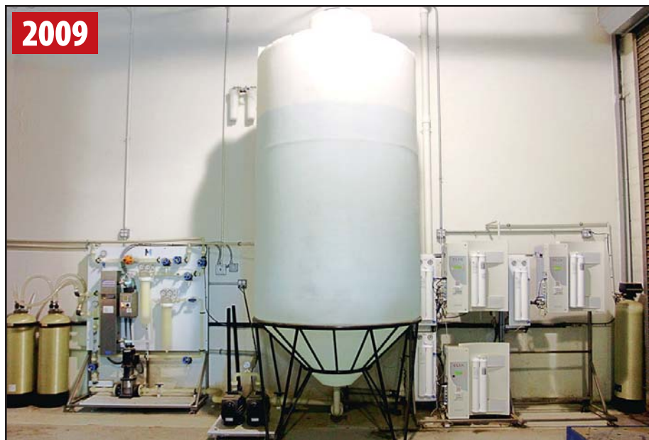
ELIX ULTRAPURE WATER SYSTEM