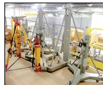
SELECTION OF MEASURING STANDS