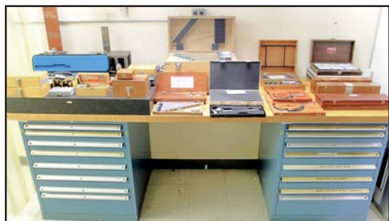
SELECTION OF INSPECTION EQUIPMENT