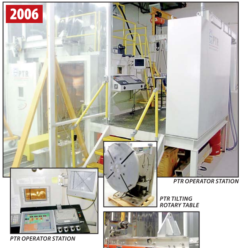
PTR OPERATOR STATION