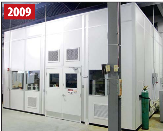
NEGATIVE PRESSURE EXHAUST ROOM