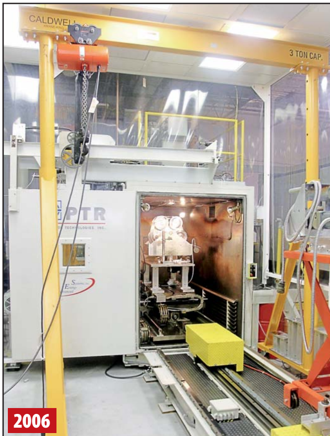
2006 PTR ELECTRON BEAM WELDER