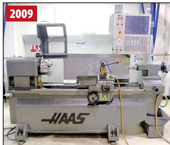
HAAS TL-2 CNC TOOLROOM LATHE