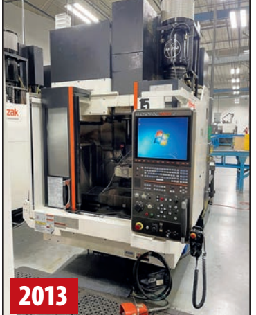
(1 OF 3) MAZAK NEXUS COMPACT 5X 5-AXIS VERTICAL MACHINING CENTERS