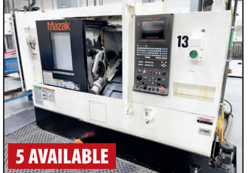
2013 MAZAK QT SMART 250 TURNING CENTER