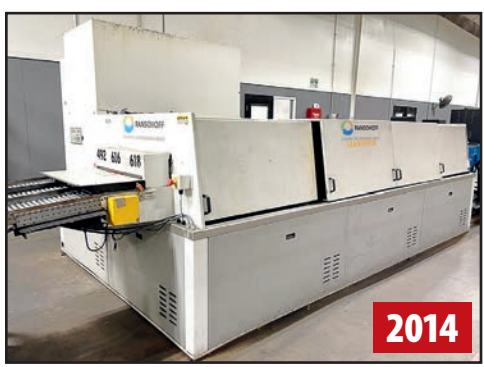
RANSOHOFF LEANVEYOR INDUSTRIAL WASHER