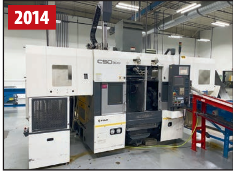
(1 OF 2) FUJI CSD300 TURNING CENTERS