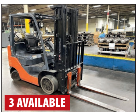
TOYOTA 8FGCU25 5,000 LB LPG FORKLIFTS

An 18% Buyer's Premium will be charged on all assets purchased by buyers providing full payment is made within 48 hours following the sale. Acceptable forms of payment are cashier's check, company check (with bank letter of guarantee) or wire transfer within 48 hours of the sale close. For any Buyers failing to pay within the 48 hour stated payment period, the Buyer's Premium will be increased to 20%. Everything will be sold to the highest bidder, in accordance with the Auctioneer's customary "Terms of Sale", copies of which will be posted on the Auctioneer's website and subject to additional terms announced the day of sale. All items are sold "As is, Where is" without any warranty, express or implied.