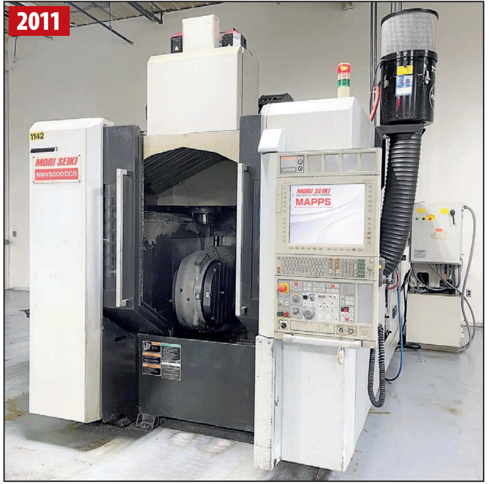
MORI SEIKI NMV5000DCG 5-AXIS VERTICAL MACHINING CENTER