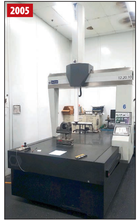
SHEFFIELD ENDEAVOR 12.20.10 CMM

COMPLETE CATALOG & INFORMATION: https://perfection.global/aaasales