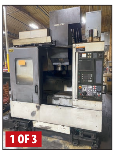
MORI SEIKI SV-400 3-AXIS VERTICAL MACHINING CENTER

(10) VERTICAL MACHINING CENTERS 2011 MORI SEIKI NMV5000DCG 5-AXIS VERTICAL MACHINING CENTER, s/n NM501KB0618, w/MSX-711IV Control, ROYAL FX1200 Filter Mist Collector, CHIPBLASTER JV40 Coolant System, Chip Conveyor