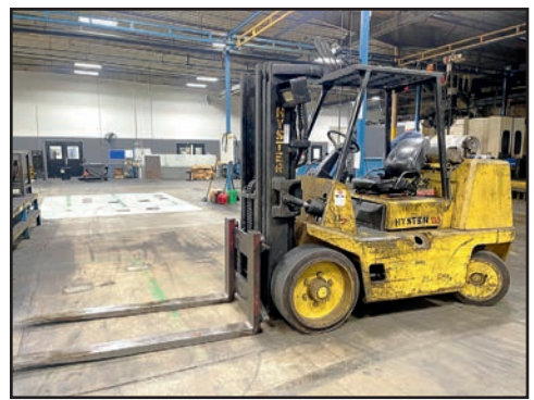
HYSTER S155XL 15.000 LB LPG FORKLIFT