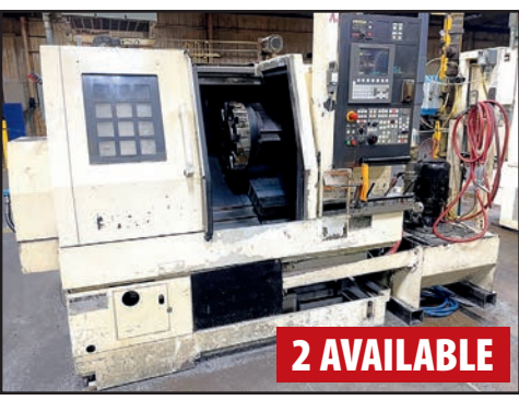
2007 MORI SEIKI DURATURN 2030 TURNING CENTER