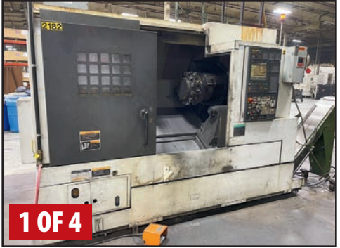
2005 MORI SEIKI NL2500/700 TURNING CENTER