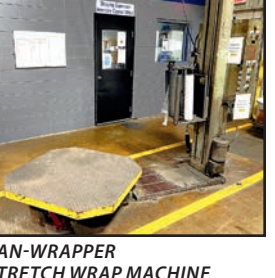
STRETCH WRAP MACHINE