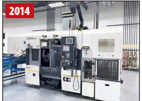
(1 OF 2) FUJI CSD300 TURNING CENTERS