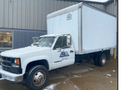
CHEVY 3500 HD BOX TRUCK