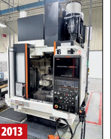
(1 OF 3) MAZAK NEXUS COMPACT 5X 5-AXIS VERTICAL MACHINING CENTERS