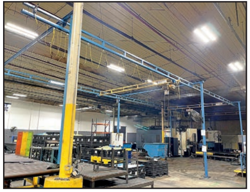
GORREL EREE STANDING CRANE SYSTEM

NILFISK ADVANCE CAPTOR 5400AXP FL POWER SWEEPER