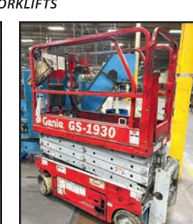
GENIE GS-1930 SCISSOR MANLIFT