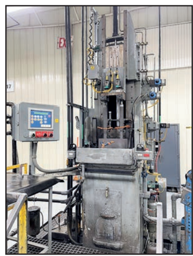
AMERICAN/BMS TR10-36 VERTICAL BROACHING MACHINE