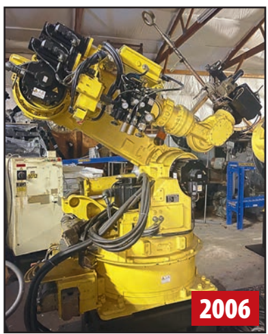
(1 OF 6) NACHI 6-AXIS ROBOTS