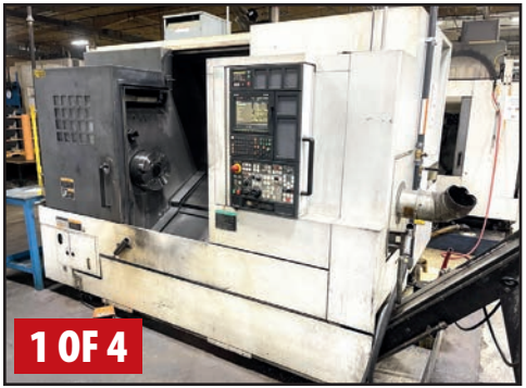
2005 MORI SEIKI NL2500/700 TURNING CENTER