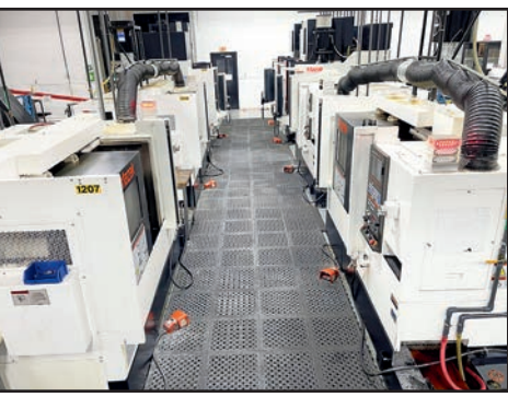
VIEW OF MAZAK TURNING CENTERS