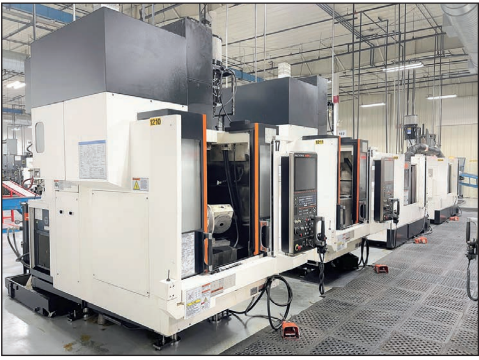
VIEW OF MAZAK VERTICAL MACHINING CENTERS

ph +1-847-545-6374 • fax +1-847-427-8884 www.perfectionindustrial.com