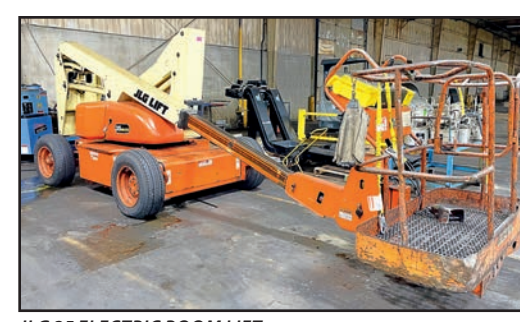
JLG 35 ELECTRIC BOOM LIFT