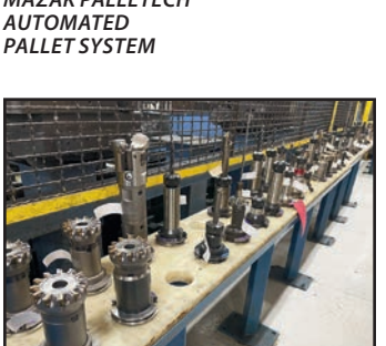
VIEW OF CAT 50 AND 40 TOOL HOLDERS