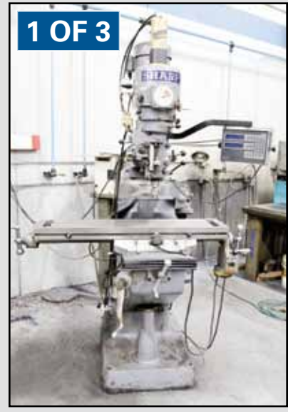
SHARP Vertical Milling Machines