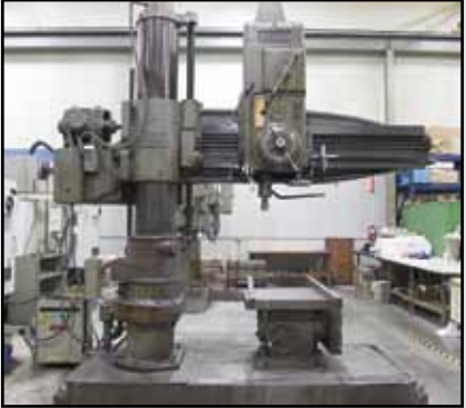
FOSDICK 6' Radial Arm Drill