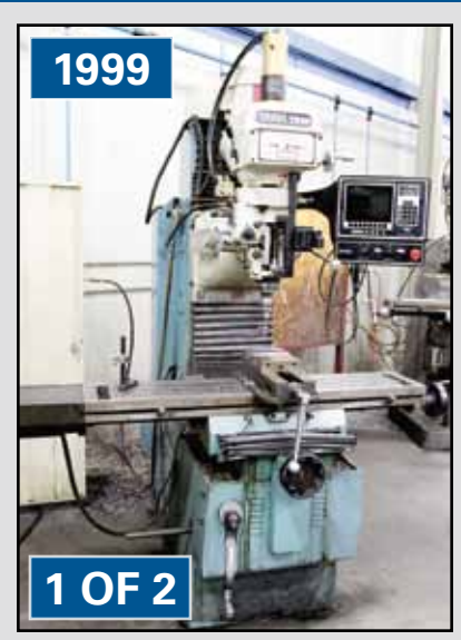
SWI TRAK-TRM Vertical Milling Machines