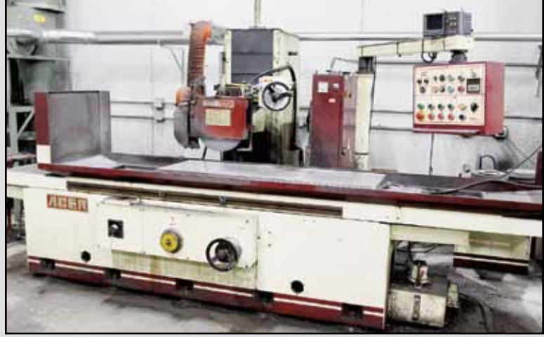
ACER AGS2060AHD Auto Horizontal Surface Grinder

GAMM Model 36X24-DC1, 2-Hole Sand Blast Unit, Sand Recycler, S/N 1113000