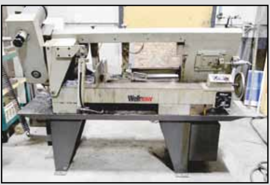
WELLSAW 1118 Horizontal Band Saw

1998 ACER AGS2060AHD Automatic Heavy Duty Horizontal Spindle Surface Grinder, S/N 98101225, Travels: 60" x 20" x 22", 20" x 60" Magnetic Chuck, 3-Axis Power Feed, 10 HP, Coolant Recovery