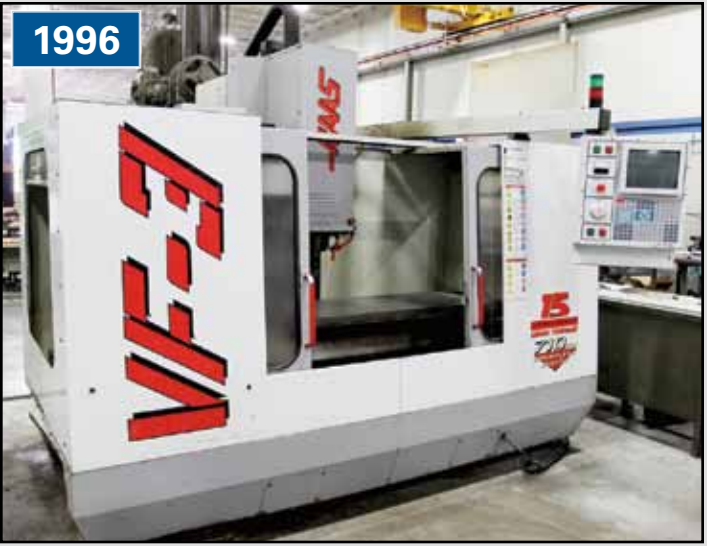
HAAS VF-3 CNC Vertical Machining Center