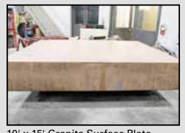
10' x 15' Granite Surface Plate