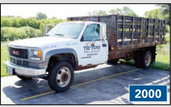
GMC 3500SL Stake Bed Truck