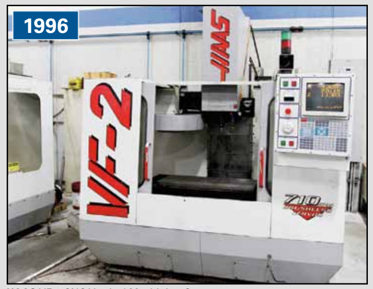
HAAS VF-2 CNC Vertical Machining Center