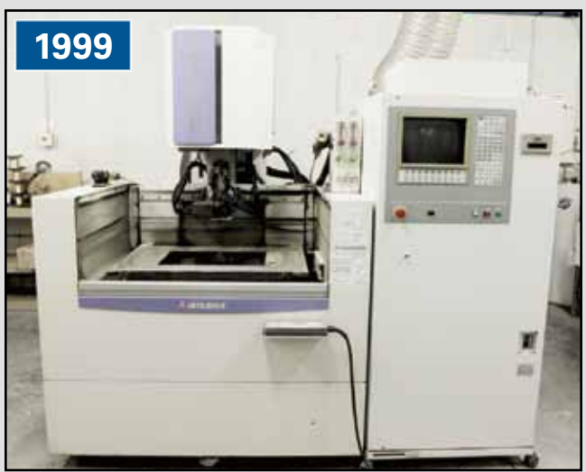
MITSUBISHI FX20K CNC Submersible Wire EDM