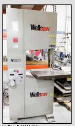
WELLSAW V20 Vertical Band Saw