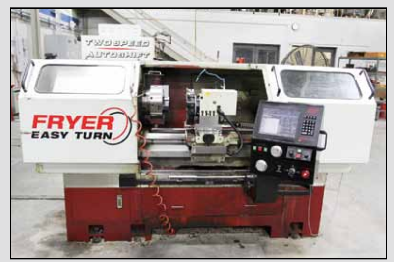
FRYER Easy Turn CNC Turning Center