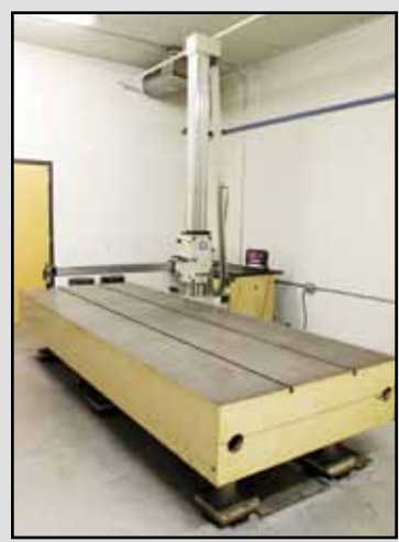
BROWN & SHARPE Validator Coordinate Measuring Machine