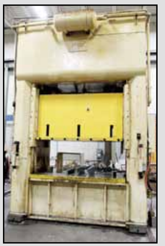
WARCO 250 Ton Straight Side Hydraulic Press