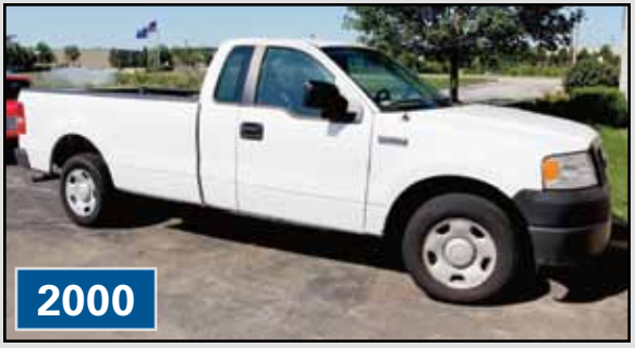
FORD F150 Pickup Truck

Also Available, Large Quantity of: Huge "As New" Angle Plates, CAT 40 & 50 Tool Holders, End Mills, Collets, Twist Drills, Reamers, (30) 6"-8" Kurt Vises, Hold Down Table Clamps, Sine Plates, Tool Trolleys, Inspection Equipment, Granite Surface Plates, Test and Measurement, Rigging Straps and Chains, Die Springs, Scrap Plates and Dies, Flamable Cabinets, Hand and Power Tools, Banding Carts, Pallet Jacks, Personnel Lockers, Office Furniture Equipment and Supplies