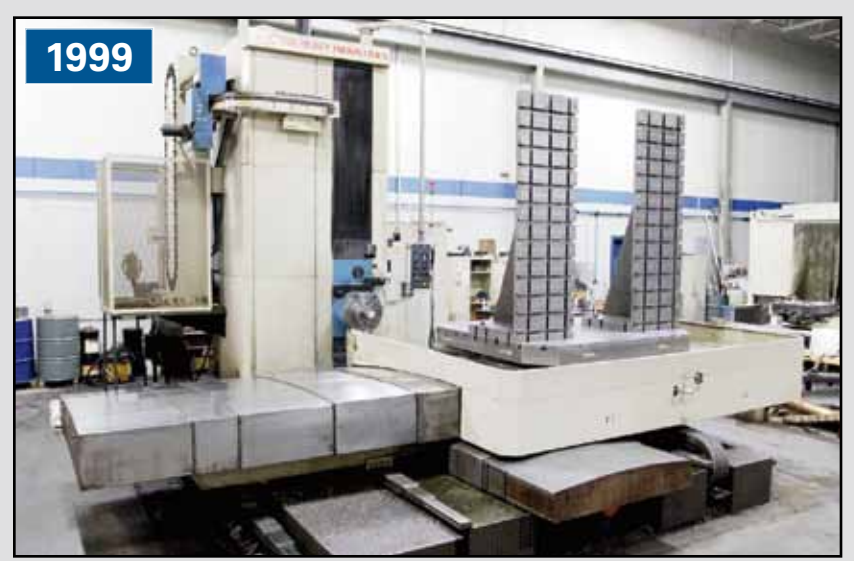
KIA KBN135 CNC 5-Axis Horizontal Boring & Milling Machine