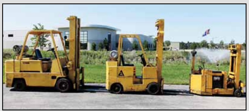
View of CLARK & ALLIS CHALMERS Forklifts