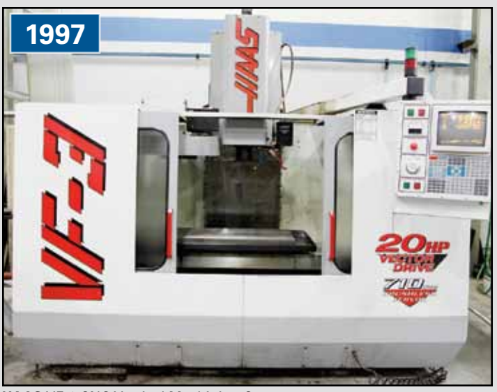
HAAS VF-3 CNC Vertical Machining Center