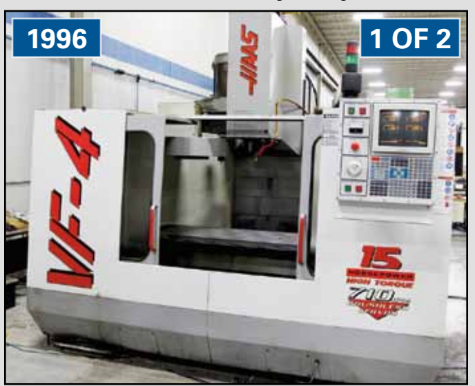
HAAS VF-4 CNC Vertical Machining Centers

1988 TOSHIBA BMC80 CNC Twin Pallet Horizontal Machining Center, S/N 413422, Travels: X-Axis 63"x Y-Axis 40" x Z-Axis 47", 32" x 32" Pallet Size, (60) Position ATC, 4,500 RPM Spindle Speed, CAT 50, 30 HP, Chip Conveyor, Tosnuc CNC Control