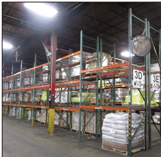
VIEW OF ADJ. PALLET RACKING