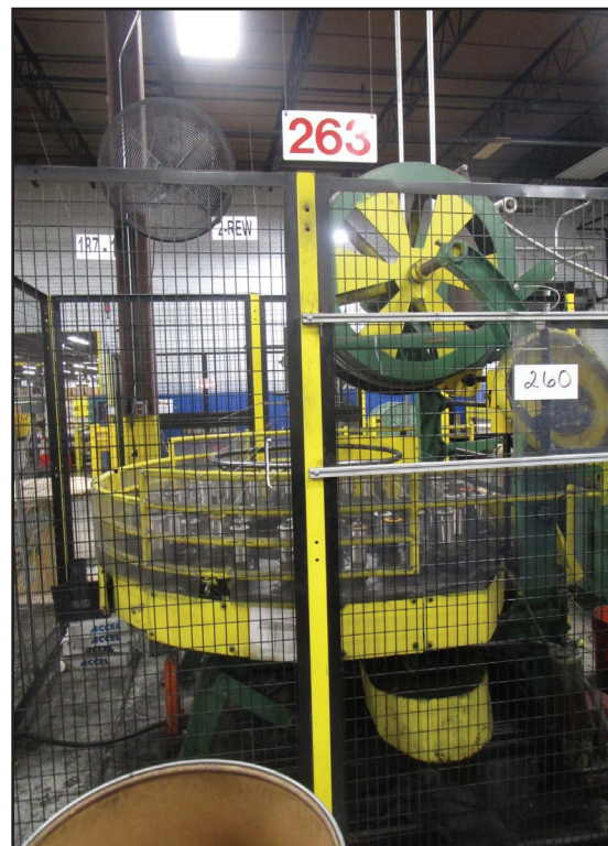
NEB CB-1 48-CARRIER CABLE BRAIDER