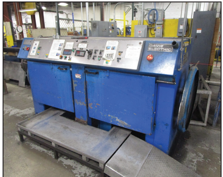
DAVIS ELECTRIC TAP-30 PARALLEL AXIS DUAL REEL TAKE-UP