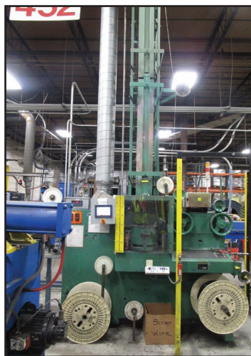
KENRAKE WST-200 SPIRAL STRIPER