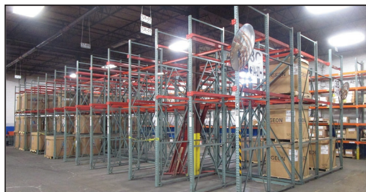
VIEW OF DRIVE THROUGH PALLET RACKING