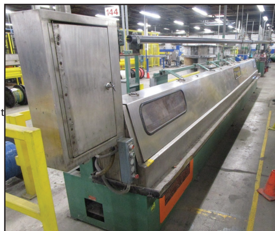
DAVIS ELECTRIC MULTIPASS CAPSTAN

CLIPPER TENSION STAND , s/n TB8-200-P5299-51980 (Missing a Sheave)