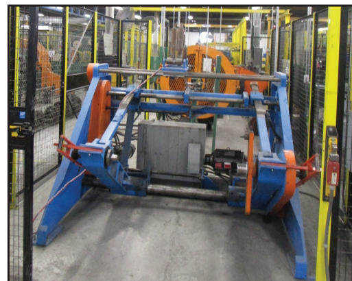
DAVIS ELECTRIC 72" SHAFTLESS TAKE-UP