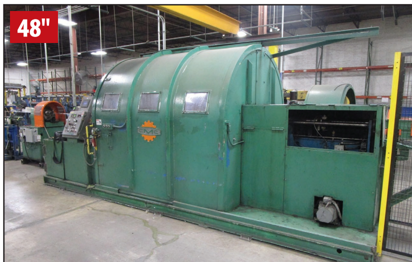
COOK BH48 S.T. CABLER W/BINDER HEAD

NE/CFL 30" D.T. CABLER LINE , w/ 4-Wire 30" Drag Payoff, Longitudinal Tape Stand, 10HP DC Motor ( LLOYD & BOUVIER Rebuild )