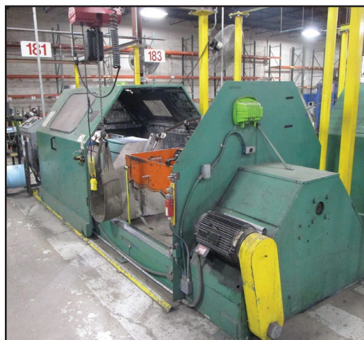
MORISON MACHINERY 30" D.T. CABLER LINE

PRE- AUCTION OFFERS INVITED ON MAJOR ASSETS