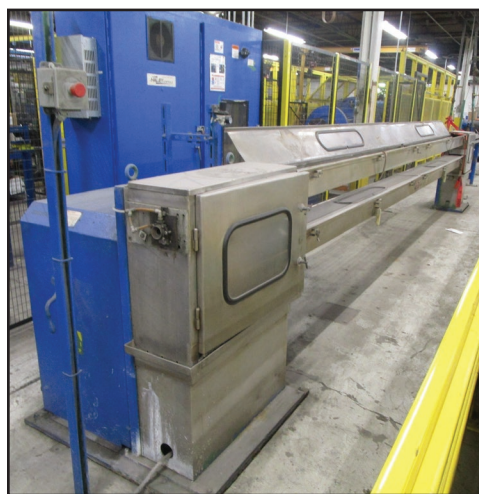
VITECK LTM-12-220 12" MULTIPASS CAPSTAN