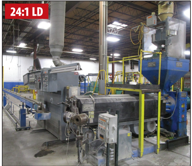
MERRITT DAVIS 4.5" EXTRUDER

Monday, September 11, from 8:30 AM to 4:00 PM CT, by appointment only