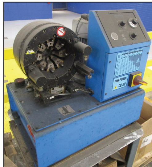
FINN POWER CC221S CRIMPER