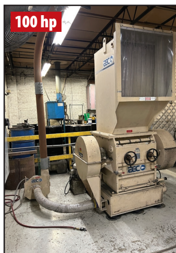
AEC ESH-500-000 GRANULATOR