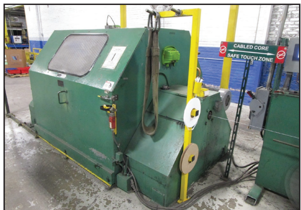
CARTER LLOYD INC 30" D.T. CABLER LINE