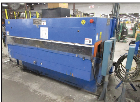
MERRITT DAVIS CAT-TRAK 80 CATERPULLER CAPSTAN