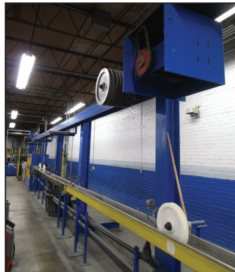
CUSTOM 45' APPROX. HORIZ. TAKE-UP ACCUMULATOR