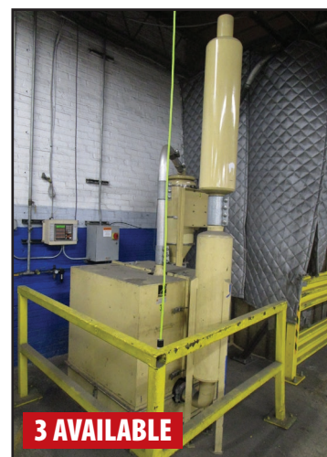
PREMIER 5158-33R 15HP BULK CONVEYING BLOWERS