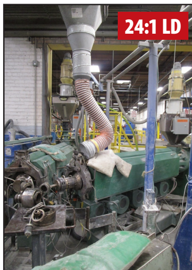
(2) MERRITT DAVIS 3.5" EXTRUDERS