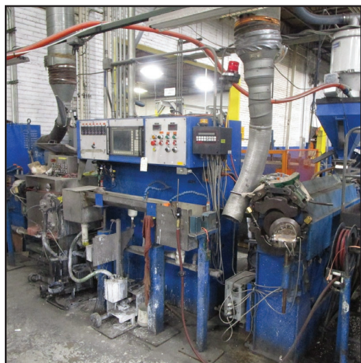
DAVIS STANDARD 35T 3.5" 20:1 L/D EXTRUDER

DAVIS STANDARD 35T 3.5" 20:1 L/D EXTRUDER , s/n E1400, S.O. 21938C, w/ Screw, 75HP AC Motor