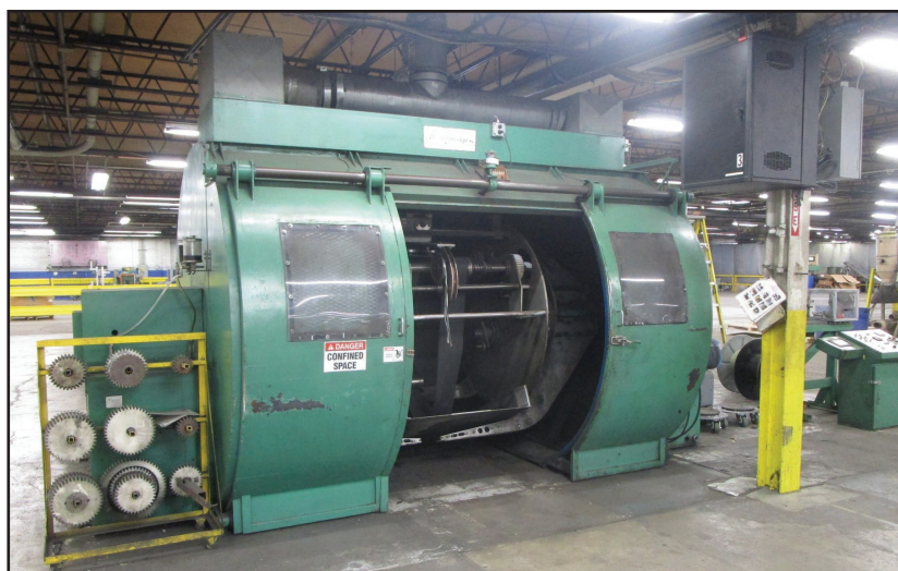
GODDERIDGE 1250MM D.T. CABLER