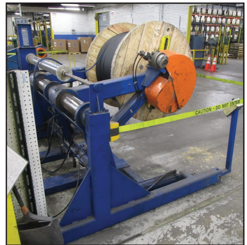
TULSA 84IN SHAFTLESS PAYOFF