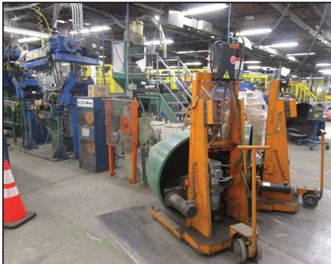
ENTWISTLE DUAL FLYER CONE PAYOFF W/REEL TRUCKS