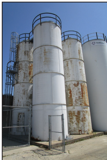
(4) PEABODY 9' DIAMETER BOLTED SILOS