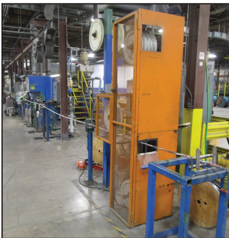
DAVIS ELECTRIC 8IN DANCER