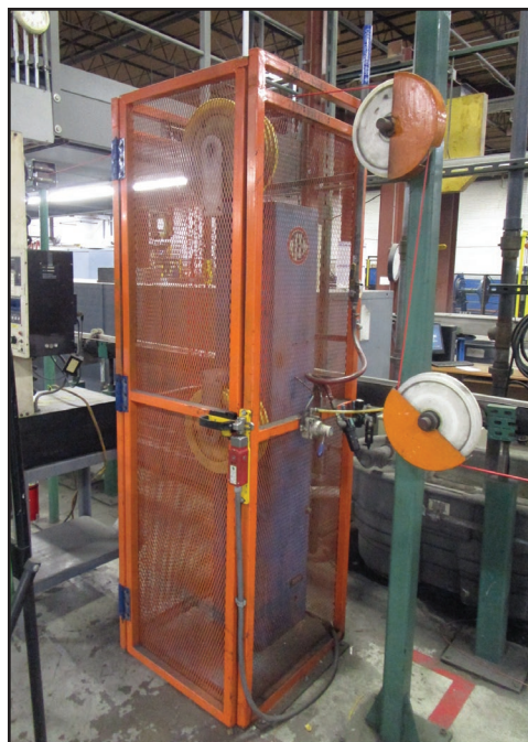
TEC TAKE-UP DANCER