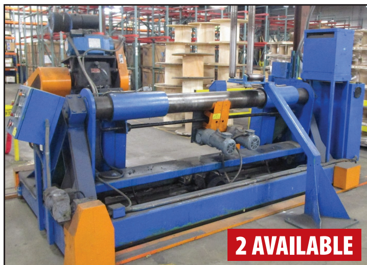
MERRITT DAVIS TURA 84 84" TRAVERSING TAKE-UP

DAVIS STANDARD 84" SHAFTLESS TAKE-UP , w/ 10HP AC Motor