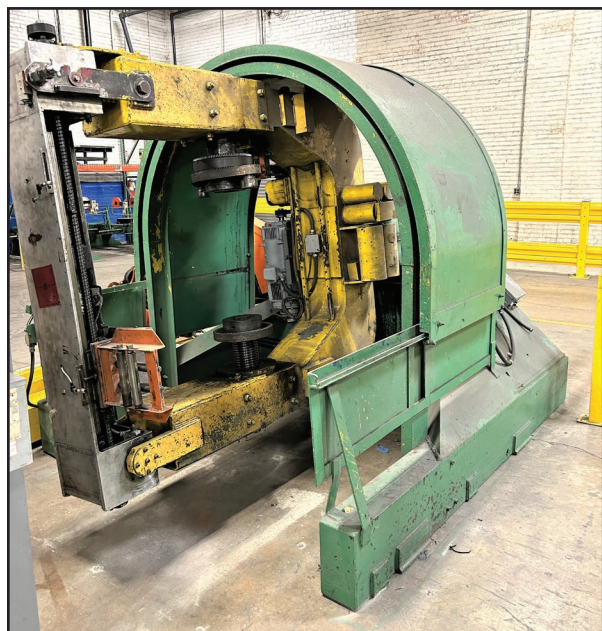
48" ROTATING DRUM TWISTER