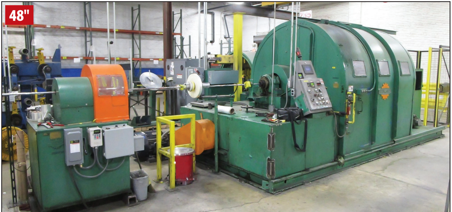
COOK BH48 S.T. CABLER W/BINDER HEAD

PRE-AUCTION OFFERS INVITED ON MAJOR ASSETS