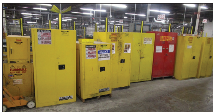
VIEW OF FLAMMABLE LIQUID STORAGE CABINETS