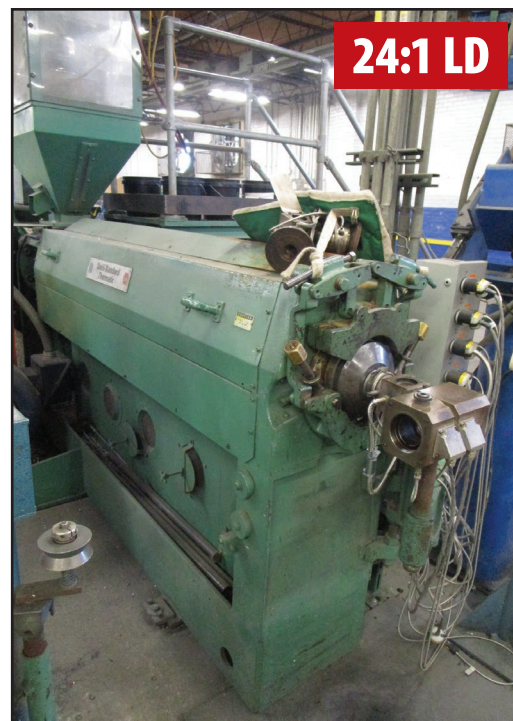
DAVIS STANDARD 35IN35 3.5" EXTRUDER