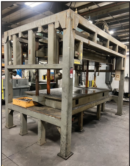
4-POST DOWN ACTING HYDRAULIC DIE SPOTTING PRESS

For auction inquiries, please contact Jennifer Reiner at (847) 545-6374 or jennifer@perfectionindustrial.com