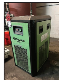
SULLAIR RN-125 REFRIGERATED AIR DRYER