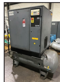
ATLAS COPCO GA18 AIR COMPRESSOR