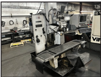
MILLTRONICS PARTNER MB20 CNC MILL