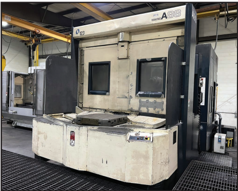
MAKINO A88 4-AXIS HORIZONTAL MACHINING CENTER