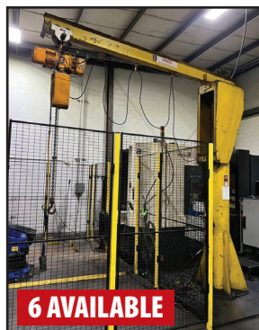
FREE STANDING JIB CRANES