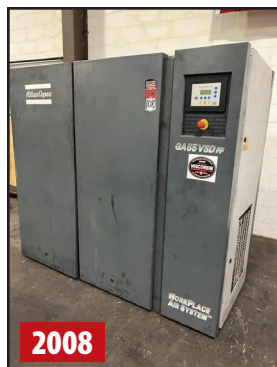
ATLAS COPCO GA55VSD AIR COMPRESSOR