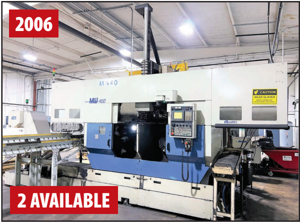
MURATEC MW400 DUAL SPINDLE TURNING CENTER