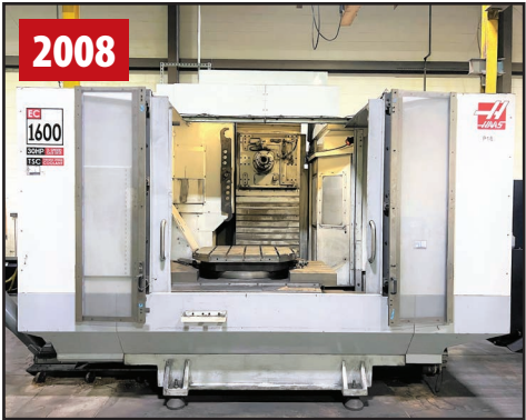
HAAS EC-1600-4X 4-AXIS HORIZONTAL MACHINING CENTER

2004 MAKINO A51 4-AXIS HORIZONTAL MACHINING CENTER , s/n 335, Professional 3 Control, 22"X, 22"Y, 23.6"Z, Full 4th Axis, (2) 15.7" x 15.7" Pallets, CAT 40 Spindle Taper, 40-ATC