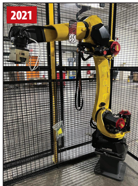
FANUC M-20ID/25 6-AXIS ROBOT