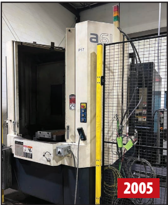
MAKINO A61 4-AXIS HORIZONTAL MACHINING CENTER