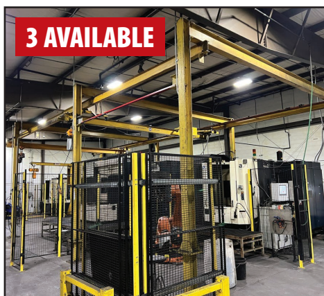
FREE STANDING BRIDGE CRANE SYSTEMS