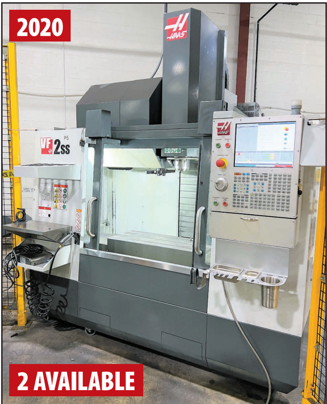
HAAS VF-2SS VERTICAL MACHINING CENTER

FADAL VMC 4020HT VERTICAL MACHINING CENTER , s/n 9111711, CNC 88 Control, 40"X, 20"Y, 28"Z, 48" x 20" Table, CAT 40 Spindle Taper, 20 ATC