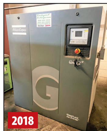
ATLAS COPCO GA22+ AIR COMPRESSOR