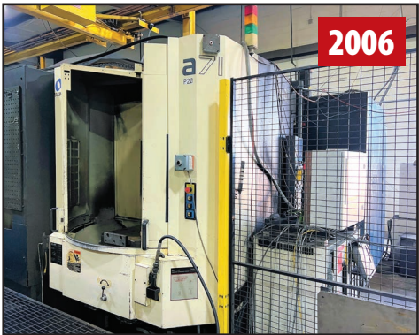
MAKINO A71 4-AXIS HORIZONTAL MACHINING CENTER