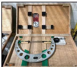
DIGITAL O.D. MICS