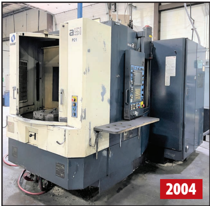
MAKINO A51 4-AXIS HORIZONTAL MACHINING CENTER