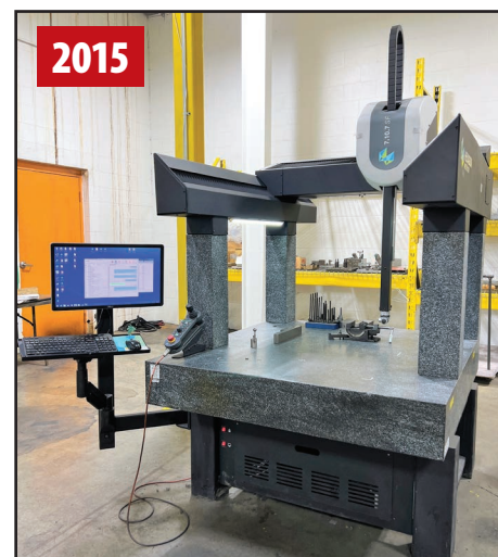
HEXAGON METROLOGY SF7.10.7 CMM