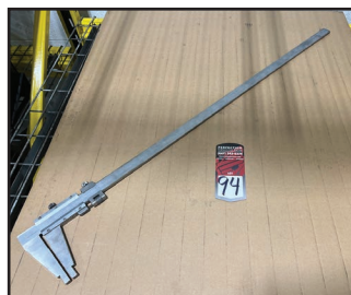
MITUTOYO 40" VERNIER CALIPER

ALSO: Vernier Calipers, Outside Micrometers, Dial Bore Gages, Pin Gage Sets