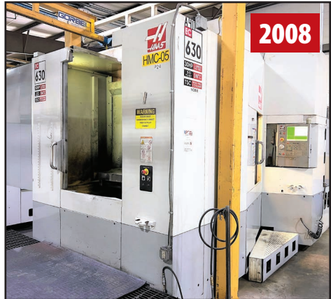
HAAS EC-630 4-AXIS DUAL PALLET HORIZONTAL MACHINING CENTER