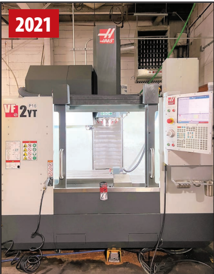
HAAS VF-2YT VERTICAL MACHINING CENTER