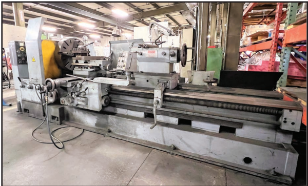
POREBA TRP-93X2M LATHE

2006 COMMAND DIGISET 6 TOOL PRESETTER , s/n 61010-1