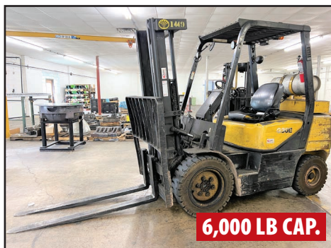
DAEWOO G30E-3 LP FORKLIFT

ALSO: Linear Tool Positioning Arms, MILLER Syncrowave 250 AC/DC Welding Source , (2) DONALDSON TORIT DMC-B Mist Collectors , Roller Conveyor, (6) Pallets of Allen Head Drive Button Head Socket Cap Screws, (42) Pallets of 48x40 Grade B 4W Boxes, Electric Hoists, Modular Tool Cabinets, Lift Tables, Steel Work Benches & Tables, Self Dumping Hoppers