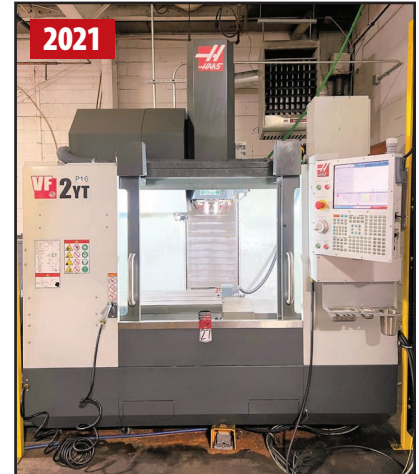
HAAS VF-2YT VERTICAL MACHINING CENTER