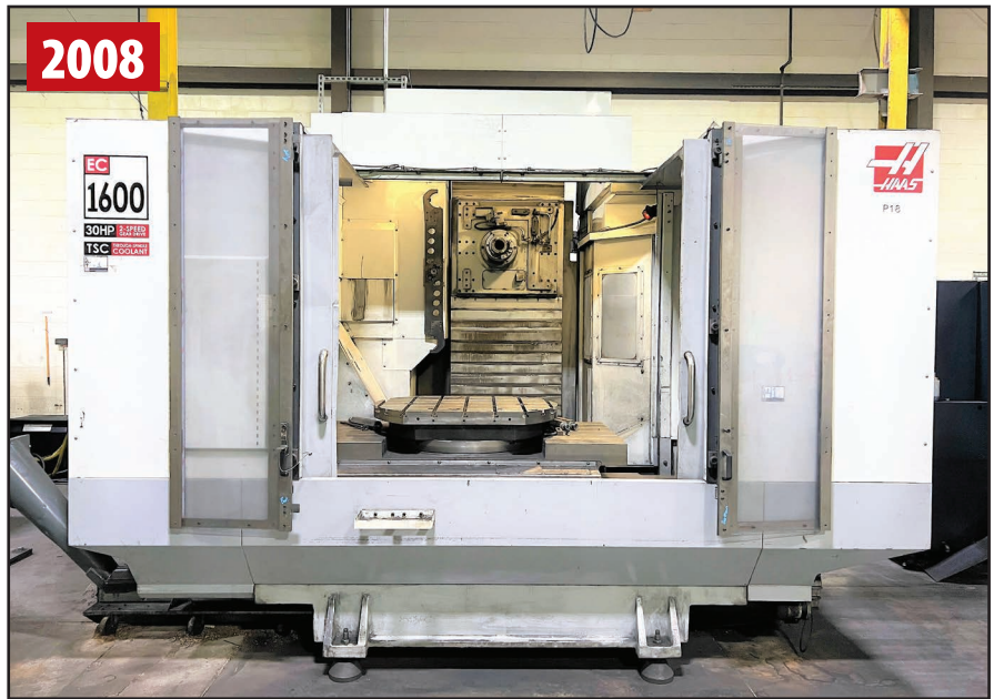
HAAS EC-1600-4X 4-AXIS HORIZONTAL MACHINING CENTER