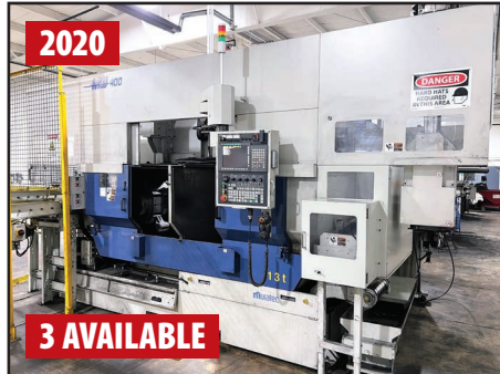
MURATEC MW400 DUAL SPINDLE TURNING CENTER