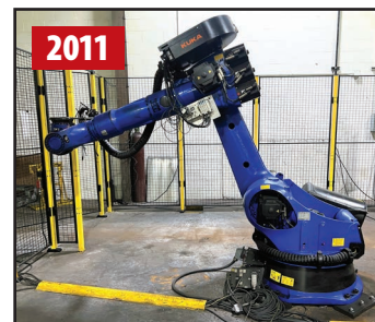
KUKA KR210L150-2 2000 6-AXIS ROBOT

2010 KUKA KR210-2 US 6-AXIS ROBOT , s/n 917184, 210 Kg Payload, 2700mm Reach