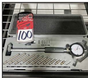
DIAL BORE GAGES