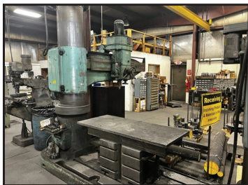
HCP WR50/2 RADIAL ARM DRILL