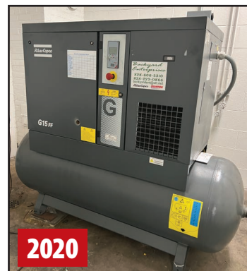
ATLAS COPCO G15FF AIR COMPRESS