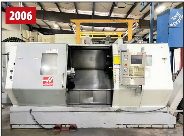
HAAS SL-40T CNC TURNING CENTER