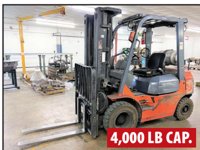
TOYOTA 7FGU20 LP FORKLIFT