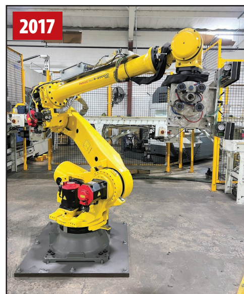
FANUC R-2000IC 125L 6-AXIS ROBOT