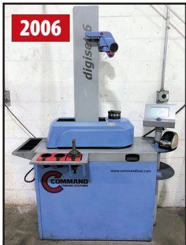
COMMAND DIGISET 6 TOOL PRESETTER