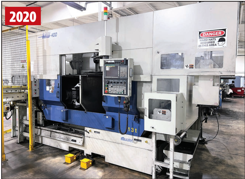
MURATEC MW400 DUAL SPINDLE TURNING CENTER

2006 HAAS SL-40T CNC TURNING CENTER , s/n 72935, 25.5" Turning Diameter, 40" Swing, 51" Machining Length, 11.3"X, 42"Z, Tailstock, 15" 3-Jaw Chuck, 12-Position Turret, 4" Bar Capacity