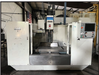
FADAL VMC 4020HT VERTICAL MACHINING CENTER