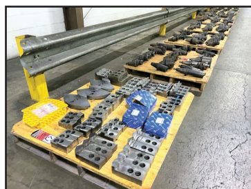
LARGE ASSORTMENT OF TOOLING

(250+) CAT 50 & CAT 40 Tool Holders, Chuck Jaws, Boring Bars, Turning Tools, Carbide Inserts, 30" x 47.5" x 19.5" T-Slotted Table w/ POWER X Hydraulic Press, Rotary Tables, Pallets, Dividing Head, Tombstones, Assorted Fixtures, and more