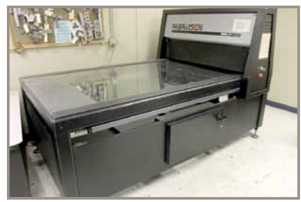
4' X 8' FABRIVISION METALSOFT NON CONTACT PARTS INSPECTION MACHINE