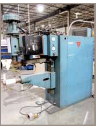
150 KVA H&H DIAPHRAM SPOT WELDER