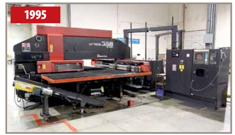
33 TON AMADA VIPROS 358 KING CNC TURRET PUNCH PRESS