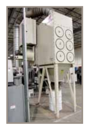
(6) CARTRIDGE DUST COLLECTOR