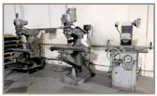
BRIDGEPORT SERIES 1 MILL; MIGHTY COMET MILL; K.O. LEE S714 SURFACE GRINDER

CLAUSING DUAL HEAD DRILL PRESS, 7" Throat, 60" x 20" Table, 1,200-1,800 RPM, 790-4,000 Spindle Speed