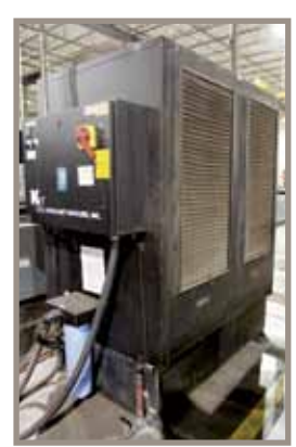
KOOLANT KOOLERS HCV20 CHILLER W/ABOVE LASER