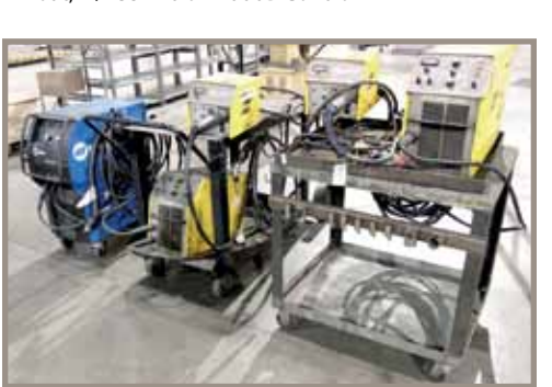
(2) ESAB SVI 300i CVCC WELDING POWER SOURCE; MILLER MILLERMATIC 350P MIG WELDER

30 KVA PEER AR-430 SPOT WELDER, S/N 770221, 22" Throat, w/Technitron 2000B Control