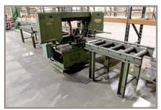
METORA MB3000 HORIZONTAL BANDSAW