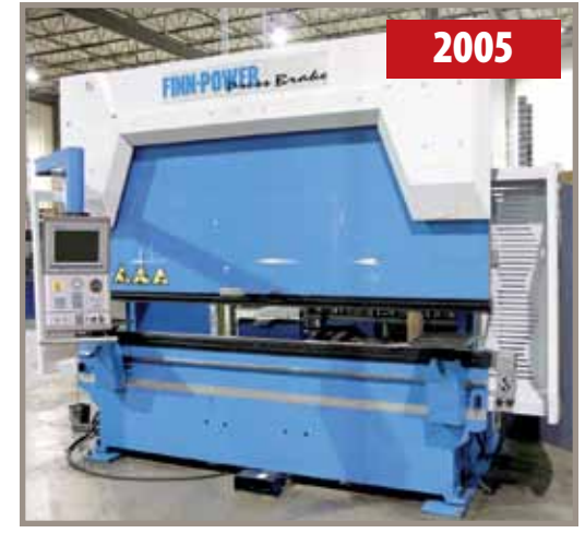
138 TON FINN POWER B125-3060 CNC PRESS BRAKE

2500W CINCINNATI CL-707 CNC LASER, S/N 52361, (2001), (2) 5' x 10' Shuttle Tables, 121" X-Travel, 61" Y-Axis Travel, 8" Z-Axis Travel, 120" x 60" x 1" Maximum Work piece Dimensions, 2,500 LB Load Capacity, Rapid Pierce Non Contact Head, 10,000 IPM Positioning Speed, Equipped w/ Rofin DC025 Diffusion Cooled Resonator, MAC (6) Cartridge Dust Collector, Koolant Koolers HCV Chiller, S/N 15800, 13.5 HP, 460/3/60 Electrical, CNC Control, Pentium Based PC-Windows NT Operating System. Resonator Refurbished, October 2010