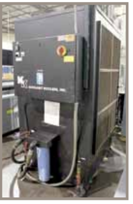
KOOLANT KOOLERS HCV20 CHILLER W/ABOVE LASER

1220 Central Avenue Hanover Park Illinios 60133