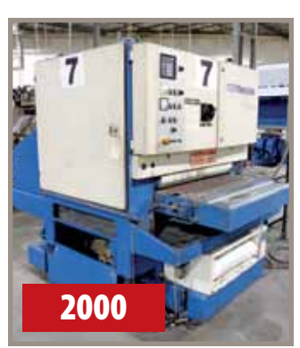
STEELMASTER PRIMA 2KB9W "WET TYPE" DEBURRING & FINISHING MACHINE