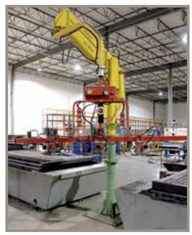
DALMAC PRC SHEET LOADER