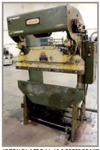
17 TON DI-ACRO 14-48-2 PRESS BRAKE