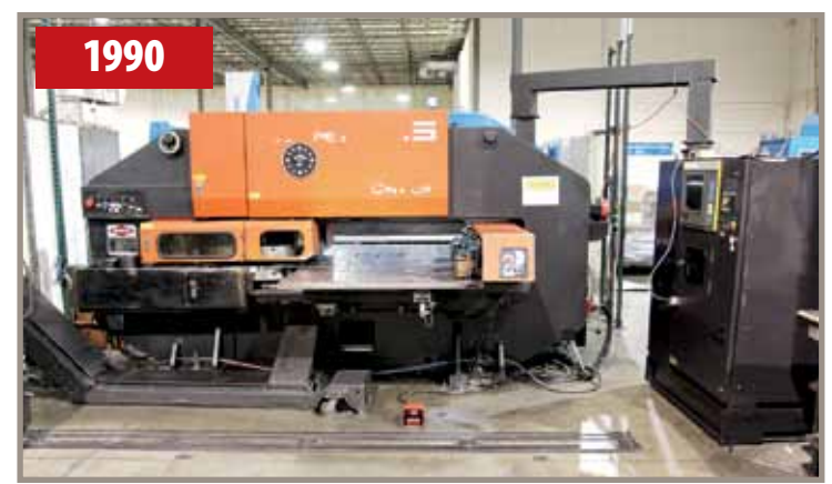
33 TON AMADA PEGA 345 CNC TURRET PUNCH PRESS