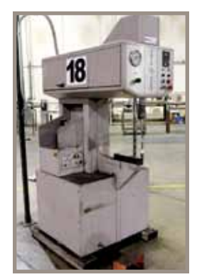
7.5 TON AUTO SERT AS-7.5 INSERTION PRESS

S/N 3060122, (1980) , 120" Maximum Shearing Length, 1/4" Shearing Capacity, 12" Gap, 60 SPM, Front Operated Programmable Power Back Gauge, Squaring Arm