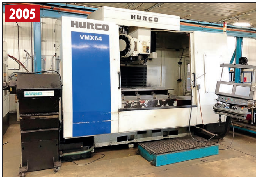
HURCO VMX64 VERTICAL MACHINING CENTER