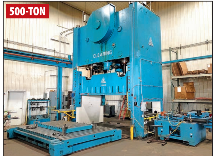
CLEARING F-4500-148 STRAIGHT SIDE 4-POINT PRESS

Sale Closing From: Wednesday, November 6 at 11:00 AM ET