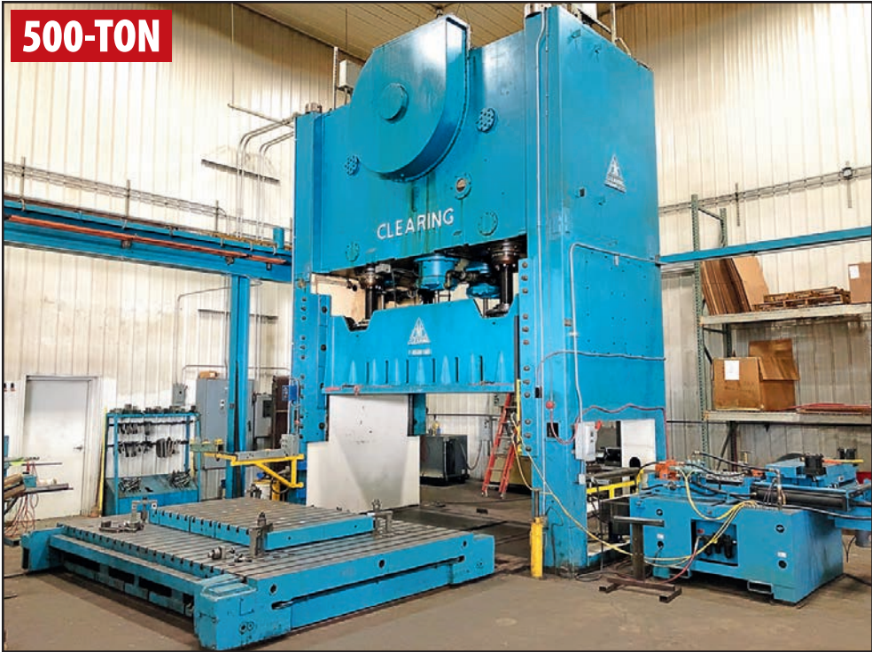
CLEARING F-4500-148 STRAIGHT SIDE 4-POINT PRESS

500-TON CLEARING F-4500-148 STRAIGHT SIDE 4-POINT PRESS , s/n 47-14115-P, 24" Stroke, 45-5/8" Max. Shut Height, 20" Ram Adjustment, 8 SPM, 96" x 144" Power Roll Out Bolster, 63" Window, Hydraulic Nuts on Tie Rods, Cisco Tonnage Monitor