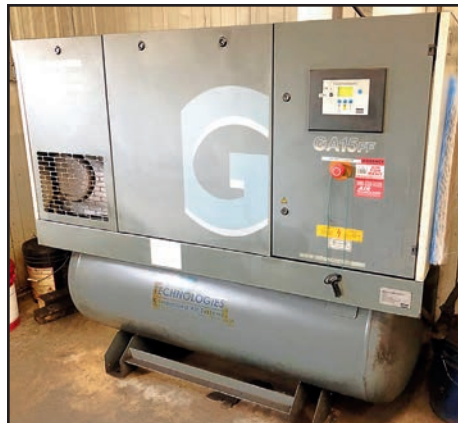
ATLAS-COPCO GA15FF ROTARY SCREW AIR COMPRESSOR

ALSO AVAILABLE: WELDERS, WELDING SUPPLIES, POWER AND HAND TOOLS, PERISHABLE TOOLING, MILLS, DRILLS, TAPS, REAMERS, JACOBS CHUCKS, PALLET RACKING, OFFICE FURNITURE, SHOP FURNITURE, CLAMPING, WORK HOLDING FIXTURES, MAGNETS, SINE PLATES, RAW MATERIALS, INSPECTION EQUIPMENT, STEEL HORSES, BOLSTER PLATES, SHOP SUPPLIES, SPARE PARTS, SCRAP STEEL