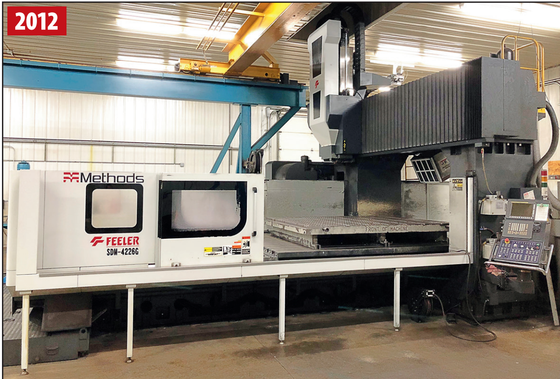
METHODS/FEELER SDM-47266 CNC BRIDGE MILL