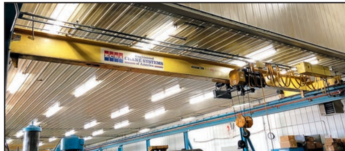
ECSA 10-TON BRIDGE CRANE W/KONE FEM IA HOIST

To discuss your requirements for an auction, please call Perfection Industrial +1-847-427-3333 View our current auction schedule at www.perfectionindustrial.com