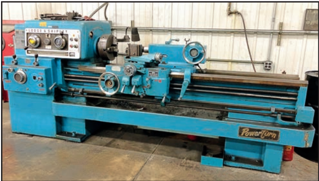
LODGE & SHIPLEY POWER TURN 20" X 60" ENGINE LATHE

GALLMEYER LIVINGSTON GRAND RAPIDS 676 16" X 48" HYDRAULIC SURFACE GRINDER , s/n 676135, 16" x 48" Electromagnetic Chuck, 1-1/2" x 20" Wheel