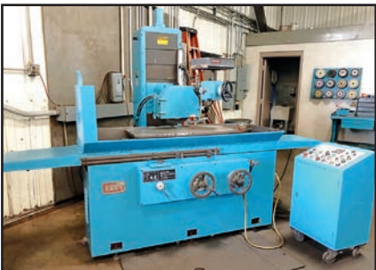
KENT KG941DAHD 16" X 40" AUTOMATIC SURFACE GRINDER