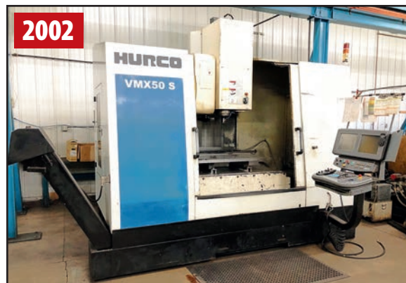
HURCO VMX50S VERTICAL MACHINING CENTER