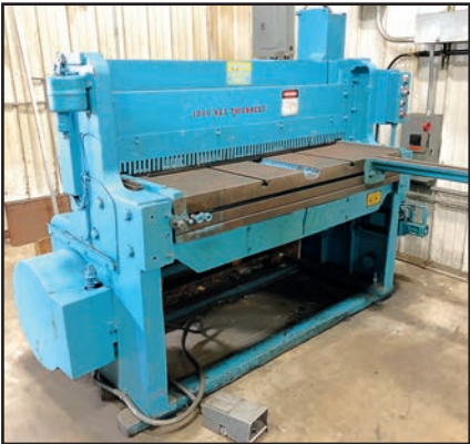
WYSONG 52" X 10GA MECHANICAL SHEAR