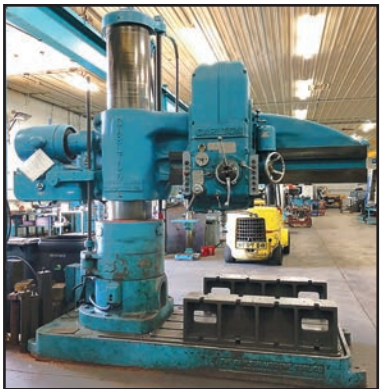
CARLTON RADIAL ARM DRILL