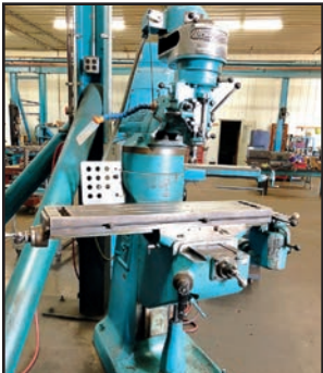
BRIDGEPORT VERTICAL MILL