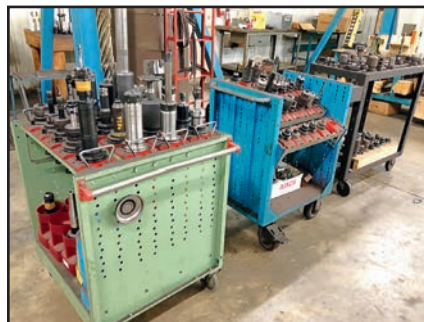
ASSORTED TOOLING AND TOOL CARTS