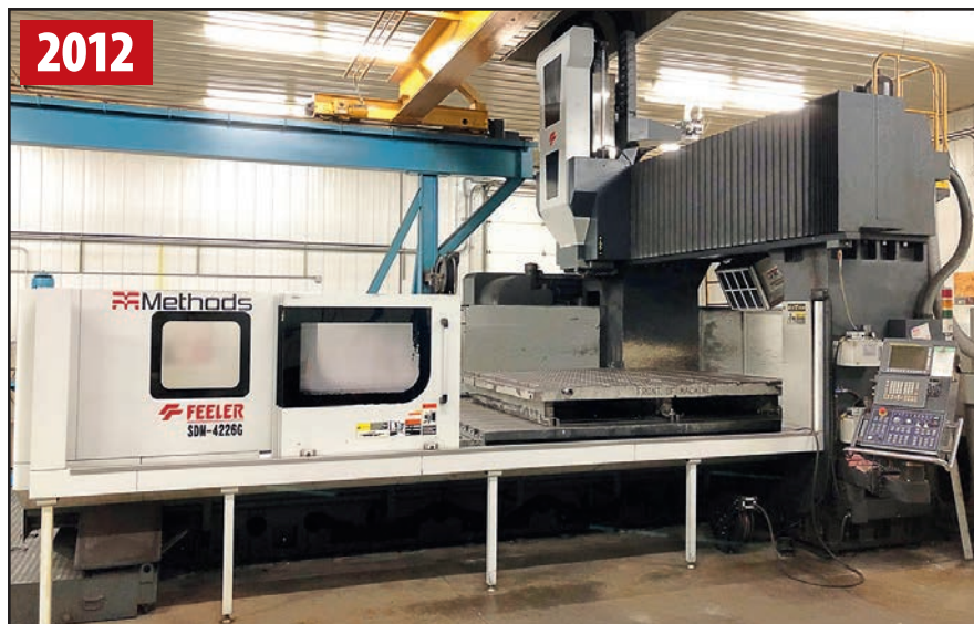
METHODS/FEELER SDM-47266 CNC BRIDGE MILL