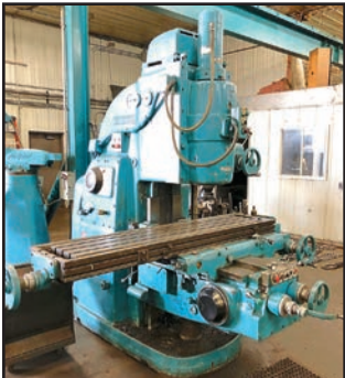
CINCINNATI MILACRON 315-16 VERTICAL MILL