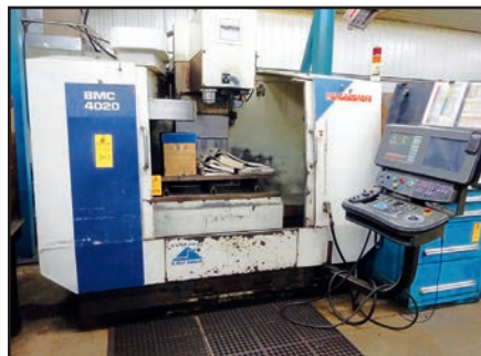
HURCO BMC4020 VERTICAL MACHINING CENTER