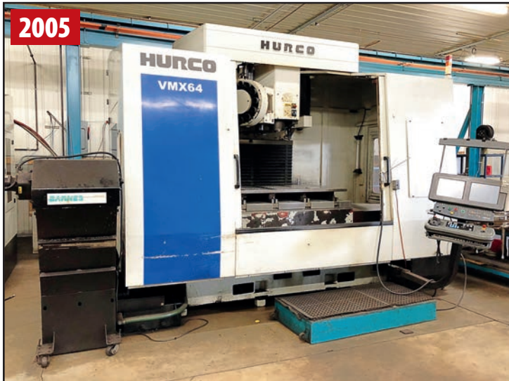
HURCO VMX64 VERTICAL MACHINING CENTER

Large Capacity CNC Bridge Mill, CNC Vertical Machining Centers, Try-Out Press, Tool Room, Free Standing Crane Systems, Facility Support, Forklifts, Vehicles & More